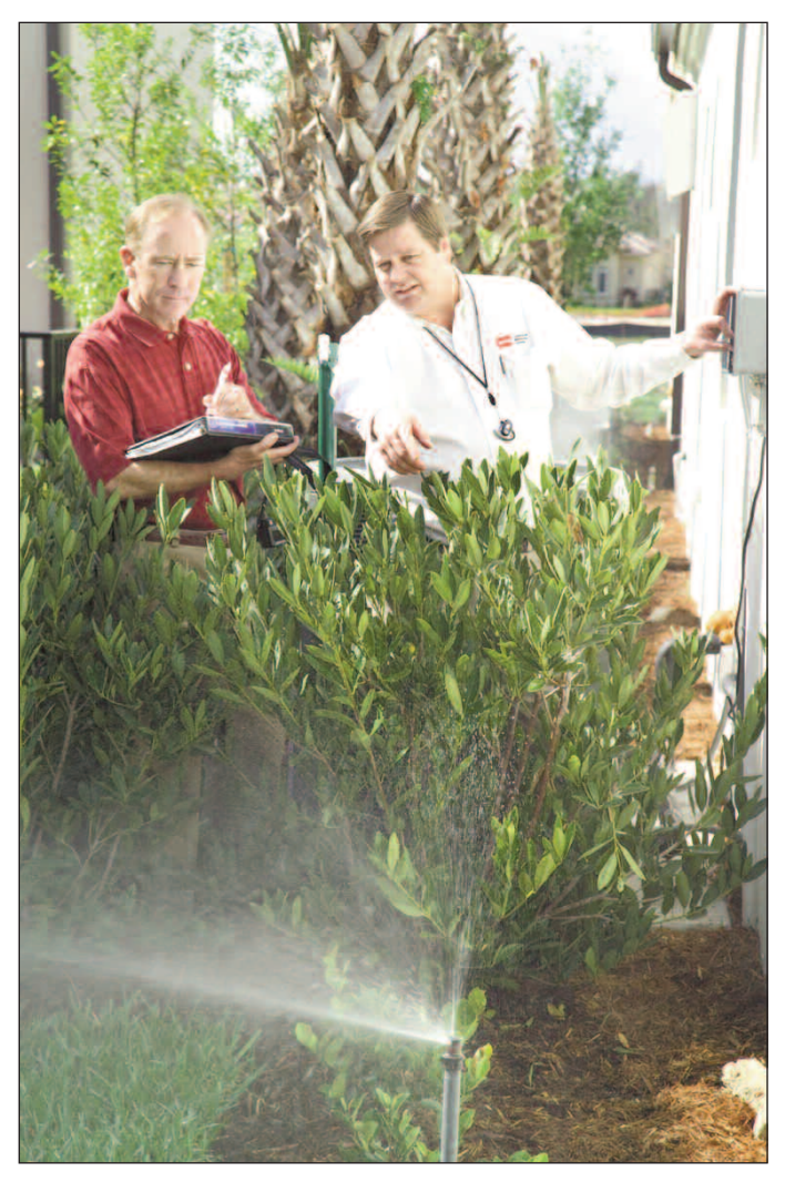
Simple steps, such as checking the alignment of sprinkler heads, can improve the efficiency of automatic irrigation systems and ensure the right amount of water goes where it is needed.