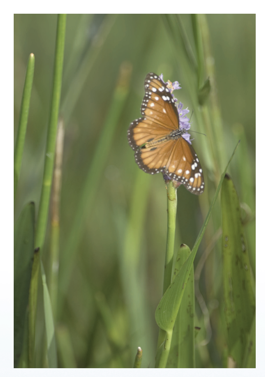
Selecting the right native plants can not only save water but also attract wildlife to South Florida landscapes.

Overwatering can promote undesirable weeds, create the need for additional fertilizer and other expensive lawn chemicals and cause both runoff and leeching of chemicals below the root zone. Runoff containing lawn chemicals is a major contributor to surface water pollution. Fertilizers or other lawn products that have leeched below the root zone become unavailable to turf and contribute to groundwater contamination.