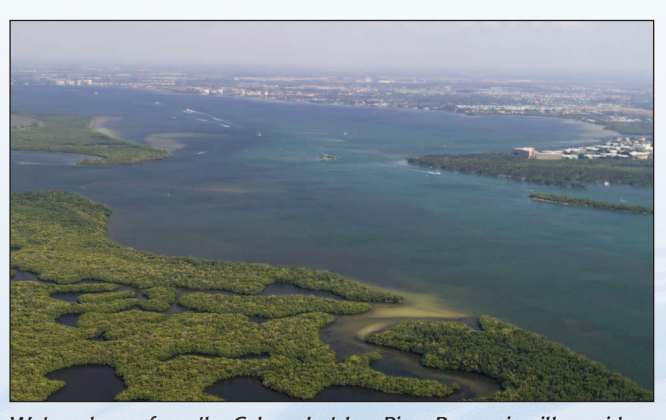
Water releases from the Caloosahatchee River Reservoir will provide essential flows during the dry season, improving the ecological health of the Caloosahatchee Estuary.

Located on 10,700 acres of former farmland in Hendry County, Fla., west of Labelle, the Caloosahatchee River West Basin Storage (C-43) Reservoir will hold approximately 170,000 acre-feet of water, with the maximum depth ranging from 15 feet to 25 feet across the expanse. When complete, the restoration project will provide storage needed for the estuary by capturing and storing local basin runoff as well as Lake