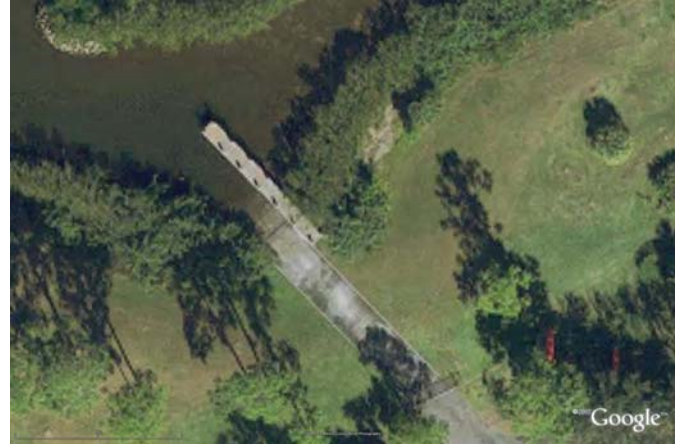
Subdivision Boat Ramp Riverwalk