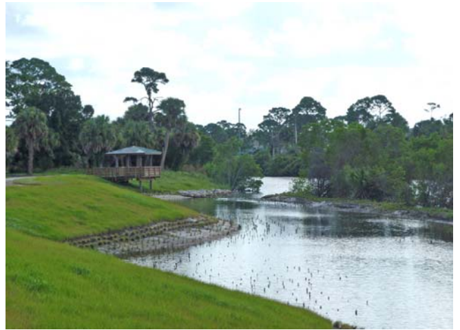
ADA crossing over creek and Observation Platform