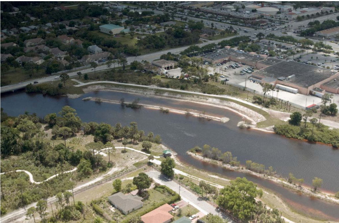
Hiking Trail with Observation Platform