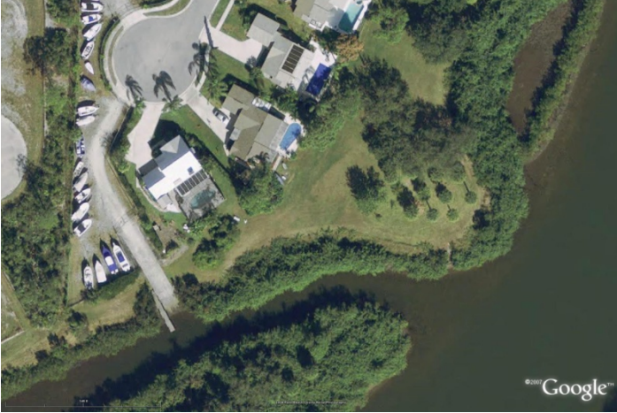
Subdivision Boat Ramp Jupiter Landings