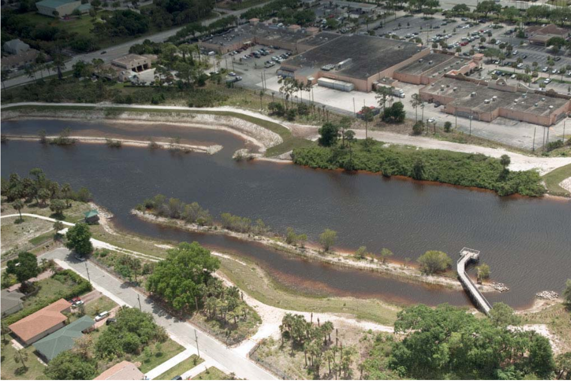
Fishing Platform and Observation Platform