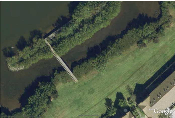
Subdivision Viewing Platform Riverwalk