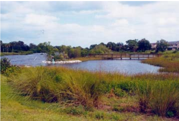
Subdivision Viewing Platform Riverwalk