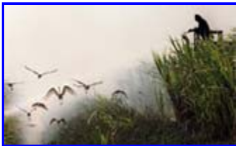
U.S. Sugar deal

Browse all the news , see photos and video, get facts about the company and the agreement plus more.