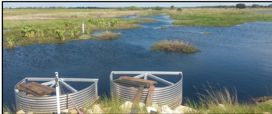
Nicodemus Slough in Glades County is available for water storage. (Click on the picture for a larger version.)

Fort Myers, FL – South Florida Water Management District (SFWMD) engineers have made thousands of acres of land available for water storage this wet season to benefit the Caloosahatchee River and Estuary.