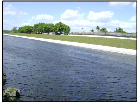
Work progresses on the first phase of the project. (Click on the picture for a larger version.)

This month's investment of $7.9 million allows Arbor Tree & Land, Inc., the lowest responsive bidder, to begin work on Phase 2, a section just west of Military Trail near Boca Raton to US 441/SR7. The work includes dredging of approximately one mile of the canal.