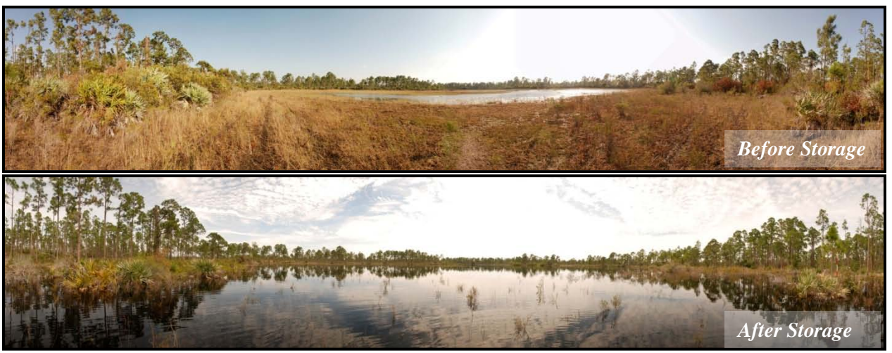
(Top) In early 2009, the Nine Gems property sat mostly dry. (Bottom) The District, in cooperation with Martin County, has since restored the land's hydrology to add 2,000 acre-feet of regional water storage.

West Palm Beach, FL — The South Florida Water Management District (SFWMD) Governing Board this week approved eight cost-effective projects to increase water storage on ranches north of Lake Okeechobee while improving water quality for the Everglades as well as for the lake and coastal estuaries.