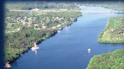
Caloosahatchee River Watershed Protection Plan