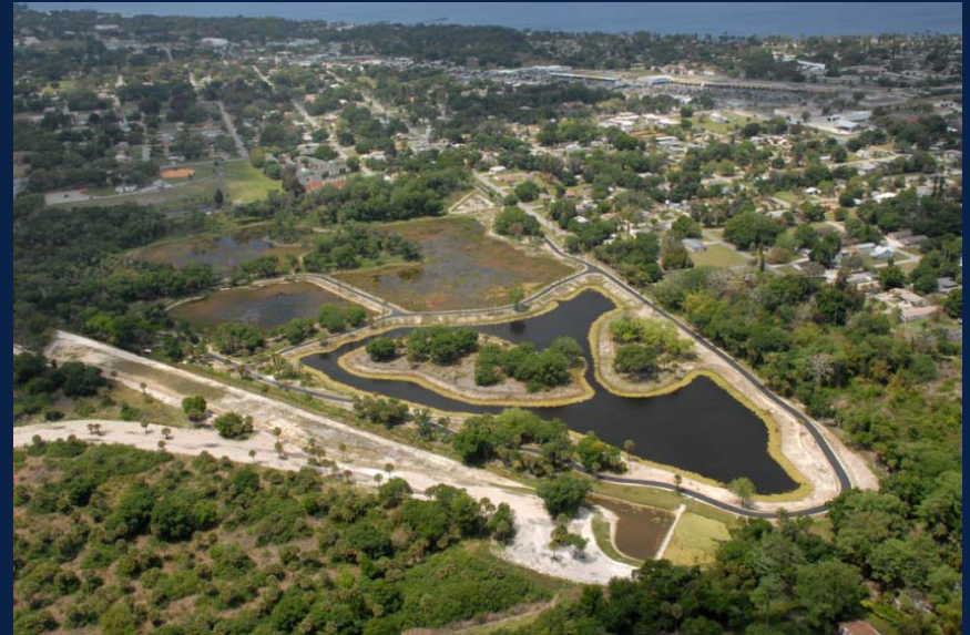
Billy's Creek stormwater project