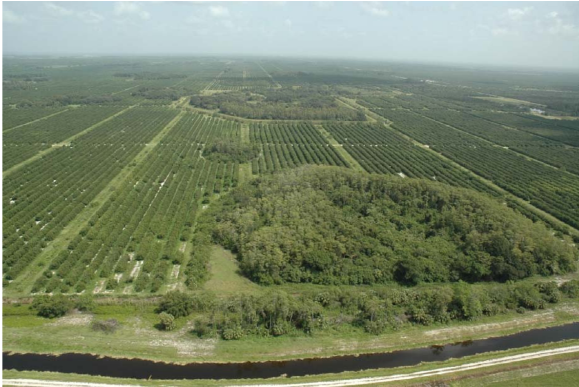
LBMC Cash Flow Analysis