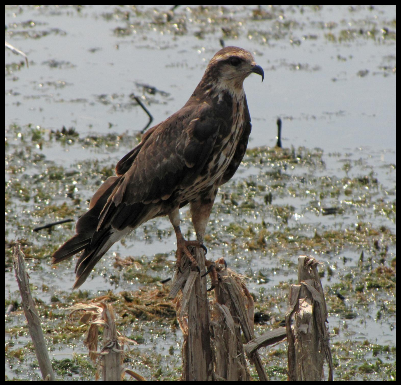
Juvenile Snail Kite, Fisheating Bay, Lake Okeechobee, May 2011