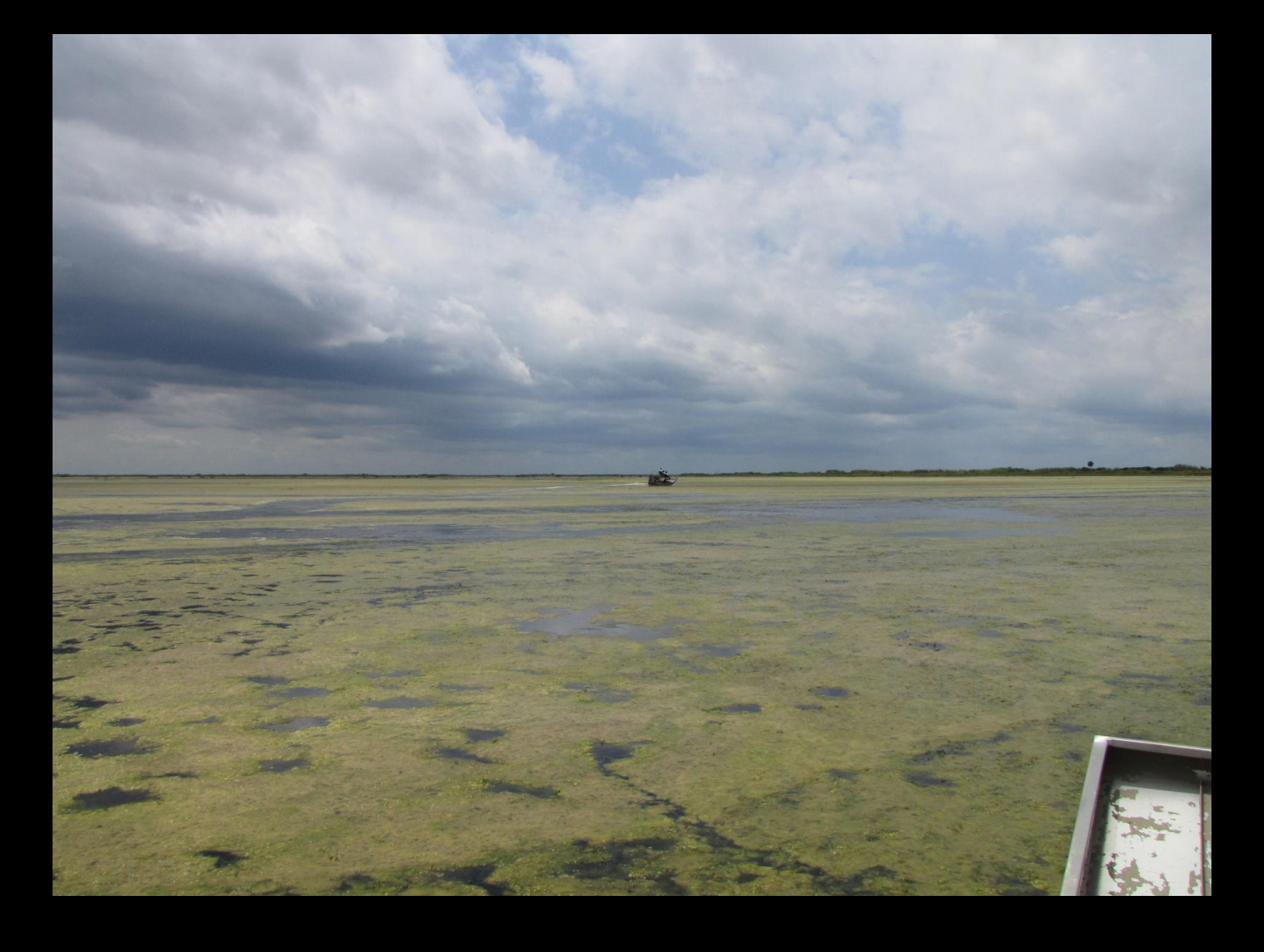
Airboating across Fisheating Bay, Lake Okeechobee, May 2011