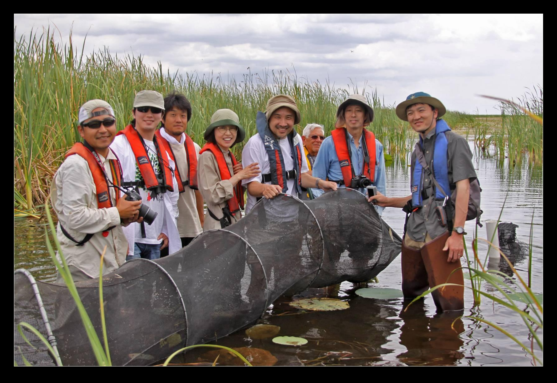
Visiting scientists from Japan, Lake Okeechobee, May 2011