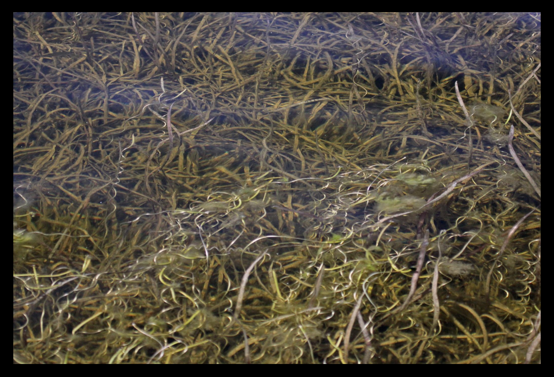
Dense Eelgrass ( Vallisneria americana ) in southwestern marsh, Lake Okeechobee, May 2011