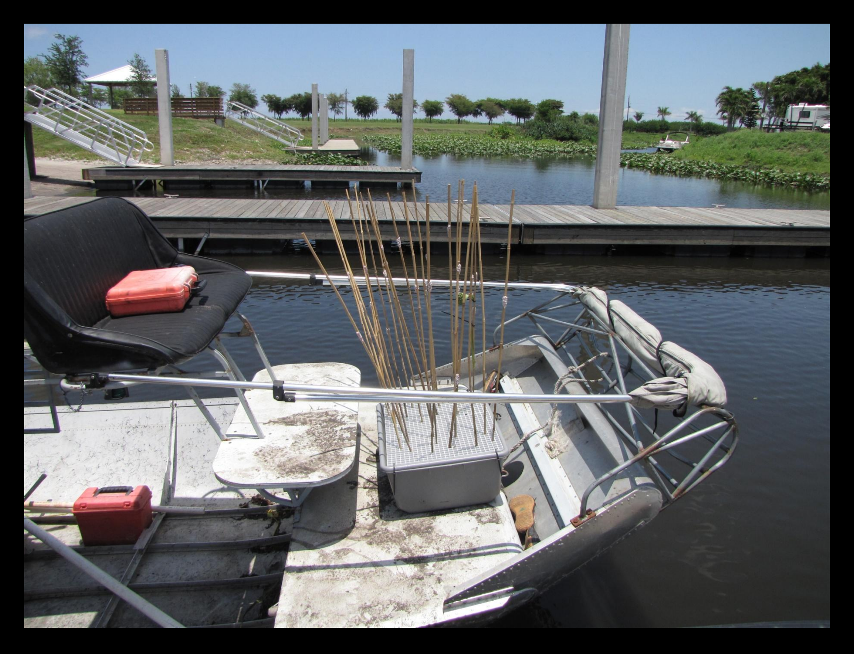
Lemkin Creek egg clutches ready for transport, Lake Okeechobee, May 2011