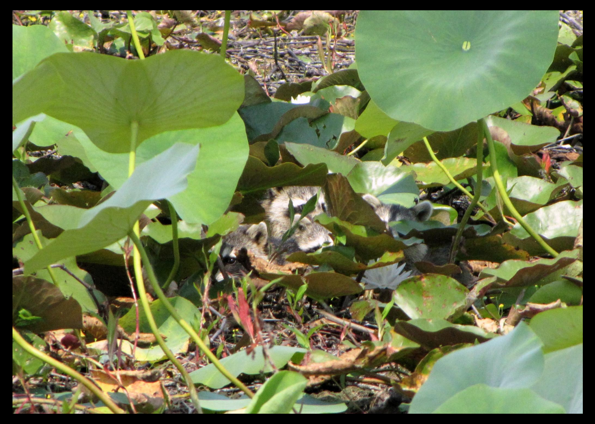
Young Raccoons ( Procyon lotor ), Lake Okeechobee, May 2011