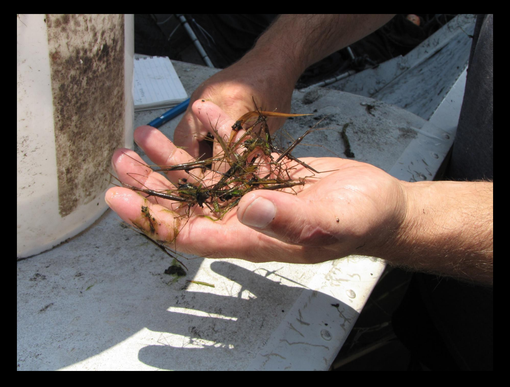
Water scorpions ( Ranatra fusca ) from the herpetofauna trap, Lake Okeechobee, May 2011