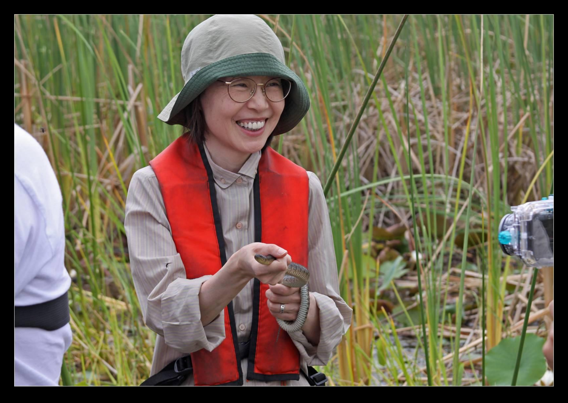
Hands-on experience, Lake Okeechobee, May 2011