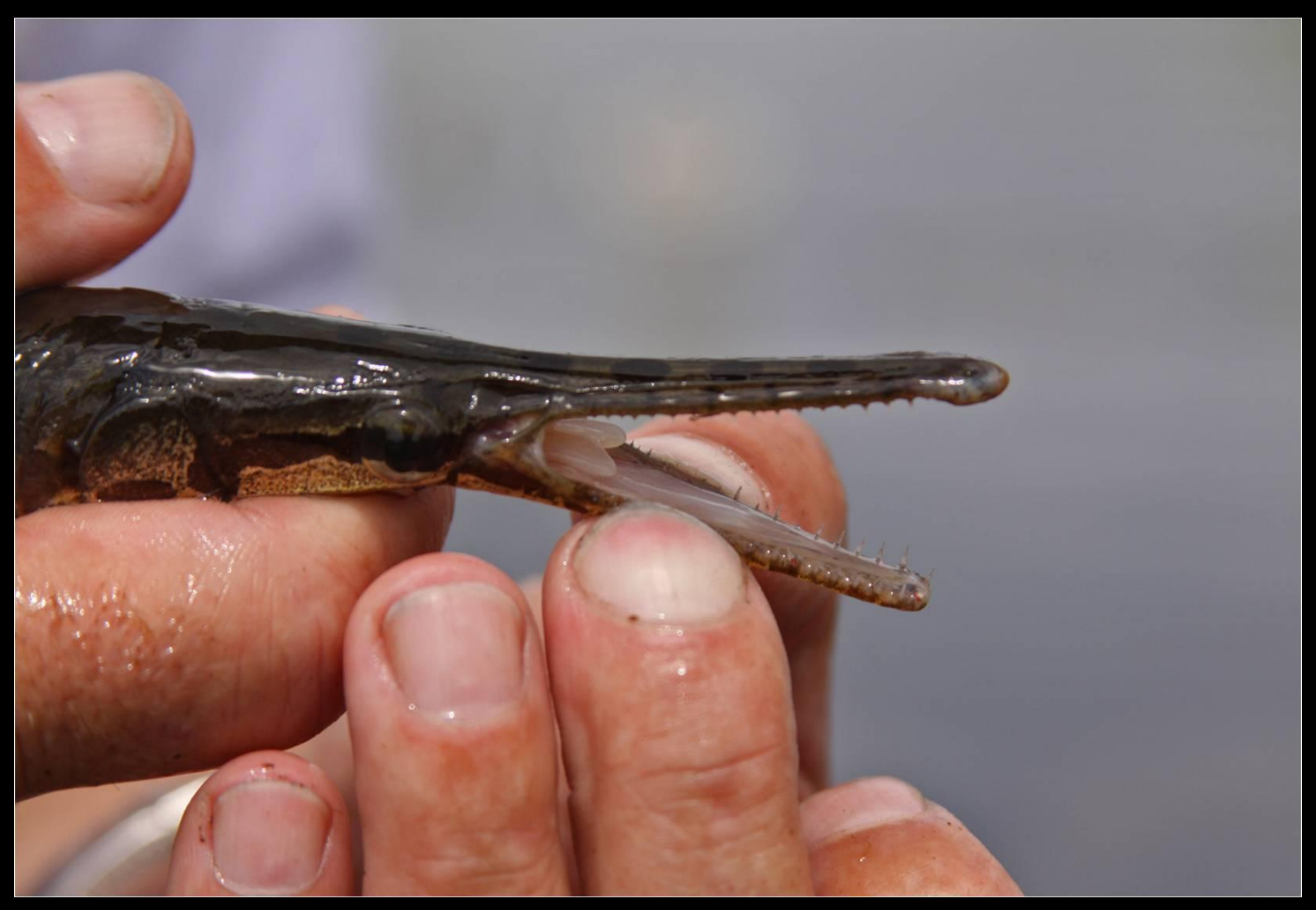
Young Florida Gar ( Lepisosteus platyrhincus ) caught in the herpetofauna trap, May 2011