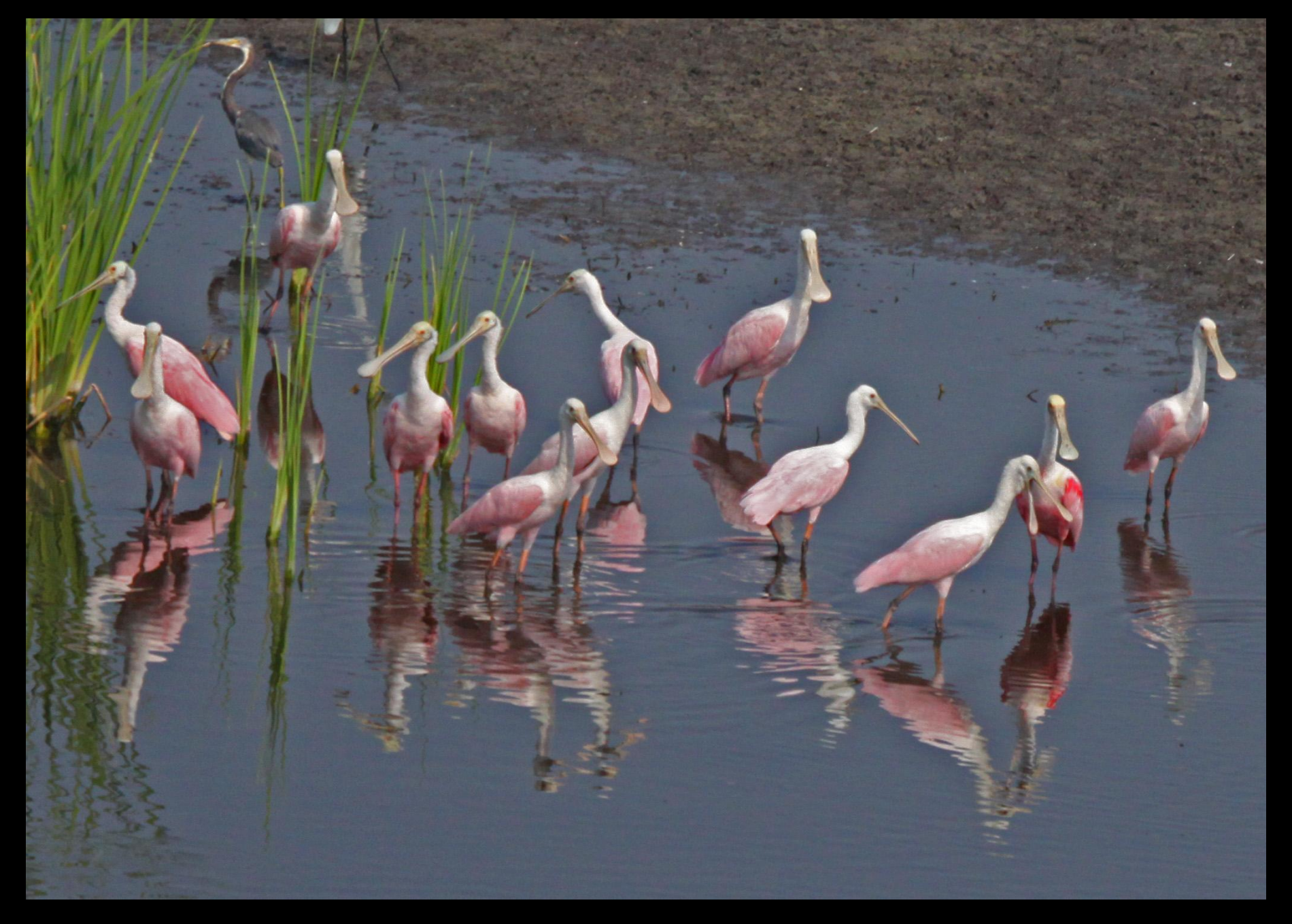
Roseate Spoonbills ( Ajaia ajaja ) in Worm Cove, Lake Okeechobee, May 2011