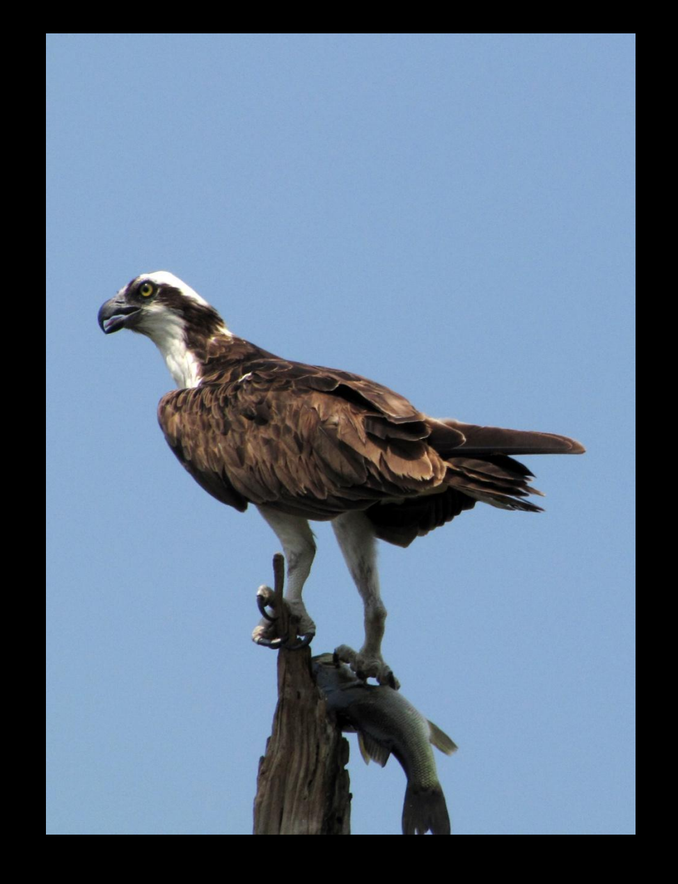
Osprey (Pandion haliaetus) and lunch, Lake Okeechobee, May 2011