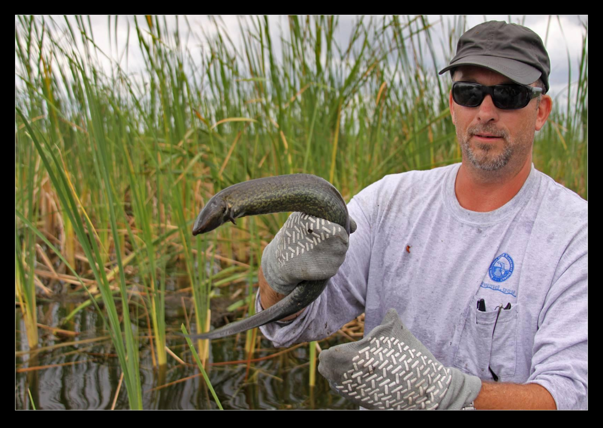
Greater Siren (Siren lacertina) caught in the herpetofauna trap, May 2011