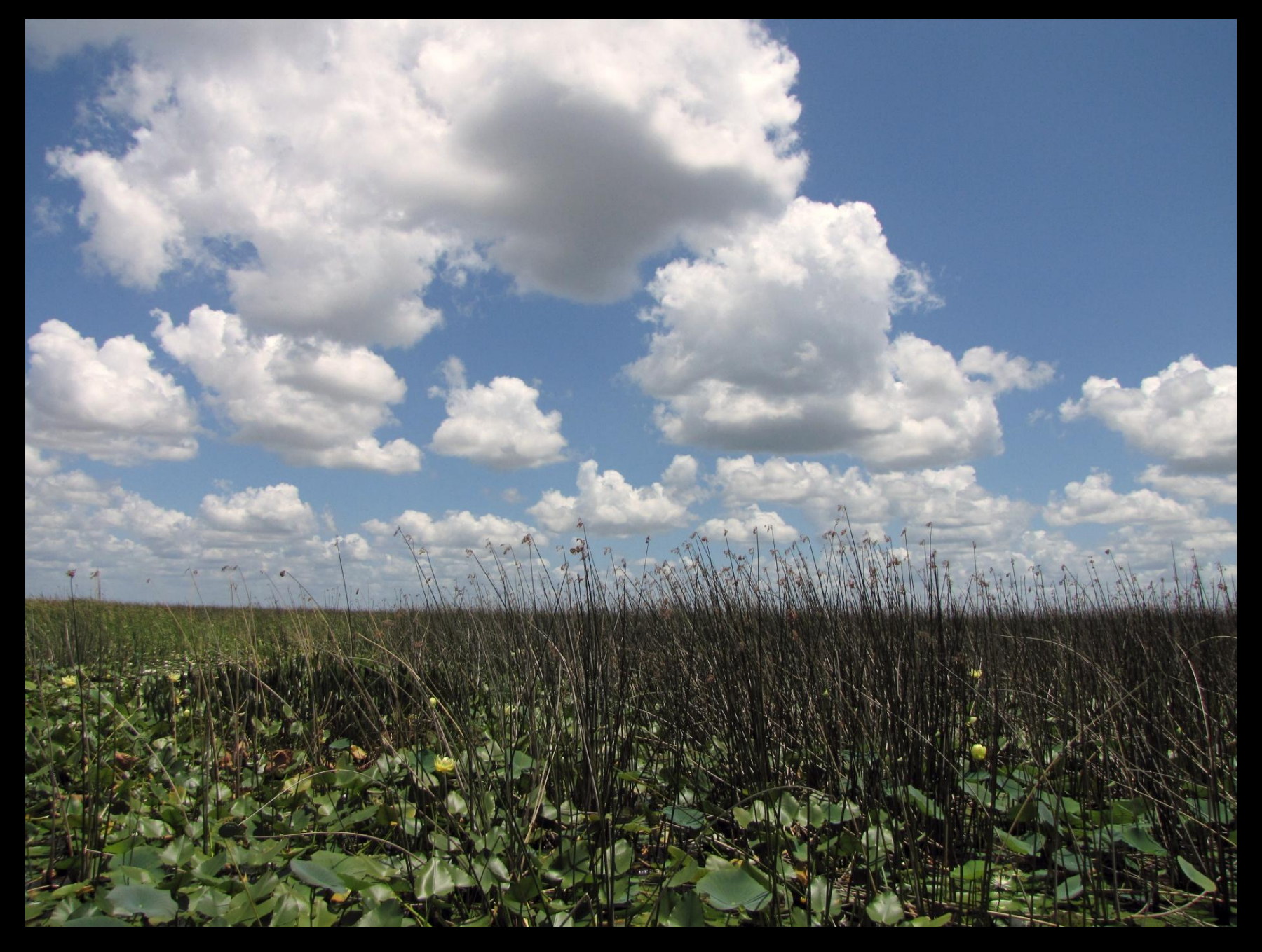
Bulrush (Schoenoplectus californicus) on Lake Istokpoga, May 2011