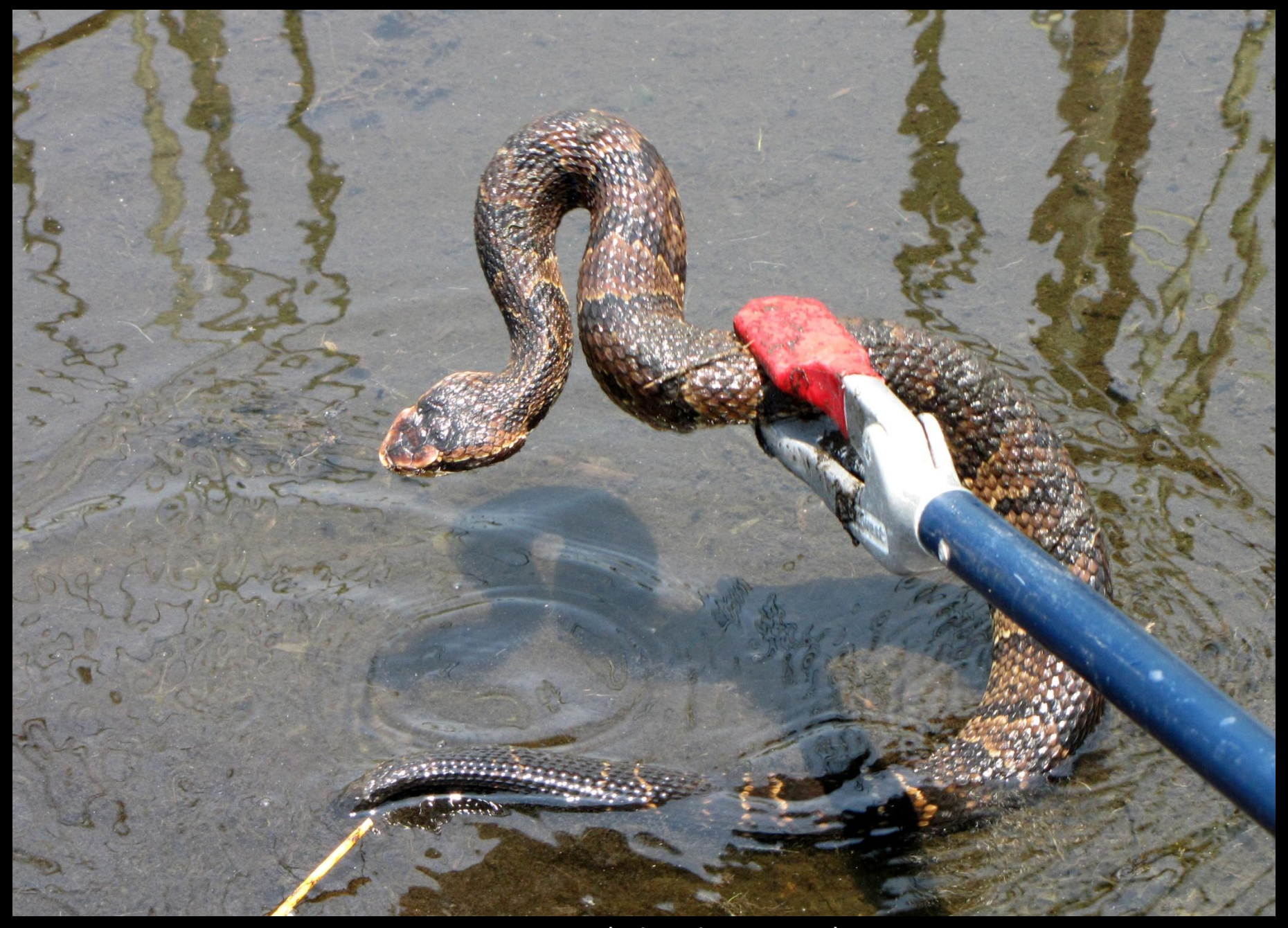
Water Moccasin ( Agkistrodon piscivorous ), Lake Okeechobee, May 2011