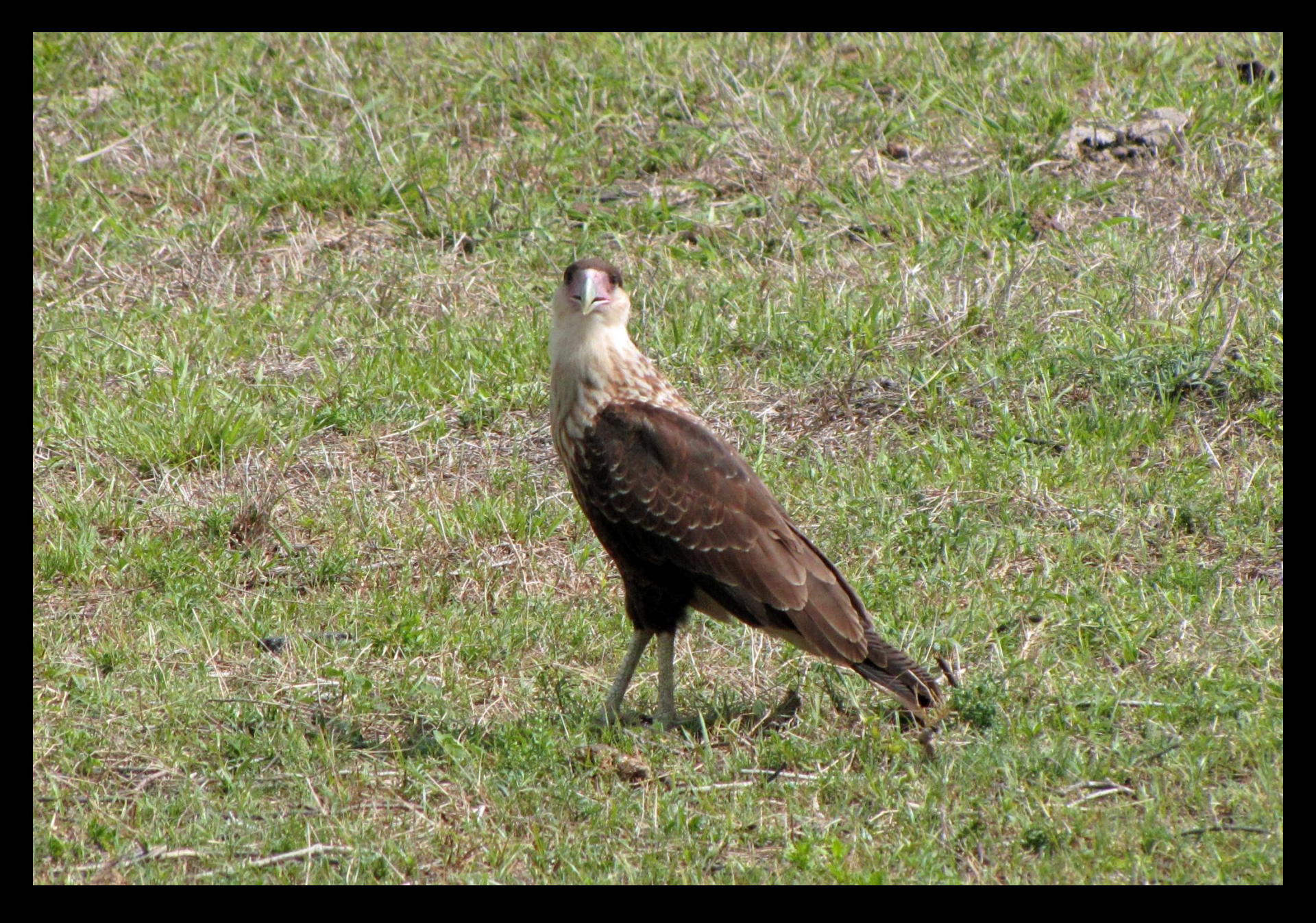
Crested Caracara (Caracara cheriway), Lemkin Creek, May 2011