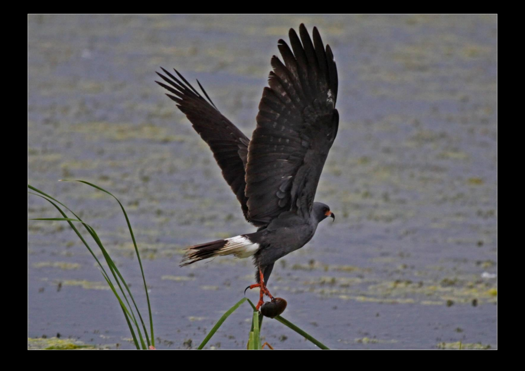
Male Snail Kite (Rostrhamus sociabilis), Lake Okeechobee, May 2011