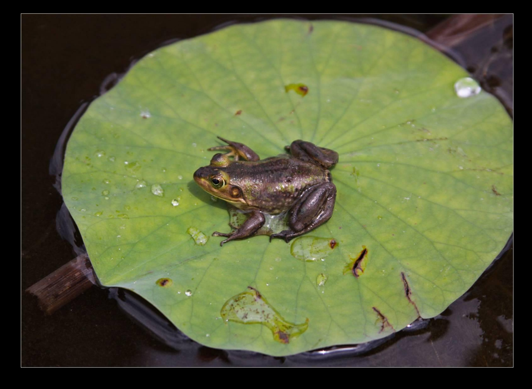
Pig Frog (Rana grylio)on a lotus leaf (Nelumbo lutea), Lake Okeechobee, May 2011