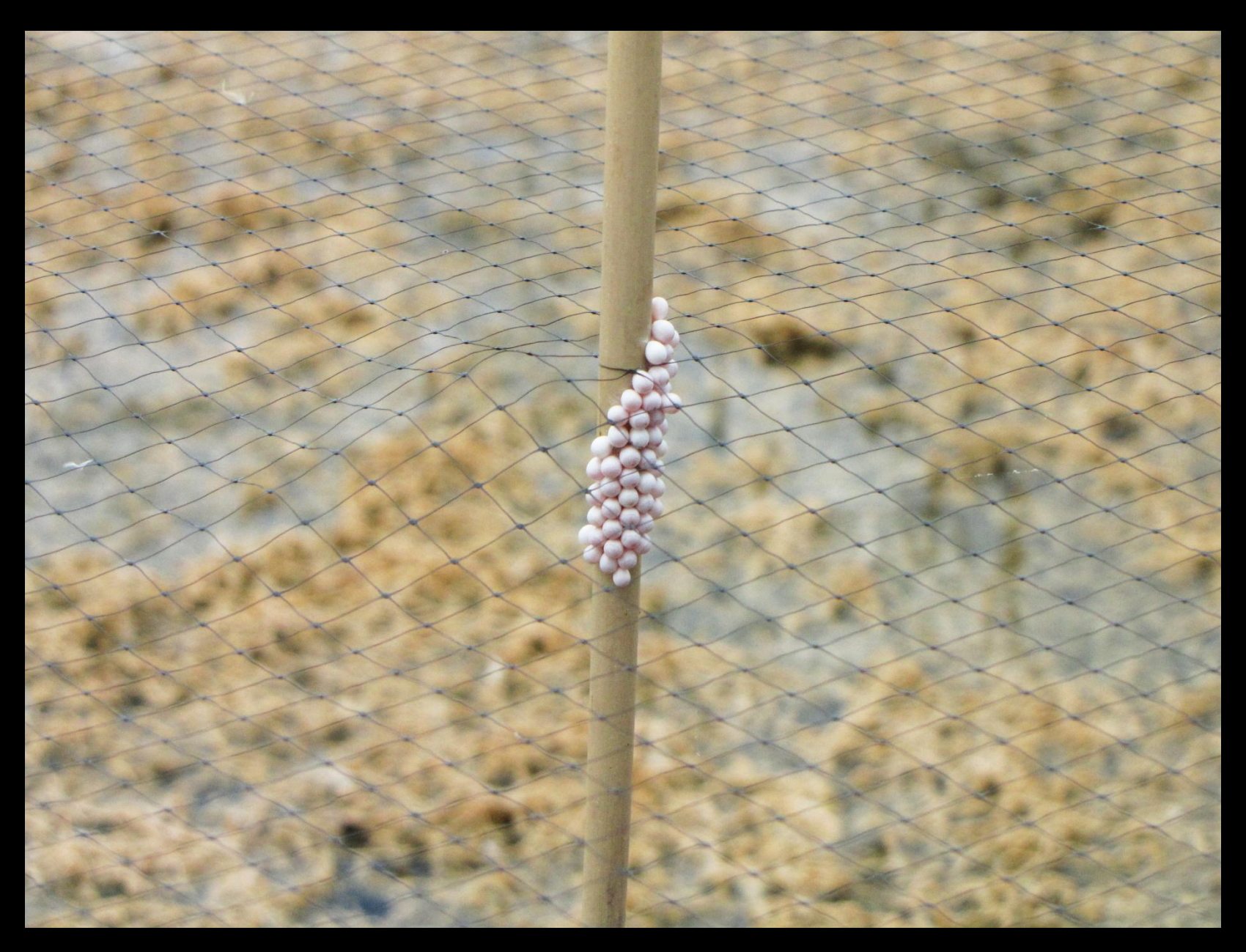
Native Apple Snail ( Pomacea paludosa ) eggs in breeding enclosure, Lemkin Creek hatchery experiment, May 2011