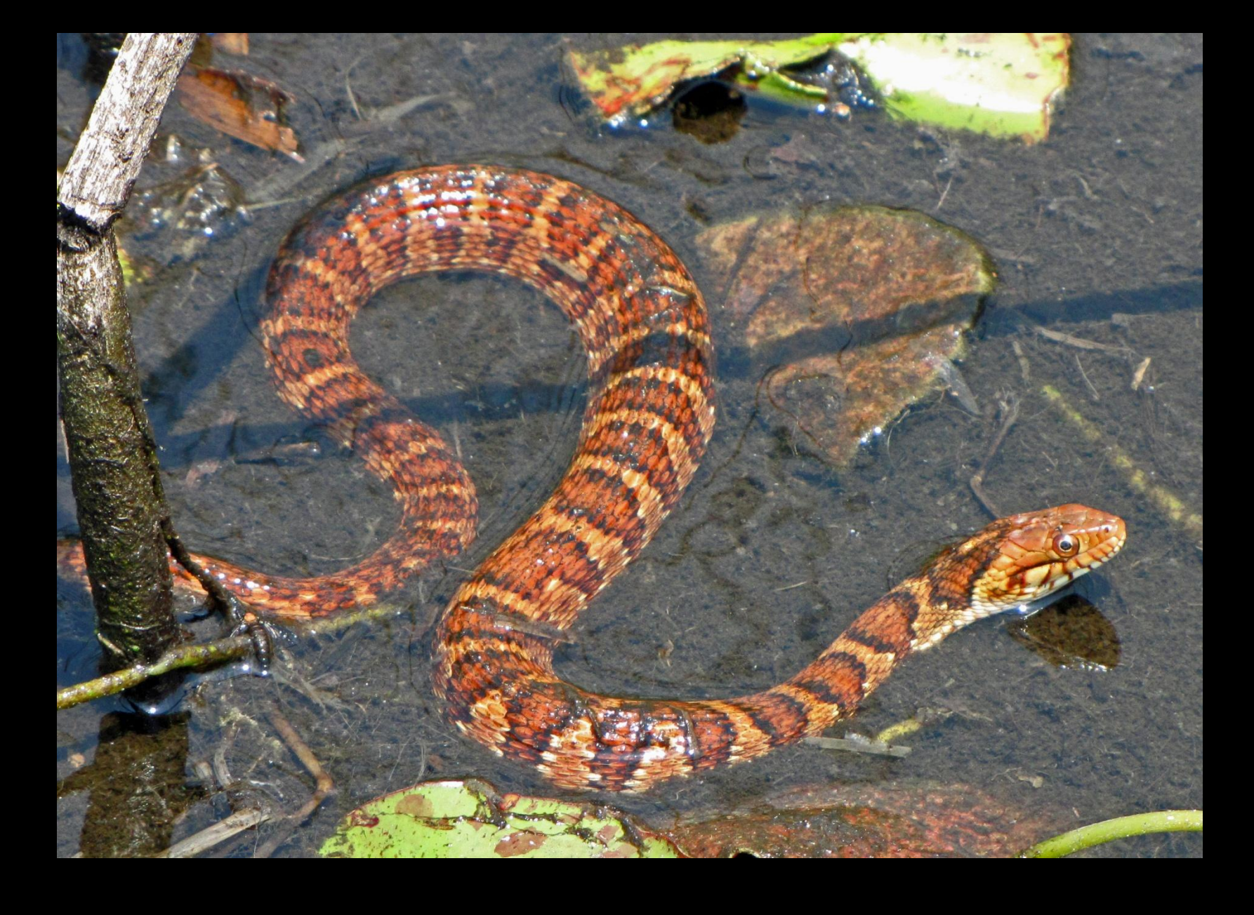
Florida Water Snake (Nerodia fasciata pictiventris), Lake Okeechobee, May 2011