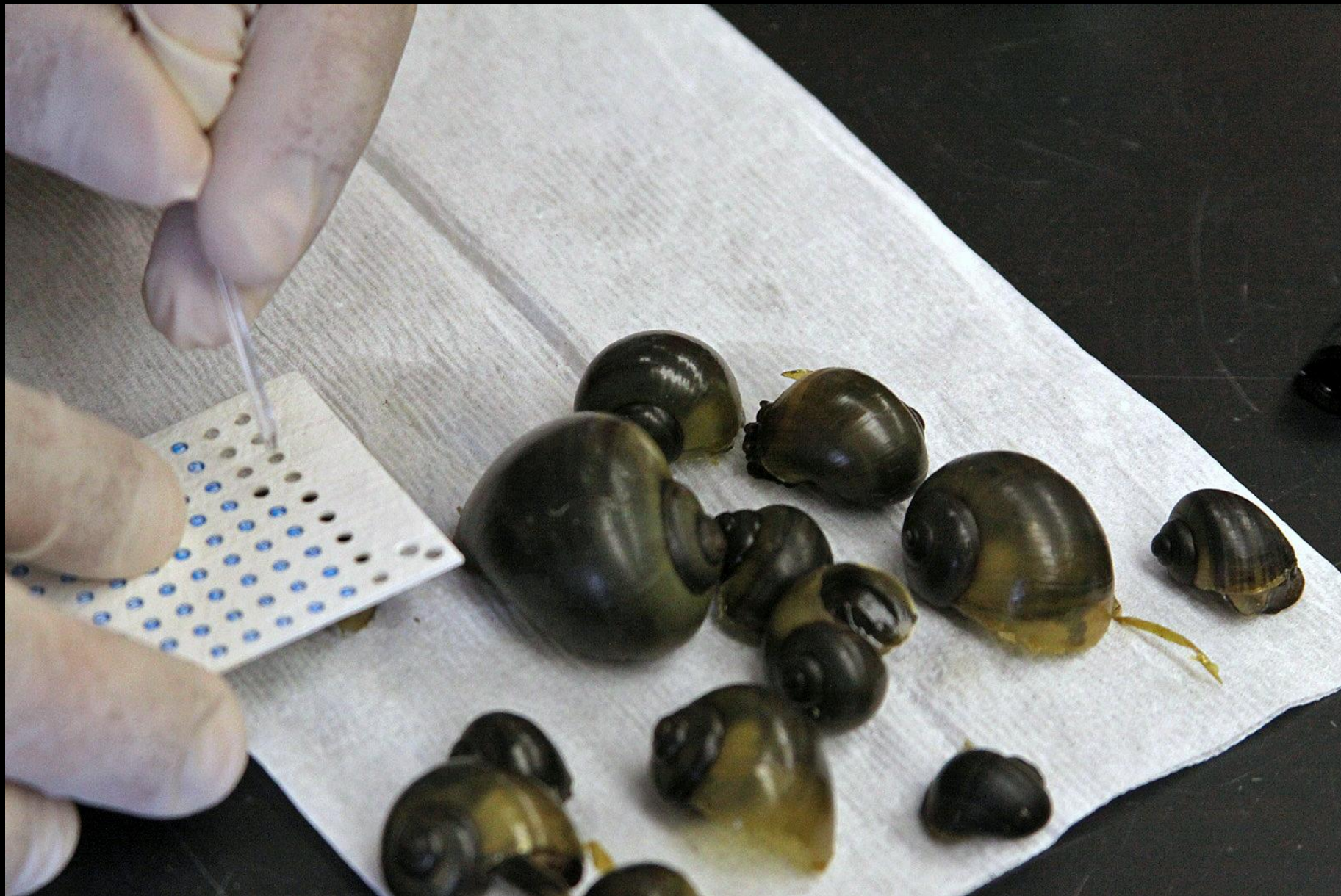
Colored plastic bee tags are glued to each shell.