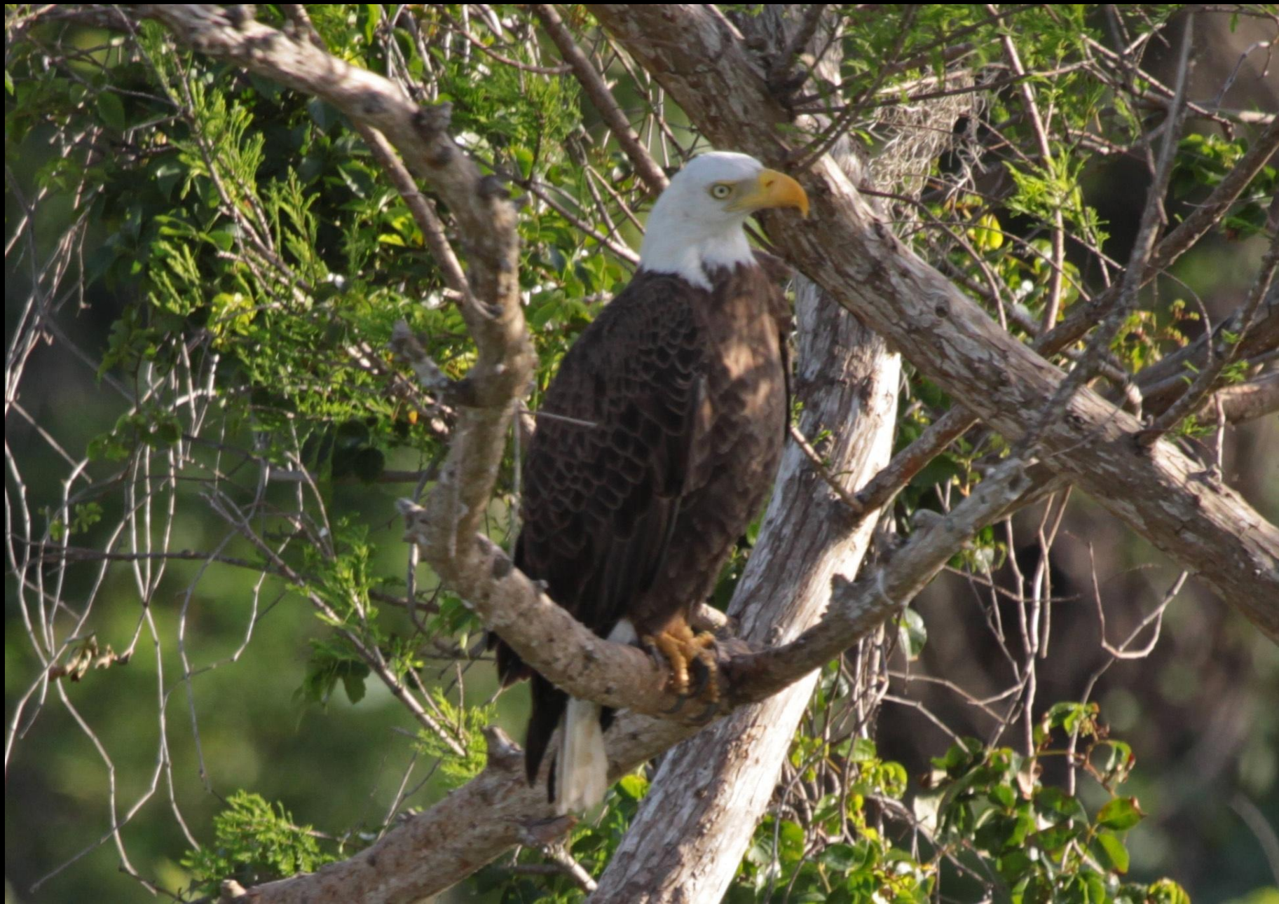
Bald Eagle ( Haliaeetus leucocephalus ) near Observation Island. Lake Okeechobee, March 2012