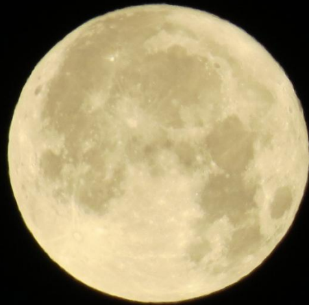
Full moon on an early morning trip to the upper Kissimmee River for bird surveys. March 2012