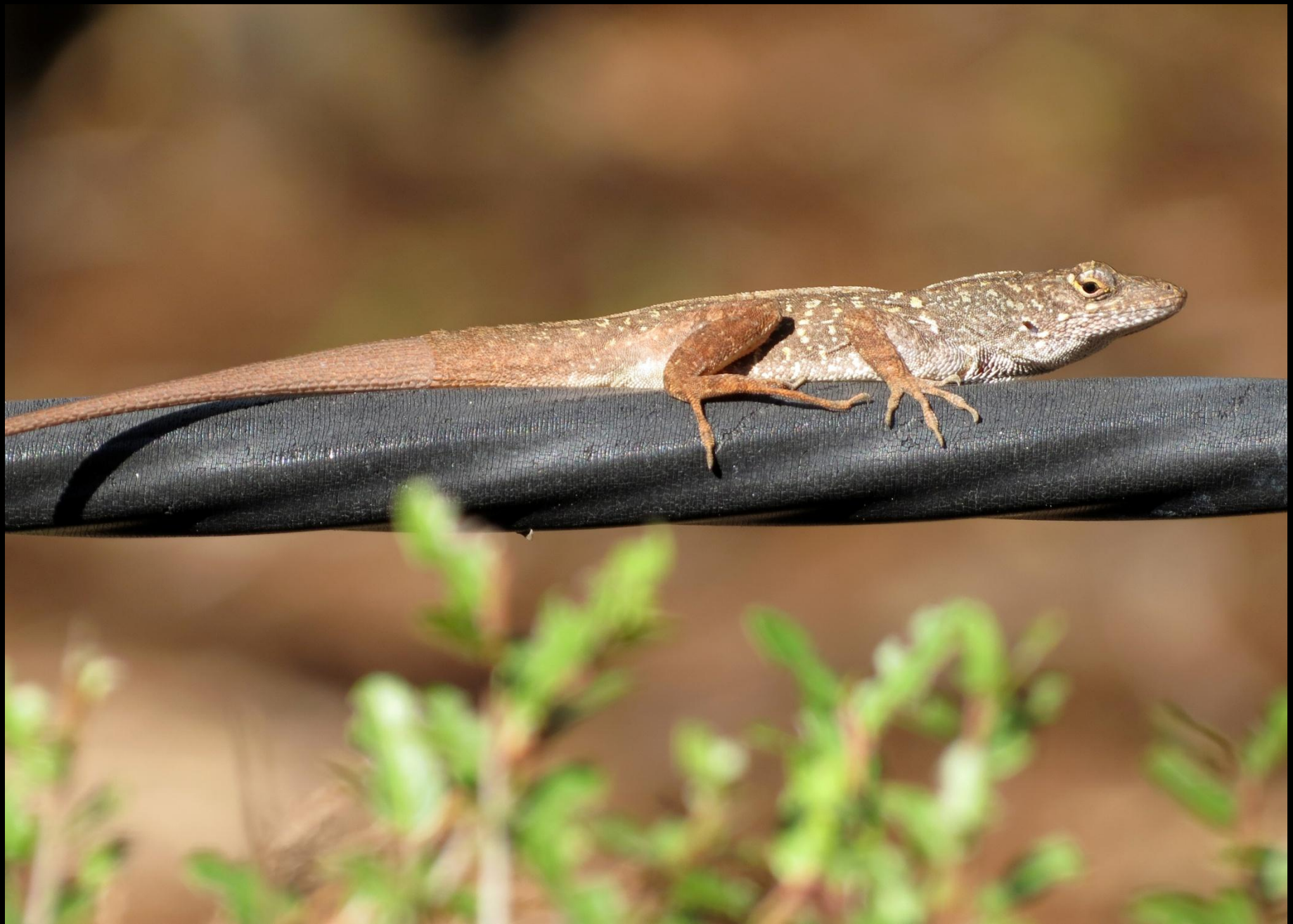
Brown Anole ( Anolis sagrei ), SFWMD headquarters. March 2012