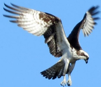
An Osprey ( Pandion haliaetus ) hovers over the Kissimmee River looking for lunch. March 2012