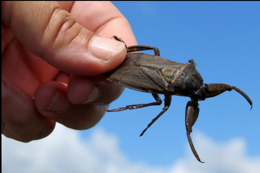
Giant Water Bug (Family Belostomatidae )