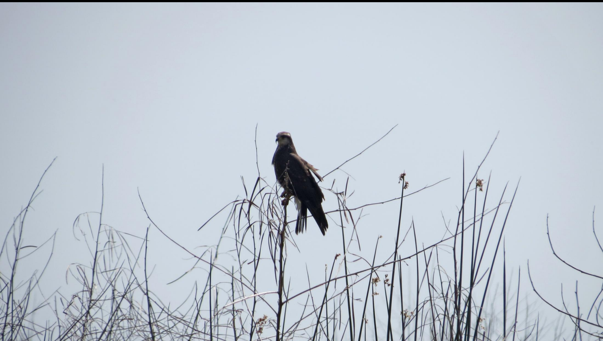
Snail Kite ( Rostrhamus sociabilis ). Lake Okeechobee, March 2012