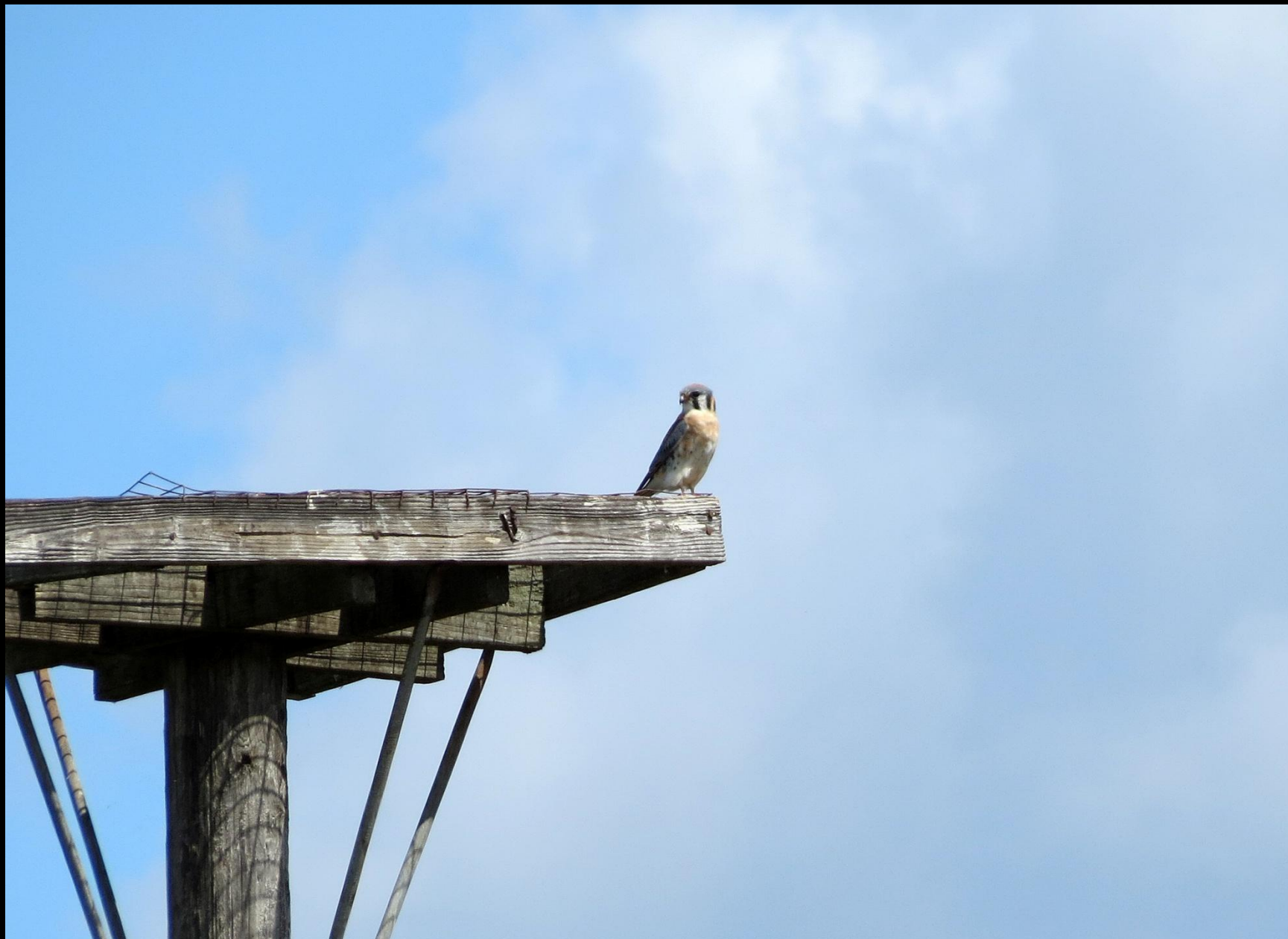
Kestrel ( Falco sparverius ), Yankee Point Lake Okeechobee, March 2012