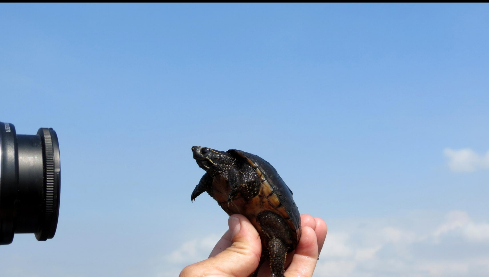
An Eastern Musk Turtle ( Sternotherus odoratus ) poses for a photo op. Lake Okeechobee, February 2012