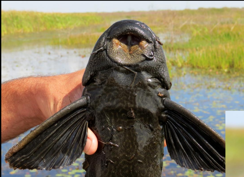
A closer look at the Armored Catfish's sucker-like mouth from below.