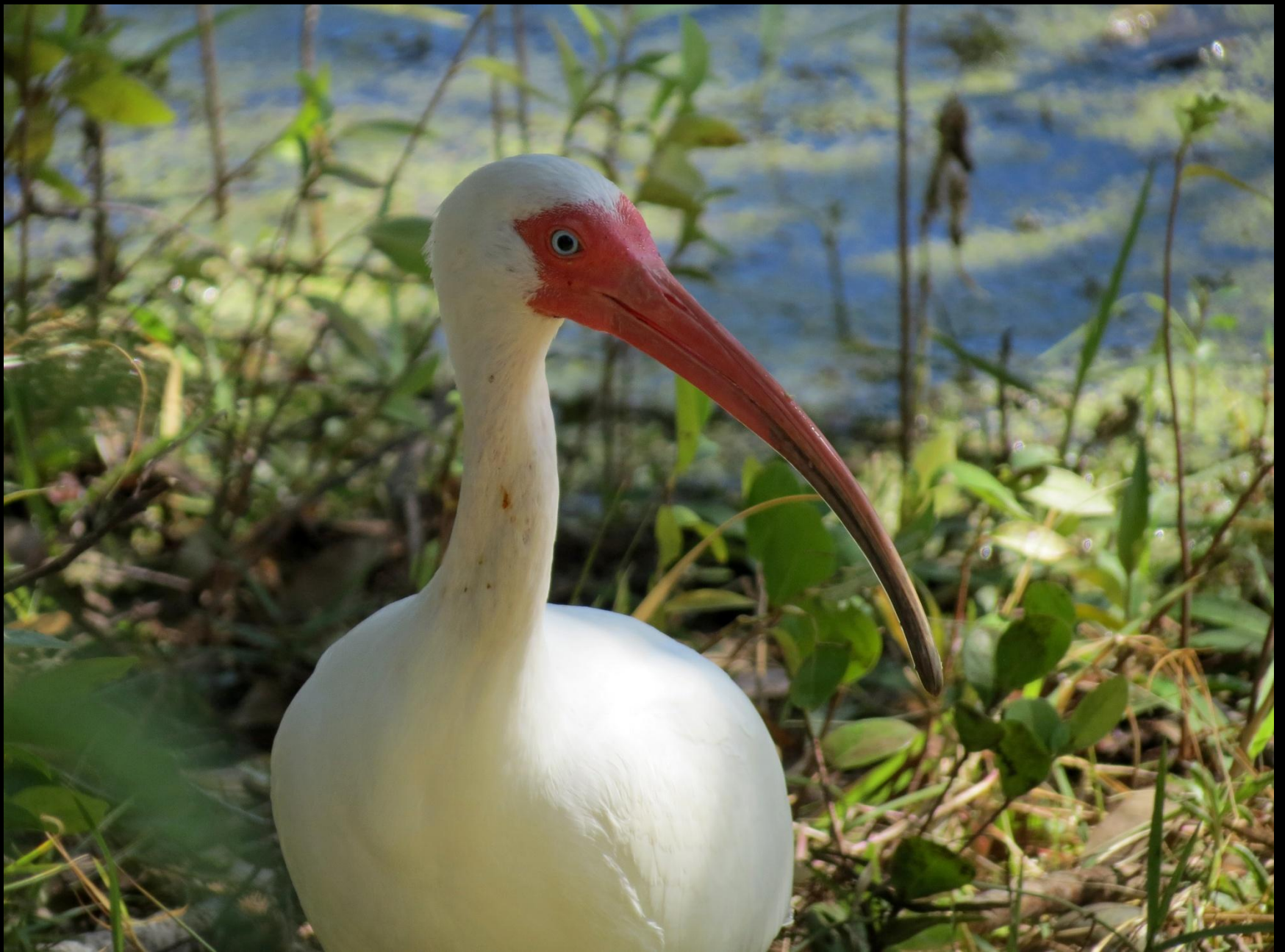
White Ibis ( Eudocimus albus ), SFWMD headquarters. March 2012