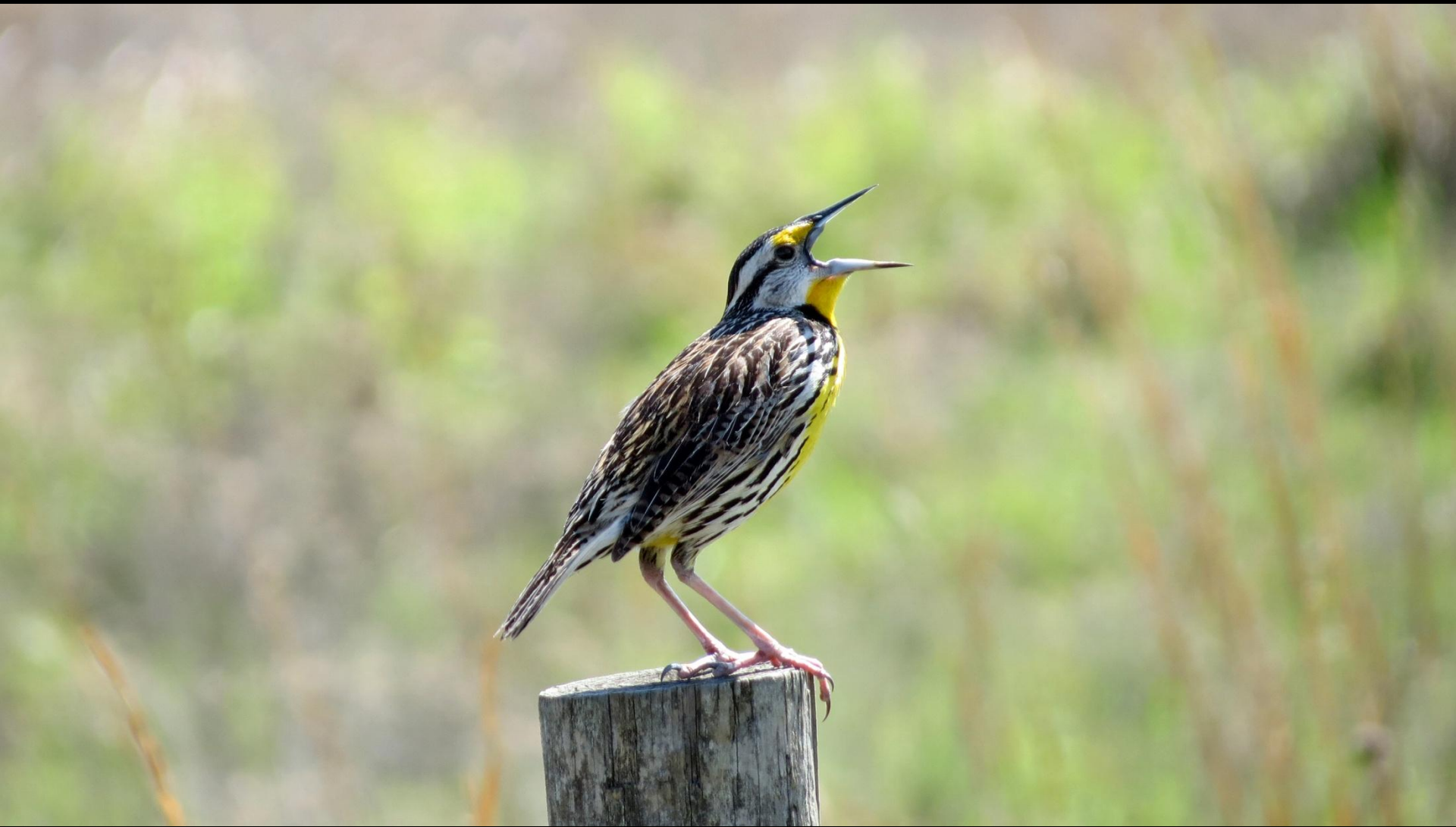
Eastern Meadowlark ( Sturnella magna ) Upper Kissimmee River, March 2012