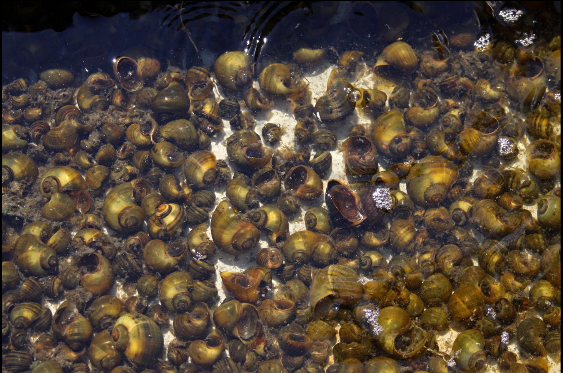
Native Apple Snails wait to be tagged for stocking density experiments.