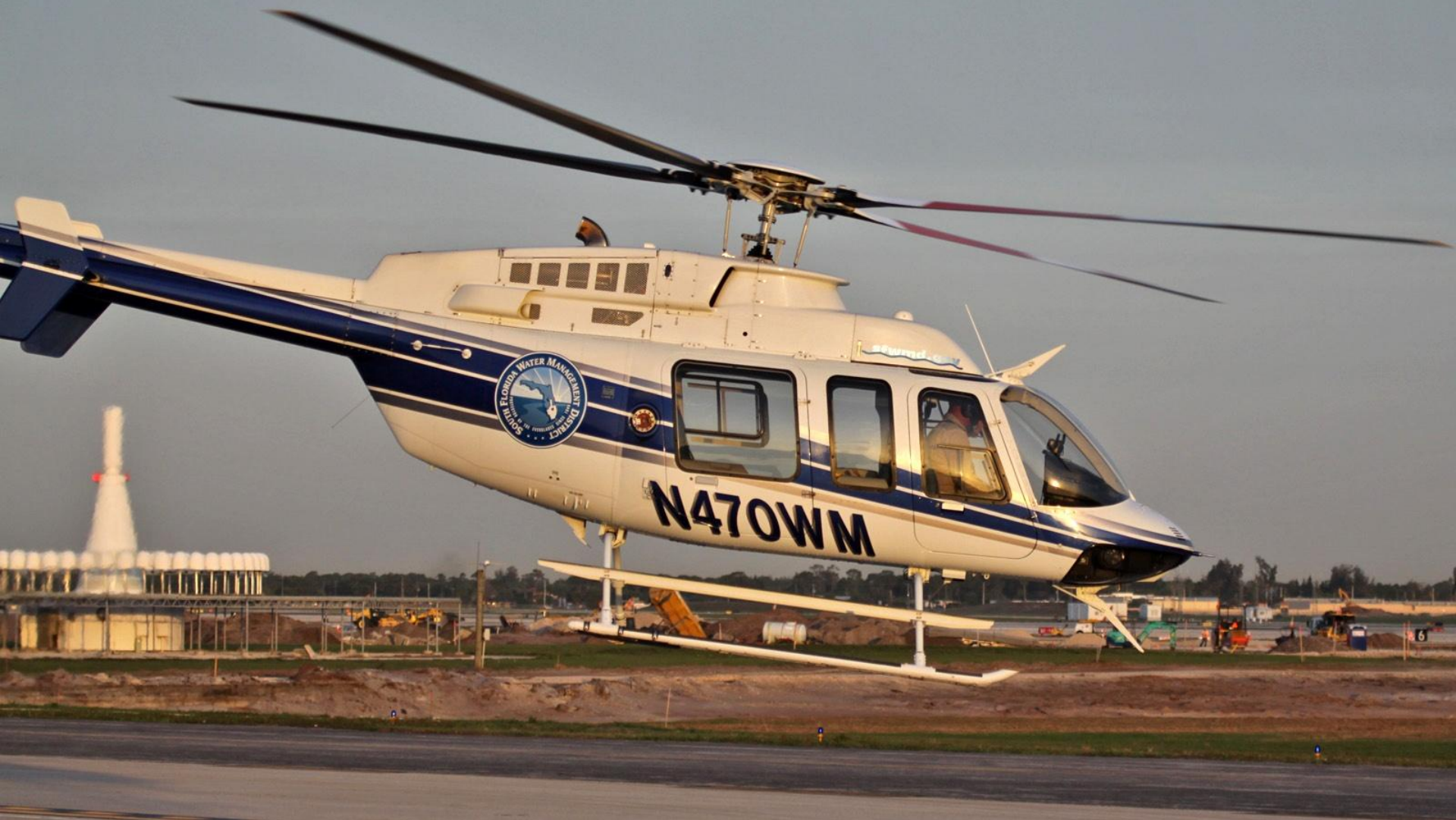
Morning take-off for a wading bird survey on Lake Okeechobee. Palm Beach International Airport, March 2012