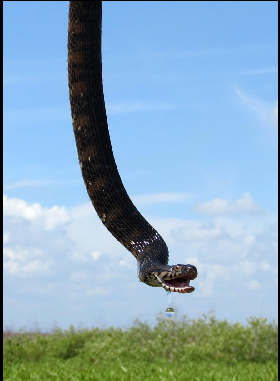
Brown Water Snake ( Nerodia taxispilota )