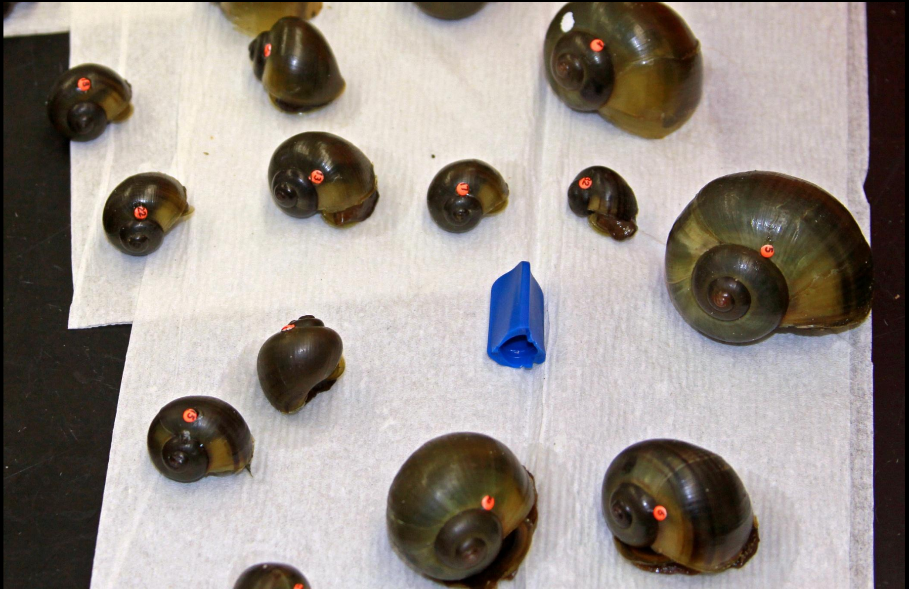
Tagged snails ready to go.