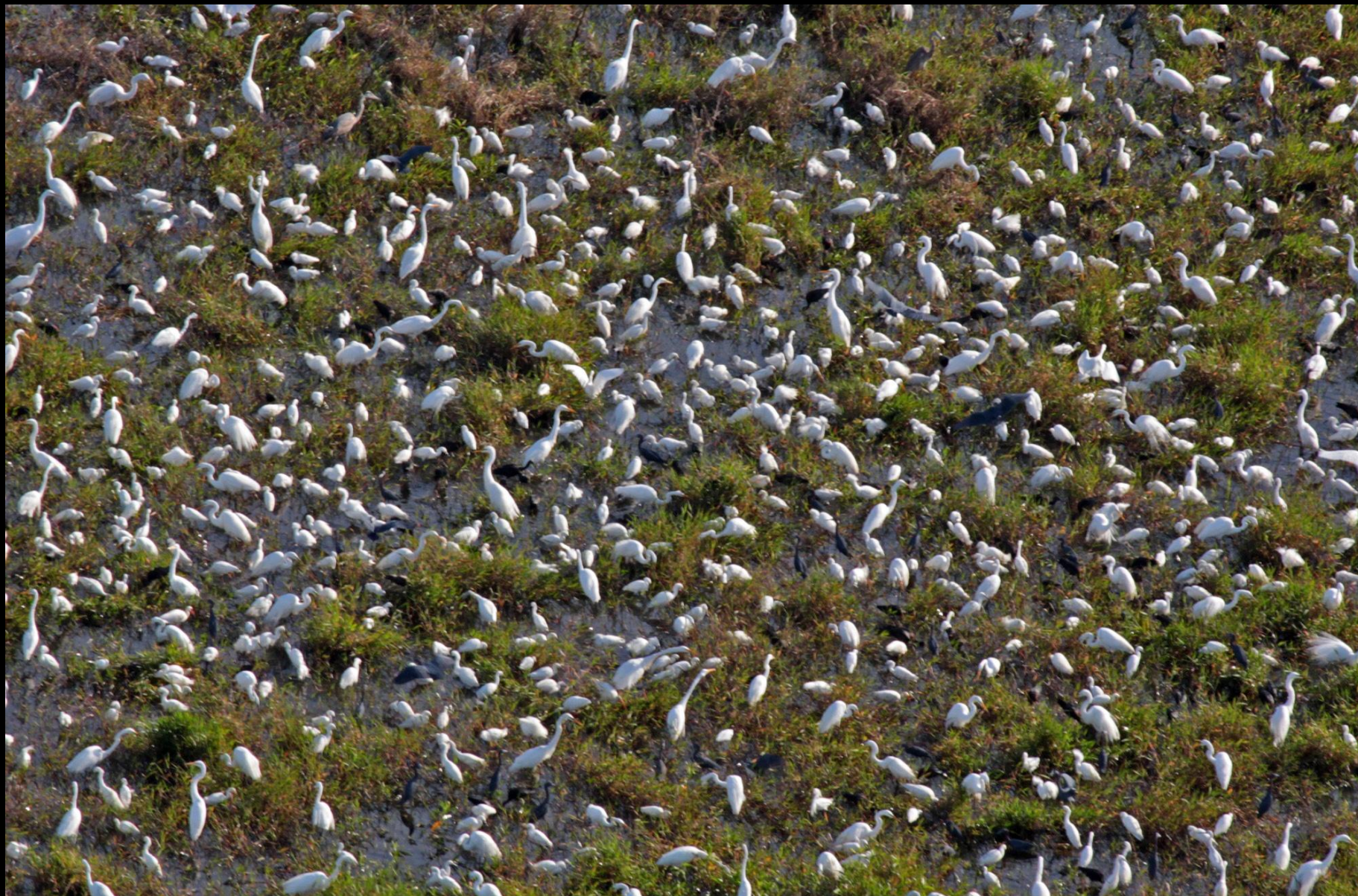
Hundreds of wading birds in the marsh near Fisheating Bay. Surveyors count and photograph the flocks to estimate foraging use in the lake. Lake Okeechobee, March 2012