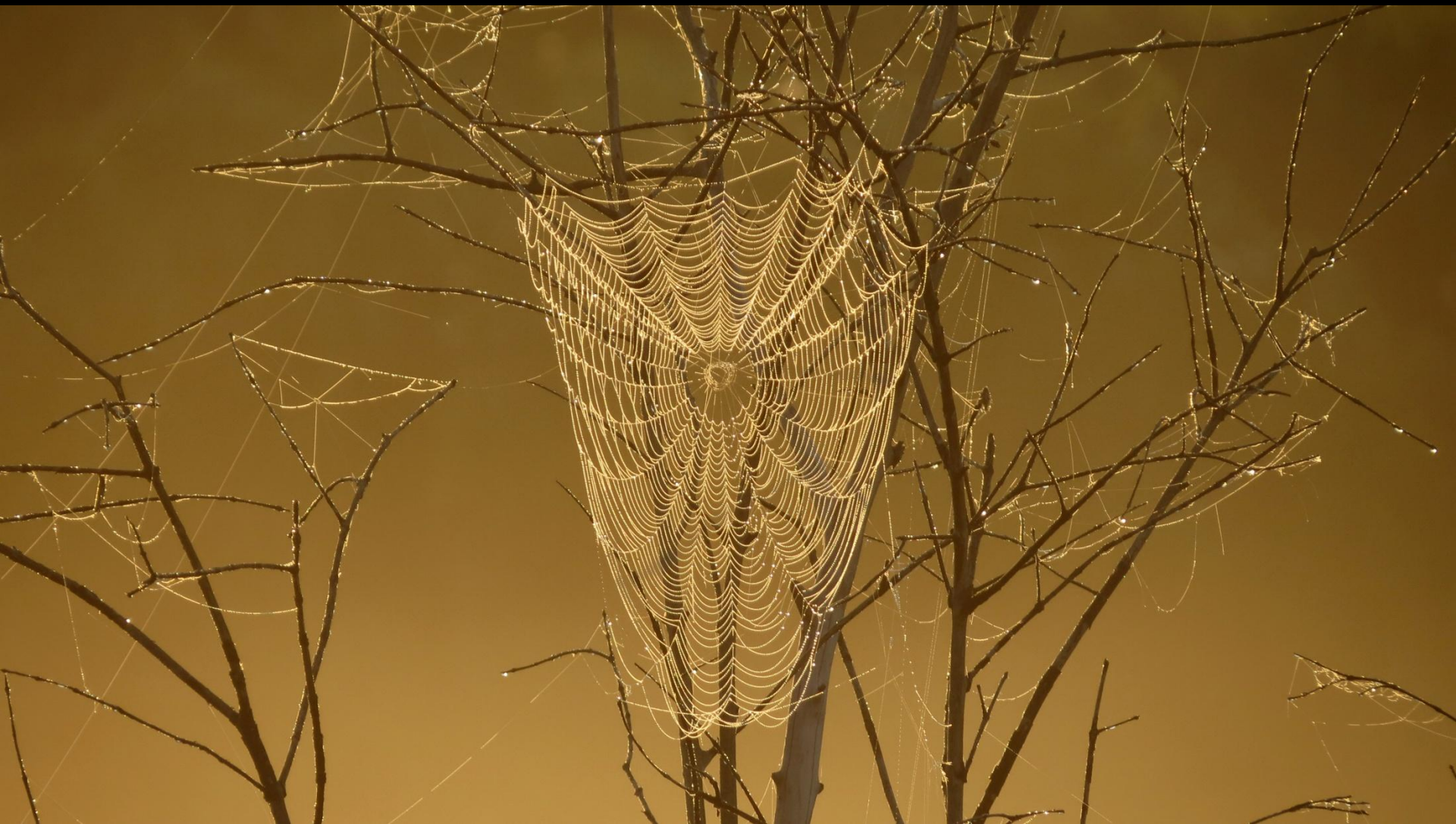
Spider's web in the morning light, Upper Kissimmee River, March 2012