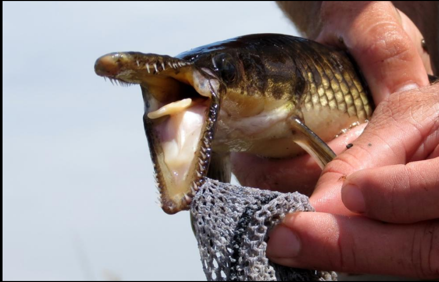
Florida Gar ( Lepisosteus platyrhincus )