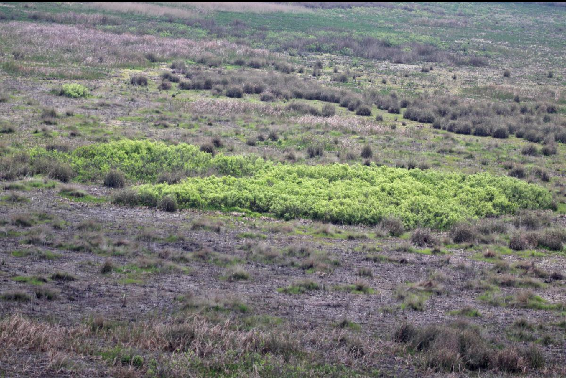
Bright green willow trees ( Salix ) in an otherwise dry Moore Haven Marsh, Lake Okeechobee, March 2011