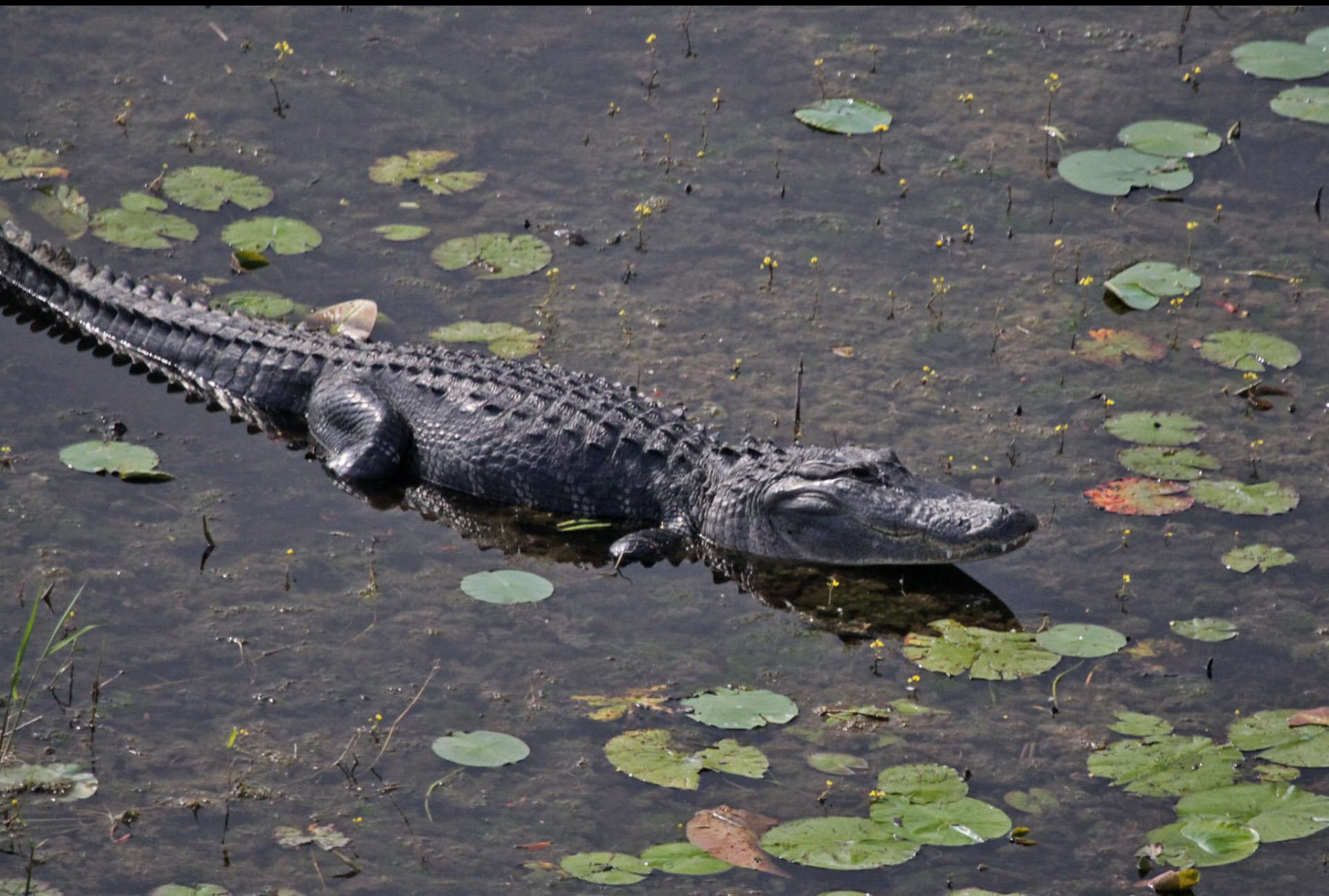
Alligator in very shallow water, Lake Okeechobee, March 2011