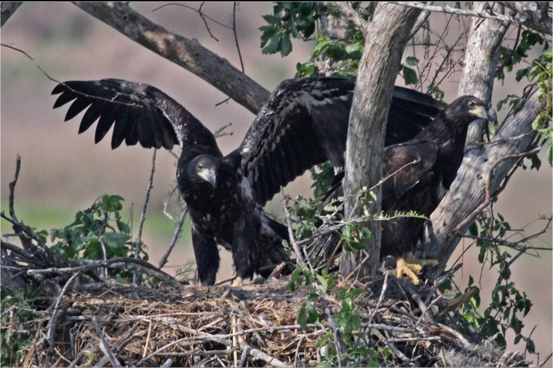
Eaglets, Lake Okeechobee, March 2011