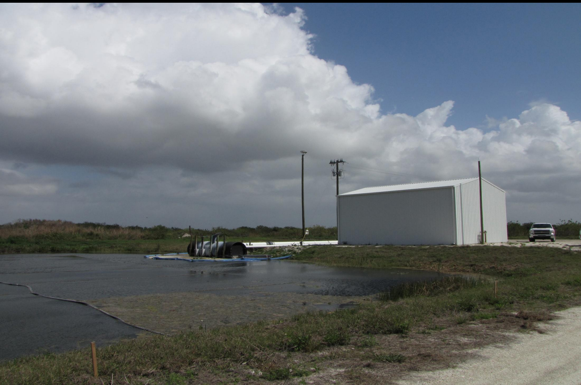
Hybrid Wetland Treatment Technology alum injection building, Lemkin Creek Wetland, March 2011