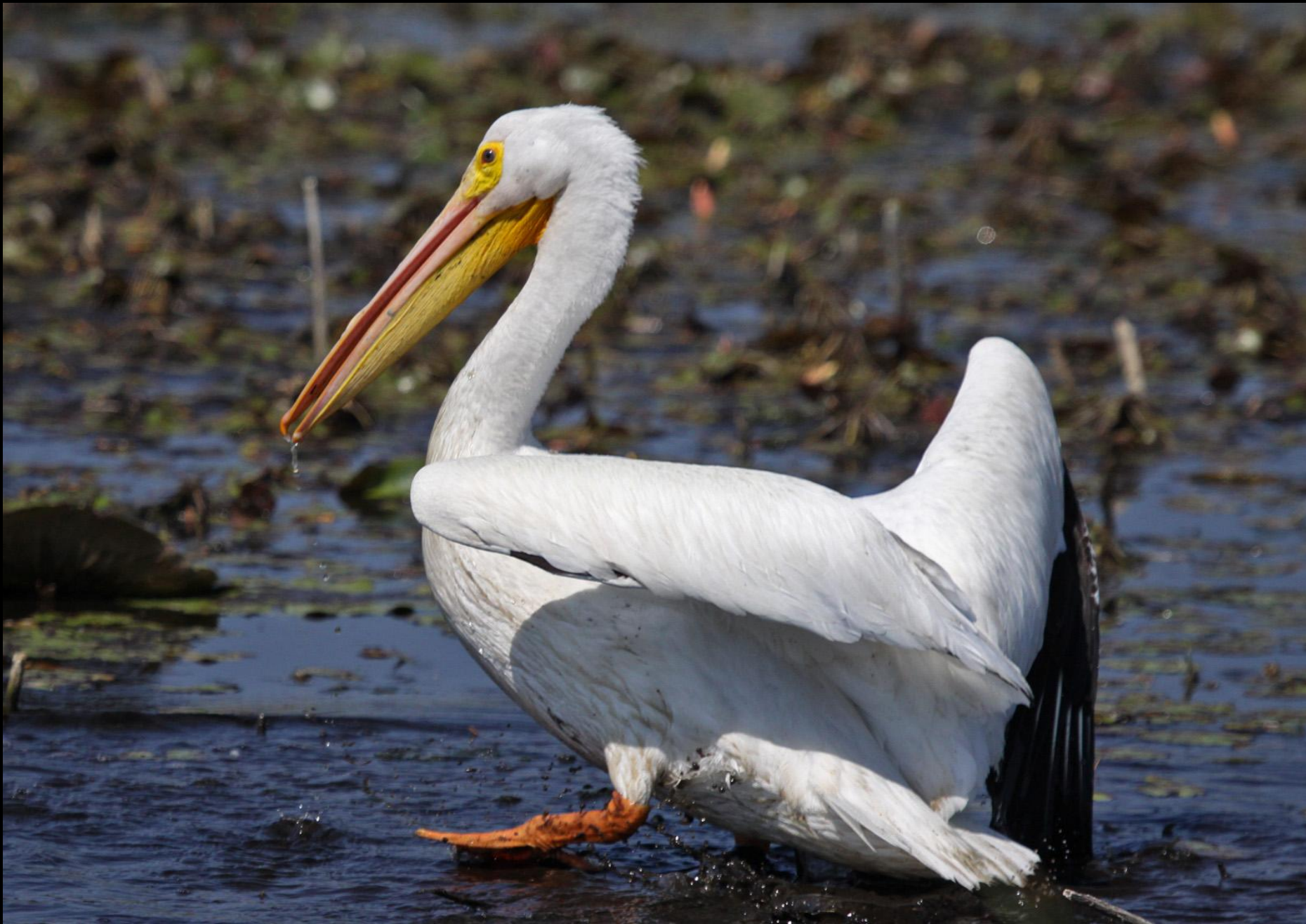
Injured White Pelican, Lake Okeechobee, March 2011