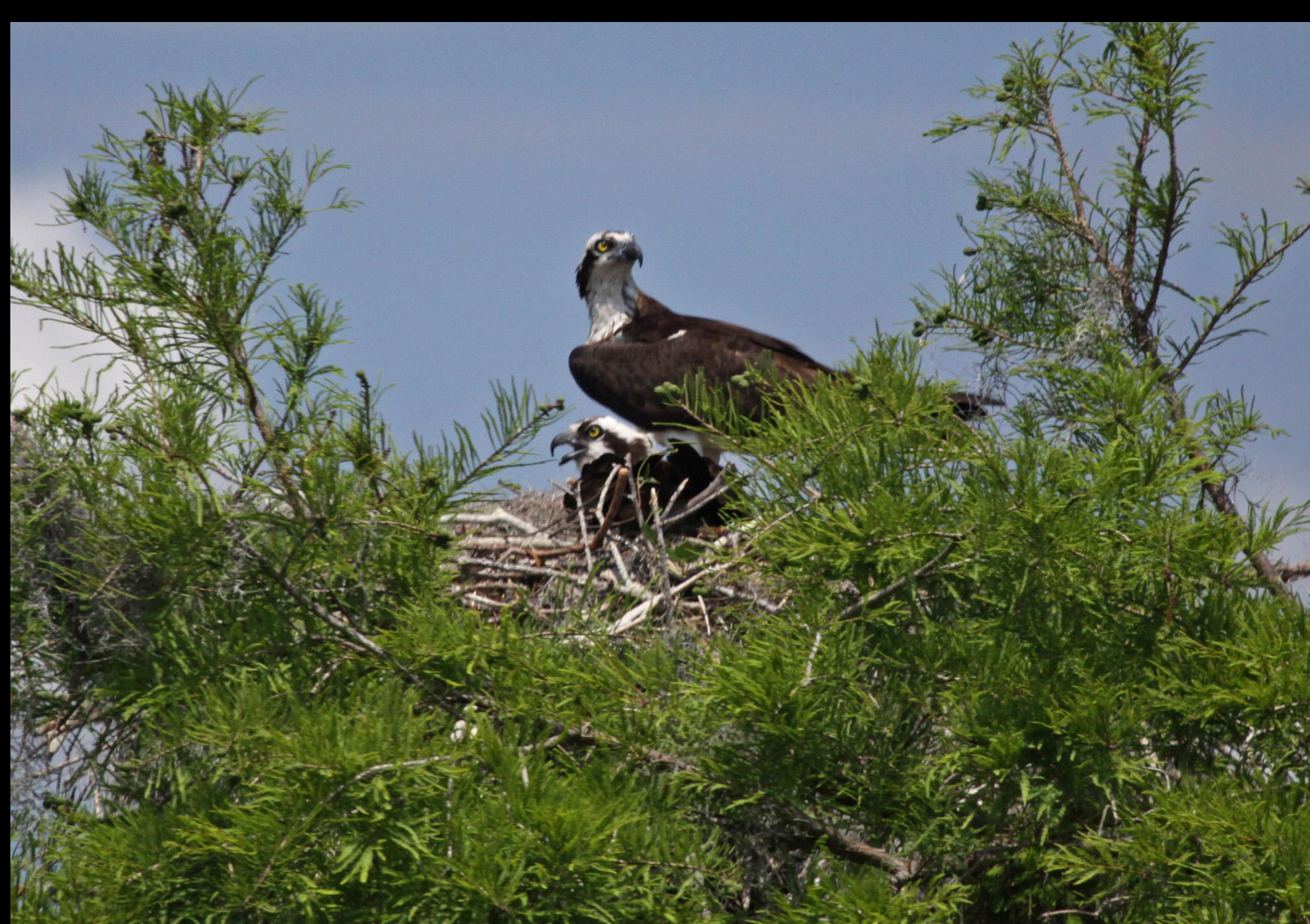
Mother Osprey and her chick, Lake Istokpoga, March 2011