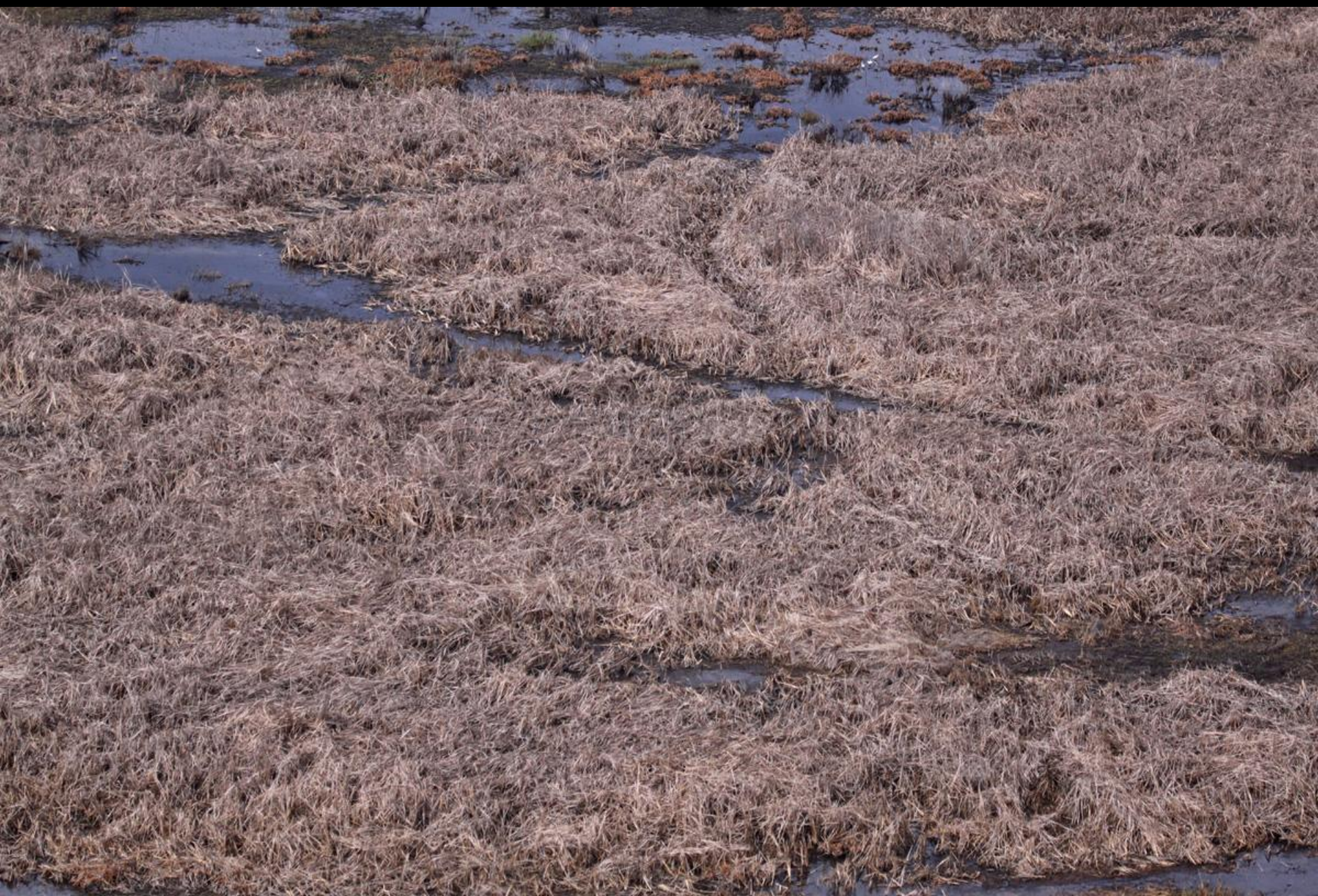
Cochran's Pass dead cattail in potential controlled burn site, Lake Okeechobee, March 2011