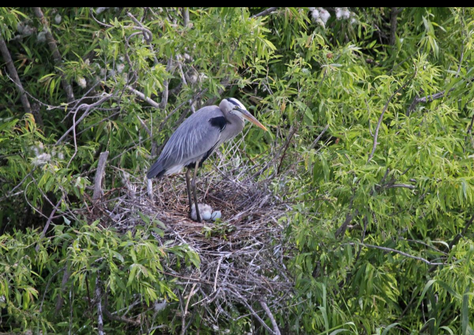
Great Blue Heron nest in willow tree, Lake Okeechobee, March 2011