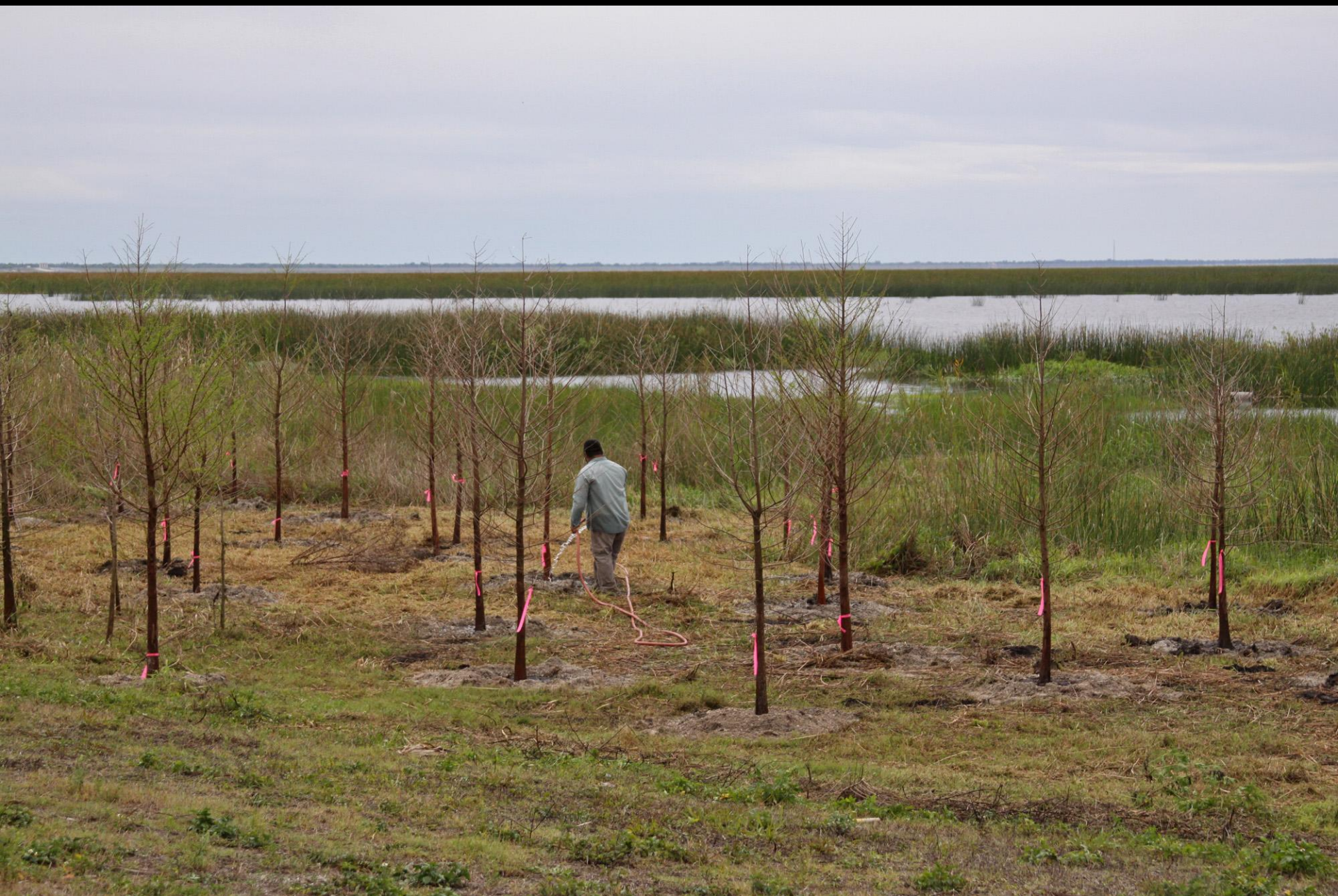
Cypress planting east of the Okeechobee pier, Lake Okeechobee, March 2011