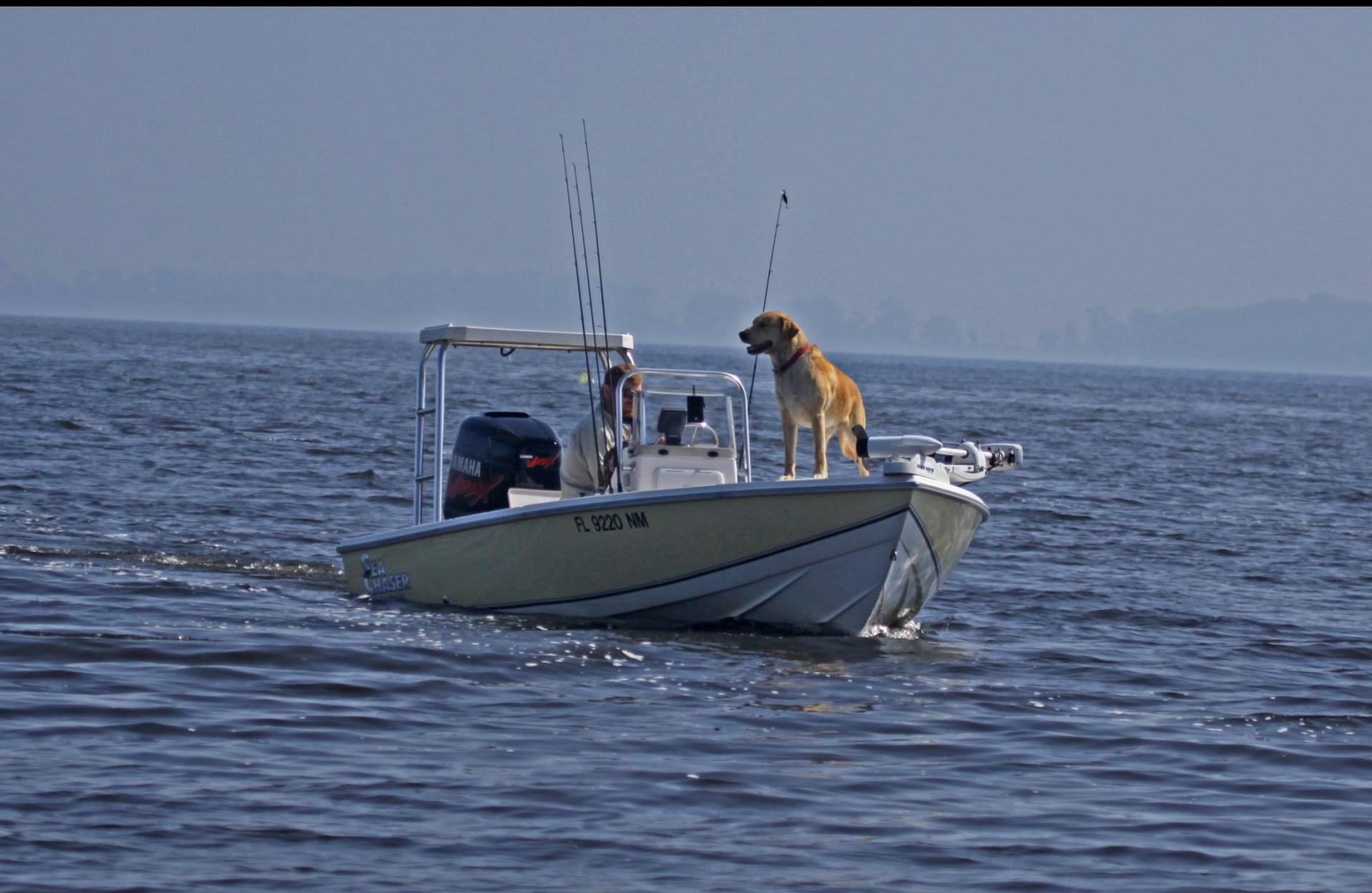
A fisherman's best friend, Lake Istokpoga, March 2011