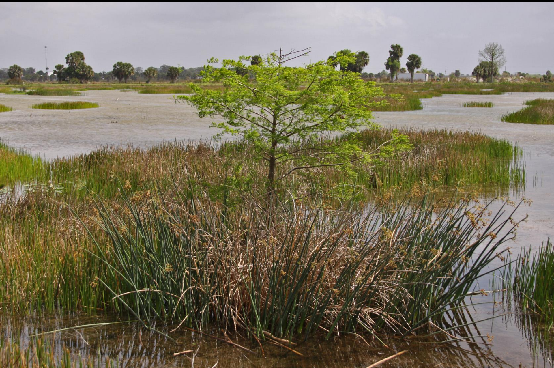
Cypress tree, bulrush, and spikerush, Lemkin Creek Wetland, March 2011