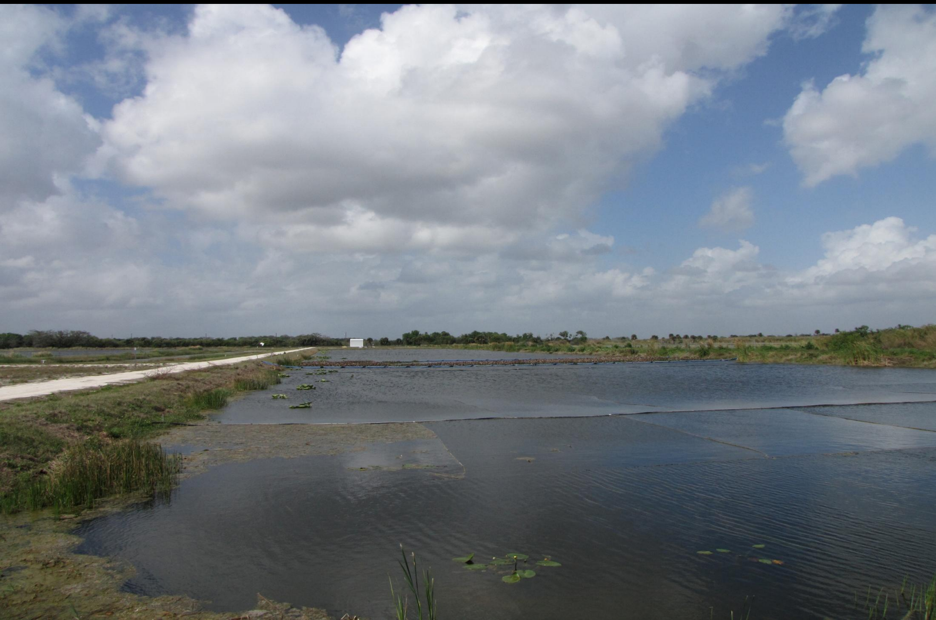
Hybrid Wetland Treatment Technology settling pond at Lemkin Creek Wetland, March 2011