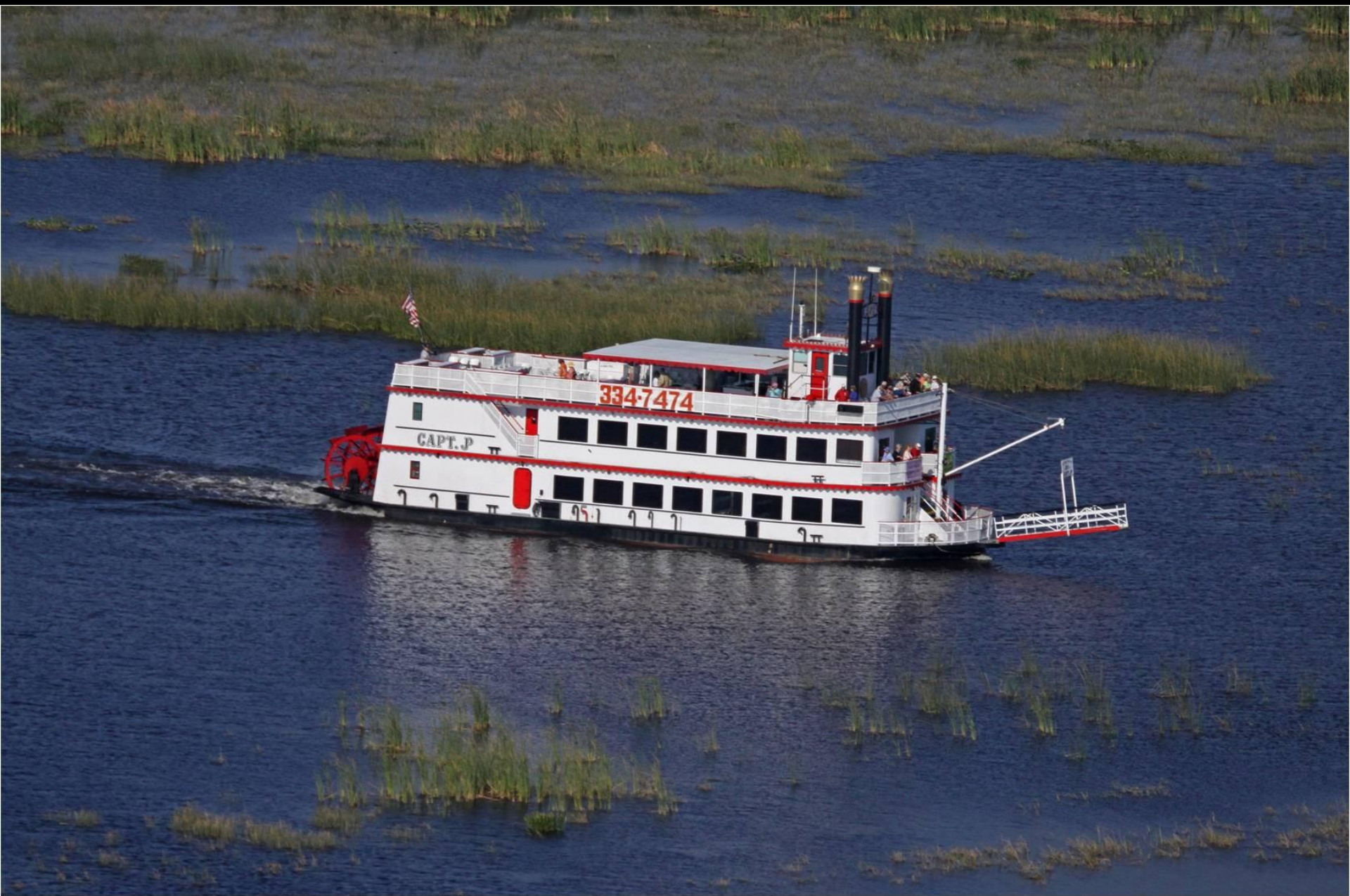
Sightseeing boat, Lake Okeechobee, March 2011