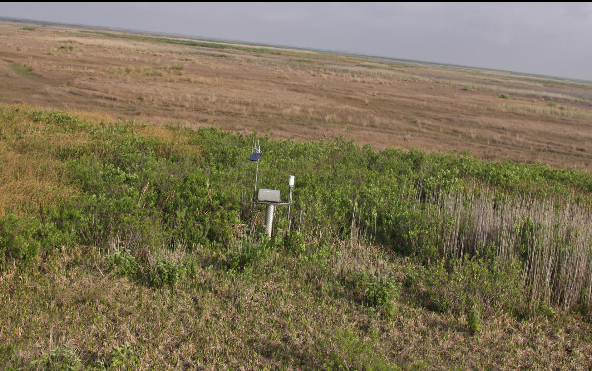
Dry water stage gauge, Lake Okeechobee, March 2011