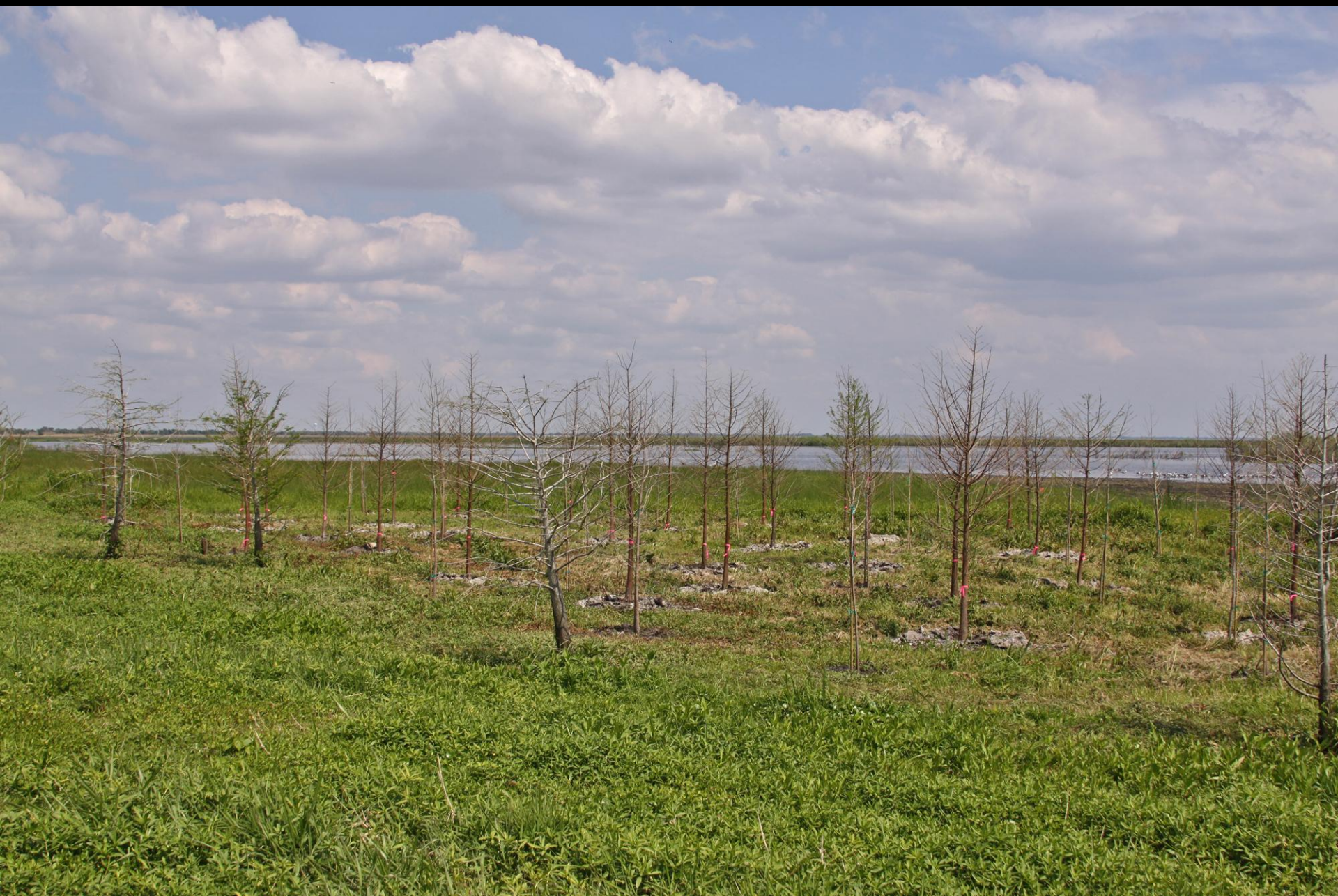
Cypress planting west of the Okeechobee pier, Lake Okeechobee, March 2011