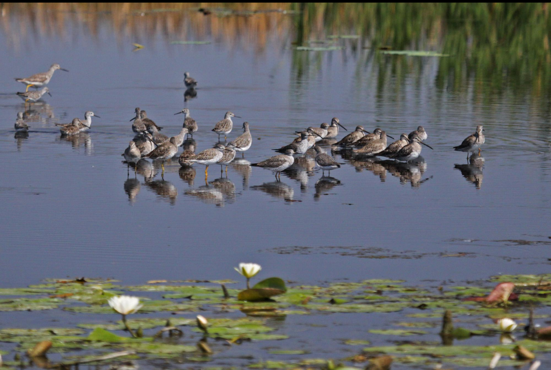
Shore birds, Lake Okeechobee, March 2011