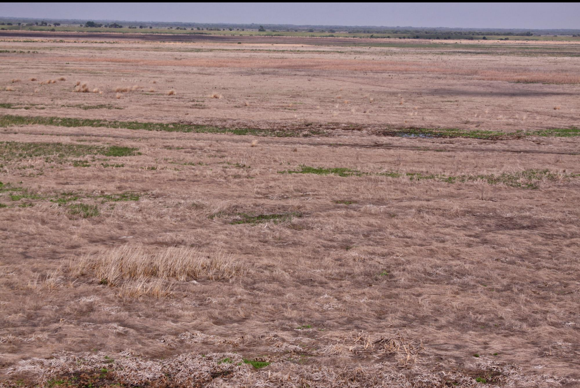
Dry marsh north of the Indian Prairie Canal, Lake Okeechobee, March 2011