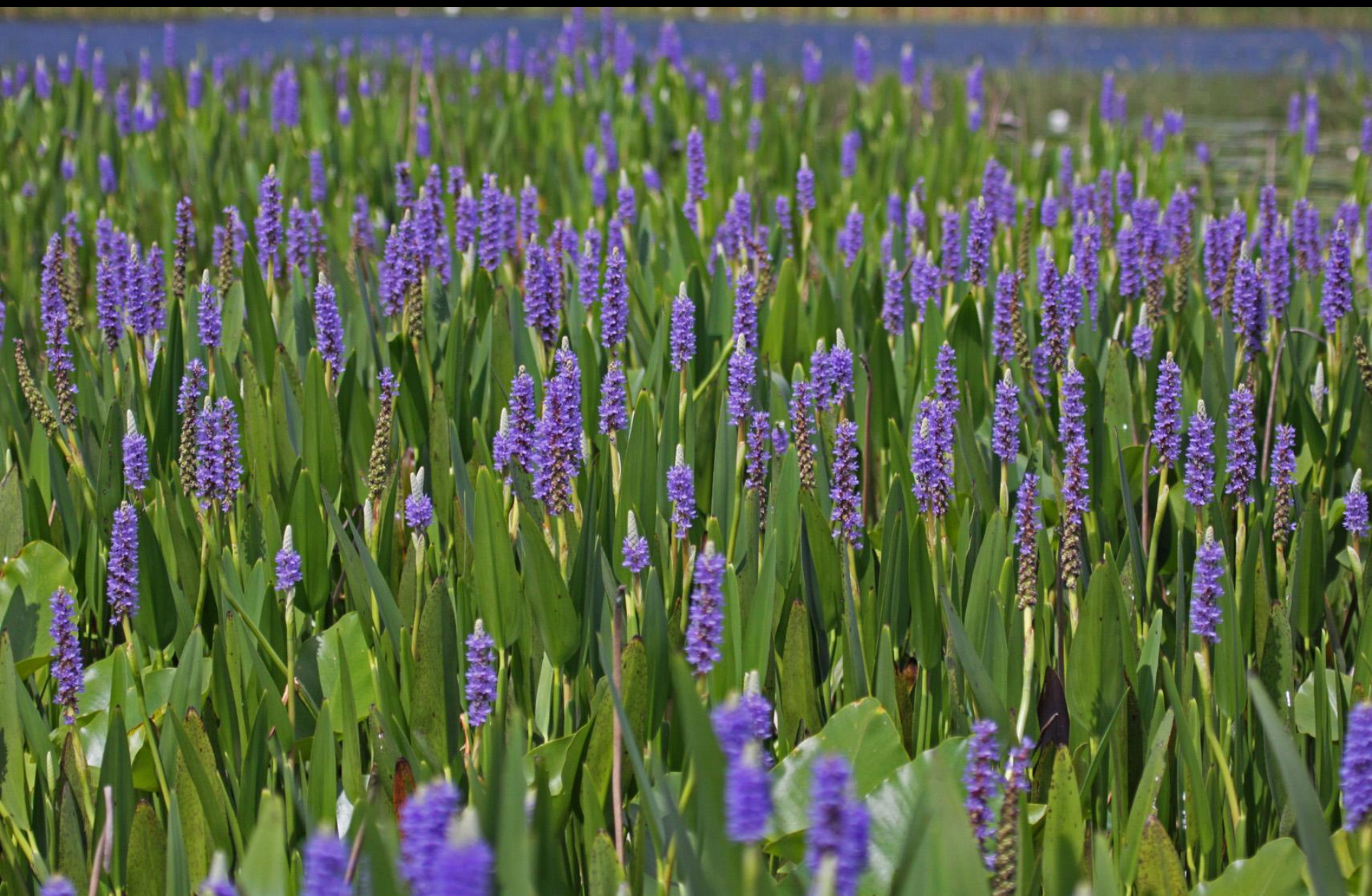
Pickerelweed ( Pontedaria ), Lake Istokpoga, March 2011