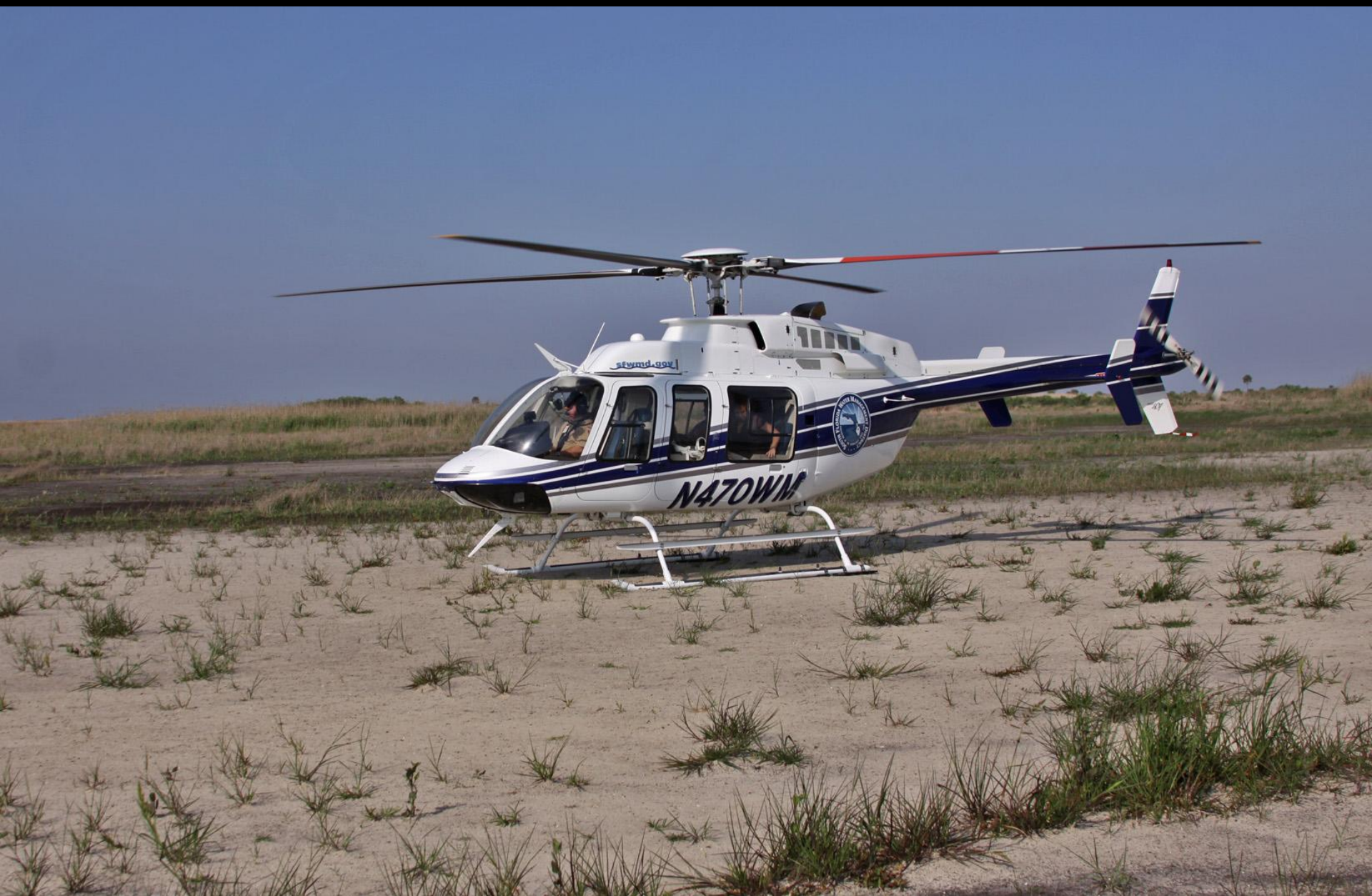
Vegetation mapping crew lands in a dry Moore Haven Marsh, Lake Okeechobee, March 2011