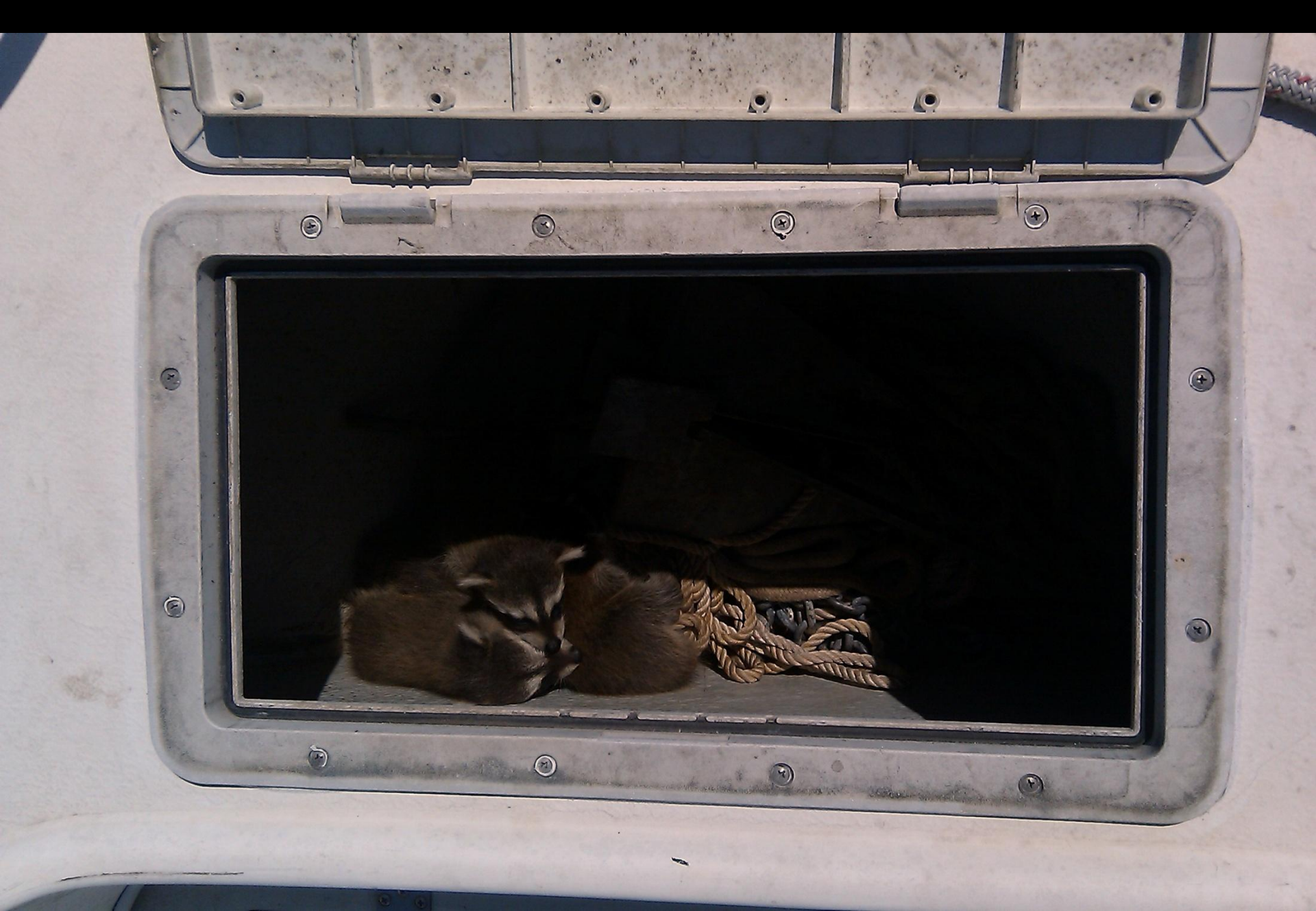
Young raccoons hiding out in the hatch, tired after an exciting adventure to the middle of Lake Okeechobee, March 2011