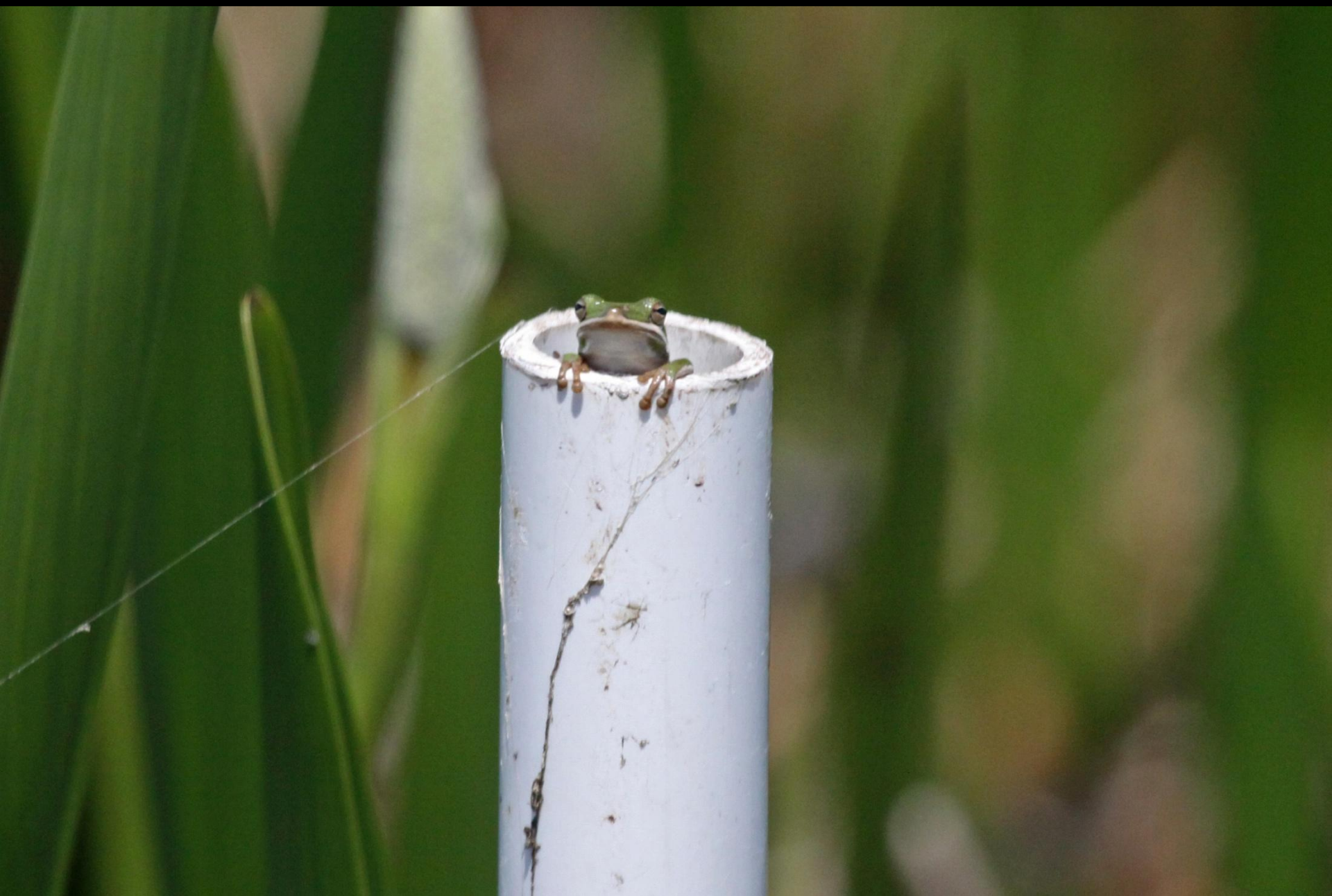
Tree Frog, Lake Istokpoga, March 2011