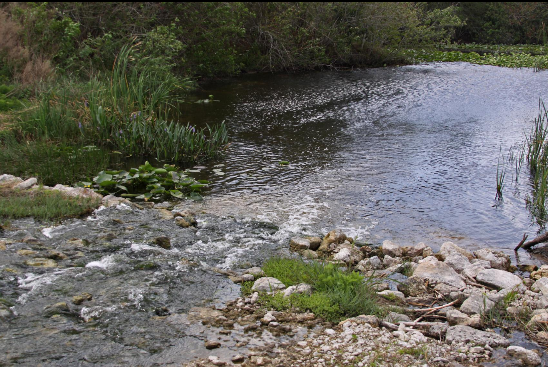
Outflow, Lemkin Creek Wetland, March 2011