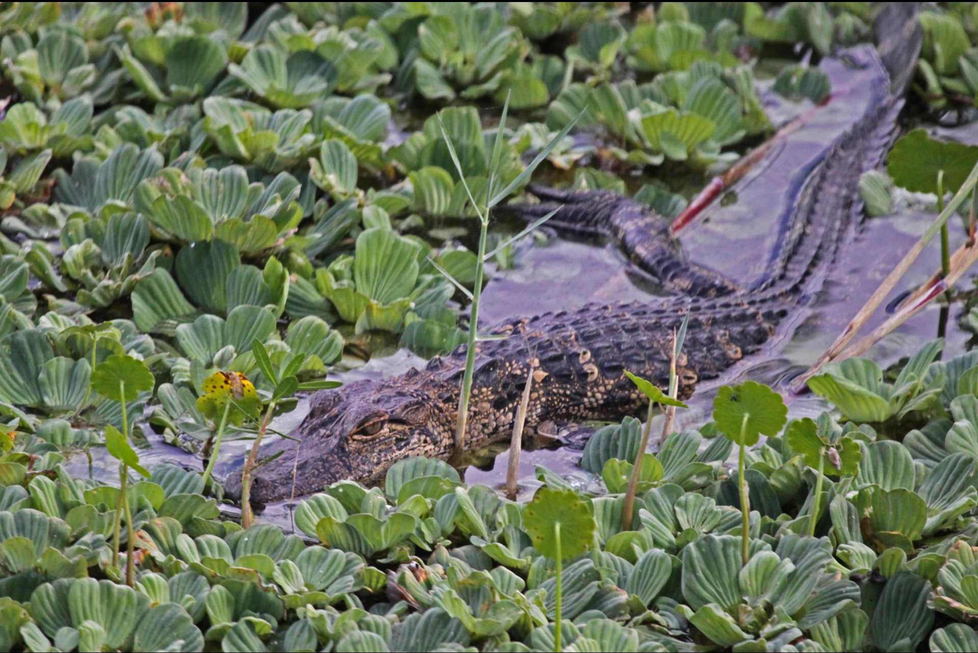
Baby gator in water lettuce ( Pistia ), Lake Okeechobee, March 2011