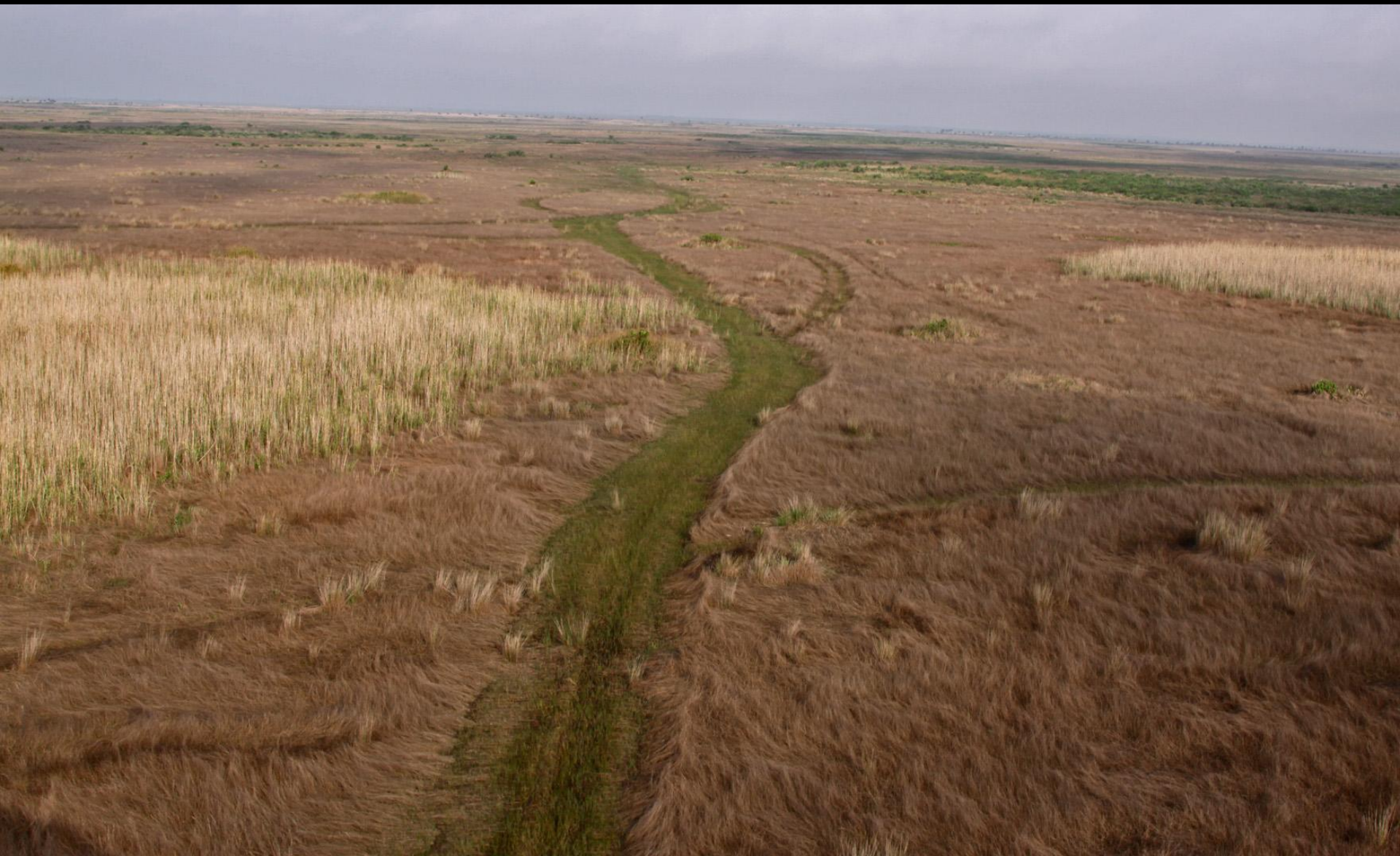
Dry boat trail in the Moore Haven Marsh, Lake Okeechobee, March 2011