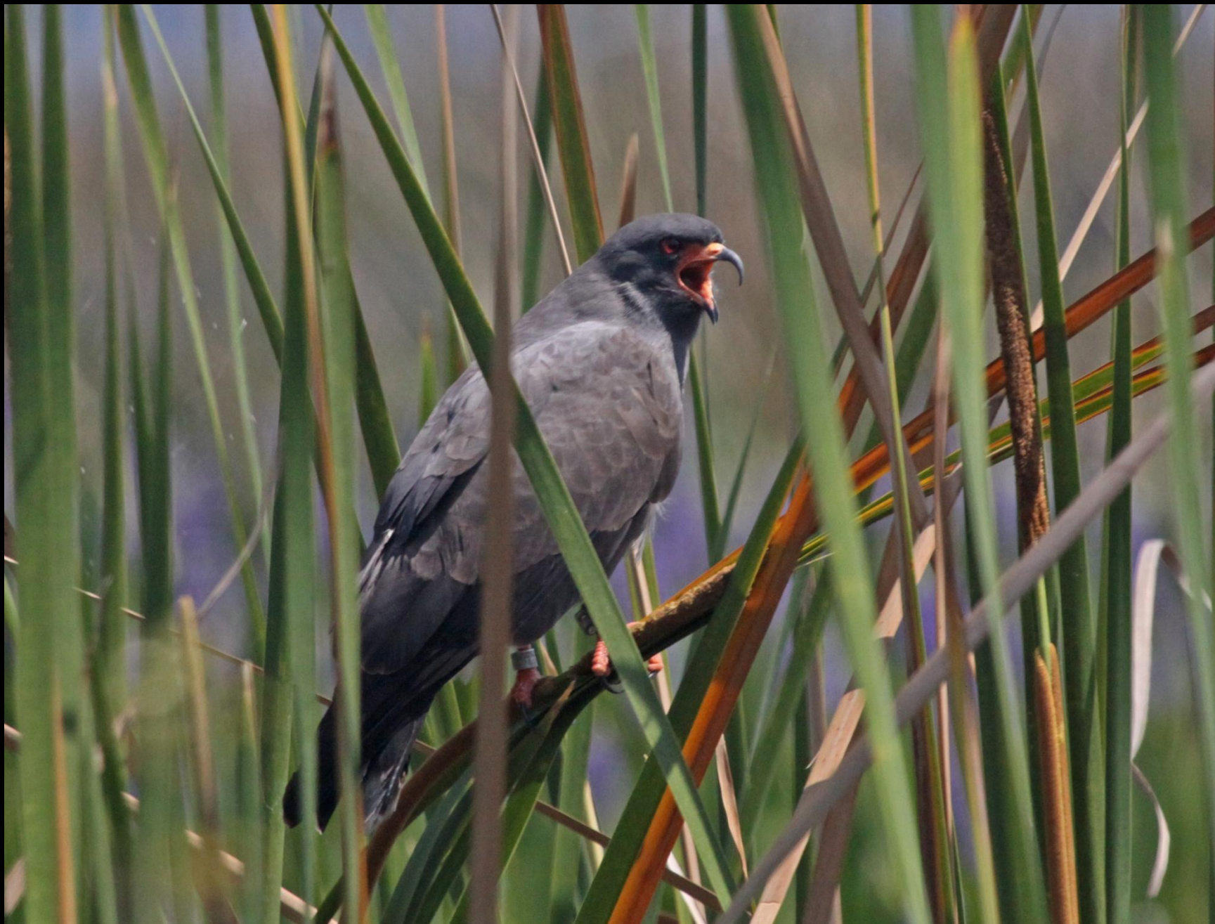
Male Snail Kite, Lake Istokpoga, March 2011