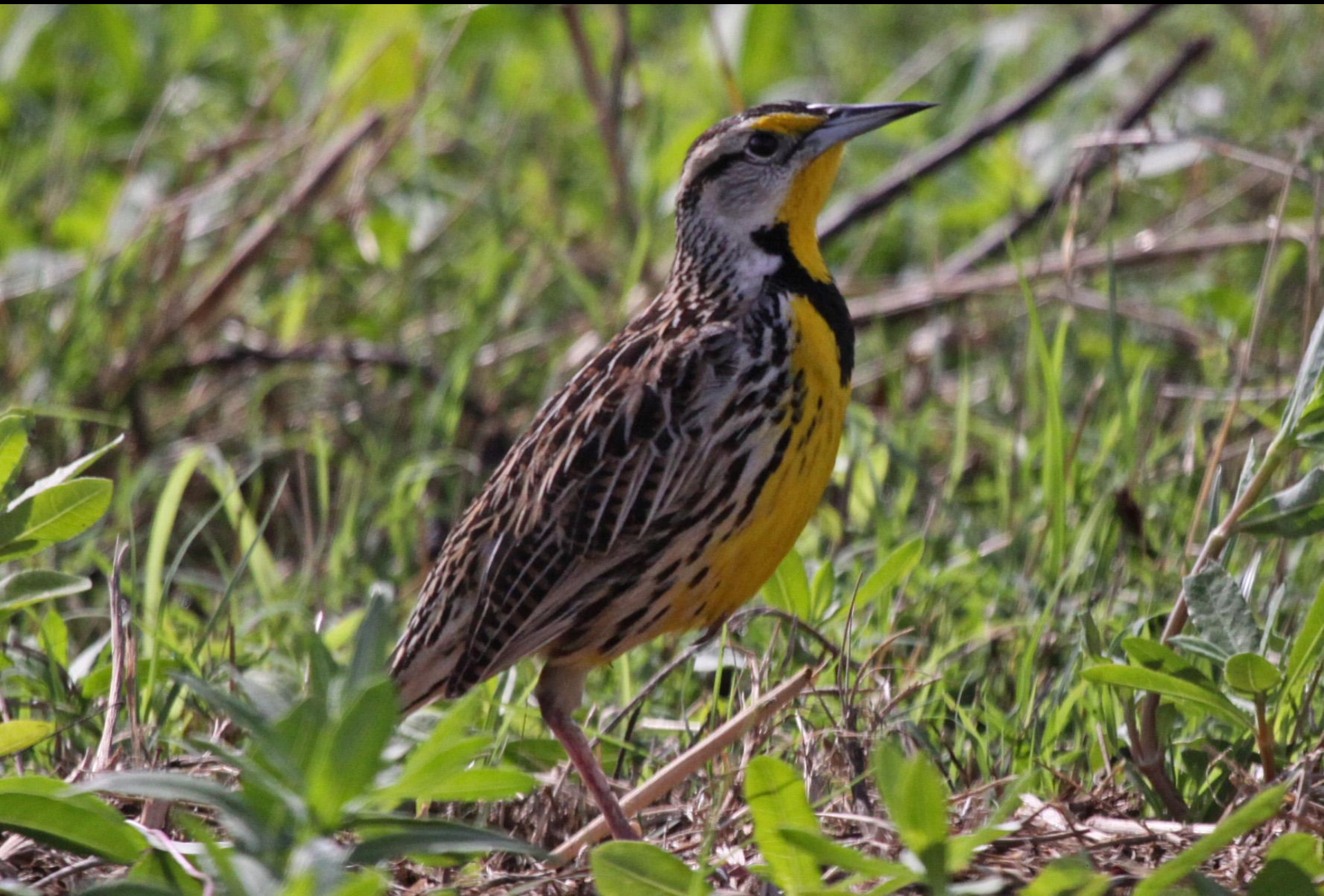
Eastern Meadowlark, Lake Okeechobee, March 2011