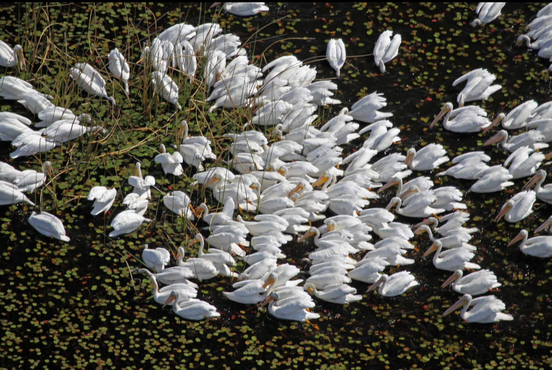
White Pelicans, Lake Okeechobee, March 2011