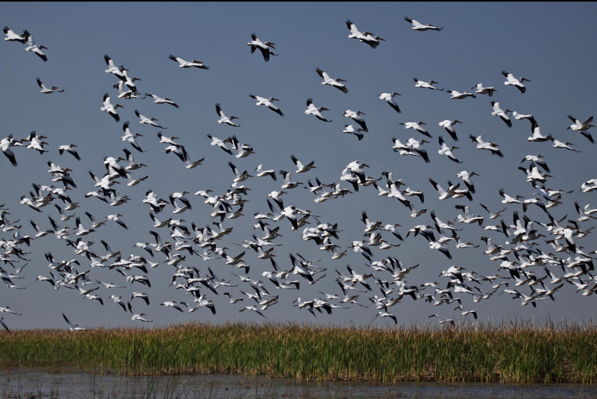
White Pelicans, Lake Okeechobee, March 2011