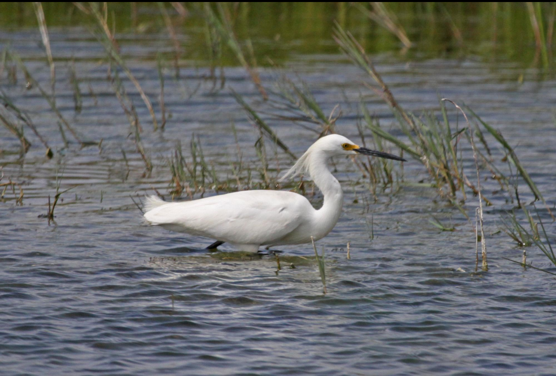
Snowy Egret, Lemkin Creek Wetland, March 2011