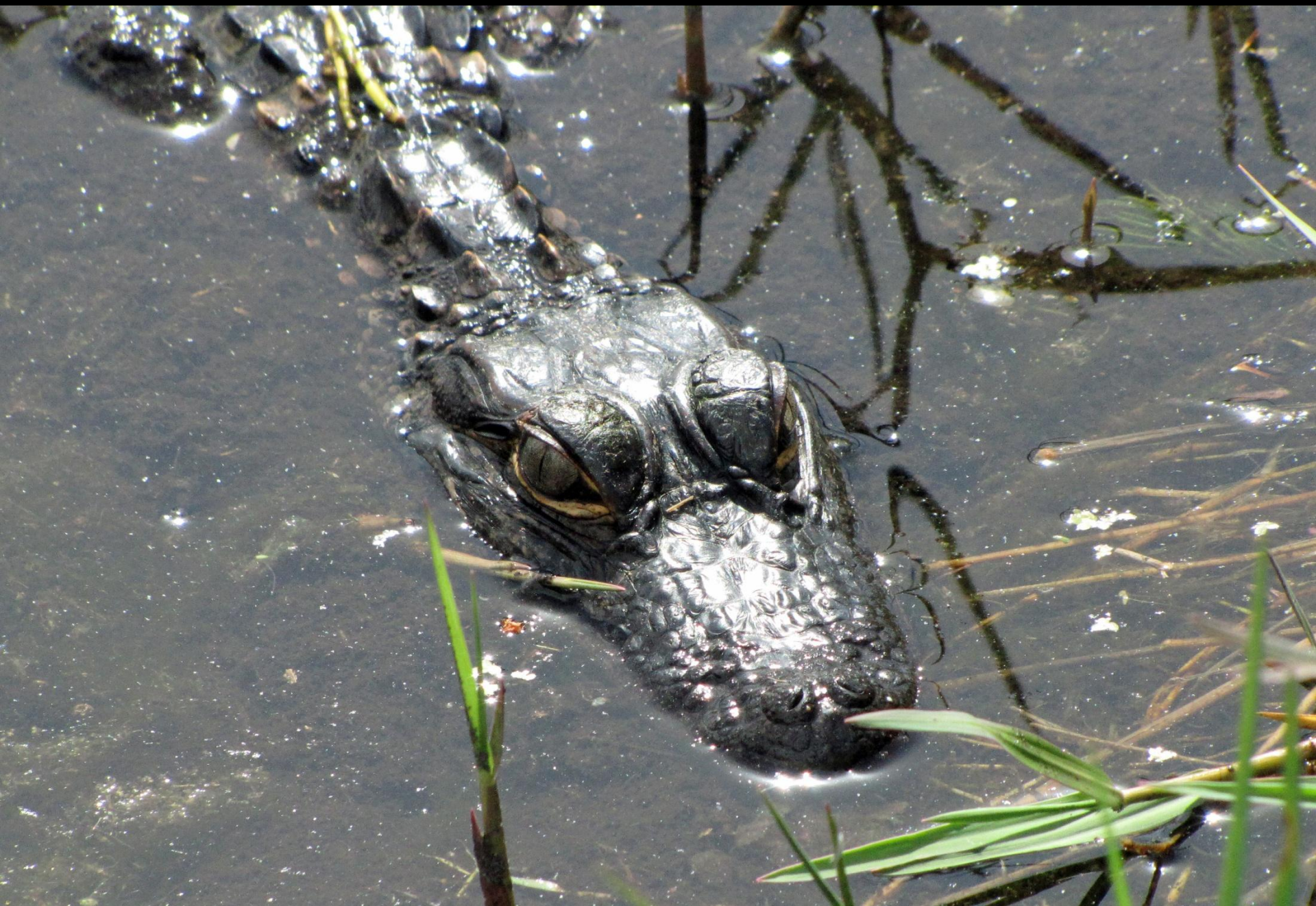
Young gator, Lemkin Creek Wetland, March 2011