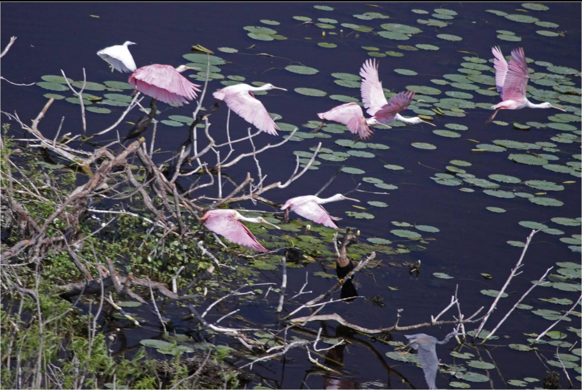
Roseate Spoonbills, Lake Okeechobee, March 2011