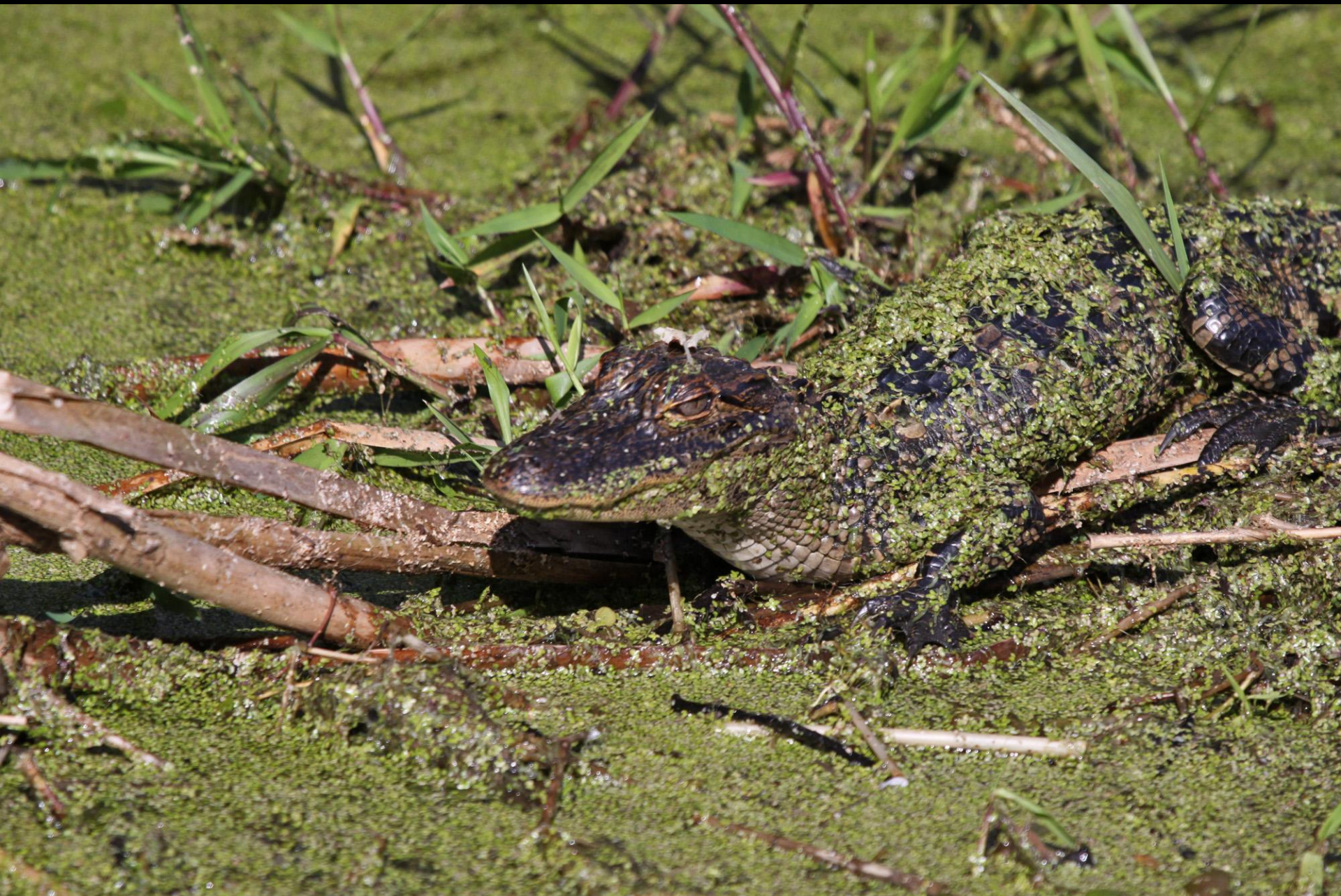
Baby alligator in duck weed ( Lemna ), Lake Istokpoga, March 2011