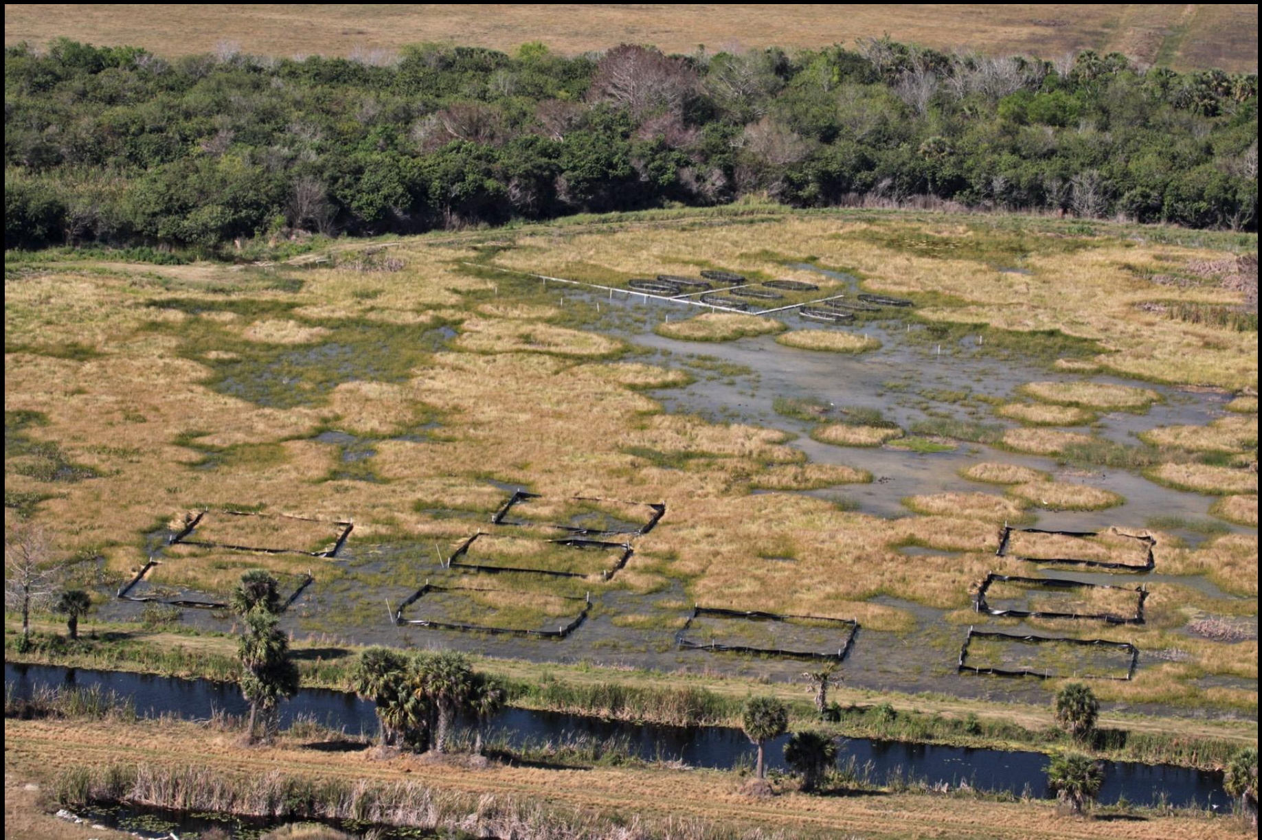
An aerial view – native Apple Snail stocking density experiment enclosures (foreground) and breeding enclosures and boardwalks (background). Lemkin Creek, February 2012