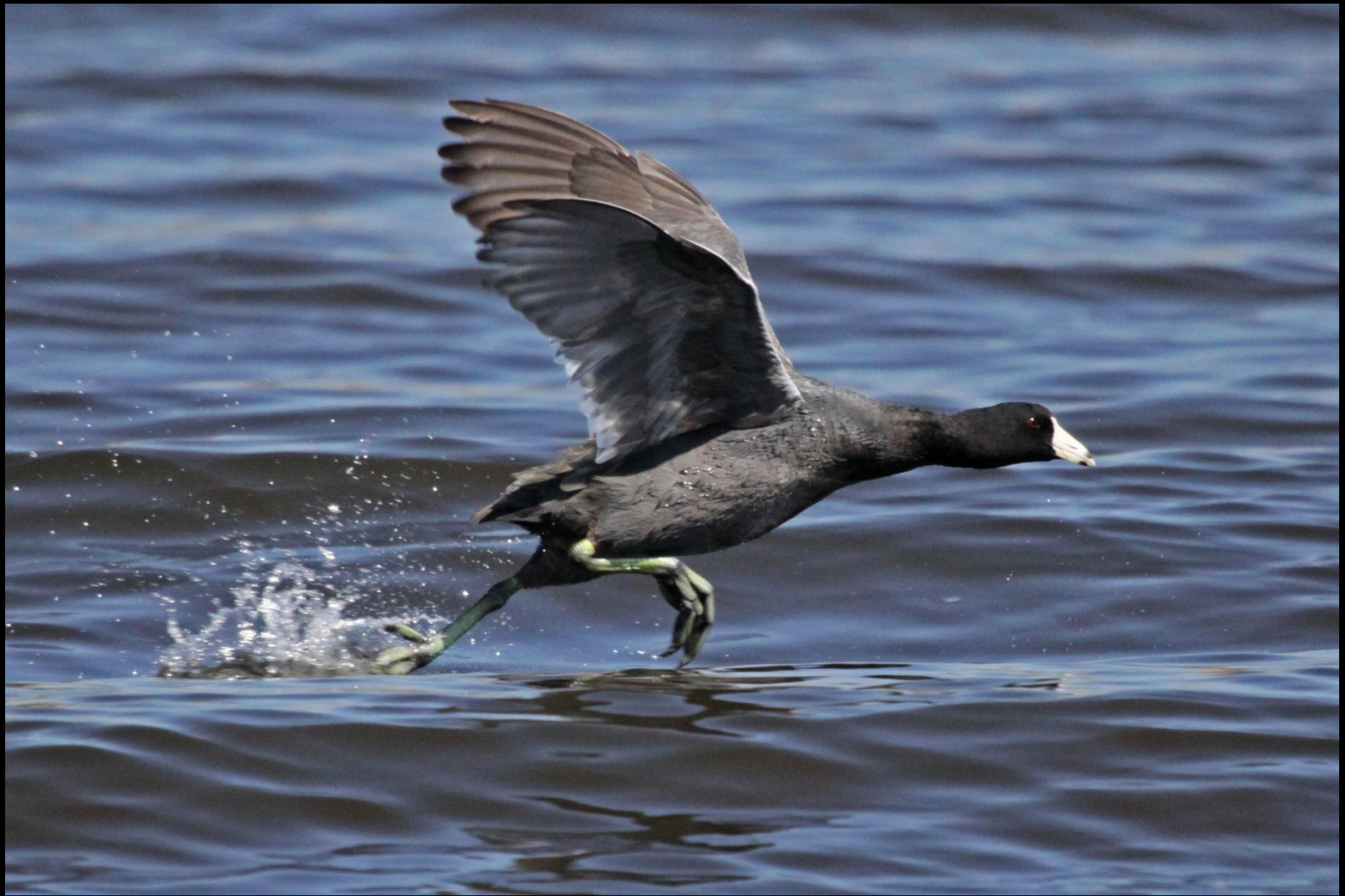
An American Coot scampers for cover. Lake Okeechobee, February 2012