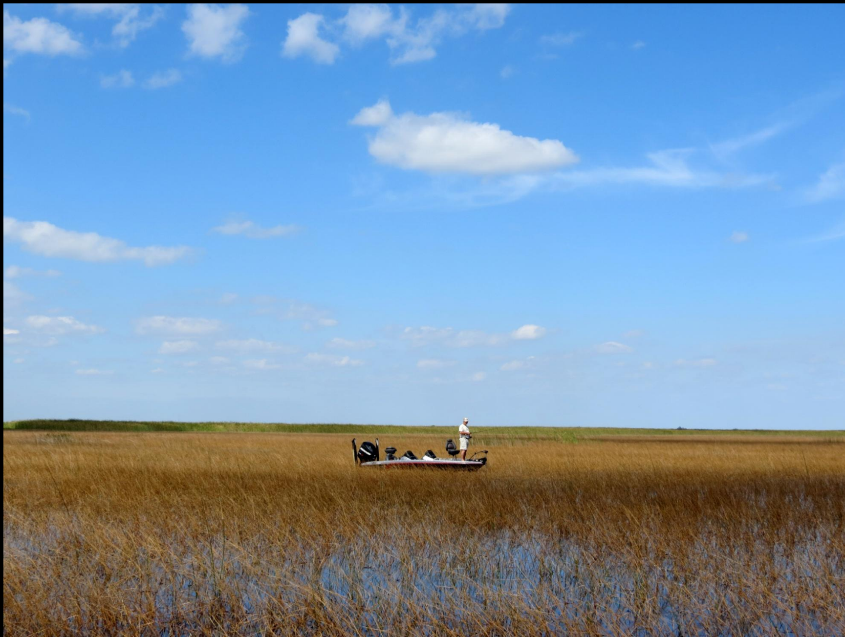
Fisherman, Fisheating Bay Lake Okeechobee, February 2012