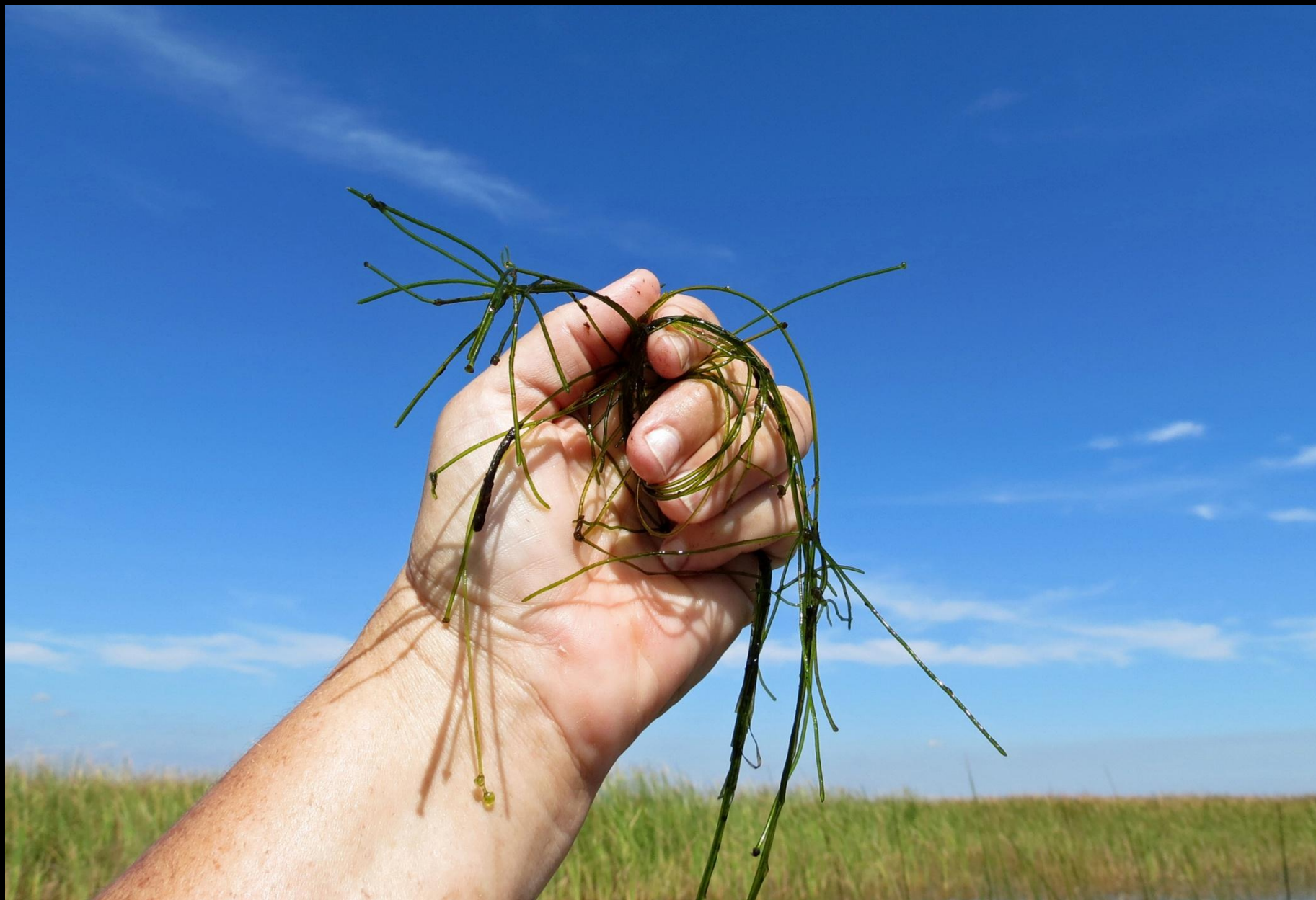
The SAV Nitella ( Nitella spp. ), which is actually an alga, has a unique neon-green tubular appearance. Lake Okeechobee, February 2012