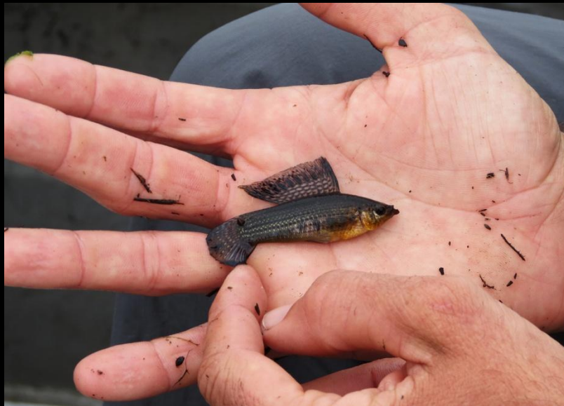
Sailfin Molly ( Mollienisia latipinna )