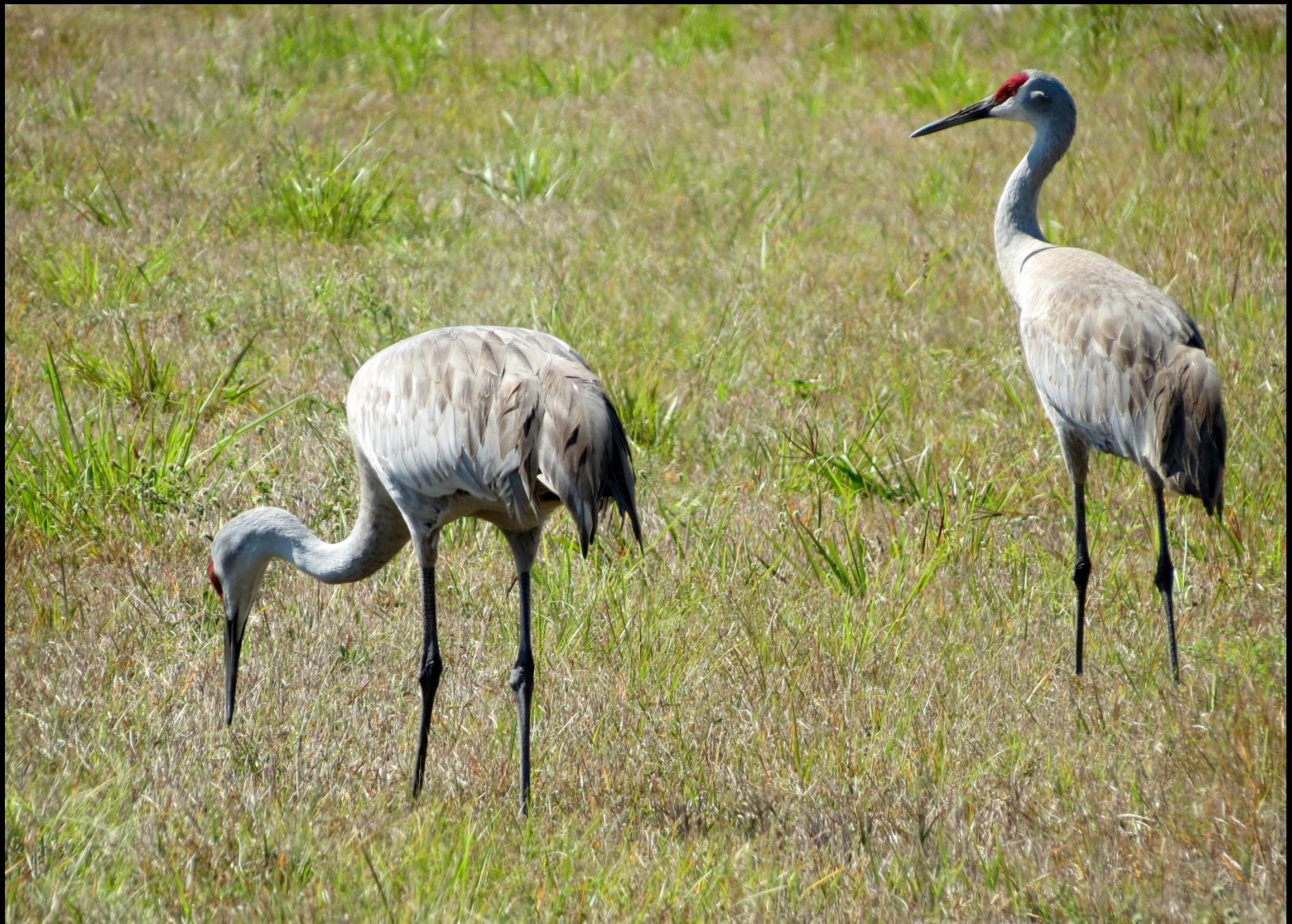
Sandhill Cranes ( Grus canadensis ). Lemkin Creek, February 2012