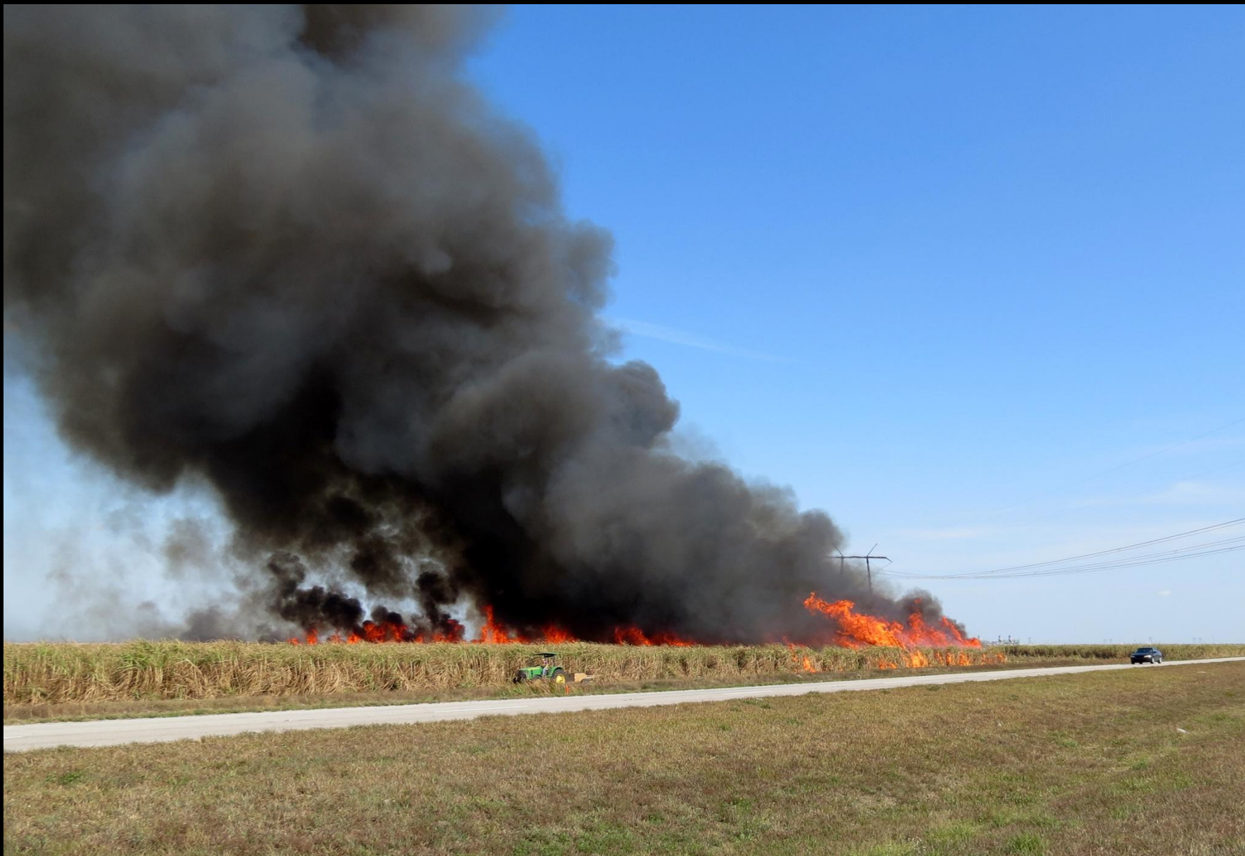
A sugarcane burn south of Lake Okeechobee. Controlled burns are used to remove leaves before harvesting. February 2012