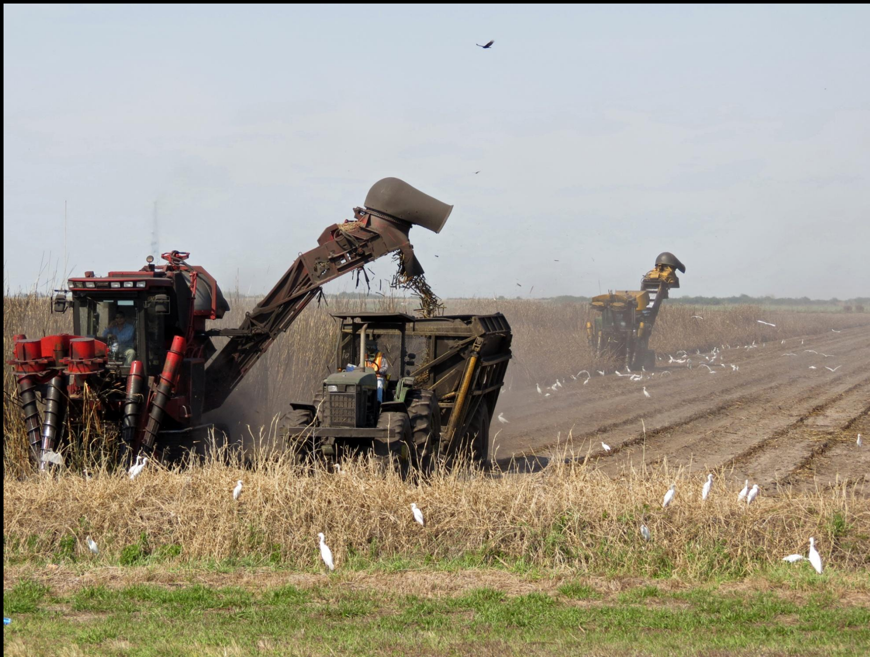
Harvesting sugarcane south of Lake Okeechobee. February 2012