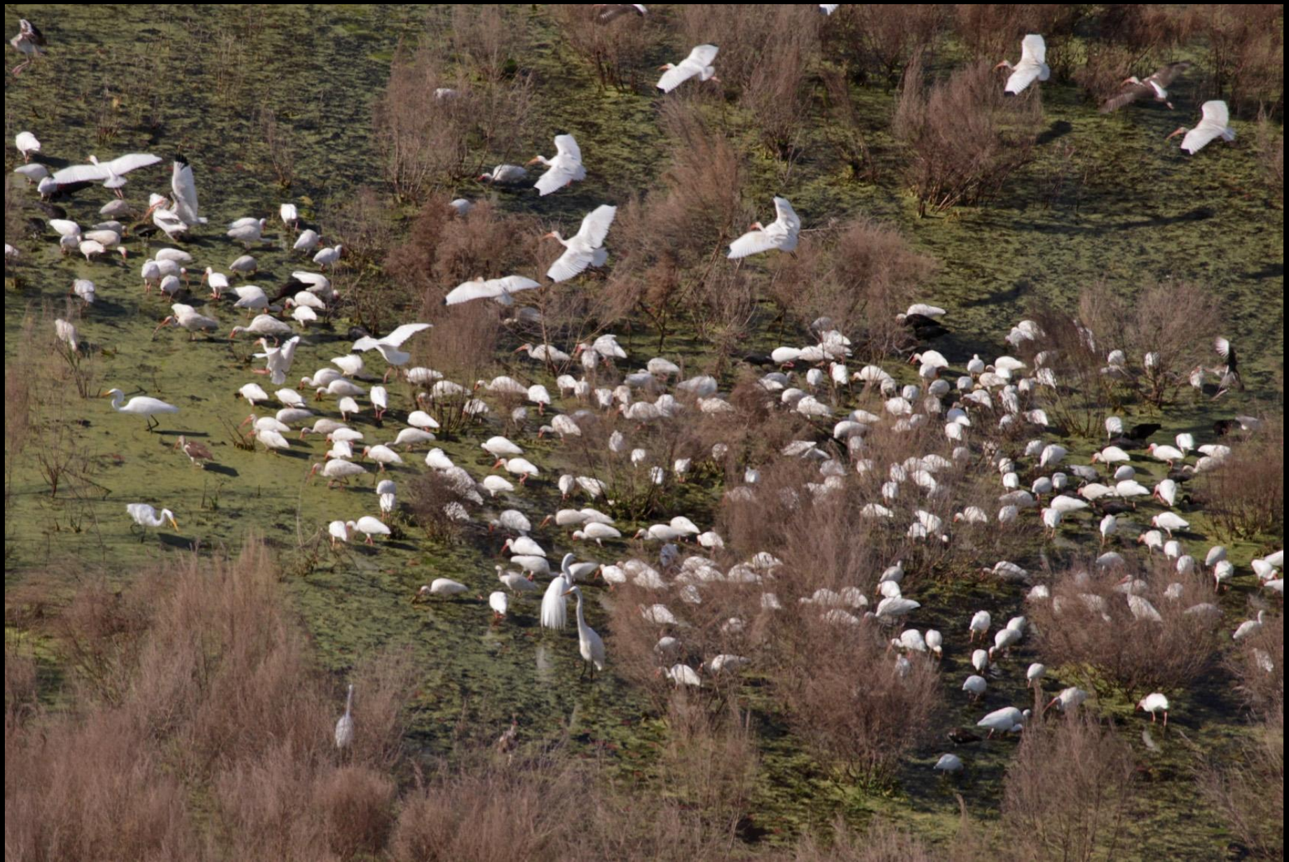
Wading birds (mostly White Ibis ( Eudocimus albus )). Lake Okeechobee, February 2012