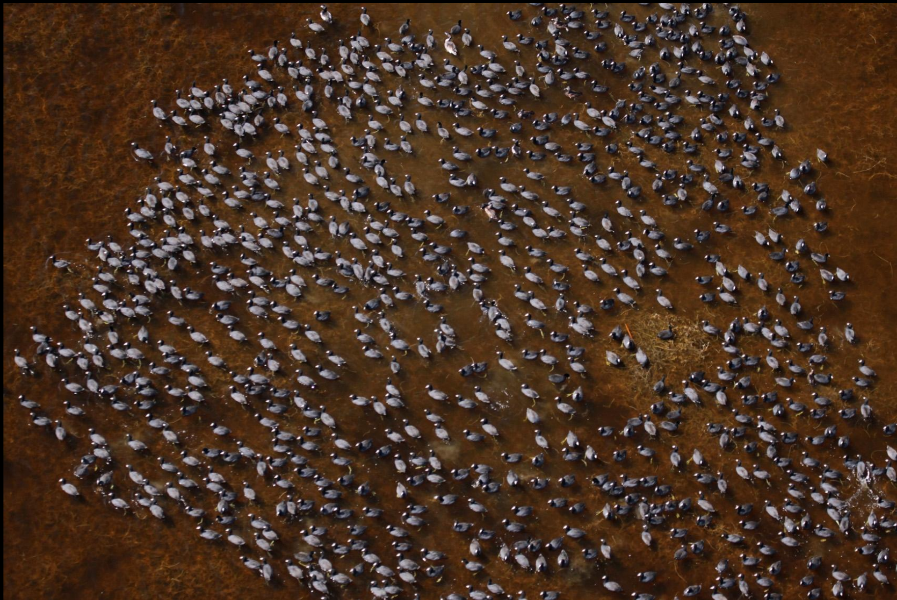
More Coots spotted during a wading bird survey flight. STA 1E, February 2012