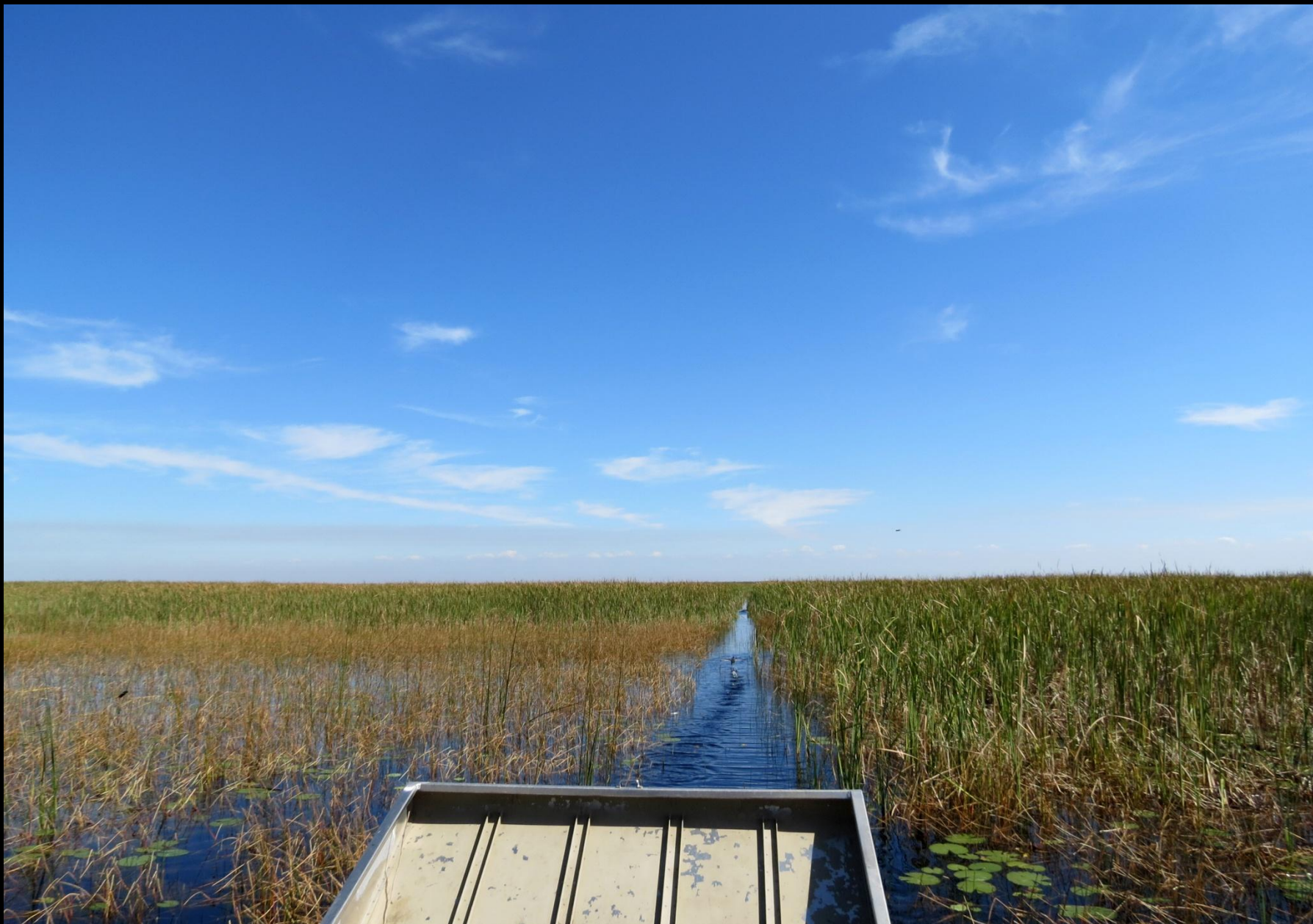
Following a Coot ( Fulica americana ) down an airboat trail. Lake Okeechobee, February 2012