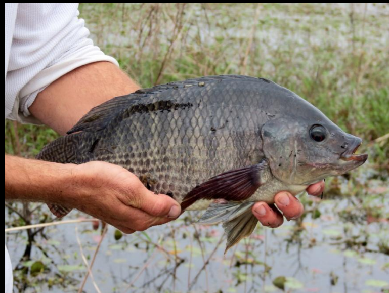
Blue Tilapia ( Poreochromis aureus )