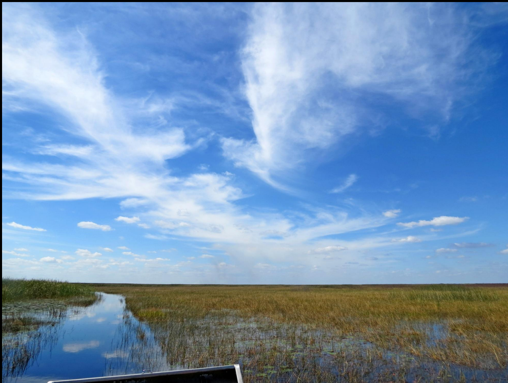
"Mare's tails" clouds over Fisheating Bay Lake Okeechobee, February 2012