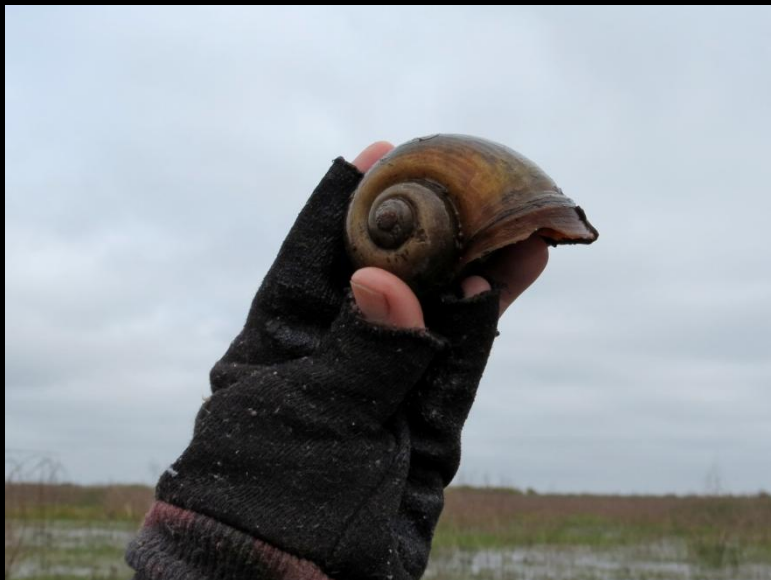
Exotic Apple Snail ( Pomacea insularum )