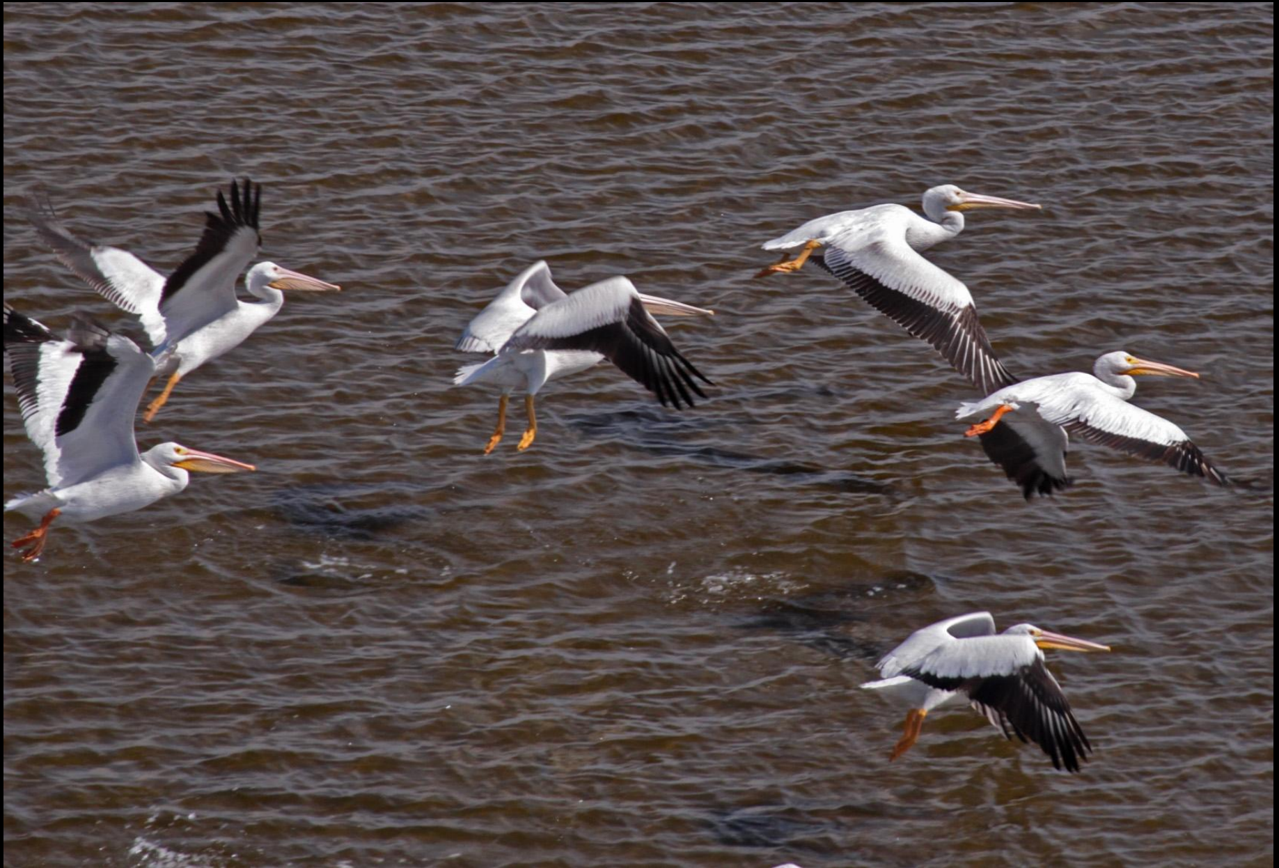
White Pelicans ( Pelicanus erythrorhynchos ) Lake Okeechobee, February 2012