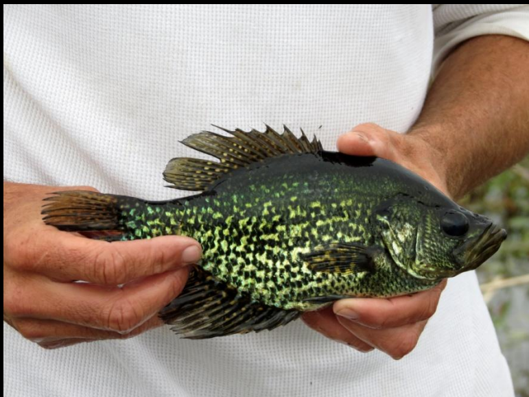
Black Crappie ( Pomoxis nigromaculatus )