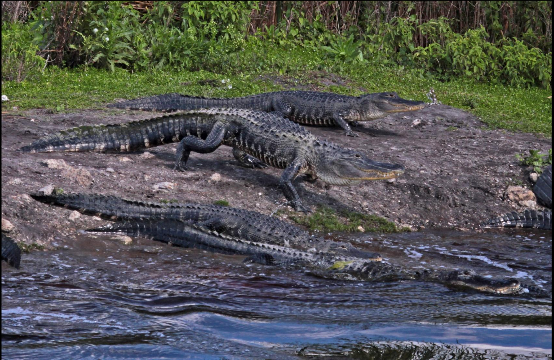
American Alligators, ( Alligator mississippiensis ) STA 1E, February 2012