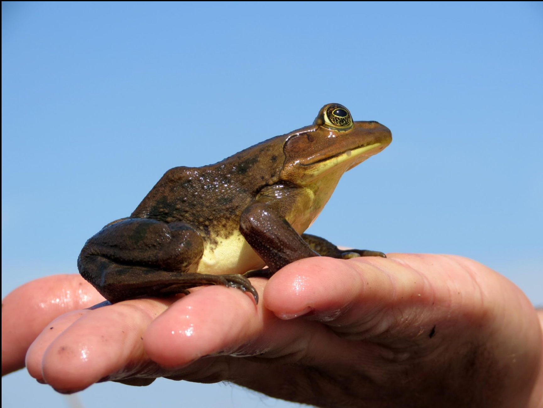
Pig Frog ( Lithobates (Rana) grylio ), caught in the herpetofauna traps near Dyess Ditch. Lake Okeechobee, February 2012