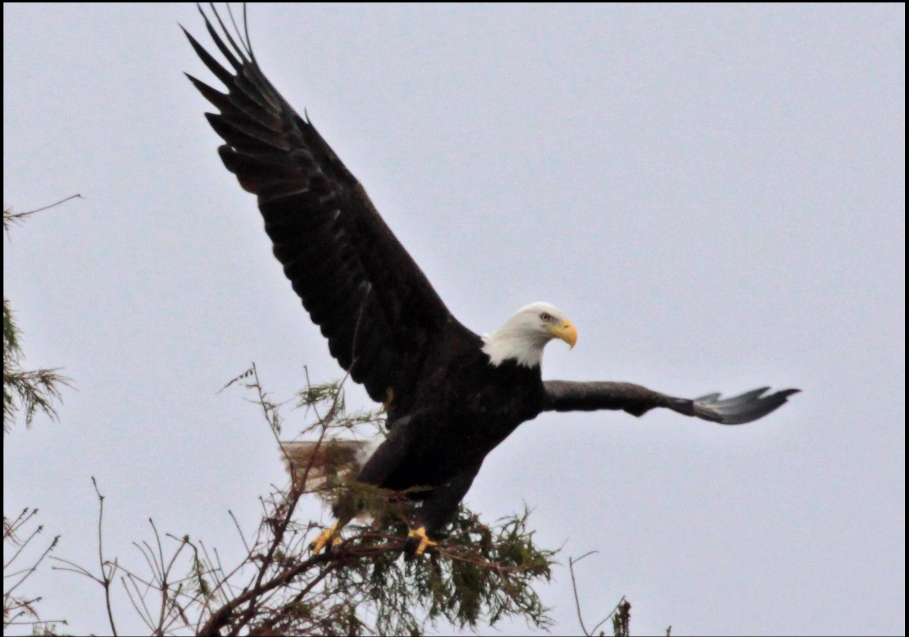
Bald Eagle ( Haliaeetus leucocephalus ). Lemkin Creek, February 2012