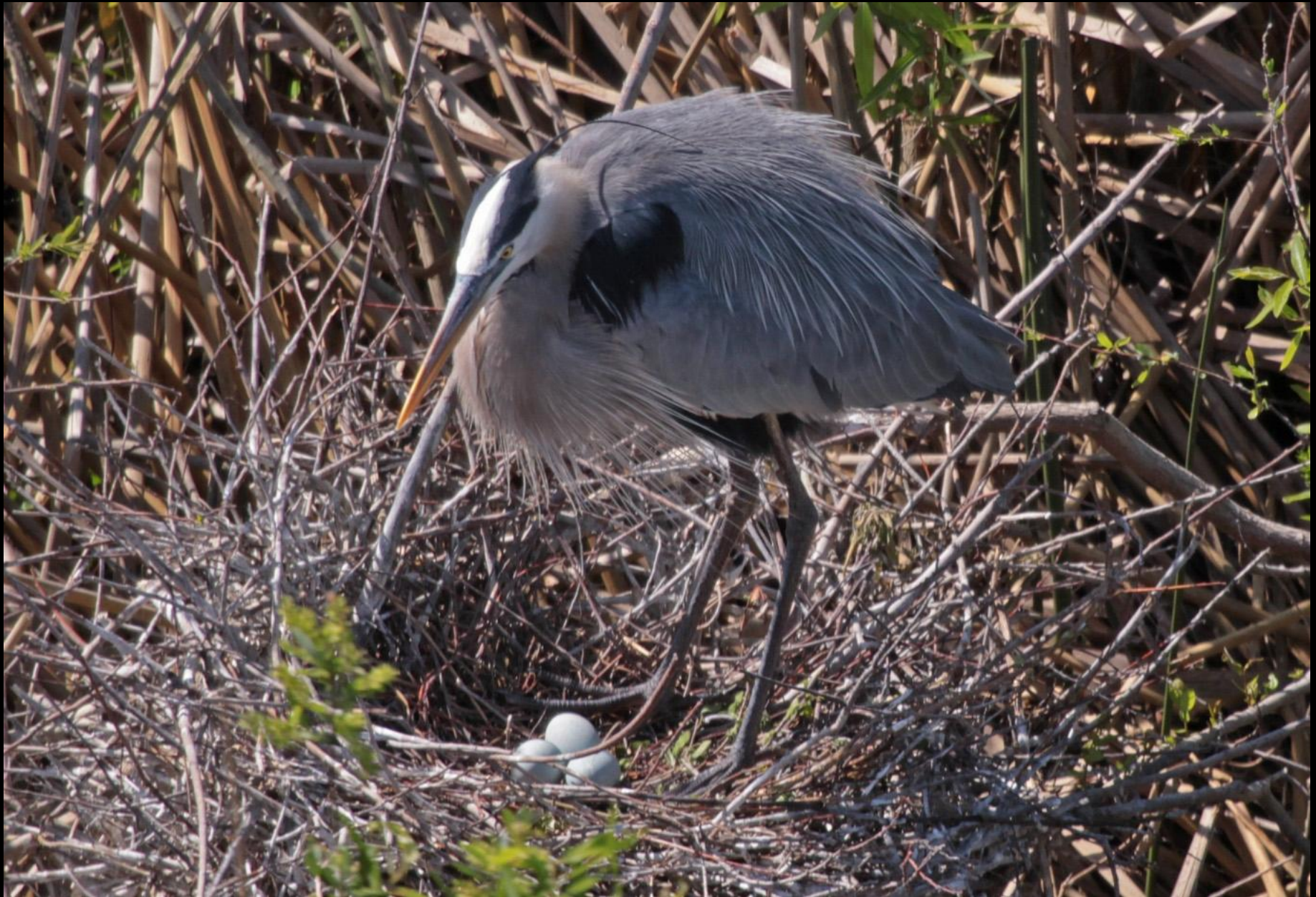
A Great Blue Heron ( Ardea herodias ) nest in the marsh. Lake Okeechobee, February 2012