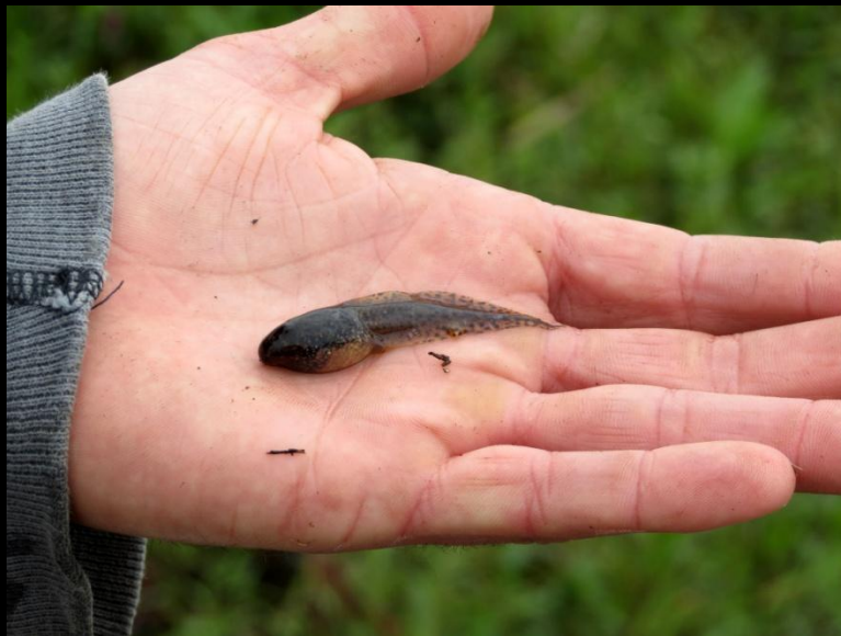
Leopard Frog tadpole ( Lithobates (Rana) sphenocephalus )

Some of the creatures caught in the Pearce Canal herpetofauna traps.