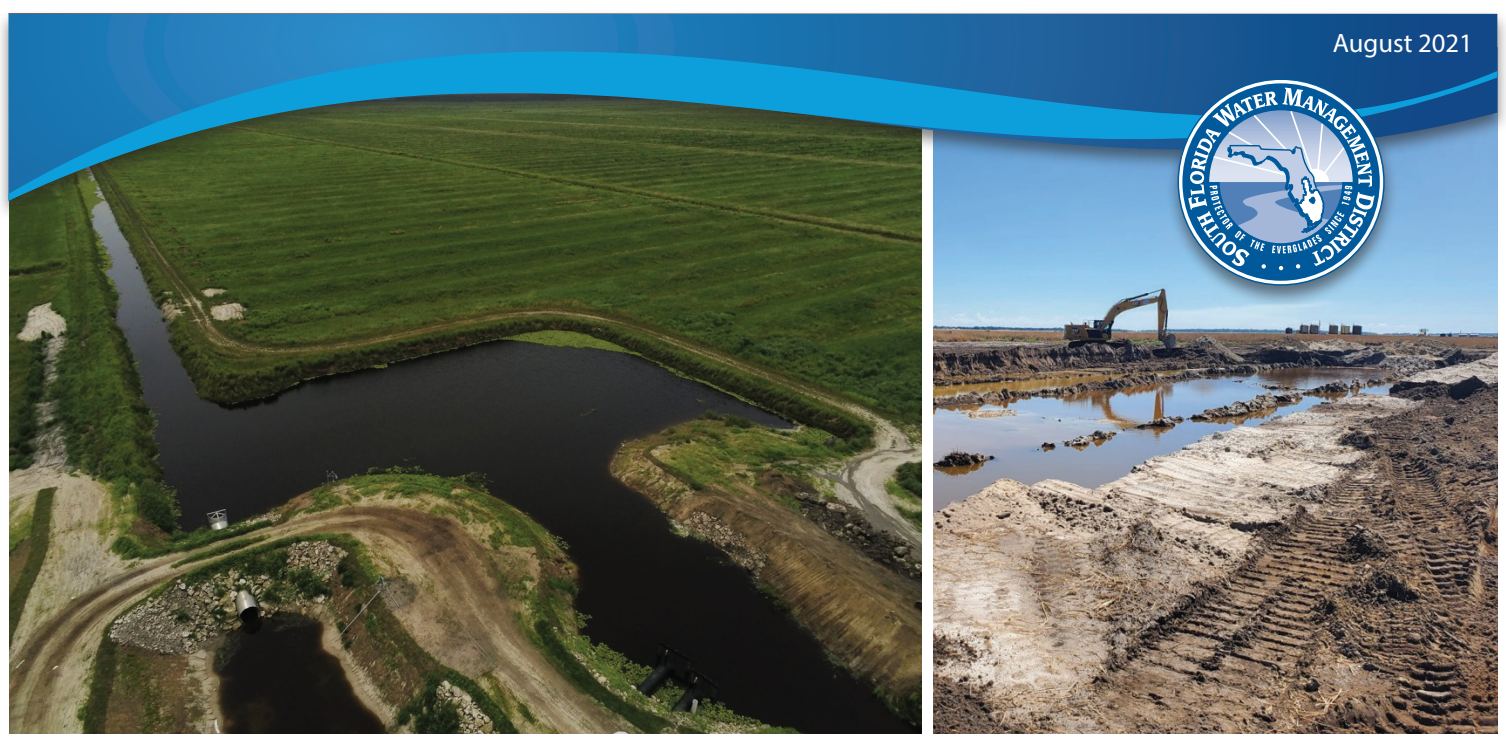
Excavating Fill Materials for Internal Berms - February 2021