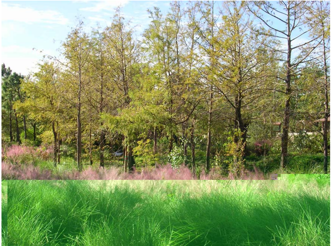
Muhly grass in bloom along DuPuis habitat trail