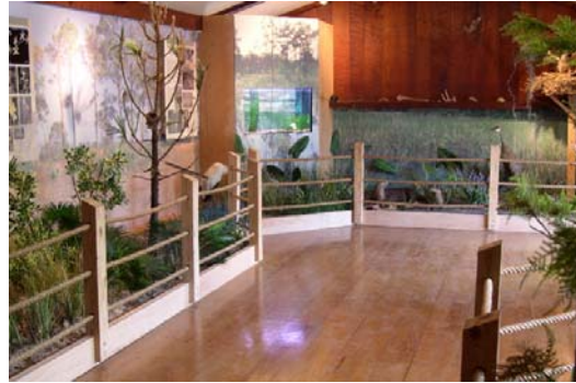
One of the indoor Display areas at the Visitor Center

At the westernmost end of the property, Gate 5 is the entrance to the DuPuis offices and visitors' center. It is nearly a mile to the west of Gate 3. The center is now open most Saturdays from 9 a.m. to noon. Even when the center is closed, you may still enjoy the property by entering at Gates 1, 2 or 3. Ample parking is behind the center.