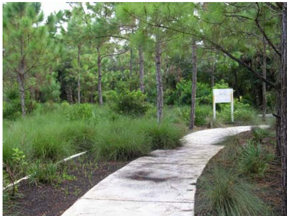
Handicapped accessible concrete section DuPuis habitat trail.