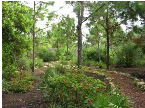
Mulched portion DuPuis habitat trail.