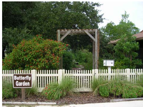
Butterfly Garden at DuPuis

Just outside the backdoor, you will find a butterfly garden and on the east side of the center is a newly constructed interpretive wetland and cypress forest with concrete and mulched trails.