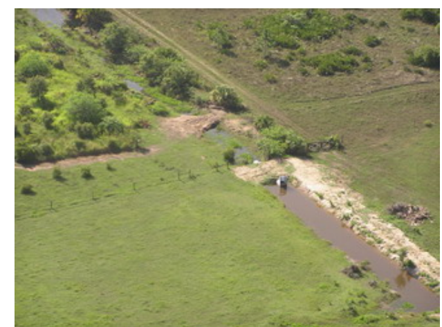
Culverts with risers for water management and with mud boards for sediment control