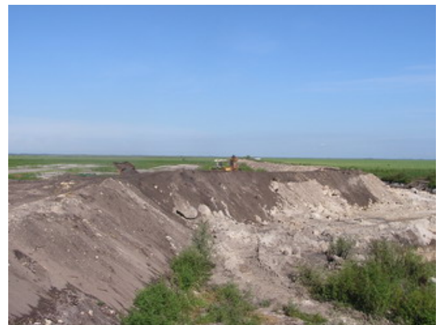
Completed reservoir and dike construction in progress