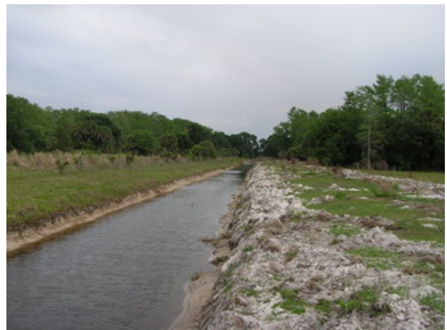
Figure 3. Project Photos