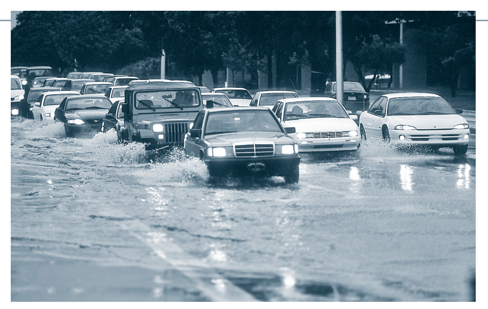
A road storm produces 4 to 6 inches of rainfall in a 24-hour period. Due to our unique climate and geography, standing water is normal and can be expected after a heavy rainfall.

property can transport excess nutrients from fertilizers or animal wastes, herbicides, pesticides, oil, gasoline or other substances that can pollute water and cause problems downstream. Wetlands are vital natural resources protected by the state. They provide for wildlife habitat, flood protection, groundwater recharge, and water quality benefits.