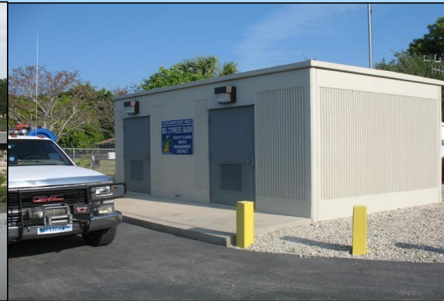
Control room for Cocohatchee Structure 1