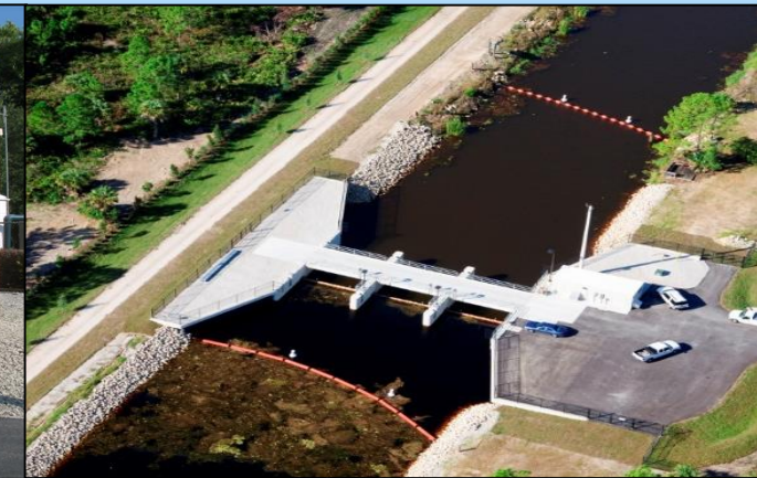
Golden Gate Structure 3 (GG3)