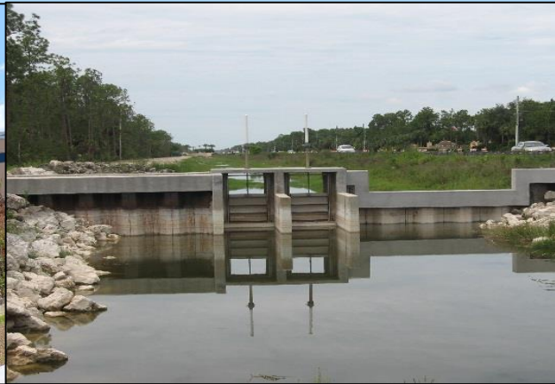
Henderson Creek Structure 2