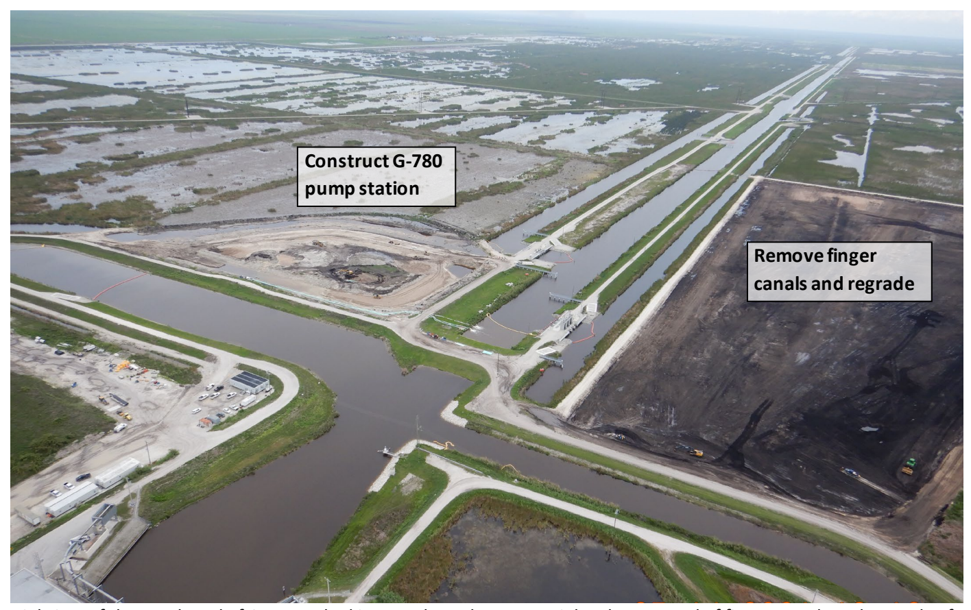
Aerial view of the south end of STA-1W, looking north. In the center right, the removal of finger canals and regrade of 50 acres in Cell 3. In the center left, the ongoing construction of G-780 pump station for Expansion No. 2.