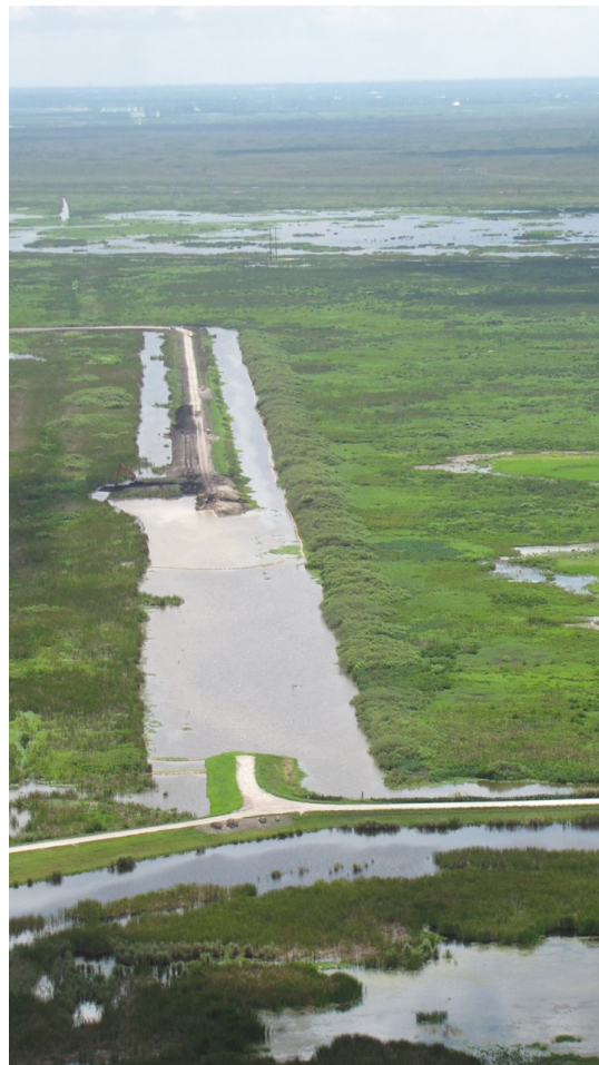
STA 1W Refurbishment project to remove the old 5B southern levee in STA 1W.