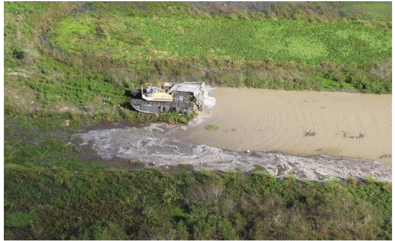
Aerial view of STA-1E Cell 6 refurbishments. Photo illustrates degrade of remnant farm berms using an amphibious excavator that digs up the berm material and drops it into the adjacent ditch as it advances backward (to the left).