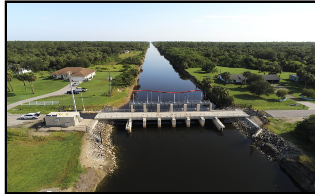
Faka Union #4