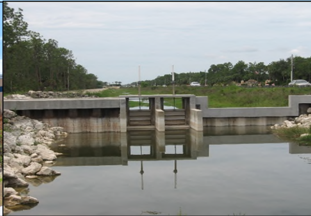
Henderson Creek Structure 2