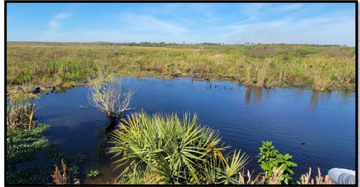
Corkscrew Swamp Sanctuary Restoration