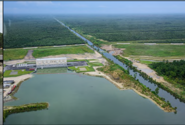
Faka Union Pump Station