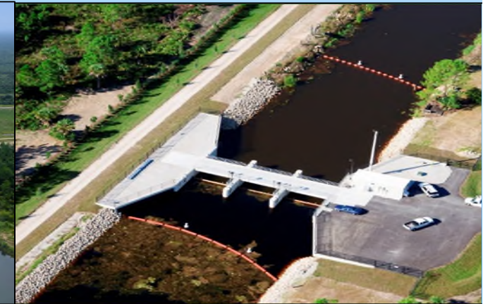
Golden Gate Structure 3 (GG3)