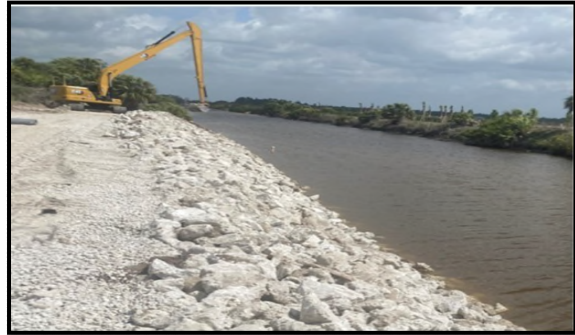
Faka Union Canal Bank Repair