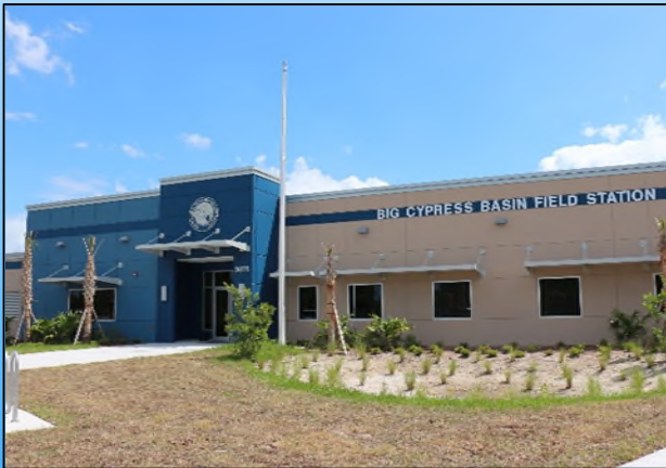
Big Cypress Basin Field Station