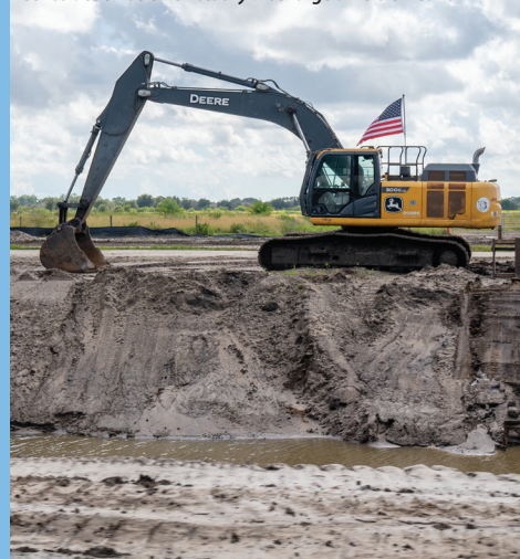
Construction at C-23 Estuary Discharge Diversion Canal

The South Florida Water Management District Governing Board's Adopted Budget is $1.342 billion for the 2025-2026 Fiscal Year. The budget continues to support Governor Ron DeSantis' Achieving Even More Now for Florida's Environment Executive Order 23-06 to advance Everglades restoration, protect our water resources, and improve water quality.