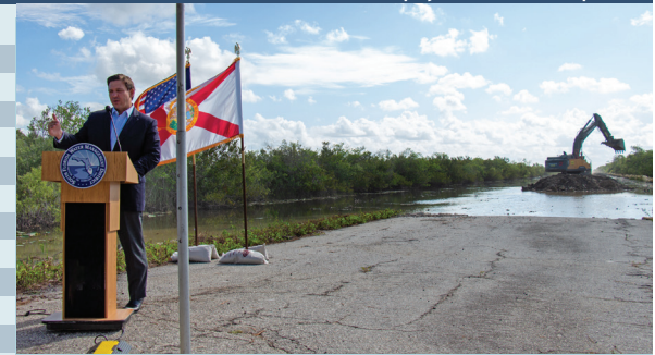
Gov. DeSantis at the Old Tamiami Trail Roadbed Removal Groundbreaking