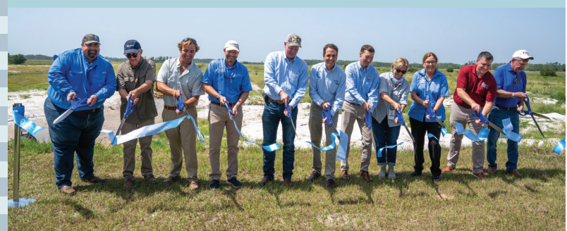
ALJO Four Corners Ribbon Cutting Ceremony