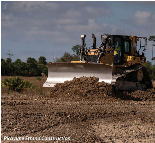
Picayune Strand Construction

The completed restoration of Picayune Strand State Forest and Kissimmee River restores important wetlands and recharges aquifers.