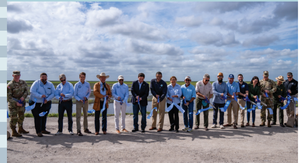
Ribbon Cutting Ceremony for the EAA Reservoir Project's Treatment Wetland