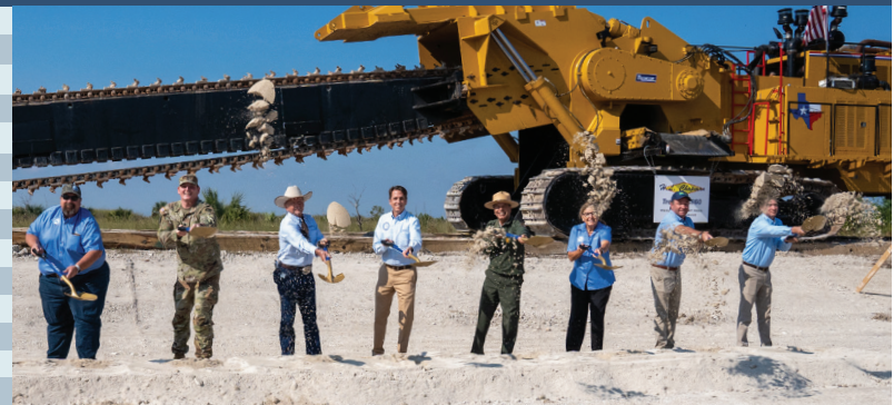
CEPP New Water Seepage Containment Wall Groundbreaking Ceremony