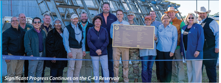
Significant Progress Continues on the C-43 Reservoir

A large above ground reservoir and aquifer storage and recovery (ASR) wells will assist in storing water north of Lake Okeechobee to manage Lake levels.