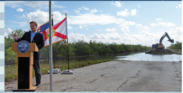
Gov. DeSantis at the Old Tamiami Trail Roadbed Removal Groundbreaking