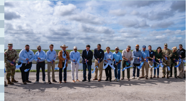
Ribbon Cutting Ceremony for the EAA Reservoir Project's Treatment Wetland