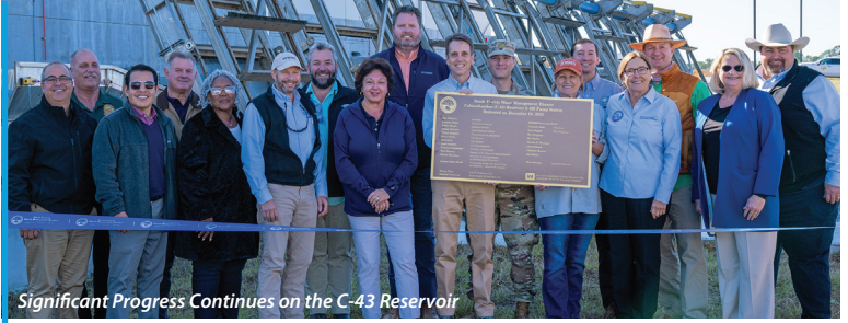
Significant Progress Continues on the C-43 Reservoir

A large above ground reservoir and aquifer storage and recovery (ASR) wells will assist in storing water north of Lake Okeechobee to manage Lake levels.