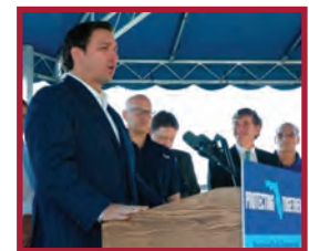
Gov. DeSantis signs Senate Bill 712.