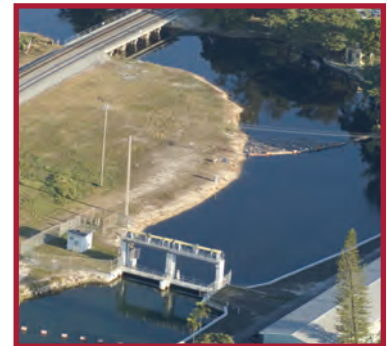
S-27 Structure Gate.

E. Coordinating with the Florida Department of Transportation to ensure it identifies and considers water quality and flood mitigation benefits when developing and implementing its resilience planning.