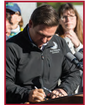
Signing of Executive Order 19-12 on January 10, 2019.

WHEREAS , while the achievements of the first four years are historic, protecting our water resources, investing to make our communities more resilient, and preserving our conservation lands are essential to our economy and way of life, and we must continue the momentum of the last four years to achieve even more now for Florida's environment and ensure that we leave Florida to God better than we found it.