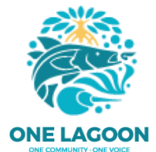
Indian River Lagoon.

B. Coordinating with stakeholders, including federal agencies, local governments, water management districts, and the Indian River Lagoon National Estuary Program to expand partnerships to identify and prioritize projects for water quality restoration.