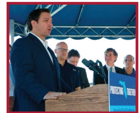
Gov. DeSantis signs Senate Bill 712.