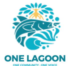
Indian River Lagoon.

B. Coordinating with stakeholders, including federal agencies, local governments, water management districts, and the Indian River Lagoon National Estuary Program to expand partnerships to identify and prioritize projects for water quality restoration.