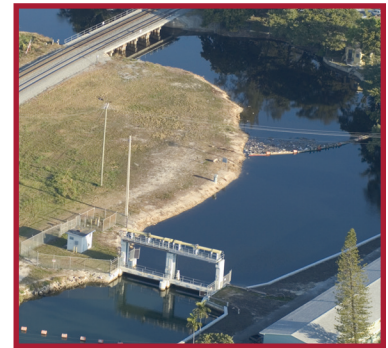
S-27 Structure Gate.

E. Coordinating with the Florida Department of Transportation to ensure it identifies and considers water quality and flood mitigation benefits when developing and implementing its resilience planning.