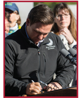
Signing of Executive Order 19-12 on January 10, 2019.

WHEREAS , while the achievements of the first four years are historic, protecting our water resources, investing to make our communities more resilient, and preserving our conservation lands are essential to our economy and way of life, and we must continue the momentum of the last four years to achieve even more now for Florida's environment and ensure that we leave Florida to God better than we found it.