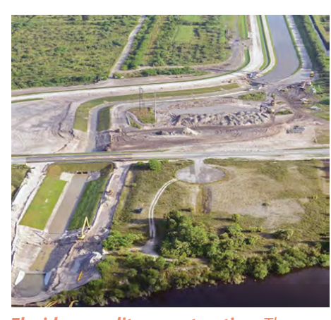
Florida expedites construction: The C-44 Reservoir and Stormwater Treatment Area project in Martin County will provide 50,600 acre-feet of storage to capture and treat local basin runoff to protect the St. Lucie Estuary.

In 2015, the South Florida Water Management District published the second three-year update to both the St. Lucie and Caloosahatchee River Watershed Protection Plans, including project construction progress, research and monitoring results