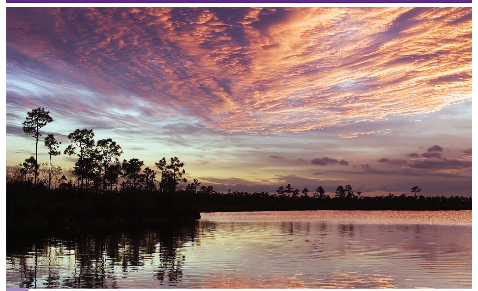
Pine Lake, Everglades National Park