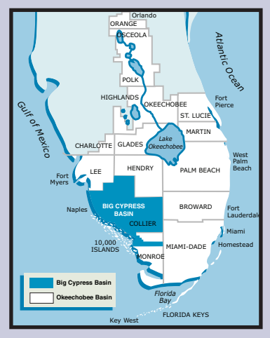
The SFWMD encompasses all or part of 16 counties, with two distinct taxing basins – the Okeechobee Basin and the Big Cypress Basin.

The Fiscal Year (FY) 2013 budget of $567.3 million funds the agency's core flood protection and water supply missions as well as its continued progress to restore the South Florida ecosystem. With streamlined processes and operations in place, the District is moving forward with critical flood control enhancements and important long-term projects to increase water storage and improve Everglades water quality – benefitting the environment and protecting the quality of life for 7.7 million South Floridians.