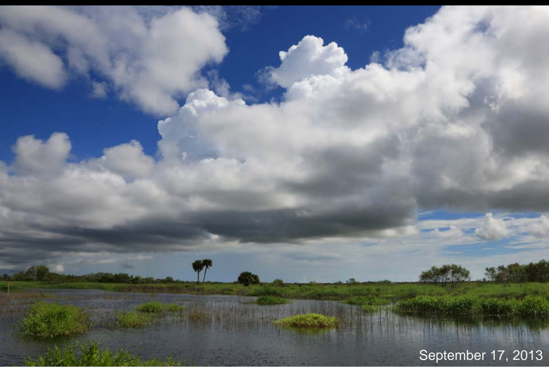
MacArthur Phase I restoration area inundated floodplain