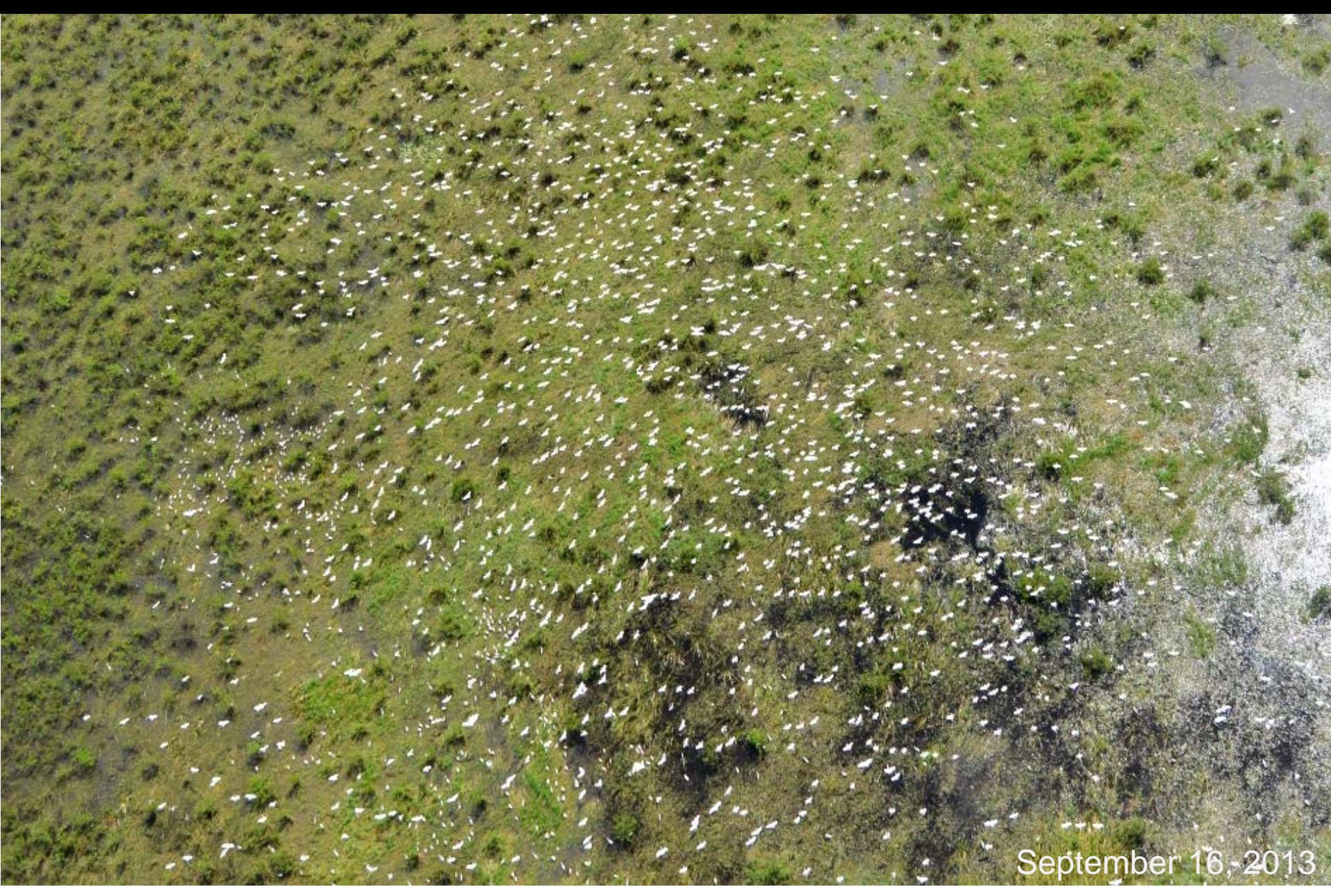
Nearly 2000 birds were observed in a massive foraging flock of wading birds (ibis, egret, herons, woodstorks, spoonbill, etc. were observed in the Phase IVB restoration area in the Avon Park Air Force range area.