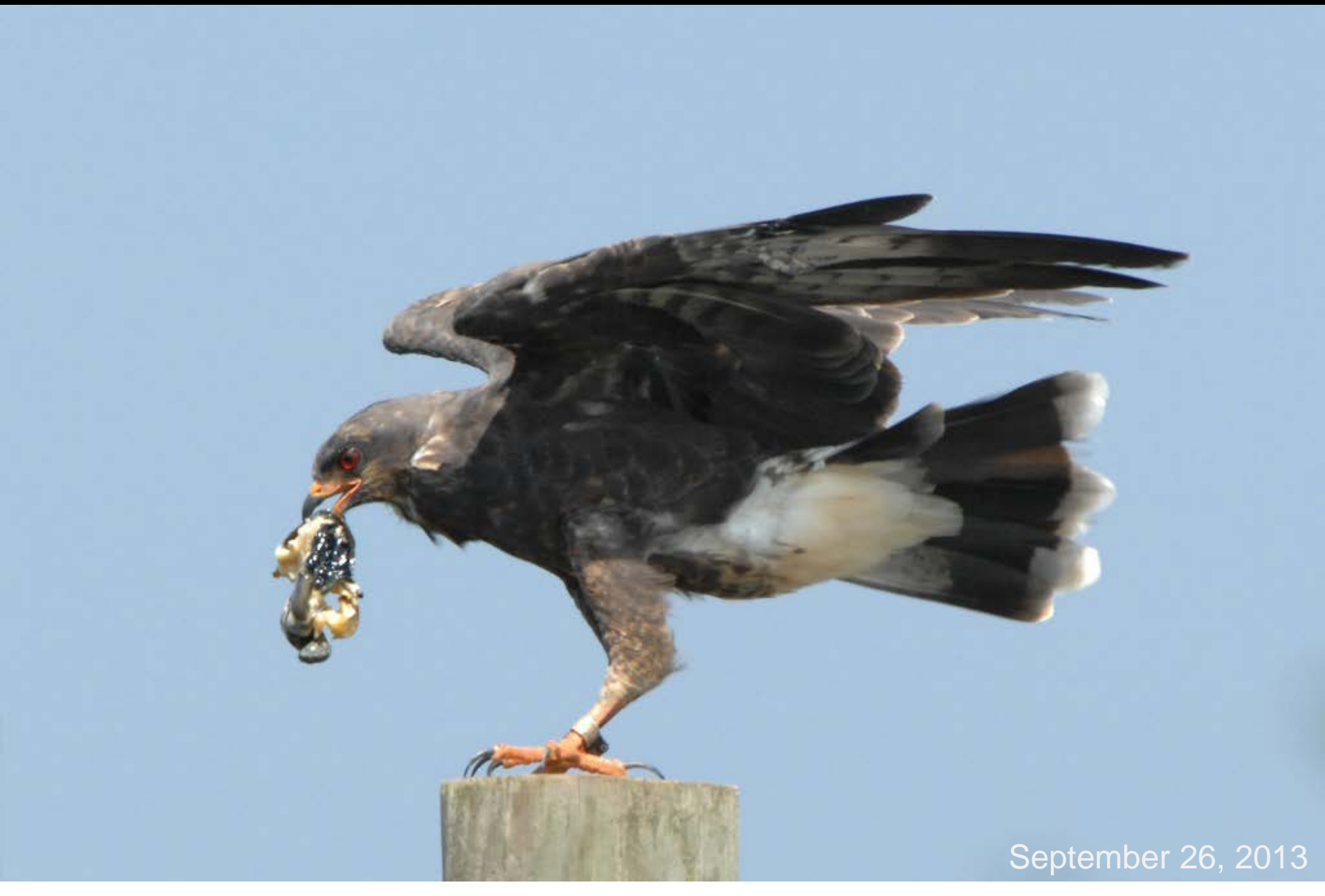
A snail kite with an apple snail above the floodplain along the Avon Park Air Force Range fence line