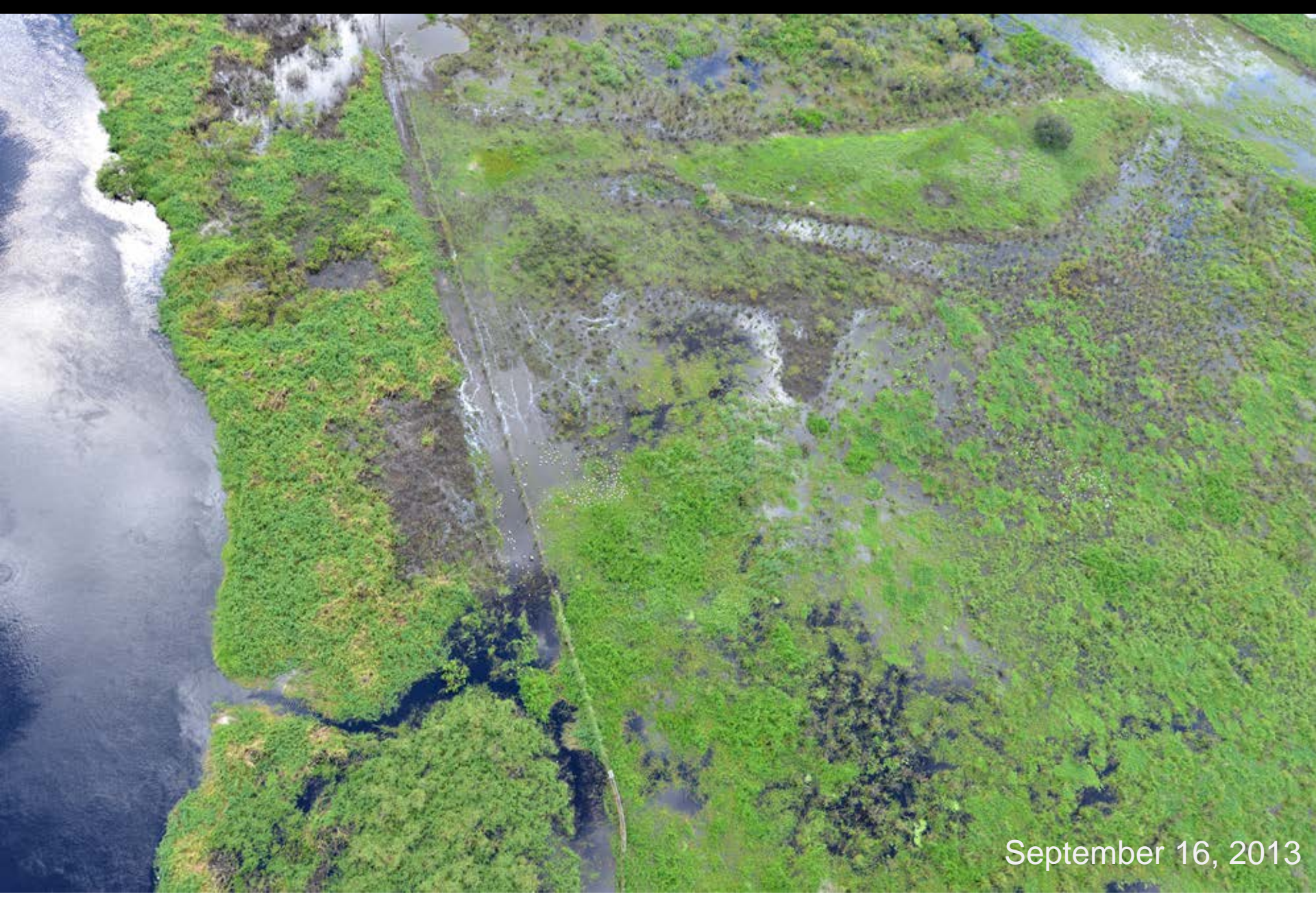
Kissimmee River and floodplain in the Phase IVB restoration area