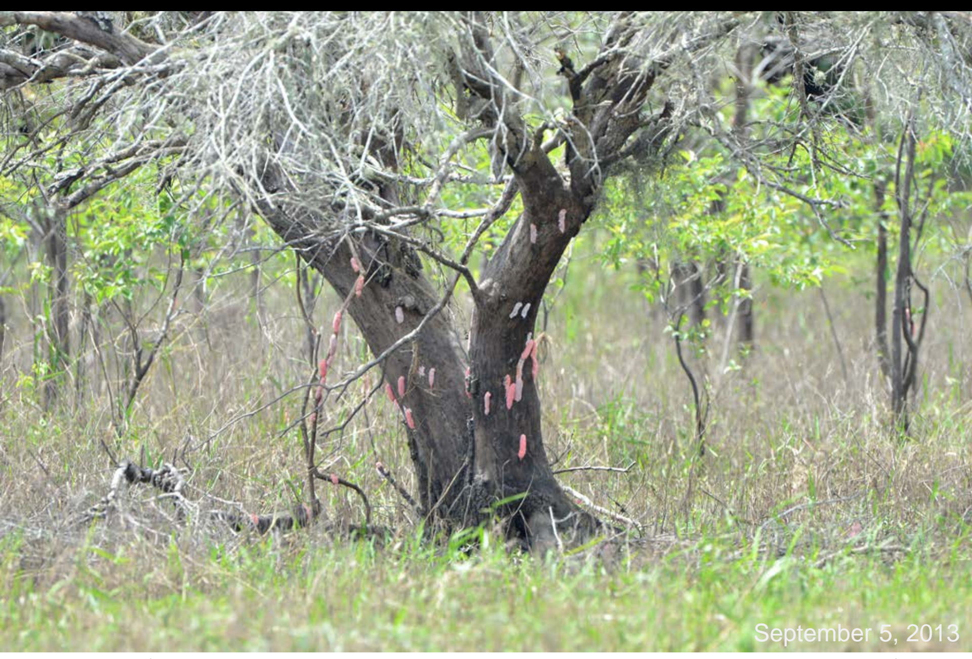
High densities of the exotic apple snail eggs were observed in the Phase IVB restoration area. This is the first that we have seen of high densities of either exotic or native apple snails in the restoration area.