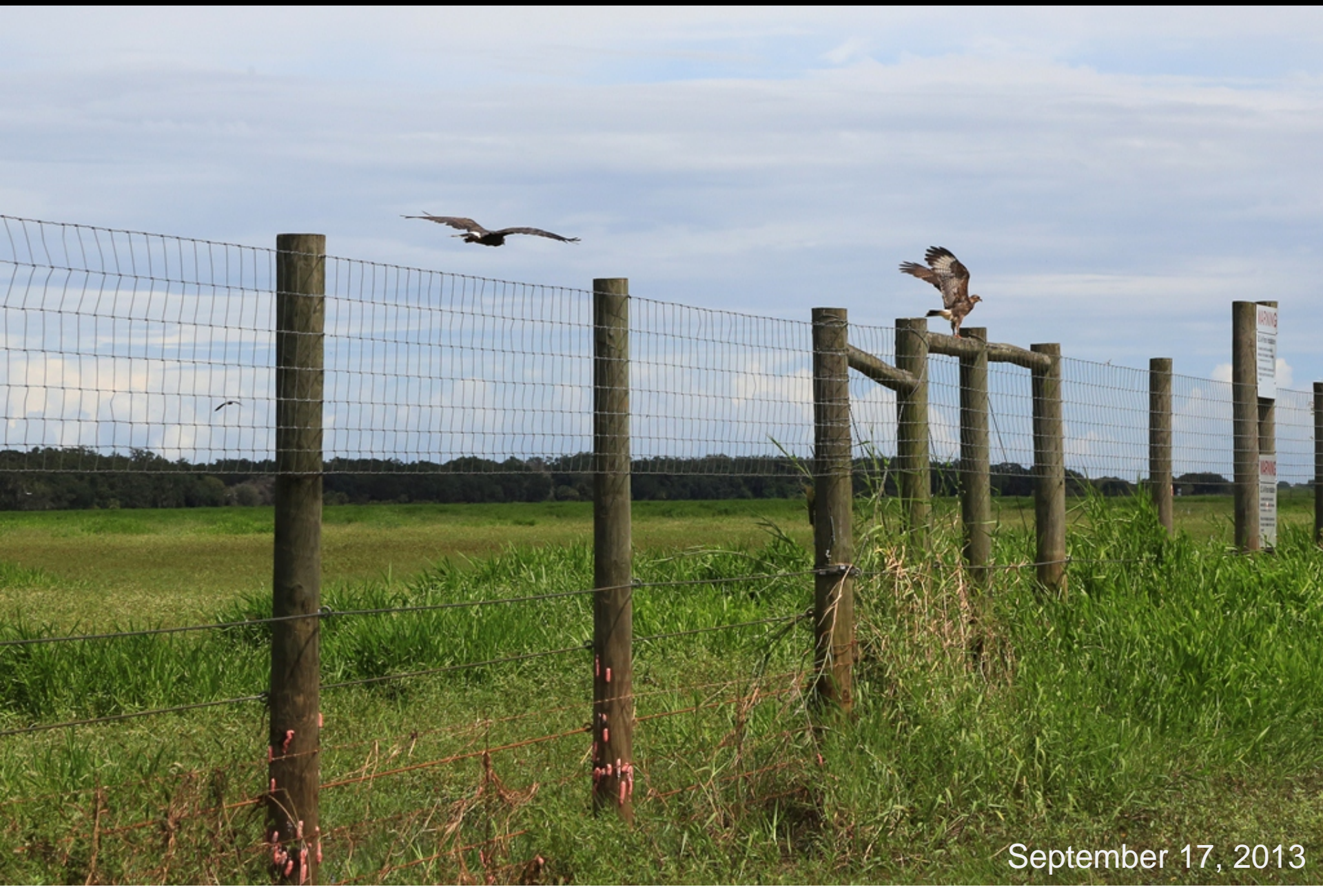
Exotic apple snail eggs and snail kites on the Avon Park Air Force Range fence line