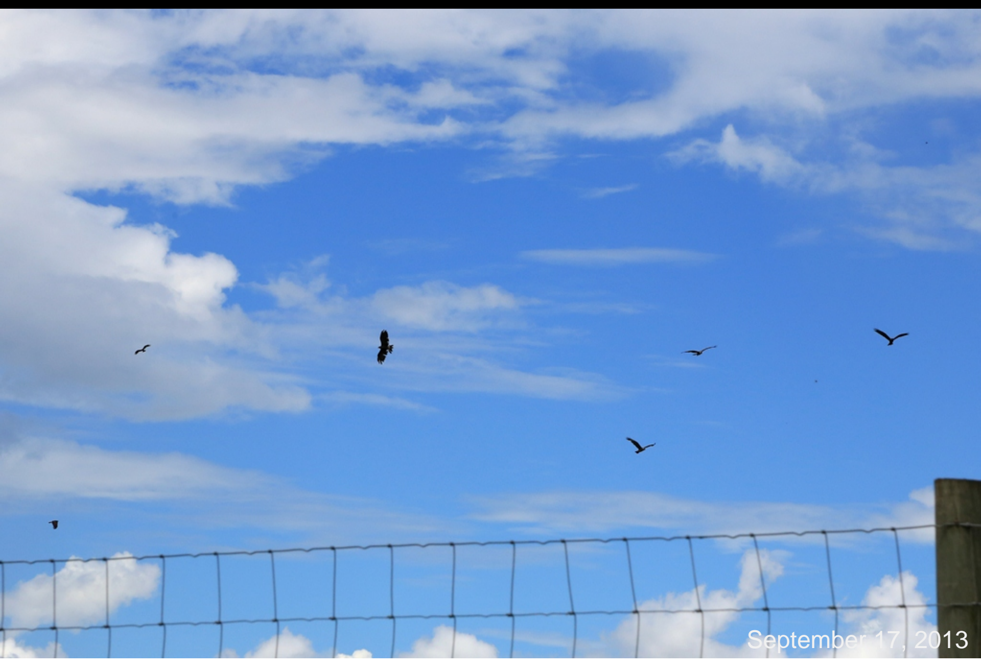
A group of six snail kites flying above the floodplain along the Avon Park Air Force Range fence line.