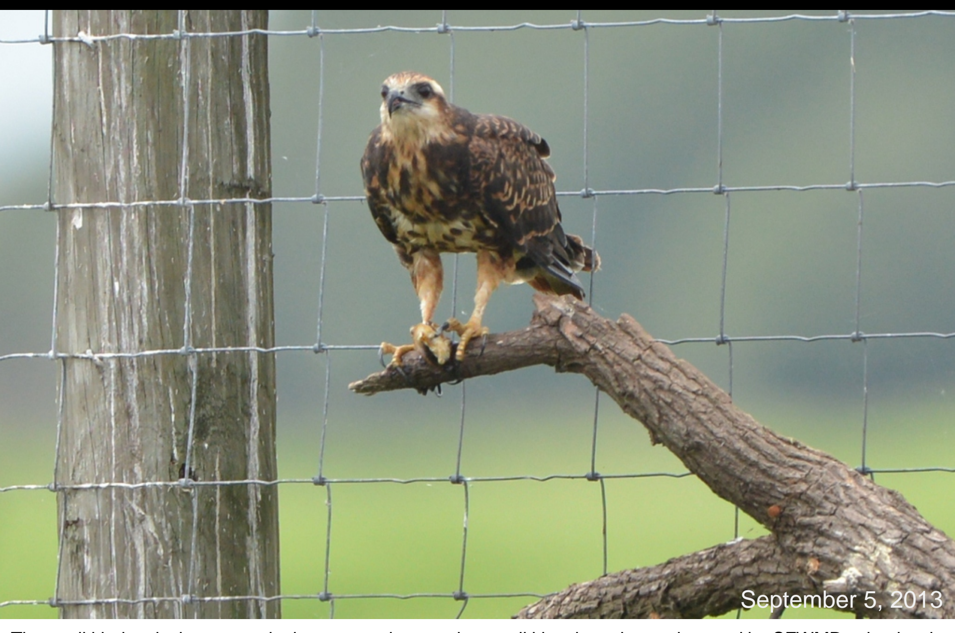
The snail kit density is noteworthy because only two other snail kites have been observed by SFWMD scientists in the restoration area to date during the past 10 years since restoration began.