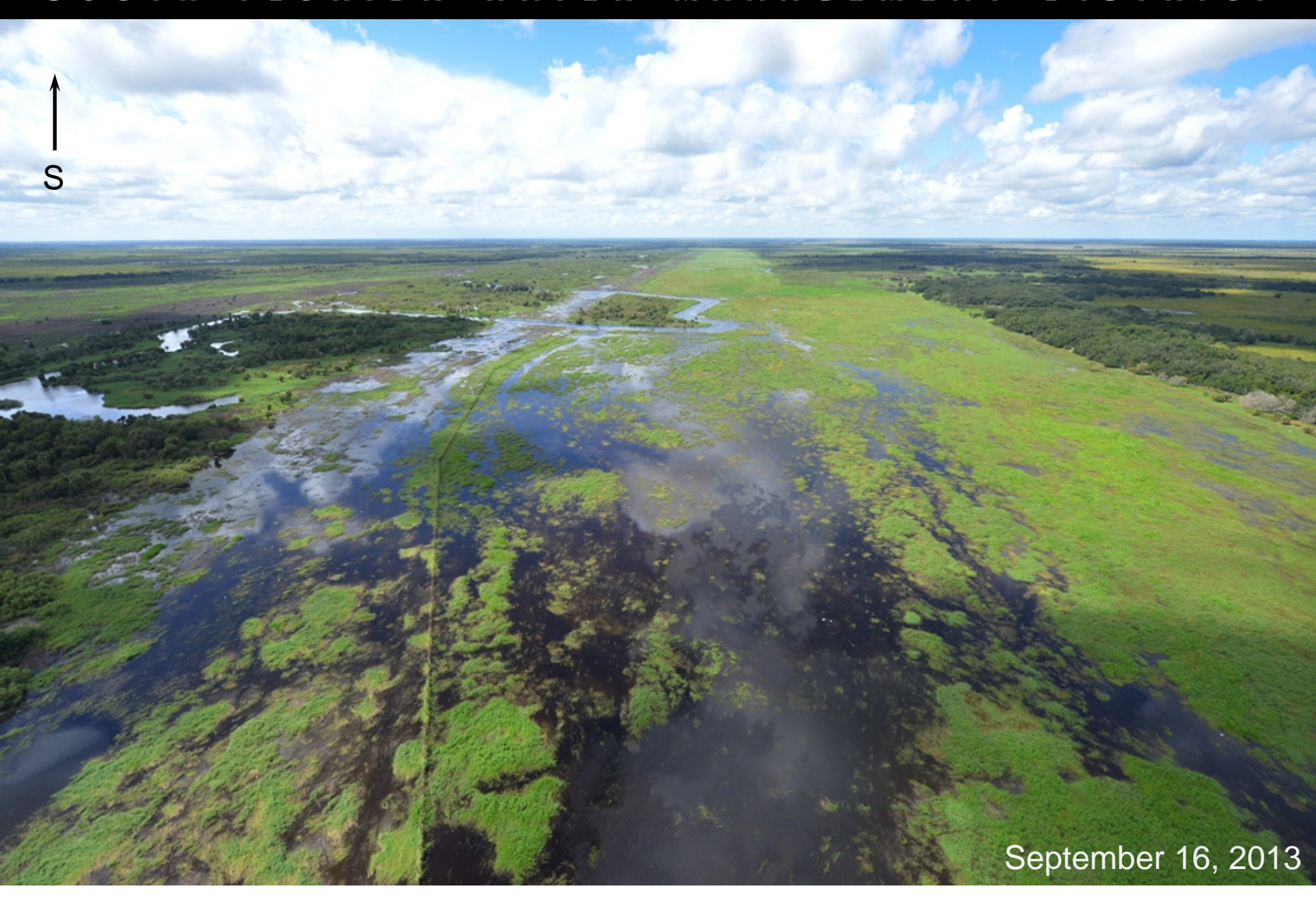
Phase IV restoration area