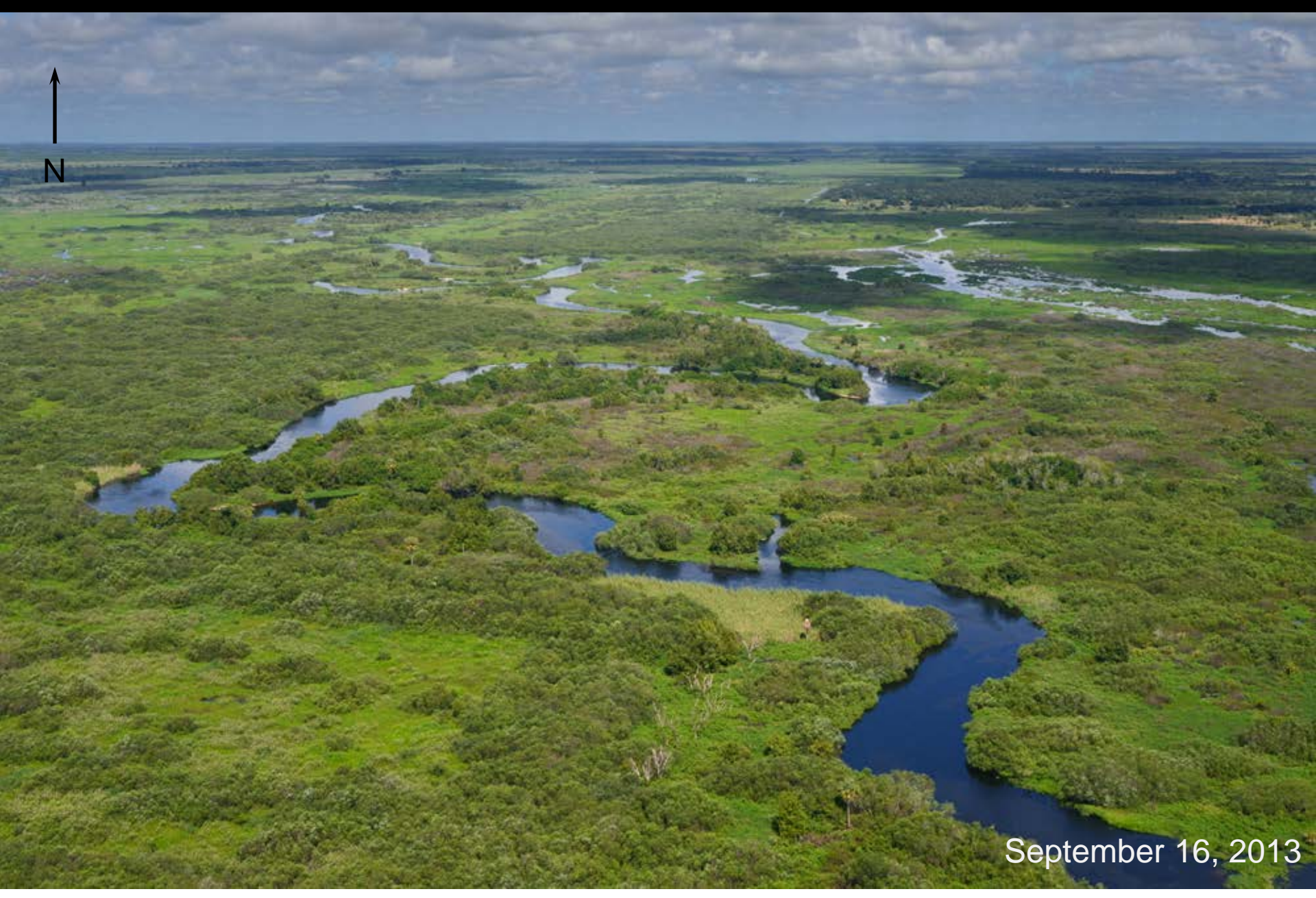
Micco Run and Oak Creek in the Phase I restoration area