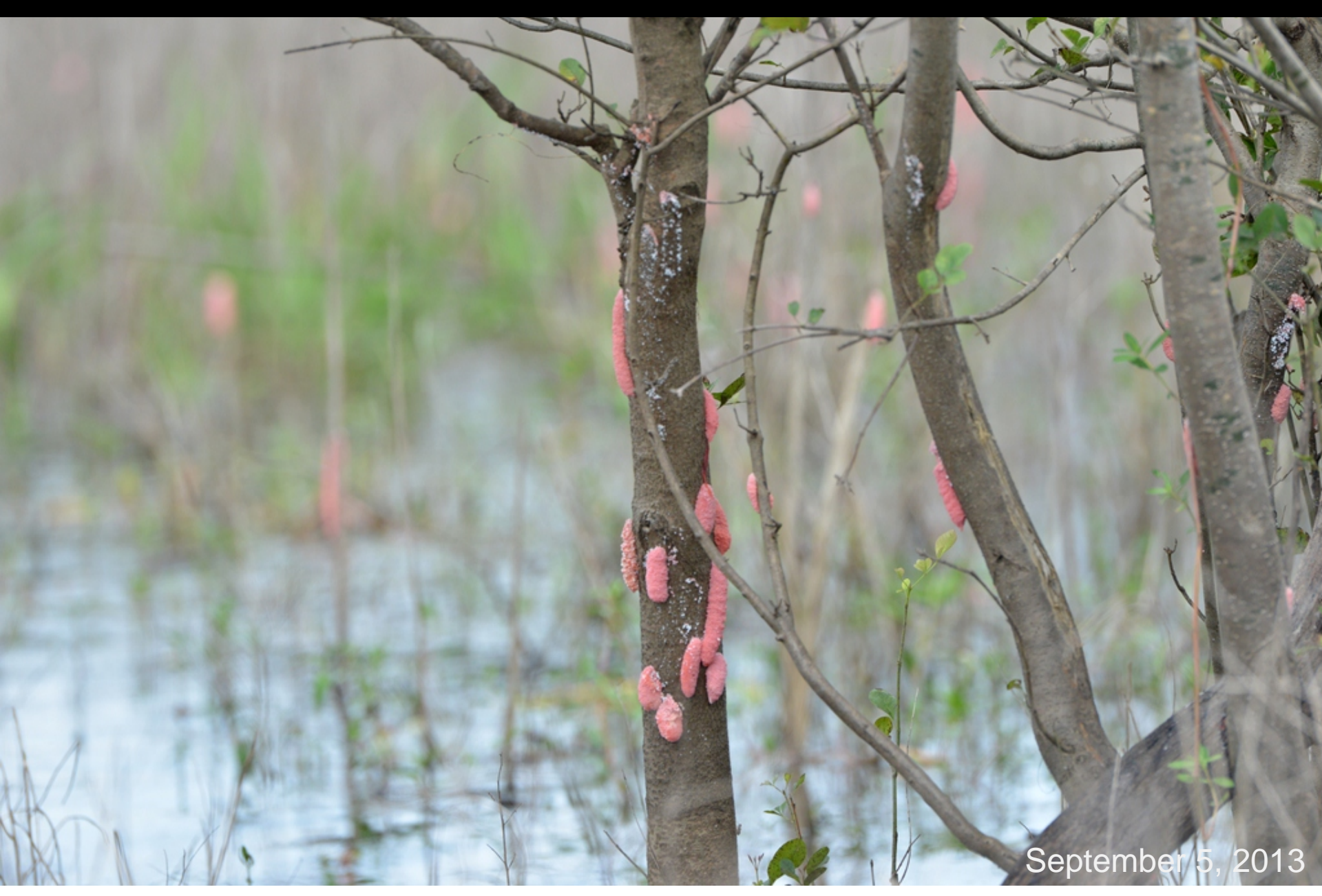
More exotic snail eggs in the Phase IVB restoration area