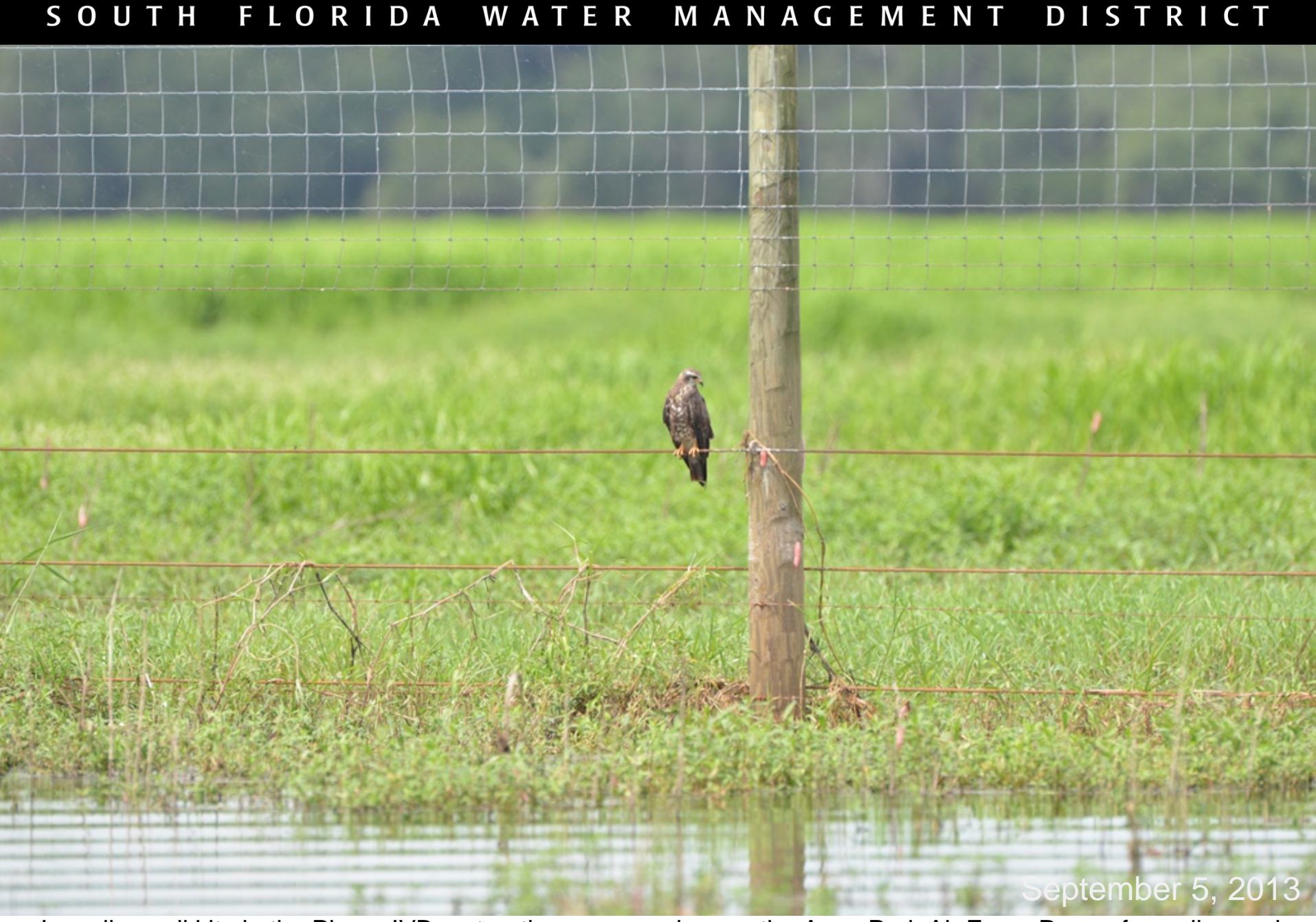
Juvenile snail kite in the Phase IVB restoration area perches on the Avon Park Air Force Range fence line and waits patiently for his next meal to hatch.