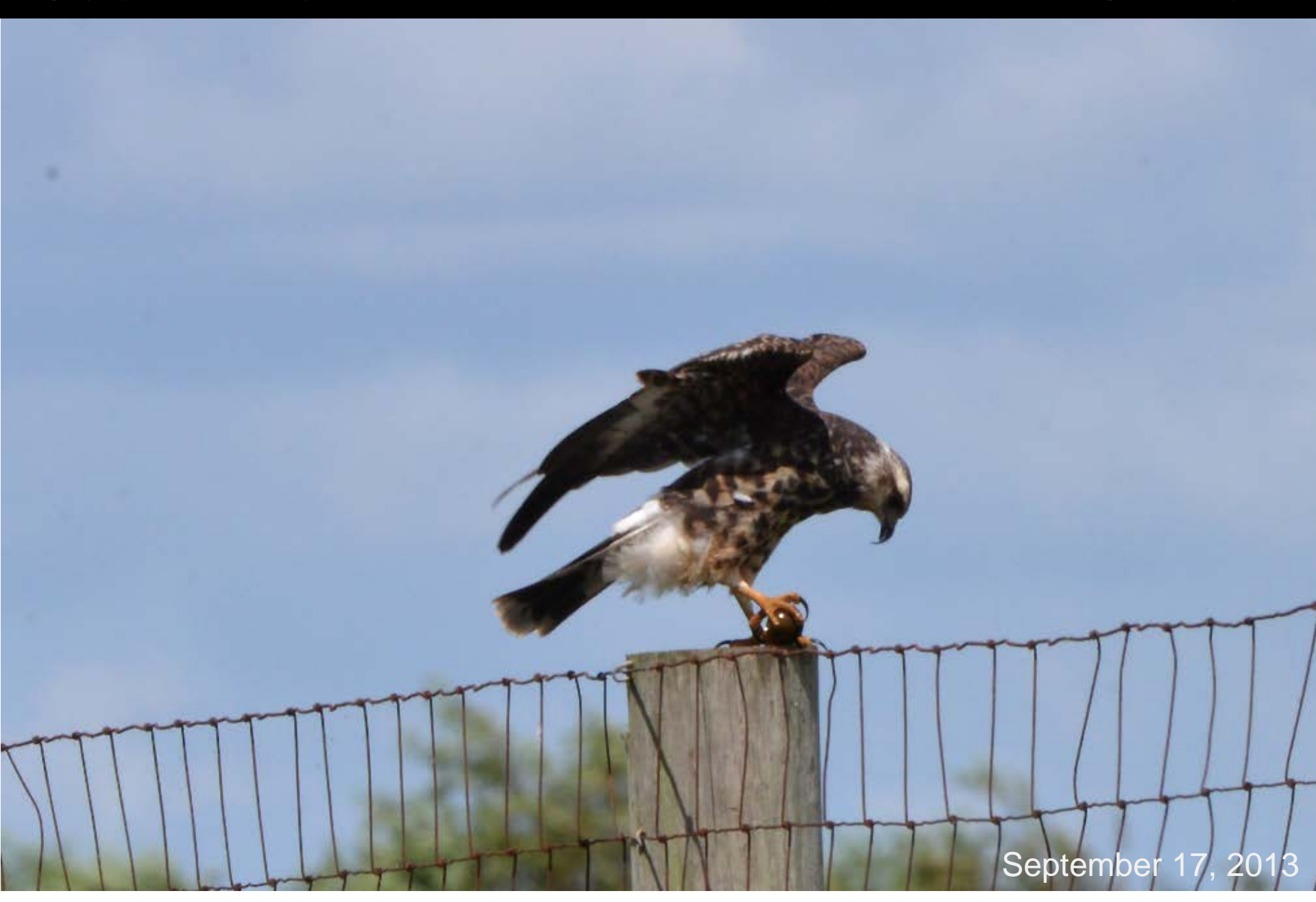
A snail kite with an apple snail above the floodplain along the Avon Park Air Force Range fence line