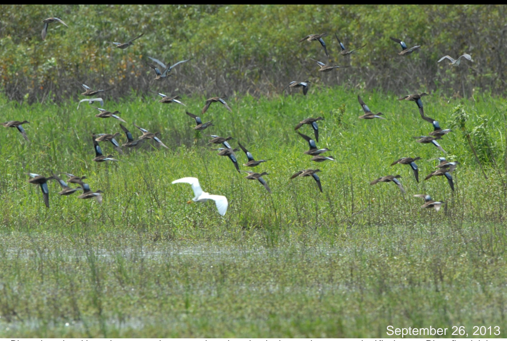
Blue-winged teal have begun to migrate south and are beginning to show up on the Kissimmee River floodplain. This flock was observed in the Phase IVB restoration area.