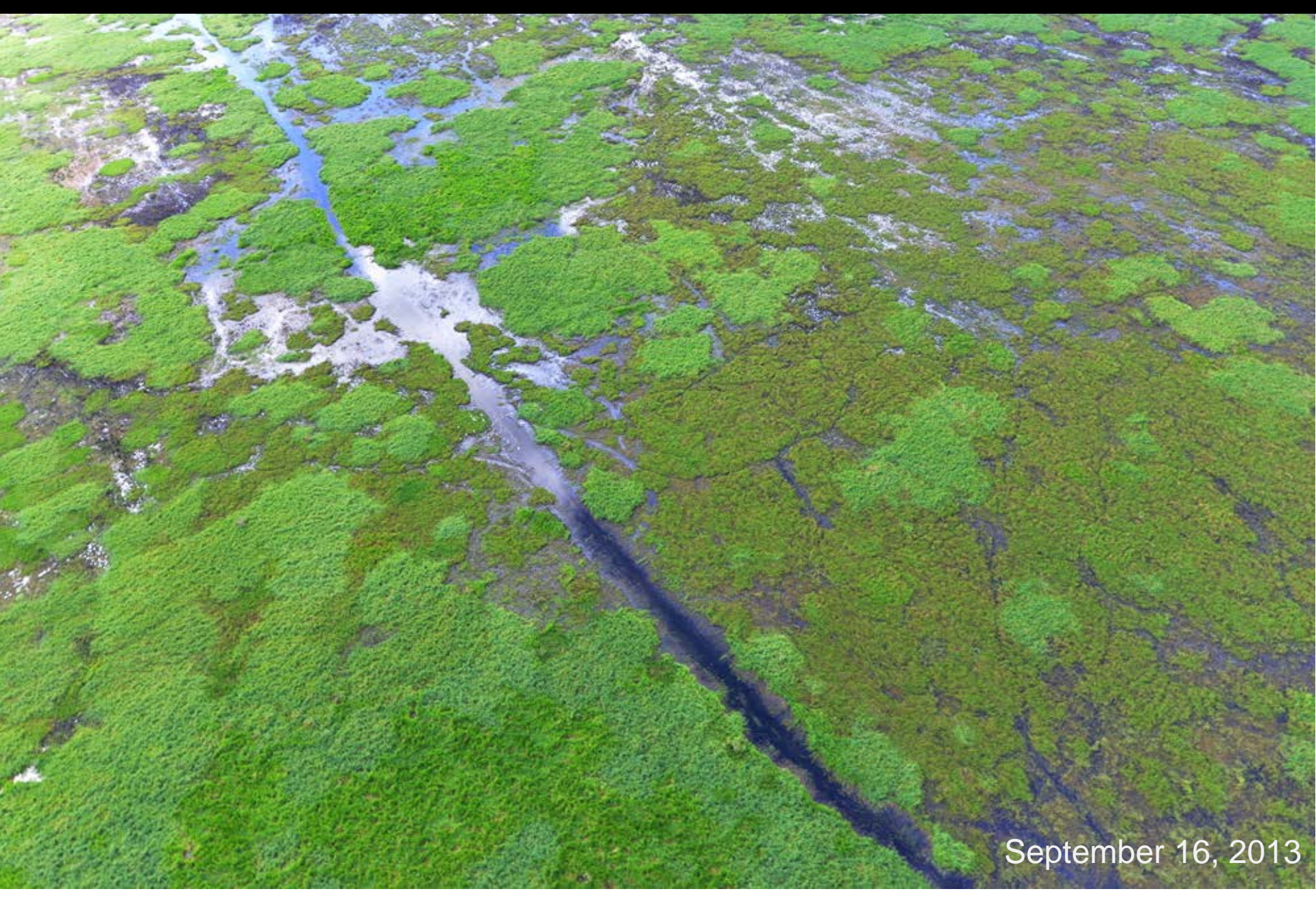
Phase I restoration area floodplain