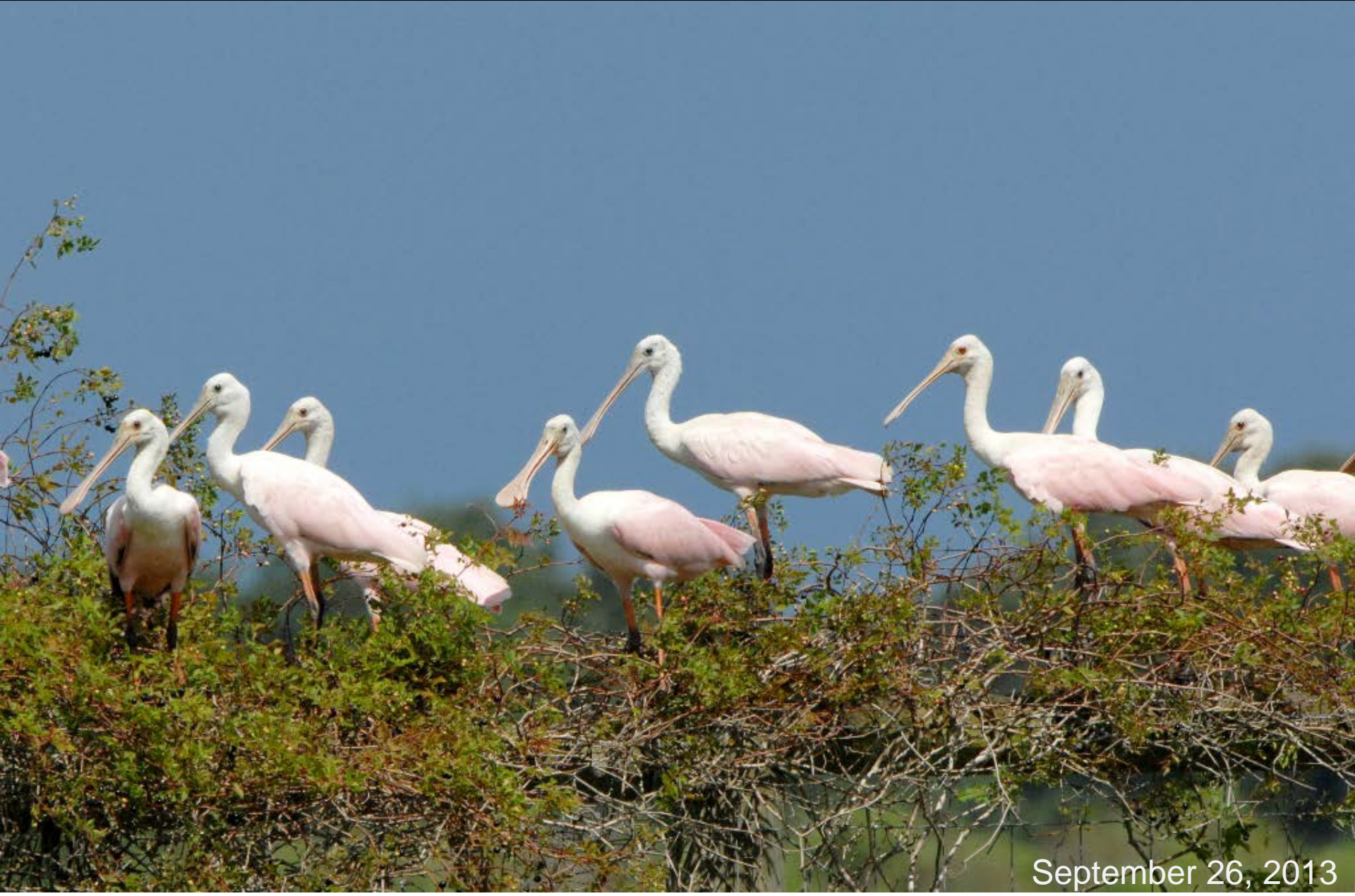
A group of young roseate spoonbills forage along the Avon Park Air Force Range fence line in the Phase IVB restoration area.