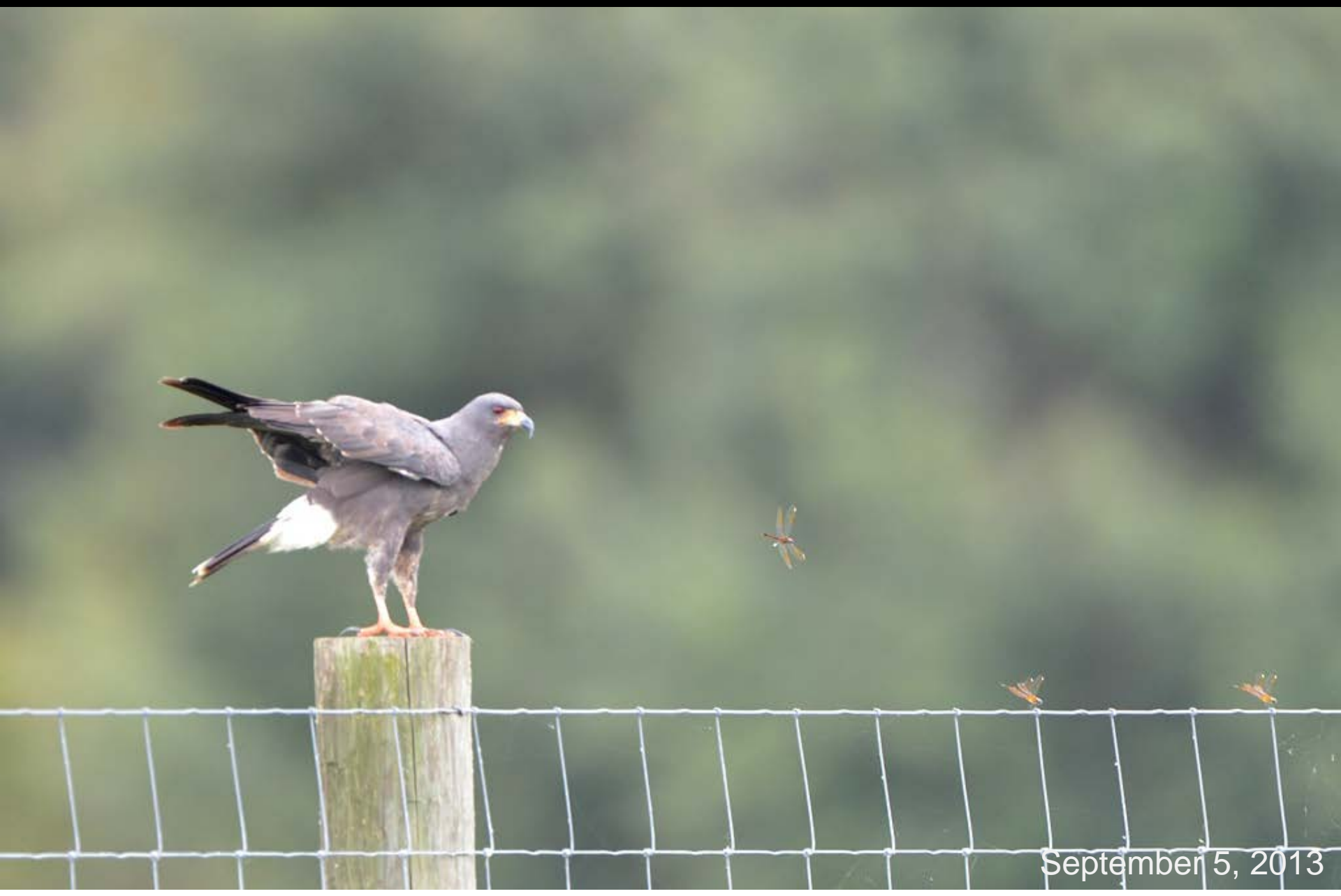
Although most observed snail kites were juveniles, a couple of adult birds were seen in the mix including this adult male trying to fit in with the dragonflies.