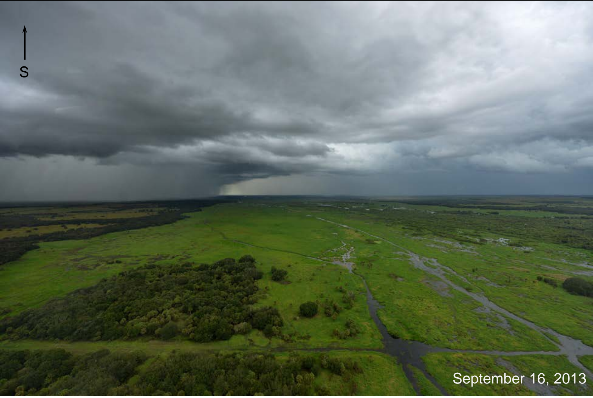
Torrential rain storms continue to sweep across the Kissimmee Valley through September.