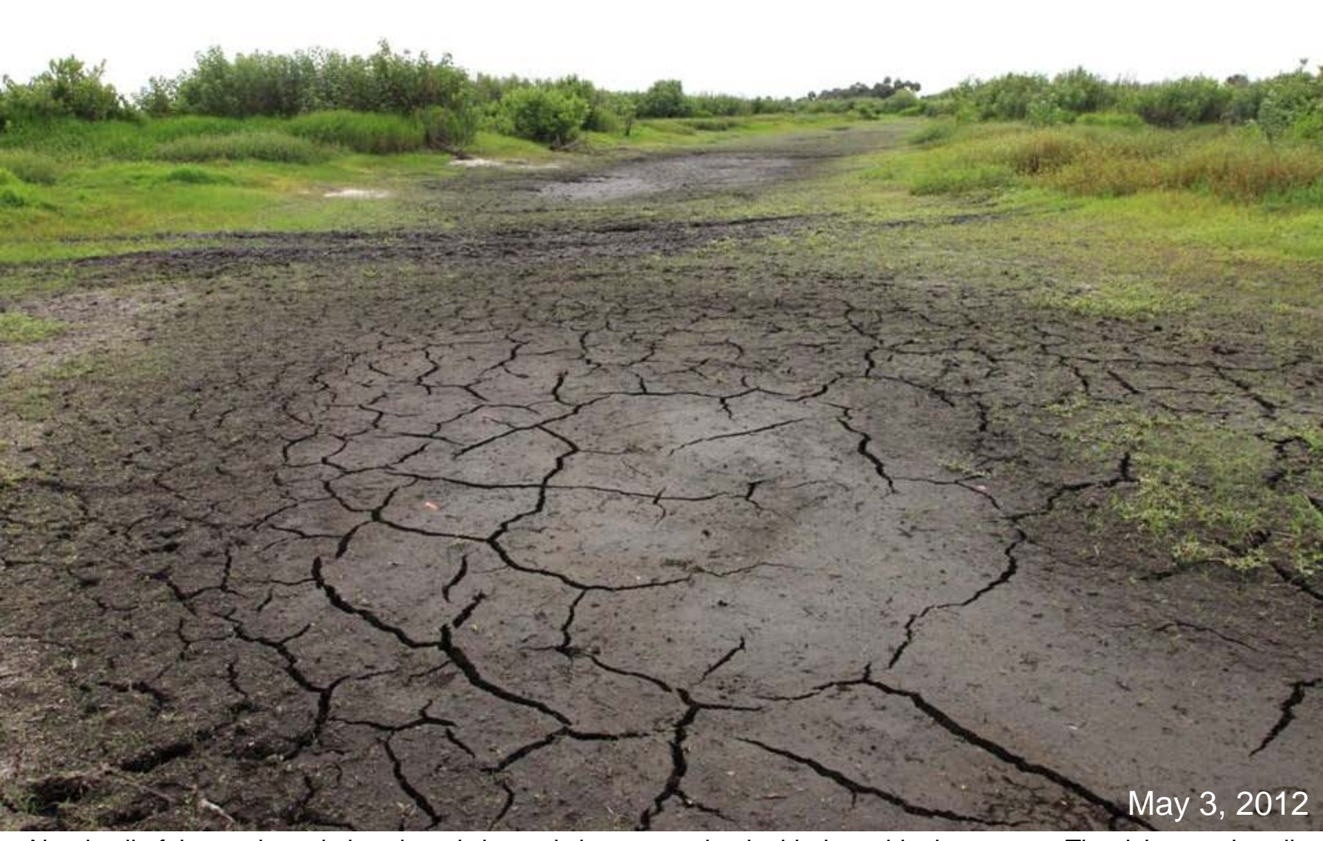
Nearly all of the pools and abandoned channels have completely dried out this dry season. The rich organic soil cracks as it dries.