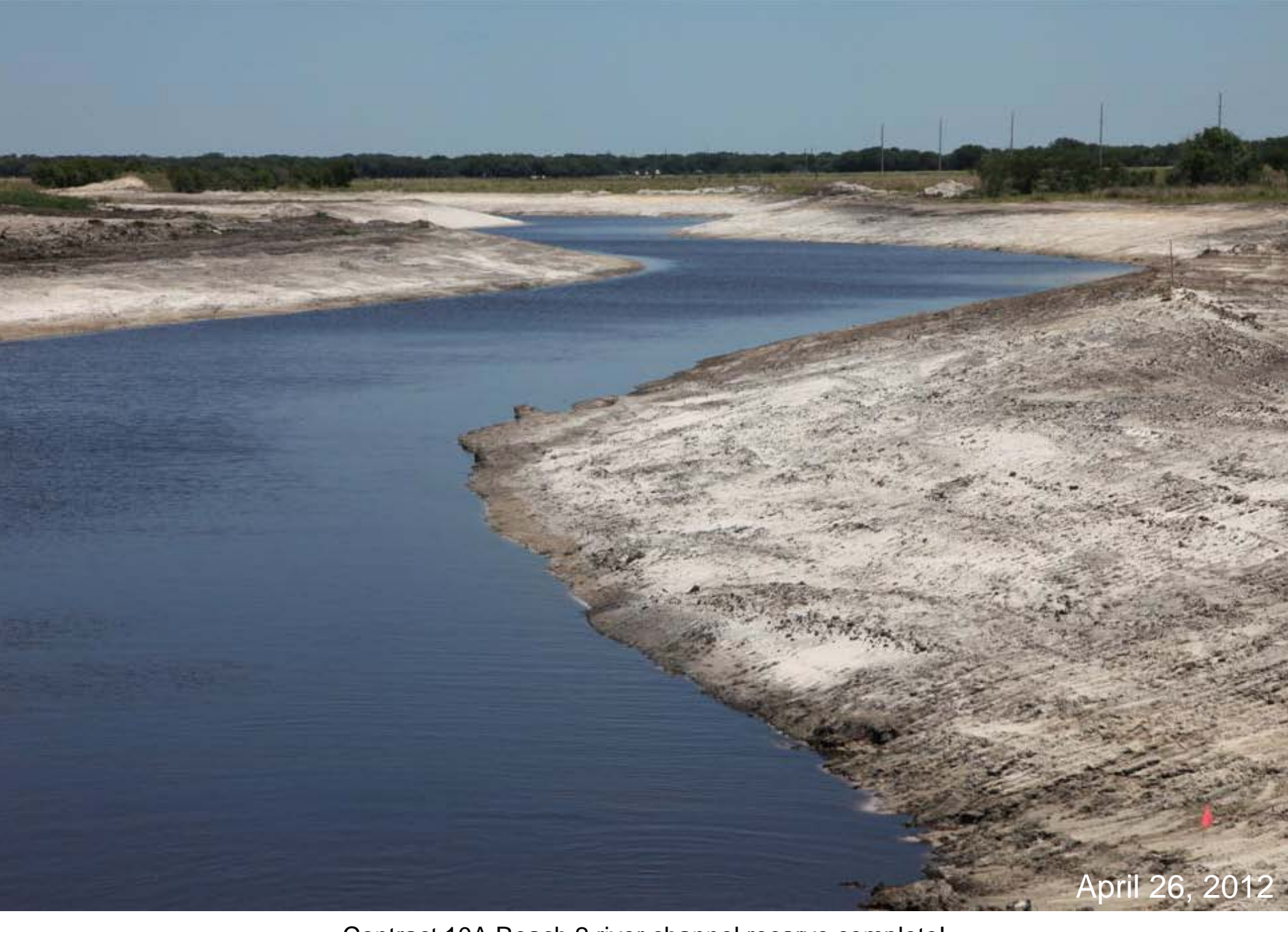
Contract 10A Reach 2 river channel recarve complete!