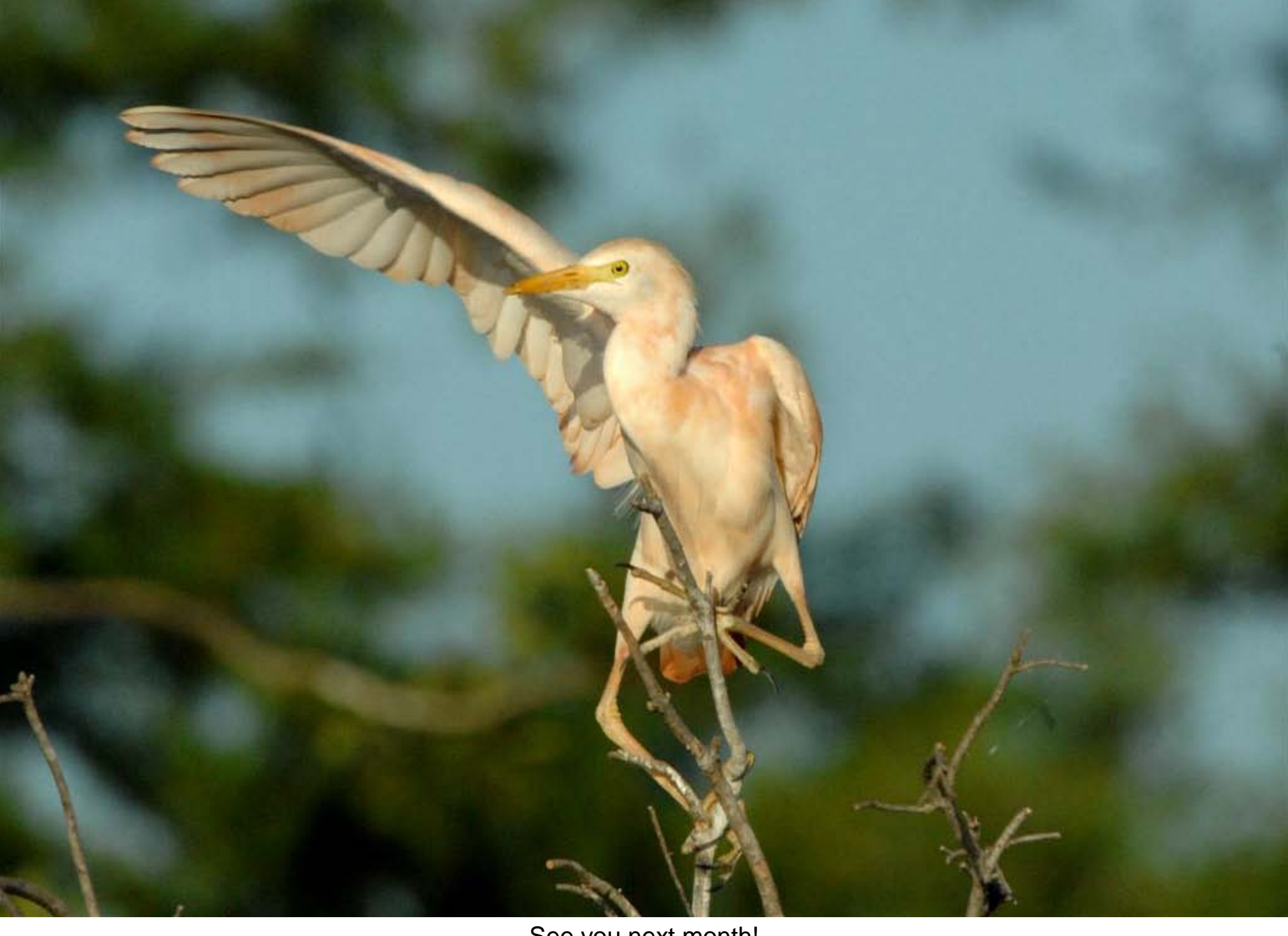
See you next month!