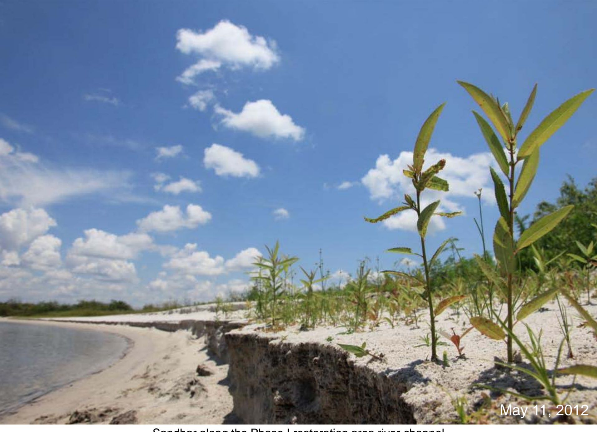
Sandbar along the Phase I restoration area river channel