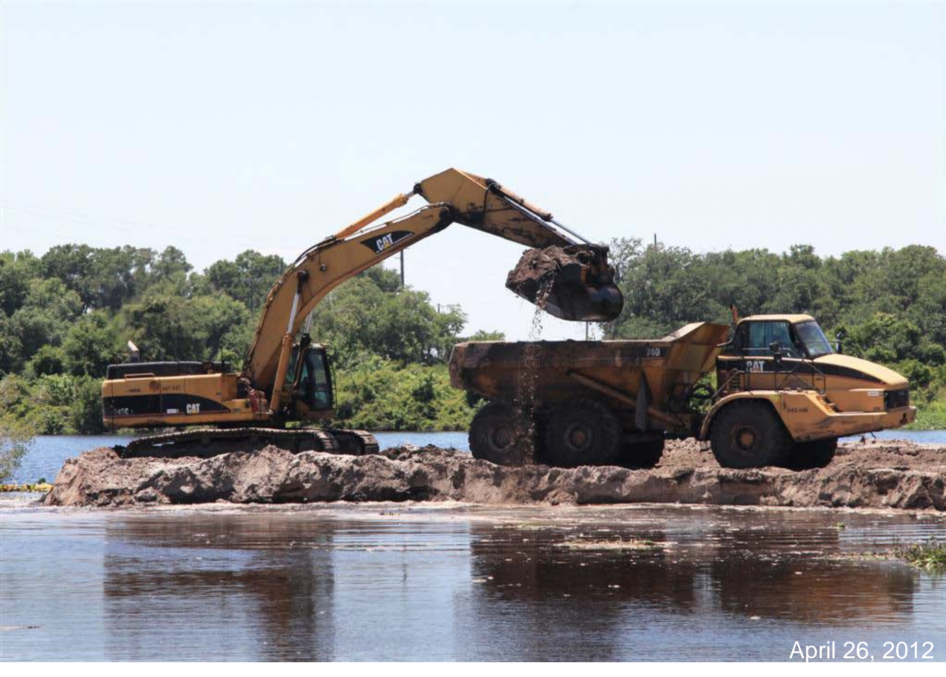
Contract 10A Reach 2 river channel recarve