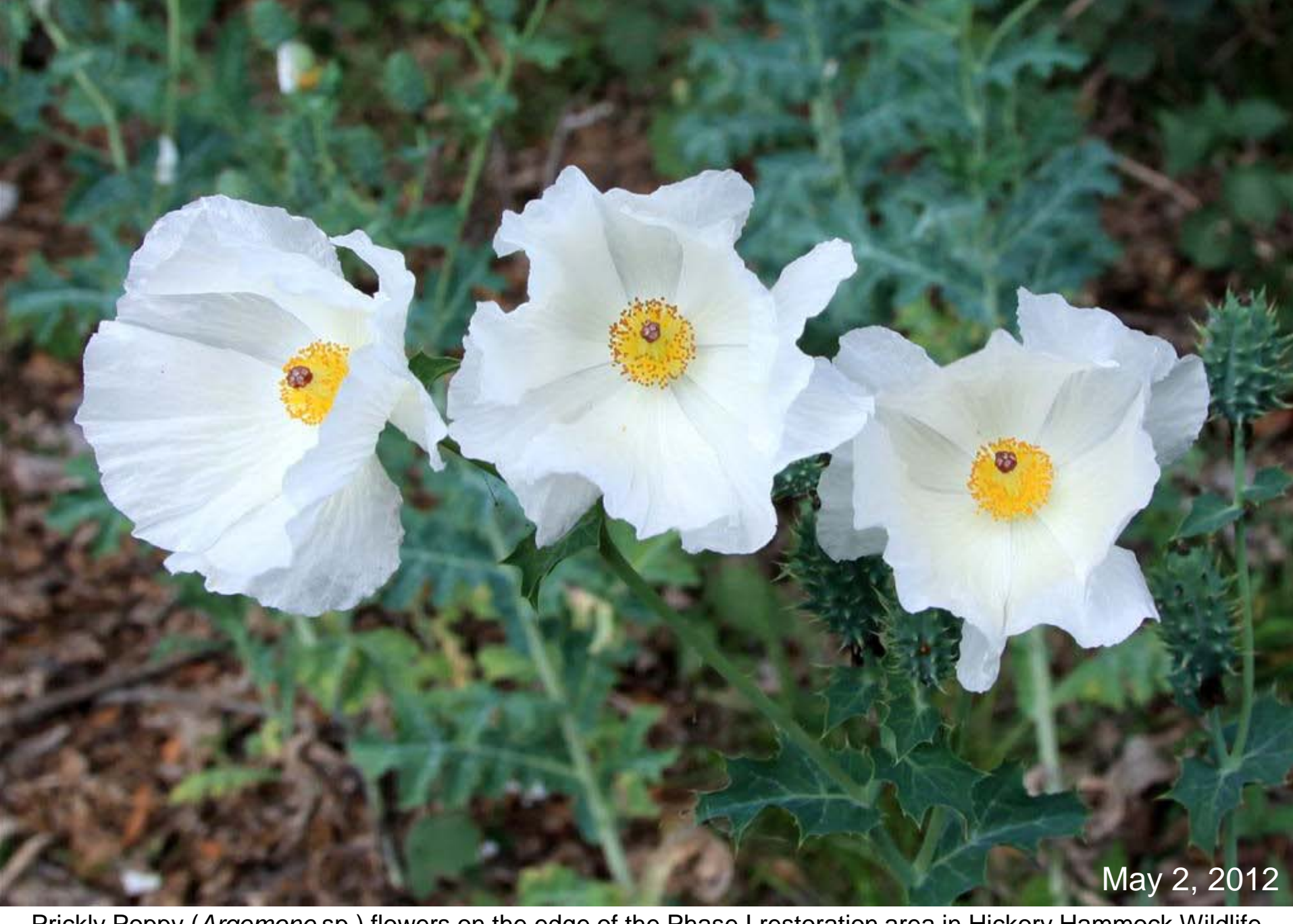
Prickly Poppy ( Argemone sp.) flowers on the edge of the Phase I restoration area in Hickory Hammock Wildlife Management Area