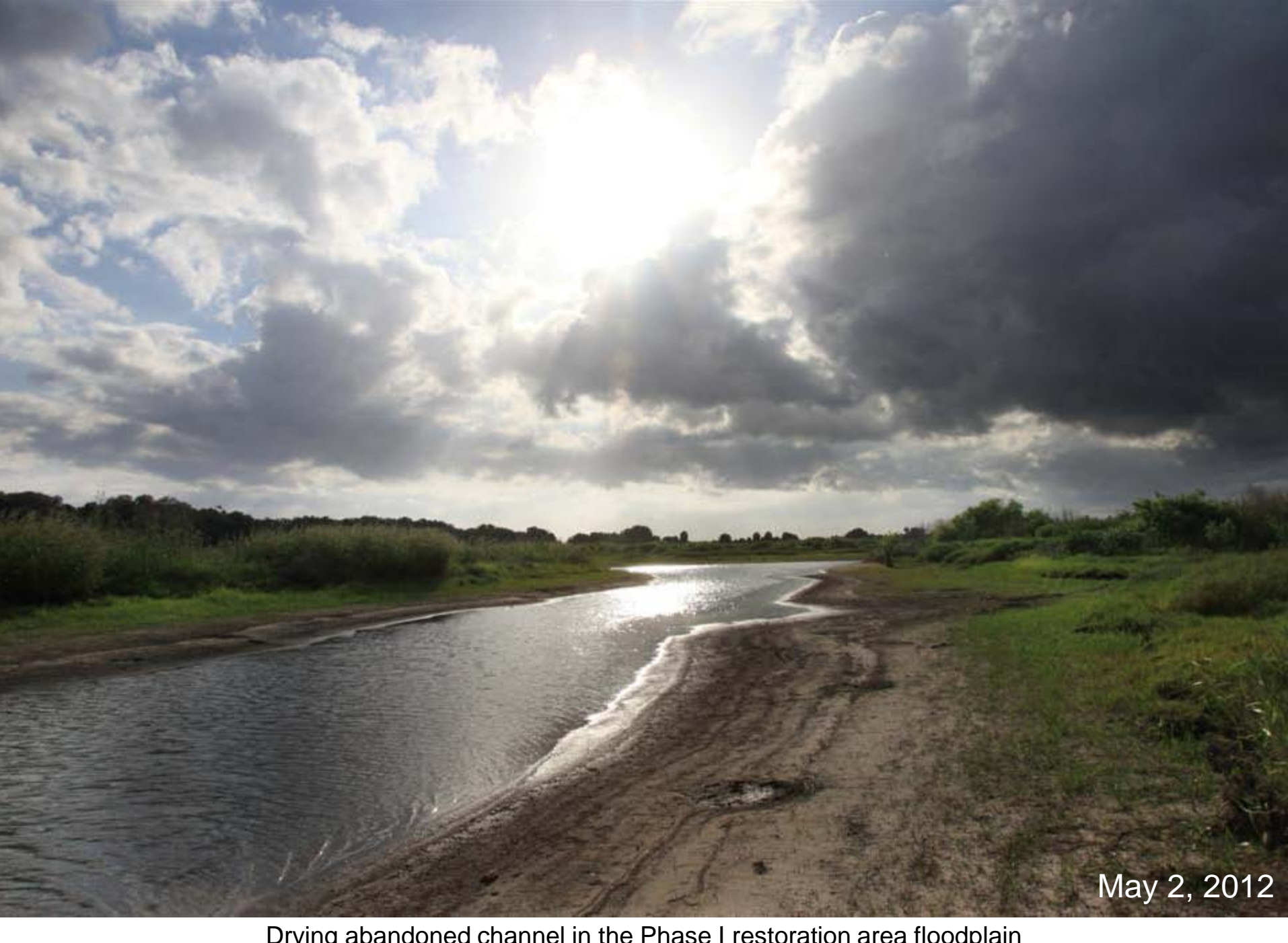
Drying abandoned channel in the Phase I restoration area floodplain