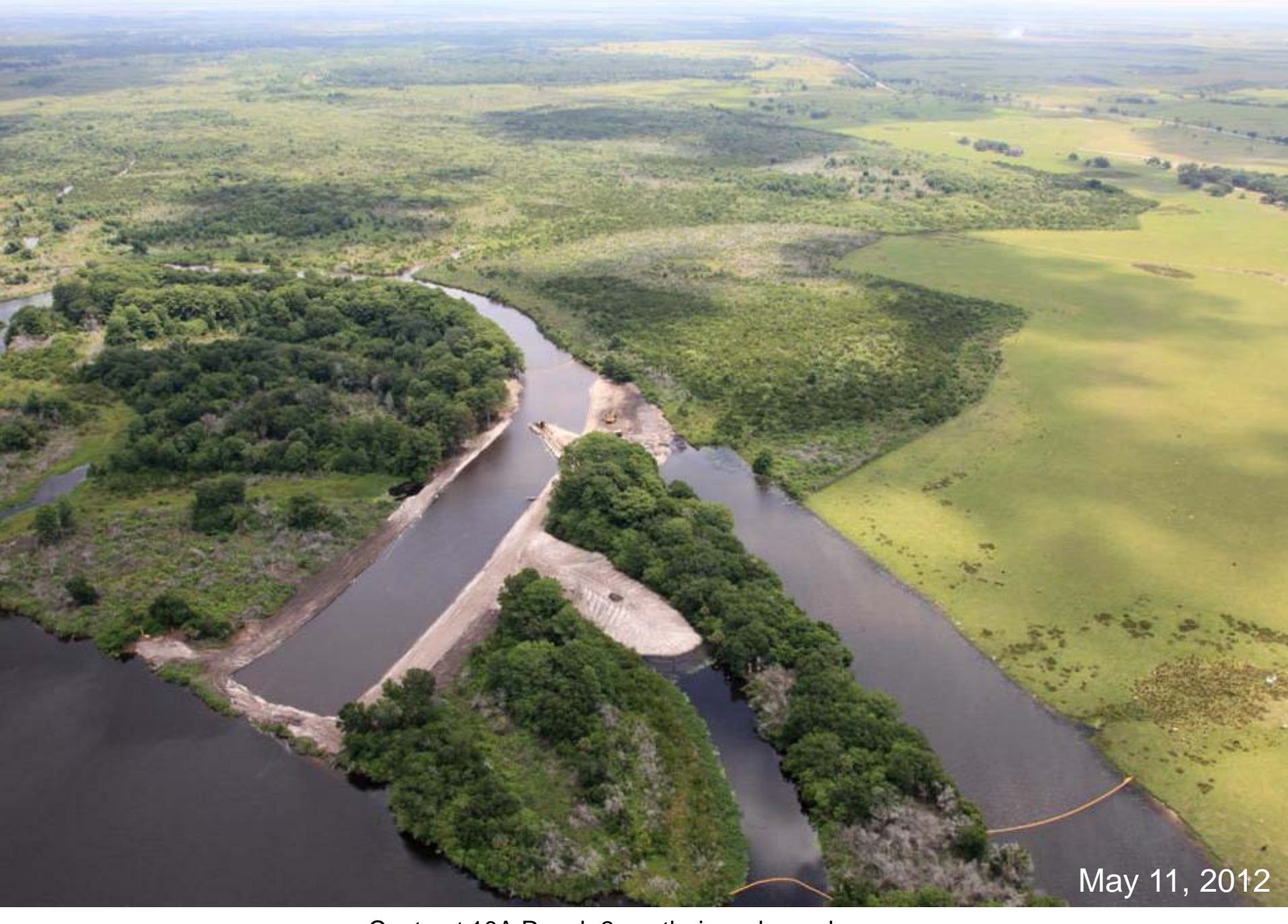
Contract 10A Reach 3 south river channel recarve