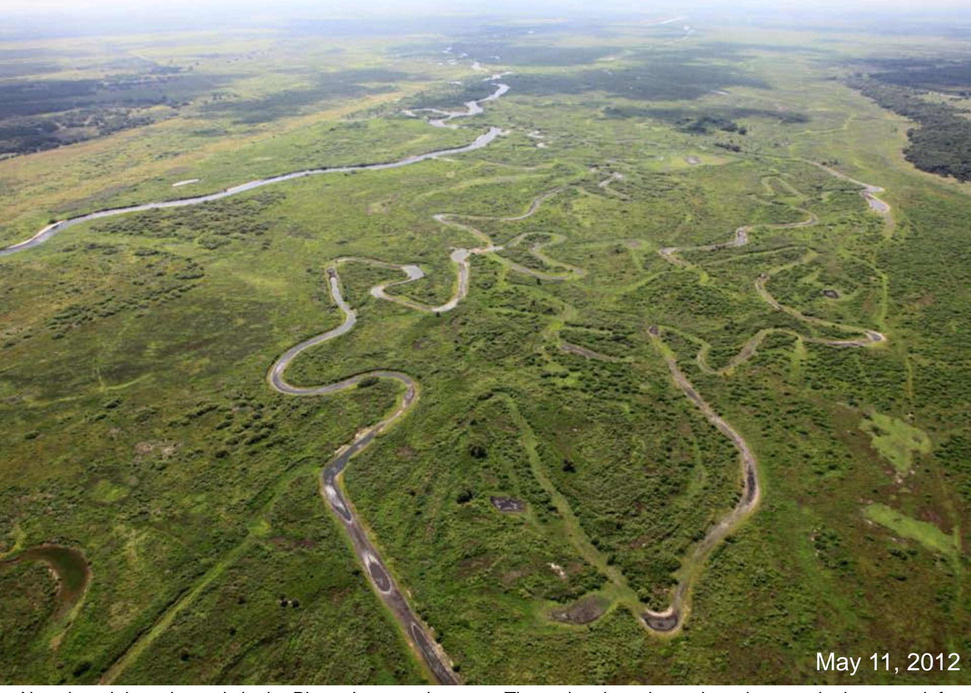
Abandoned river channels in the Phase I restoration area. The active river channel can be seen in the upper left.