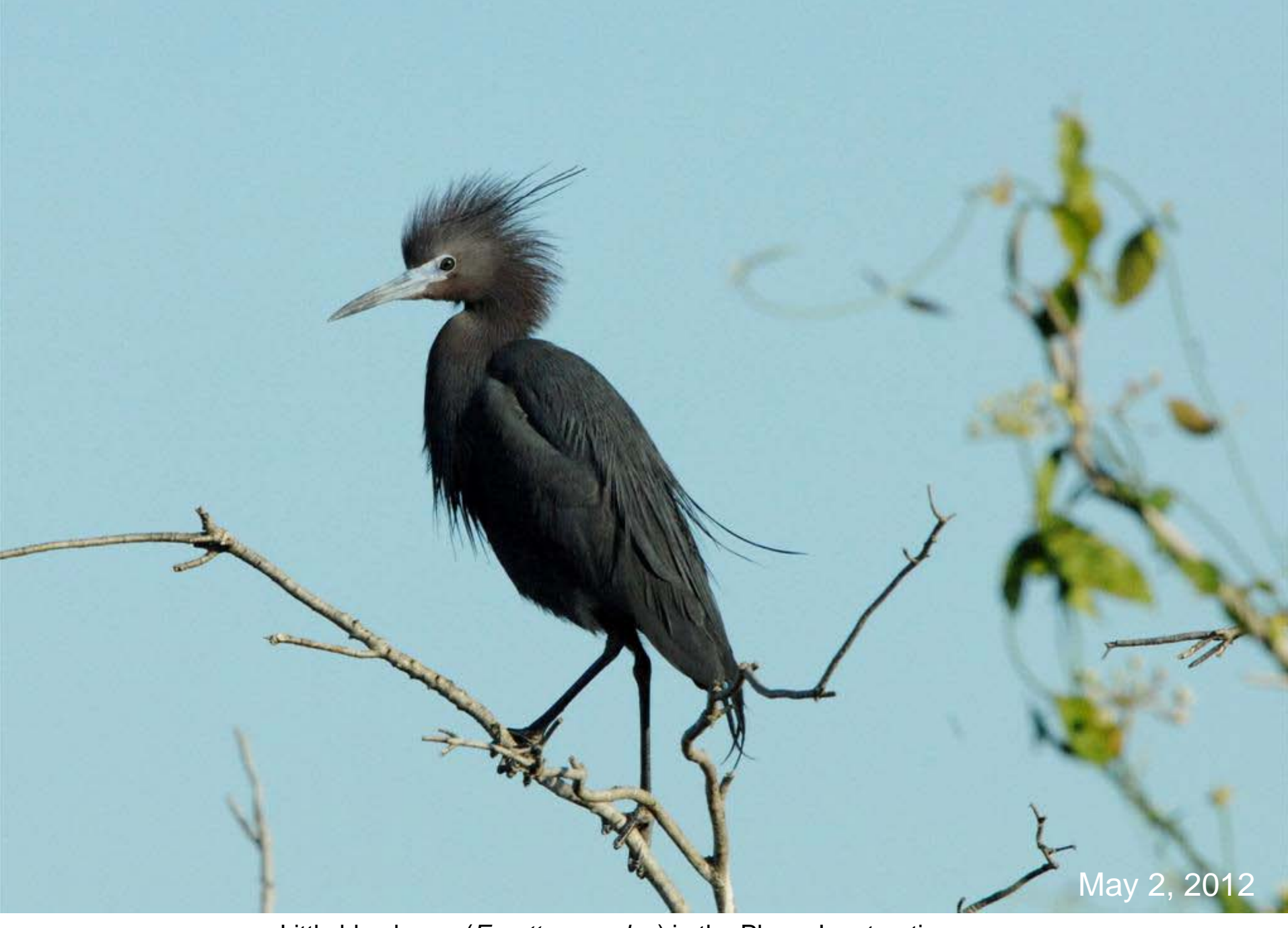
Little blue heron (Egretta caerulea) in the Phase I restoration area