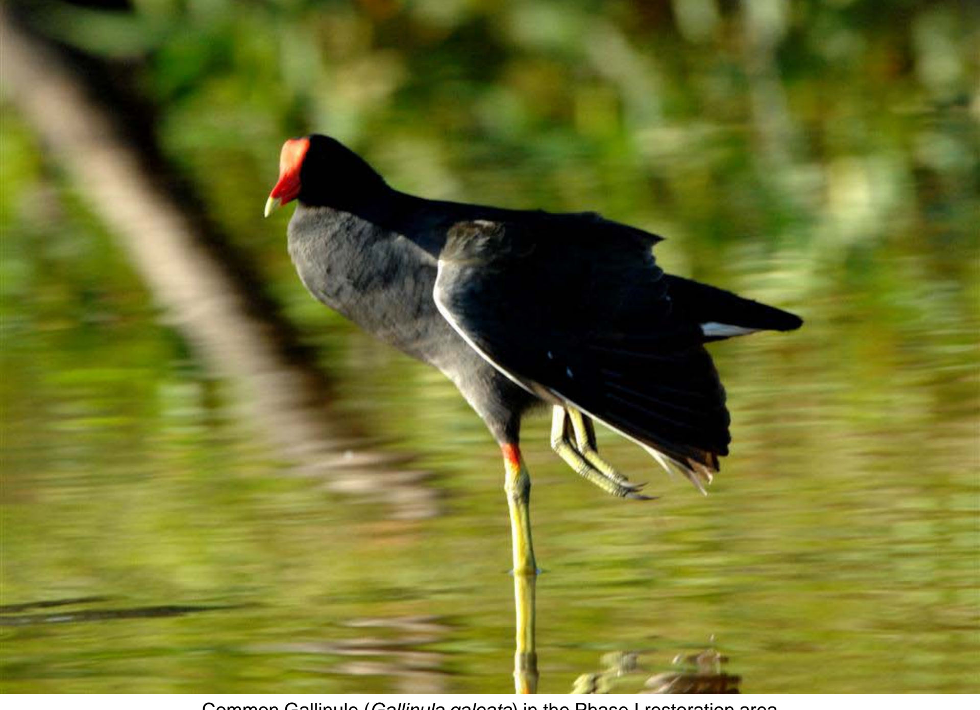
Common Gallinule (Gallinula galeata) in the Phase I restoration area