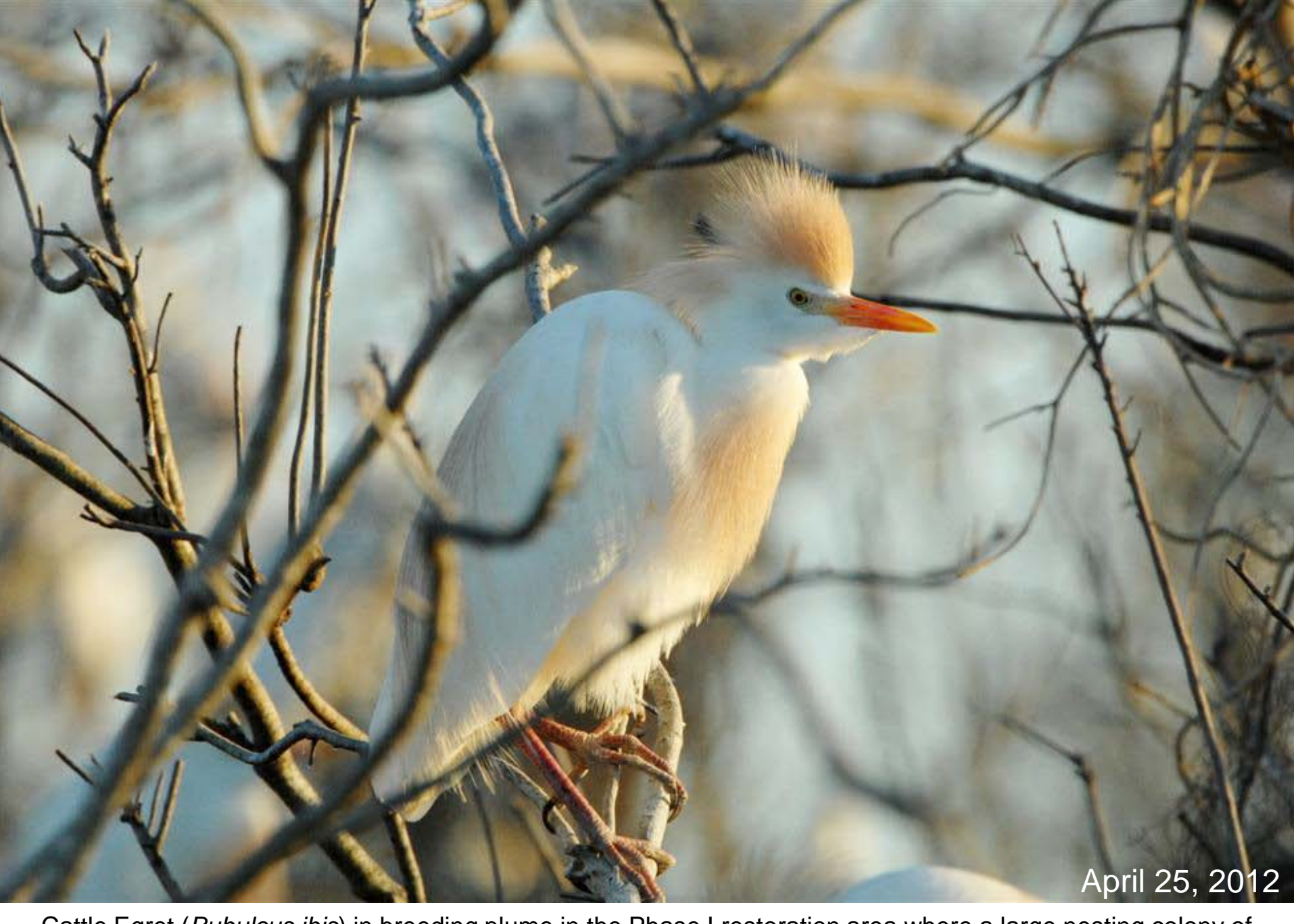
Cattle Egret ( Bubulcus ibis ) in breeding plume in the Phase I restoration area where a large nesting colony of wading birds has formed