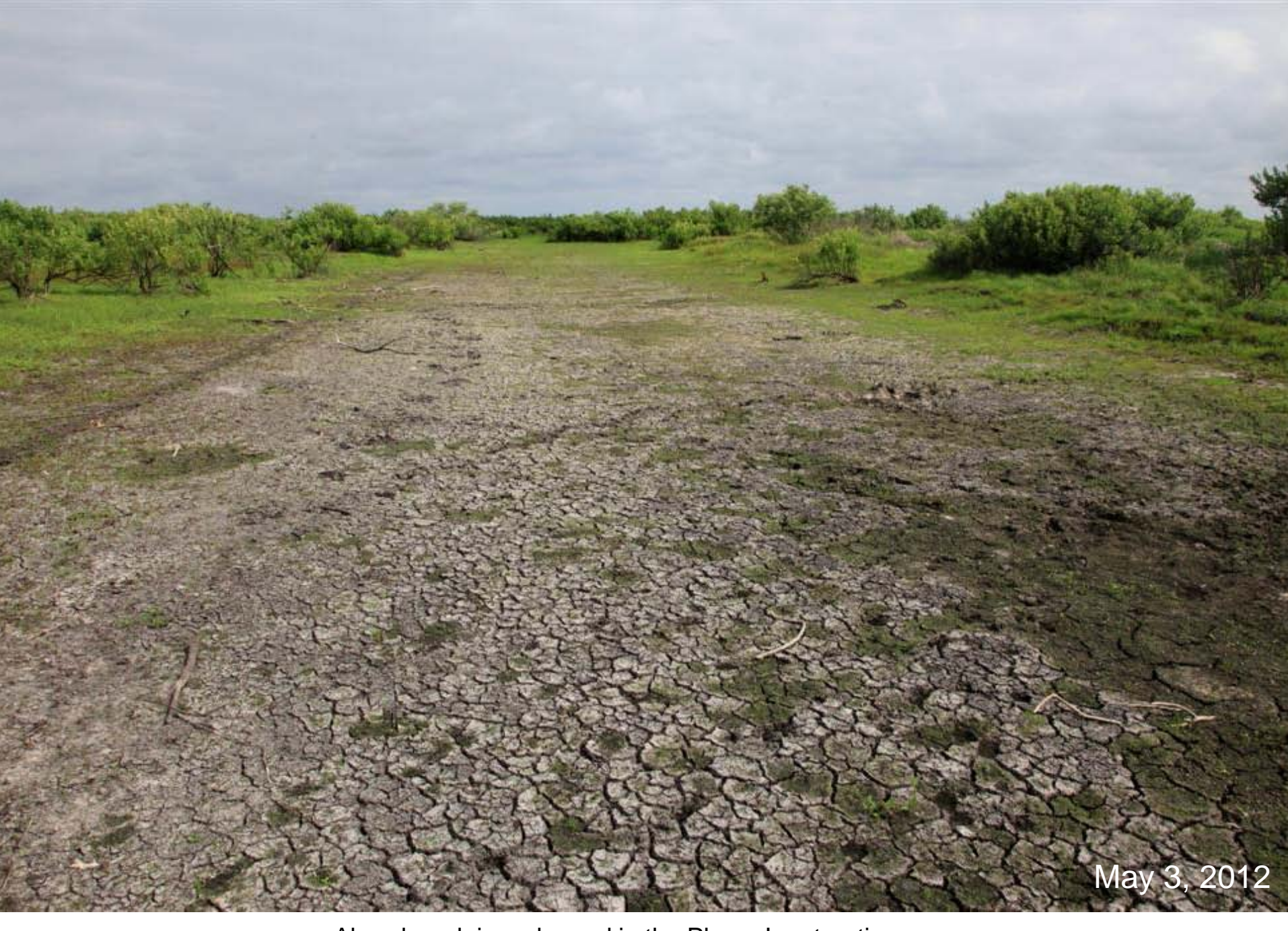
Abandoned river channel in the Phase I restoration area