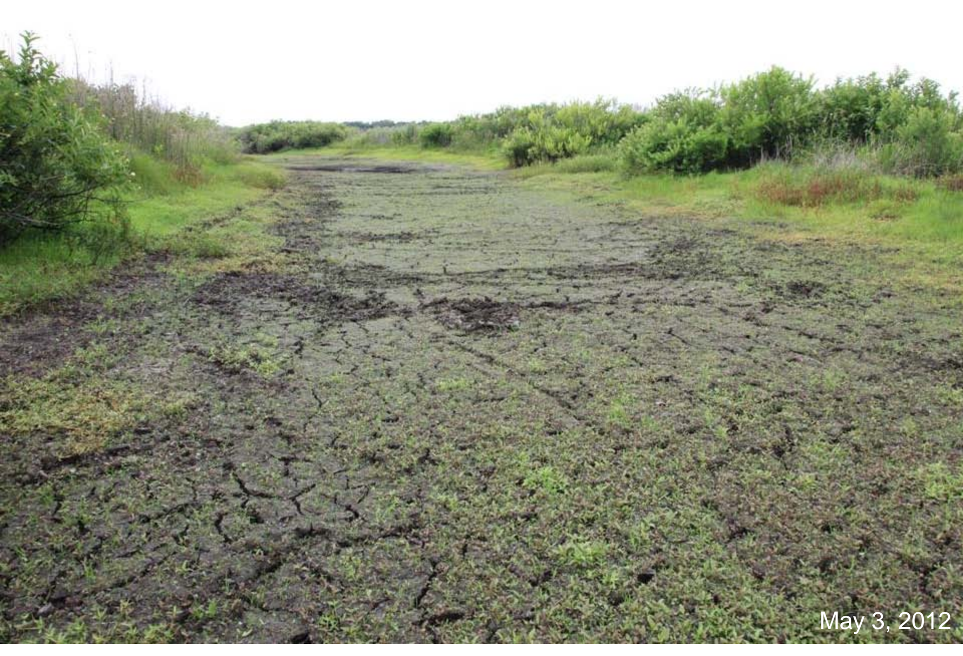
Abandoned river channel in the Phase I restoration area