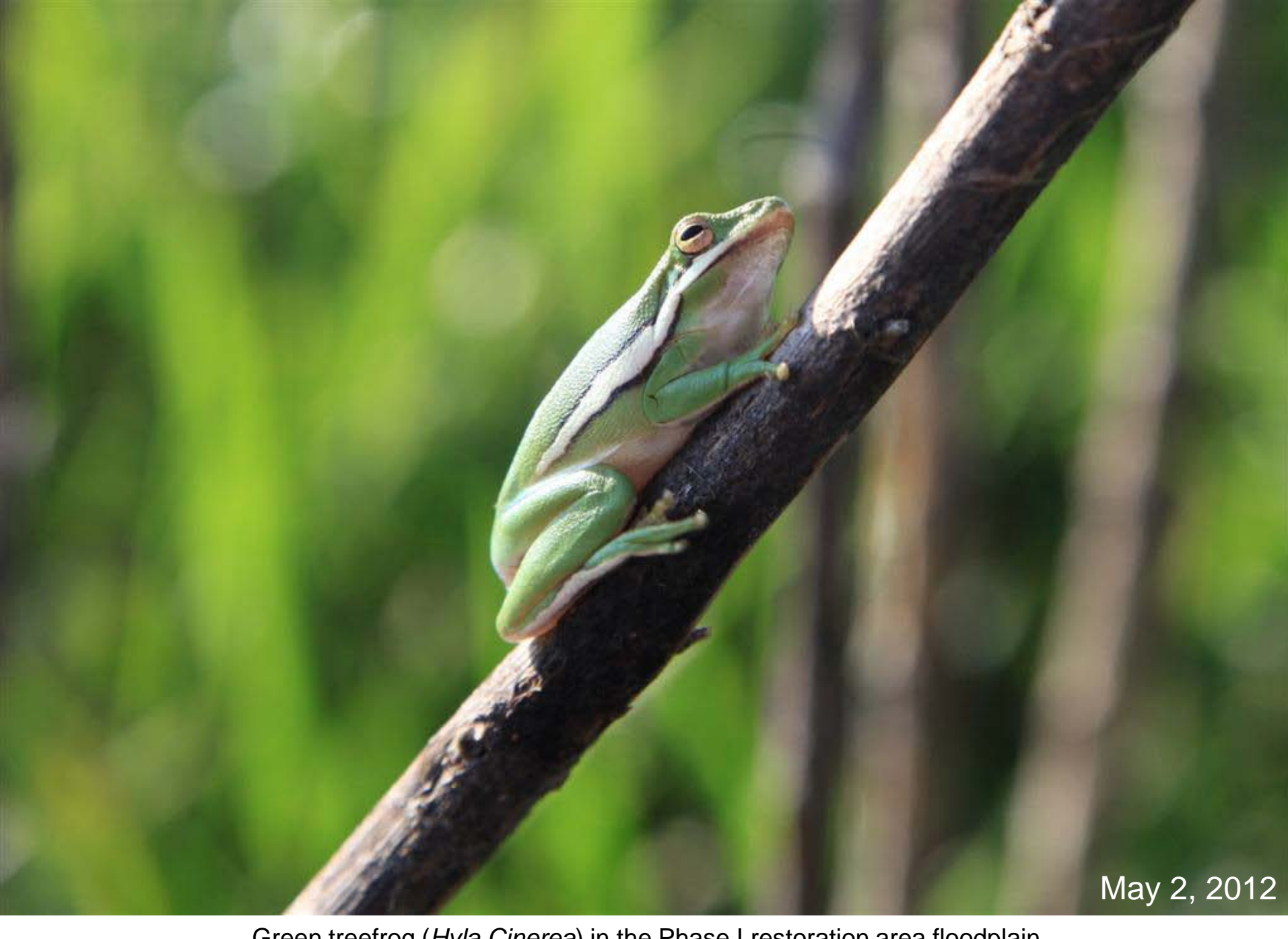
Green treefrog (Hyla Cinerea) in the Phase I restoration area floodplain