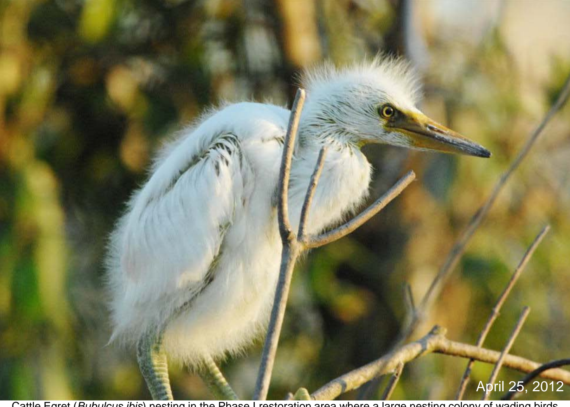
Cattle Egret ( Bubulcus ibis ) nesting in the Phase I restoration area where a large nesting colony of wading birds has formed.