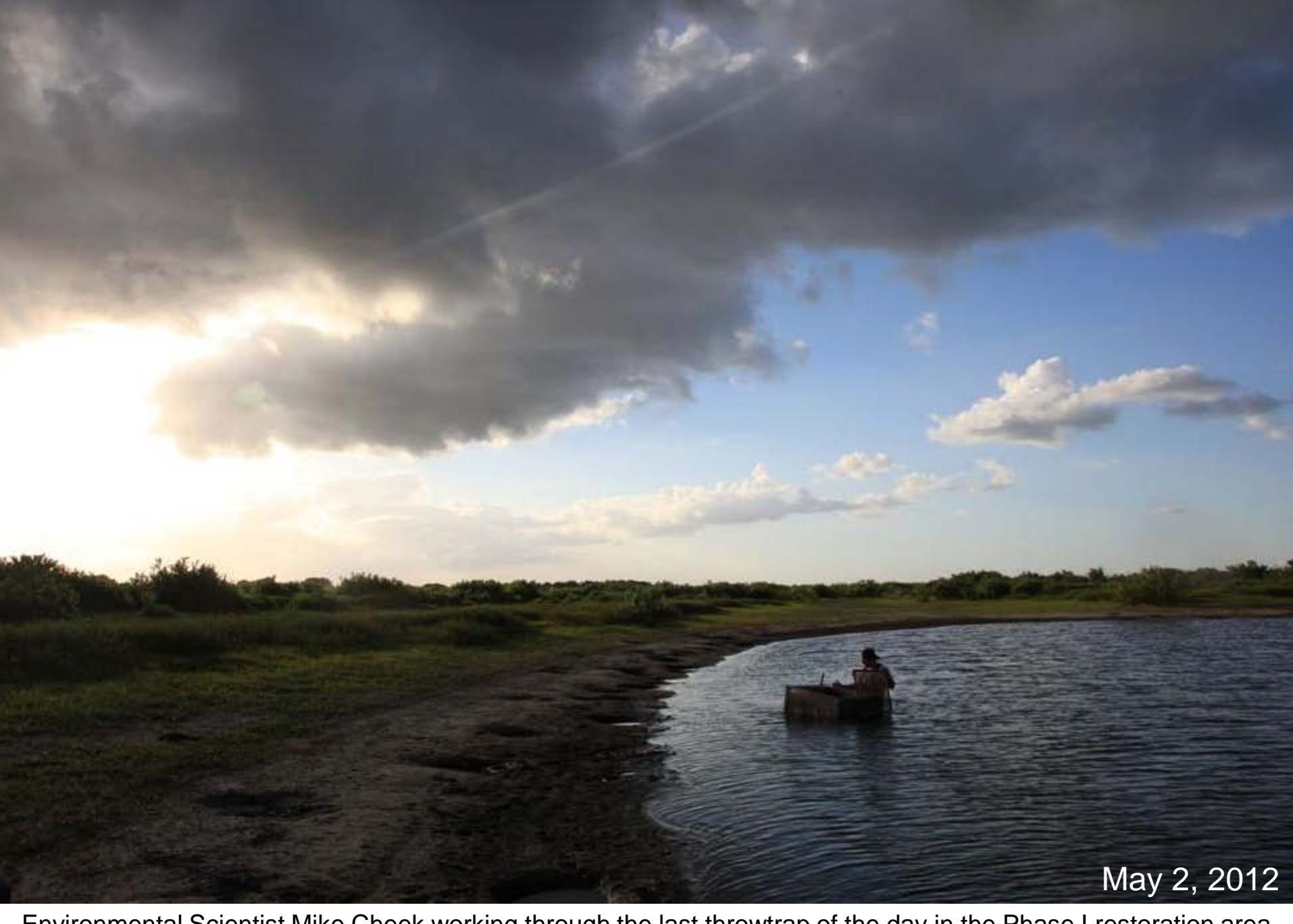
Environmental Scientist Mike Cheek working through the last throwtrap of the day in the Phase I restoration area floodplain