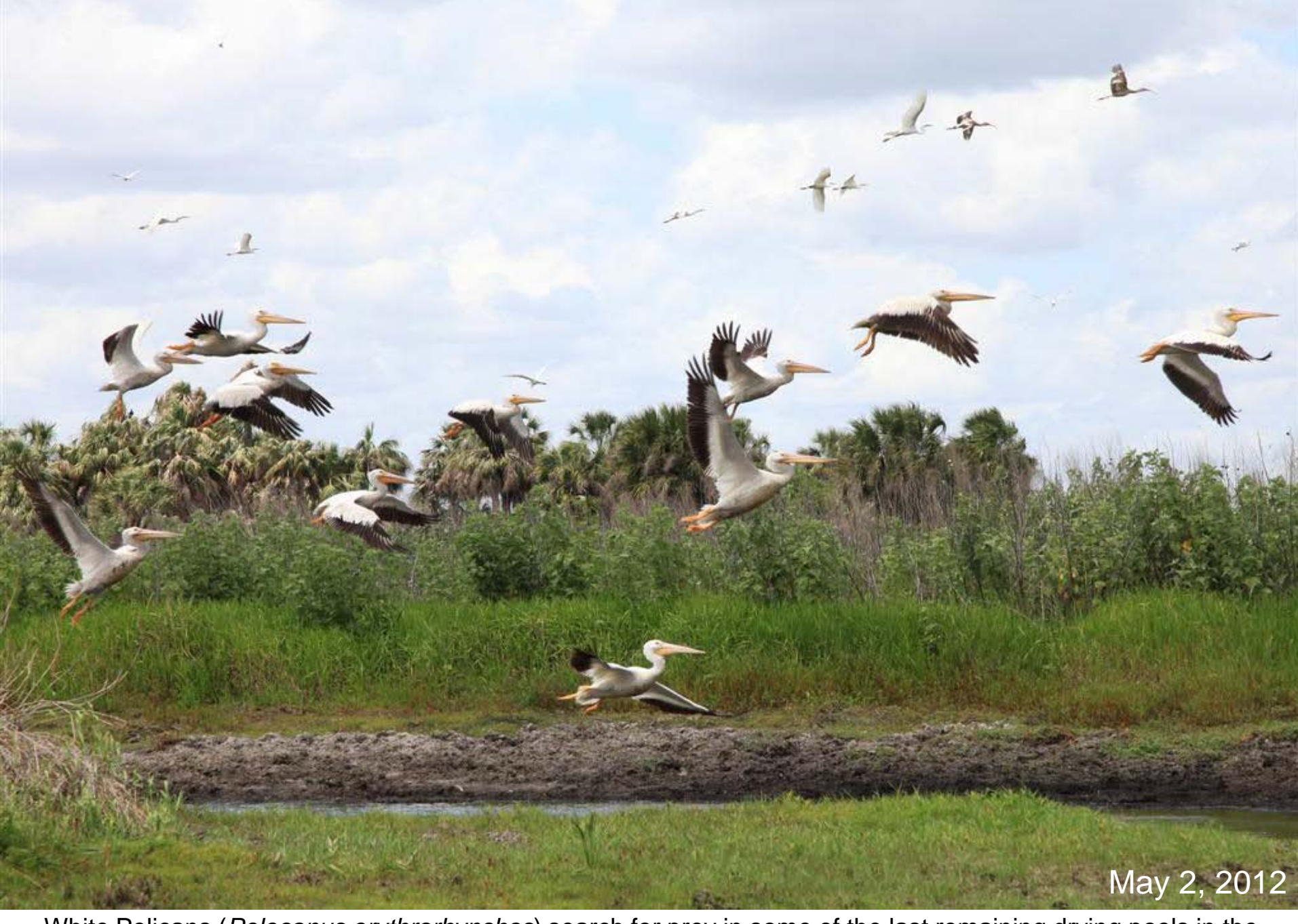
White Pelicans ( Pelecanus erythrorhynchos ) search for prey in some of the last remaining drying pools in the Phase I restoration area