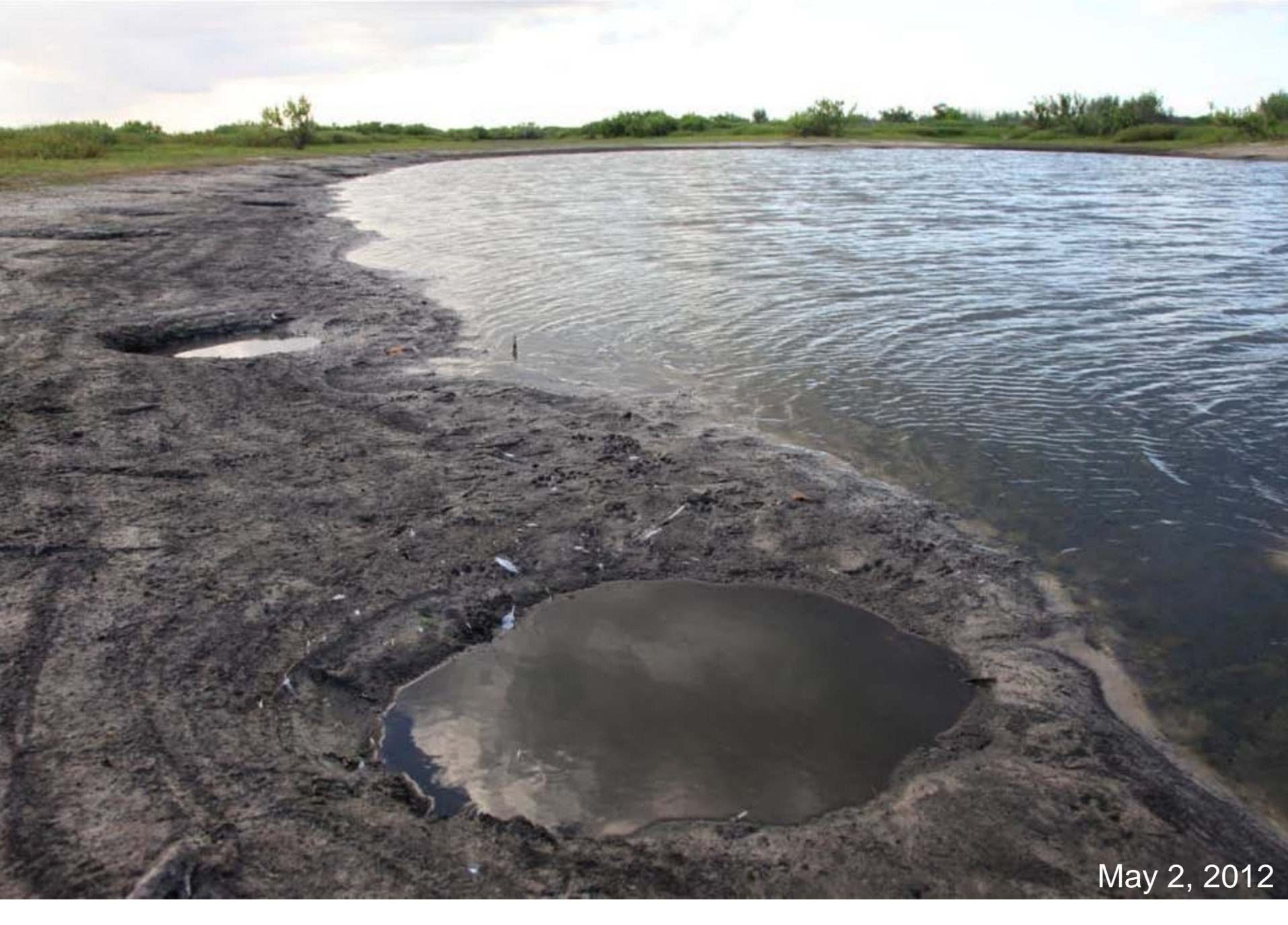
Fish nests become exposed along the Phase I restoration area abandoned river channels