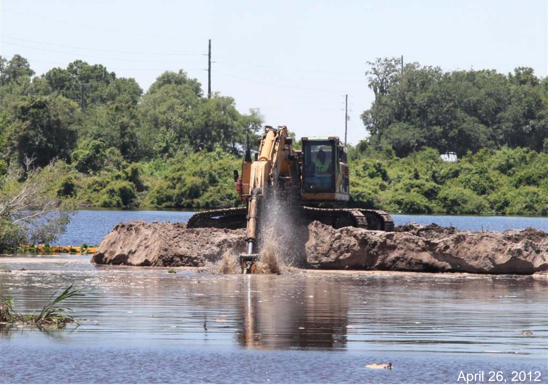
Contract 10A Reach 2 river channel recarve