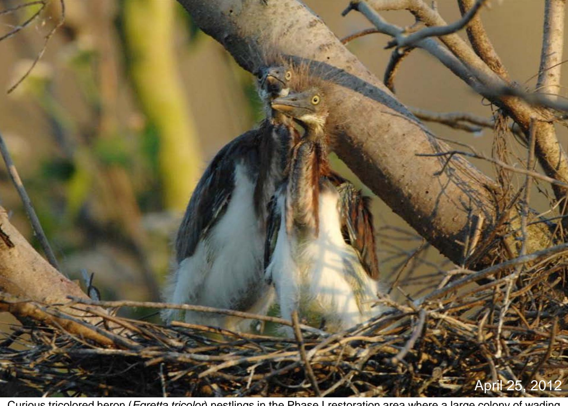
Curious tricolored heron ( Egretta tricolor ) nestlings in the Phase I restoration area where a large colony of wading birds has formed.