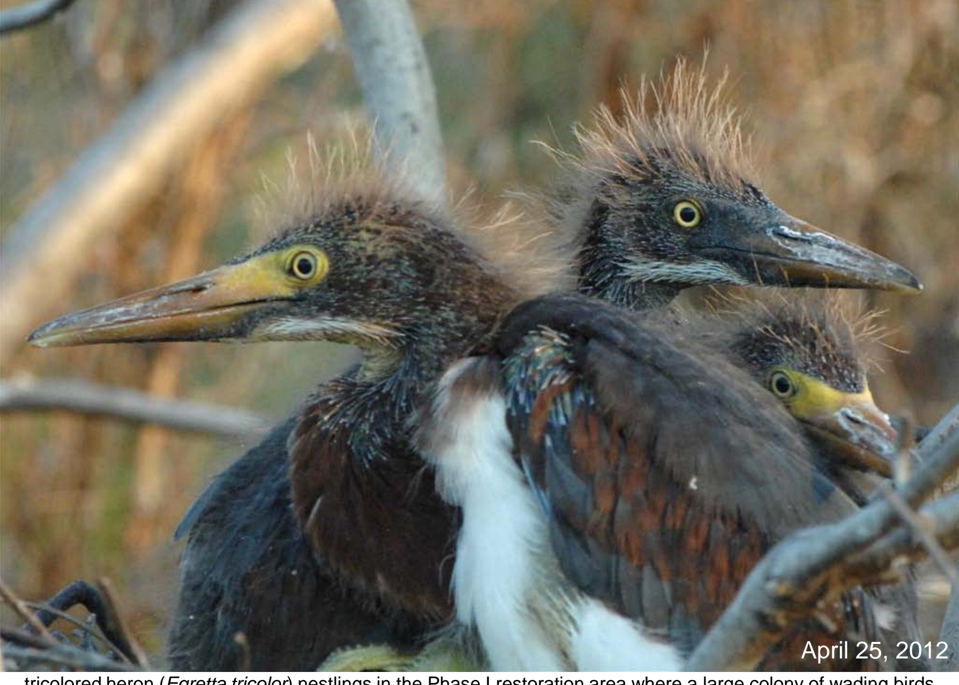
tricolored heron ( Egretta tricolor ) nestlings in the Phase I restoration area where a large colony of wading birds has formed.