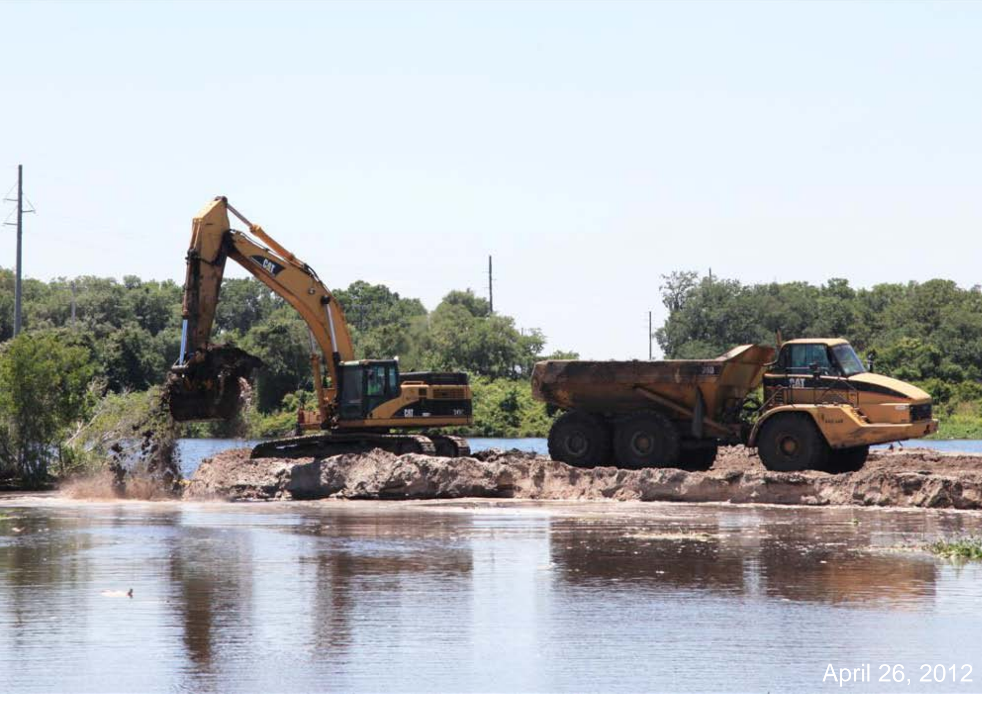
Contract 10A Reach 2 river channel recarve