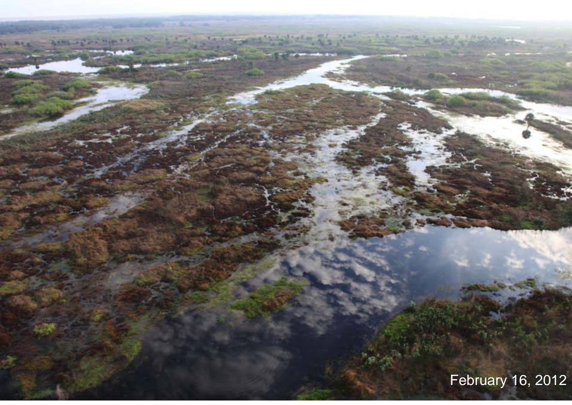
Phase I restoration area floodplain