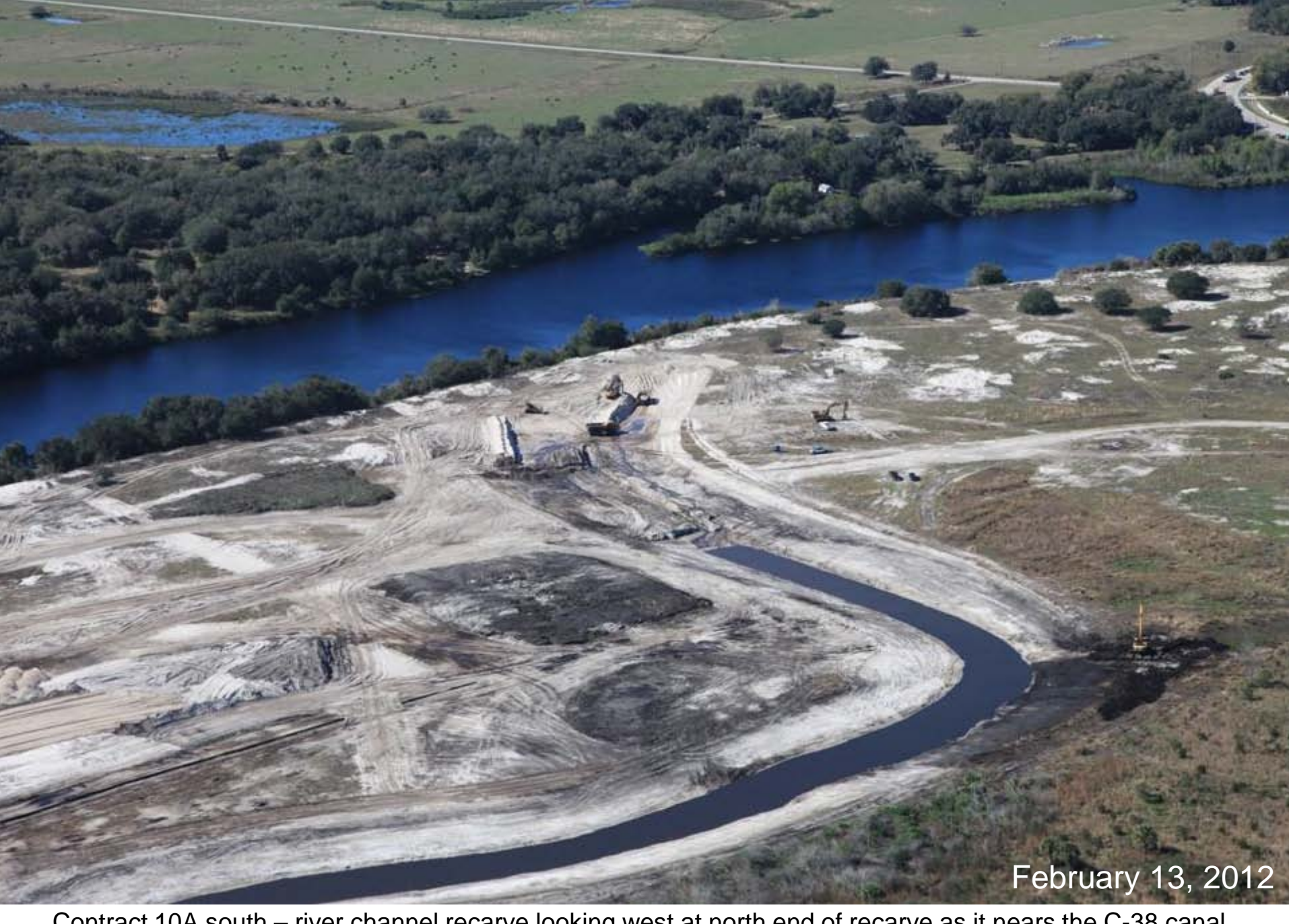
Contract 10A south – river channel recarve looking west at north end of recarve as it nears the C-38 canal just south of HW98.