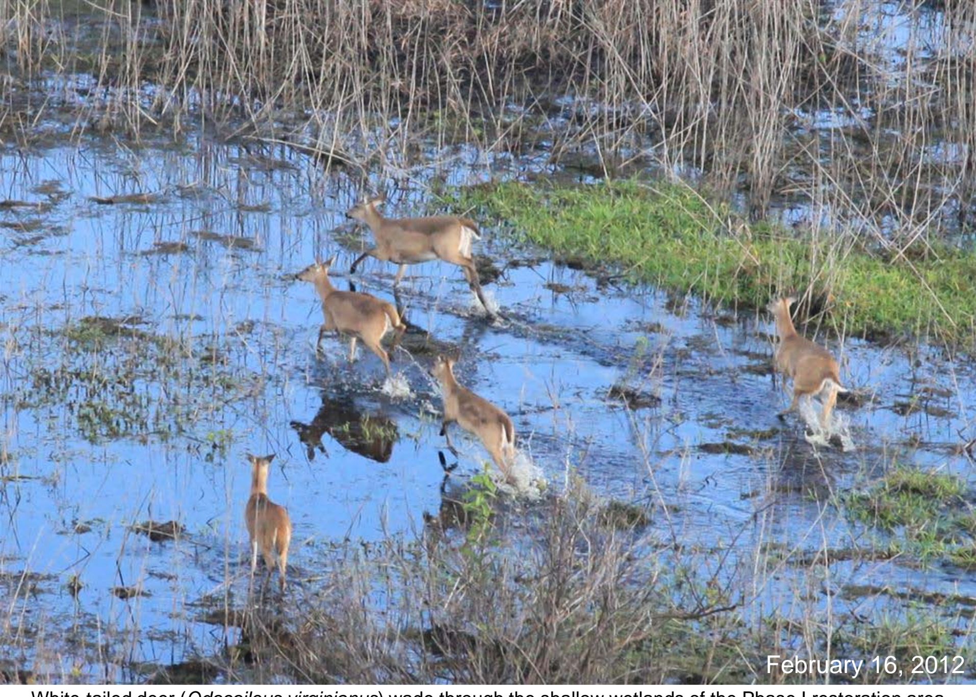
White-tailed deer ( Odocoileus virginianus ) wade through the shallow wetlands of the Phase I restoration area floodplain