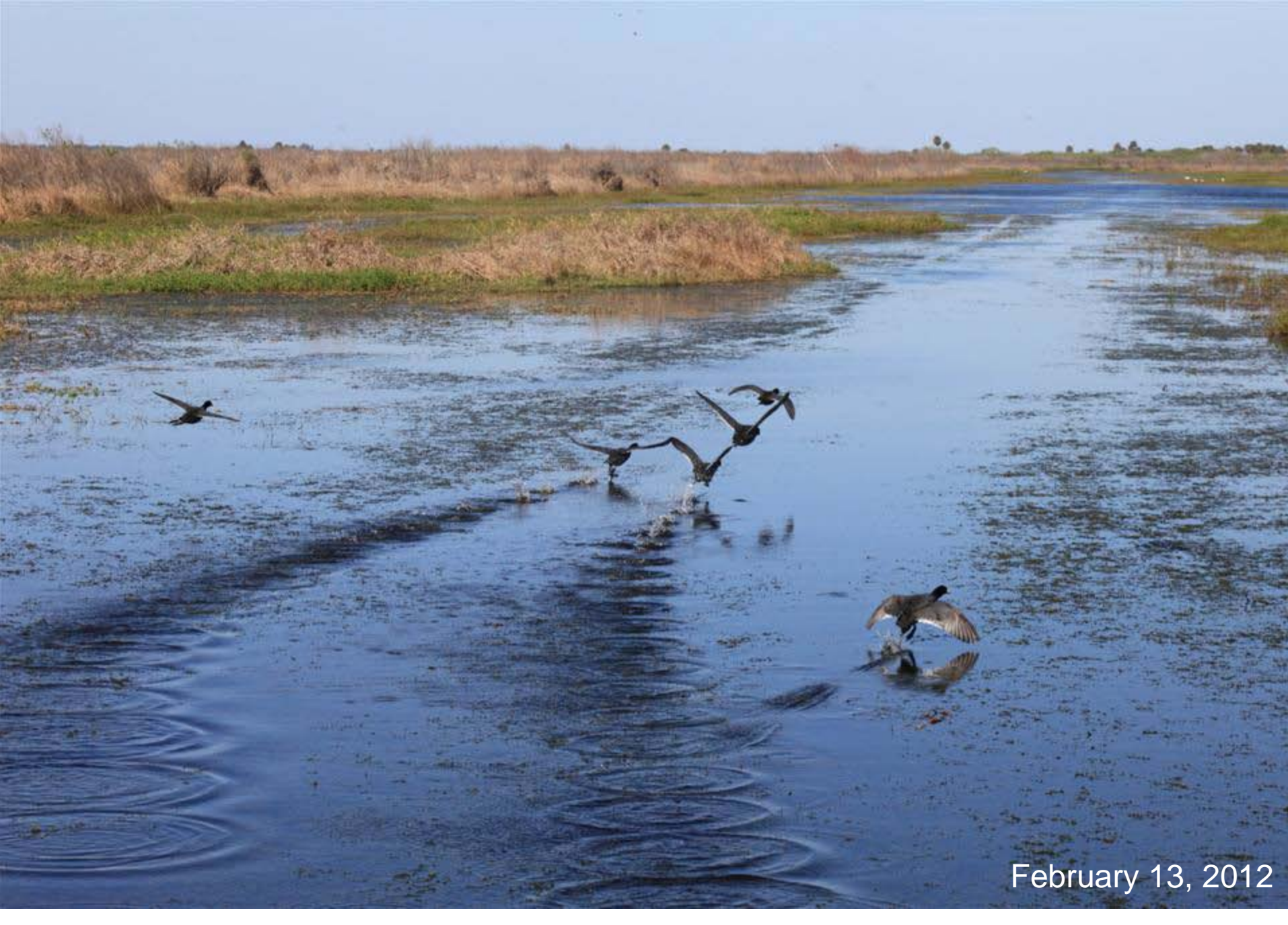
American coots (Fulica americana) scurry in the Phase I restoration area floodplain