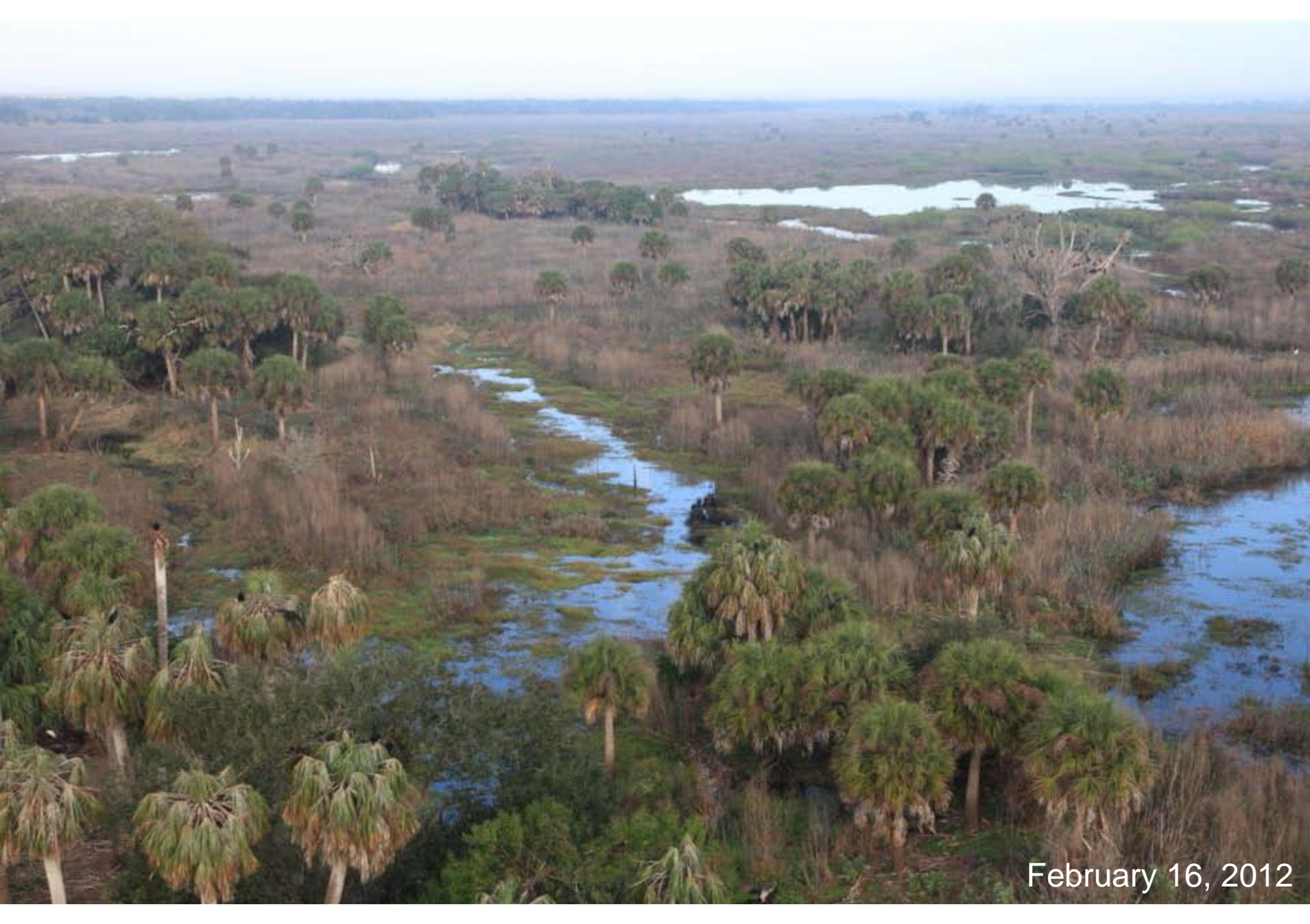
Phase I restoration area floodplain