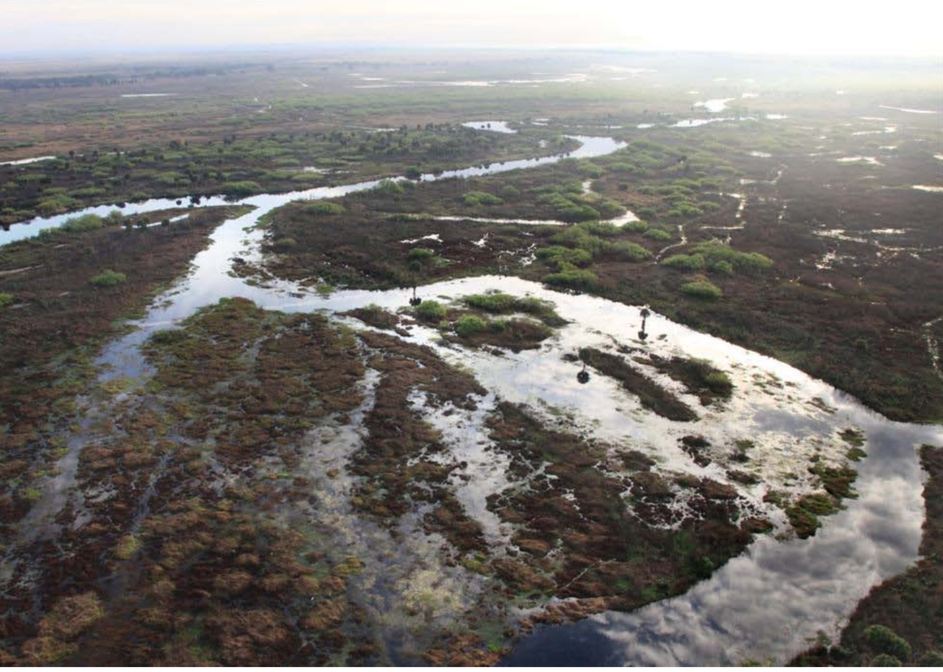
Phase I restoration area floodplain and river channel