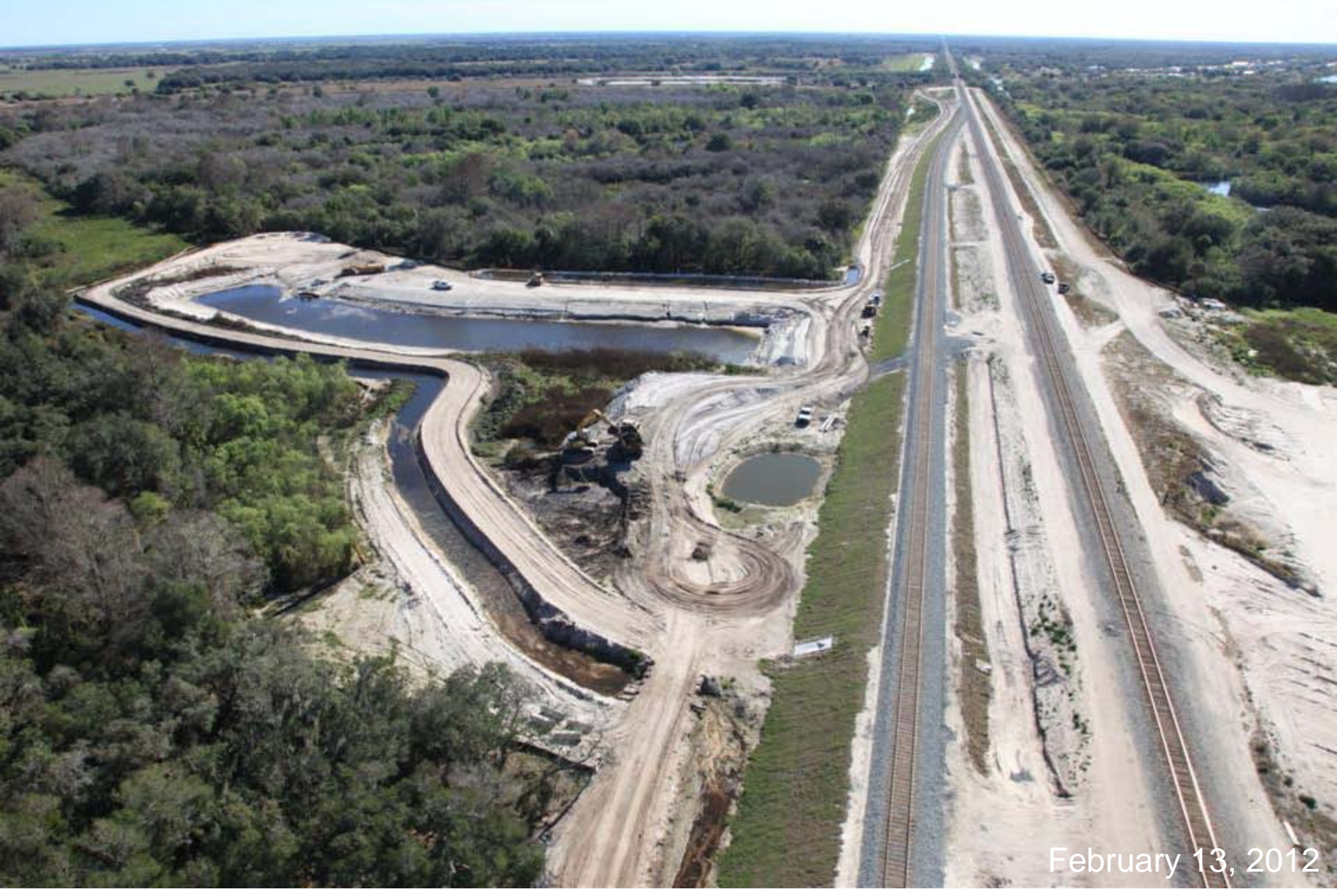
Looking east at the CSX Railroad bypass track. The old culverts and bridge will be demolished and a new navigable bridge will be constructed to reconnect the historic channel underneath the railway.