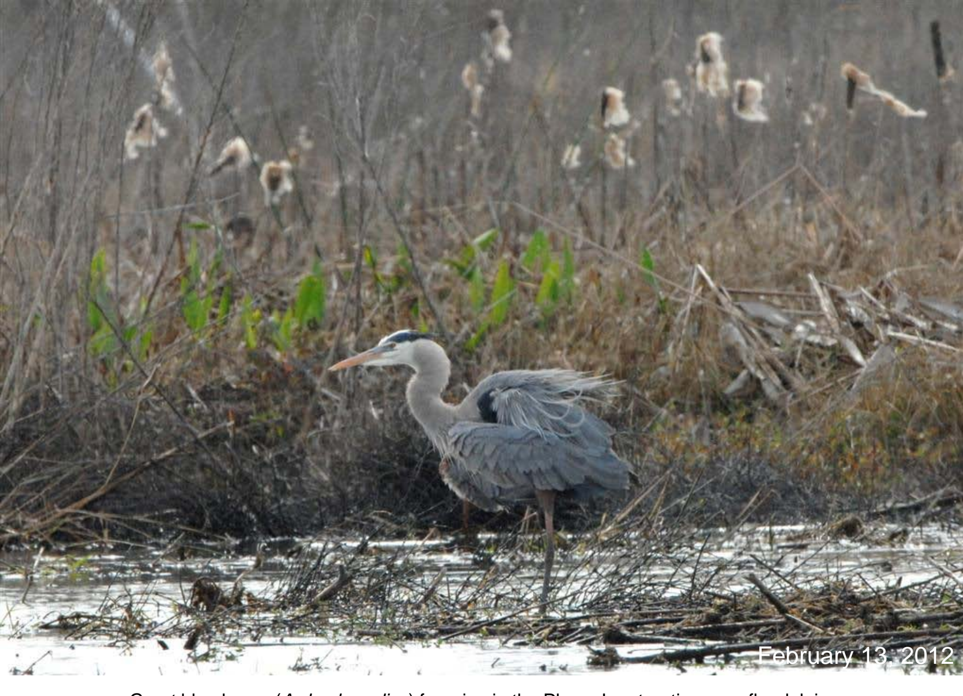
Great blue heron (Ardea herodias) foraging in the Phase I restoration area floodplain