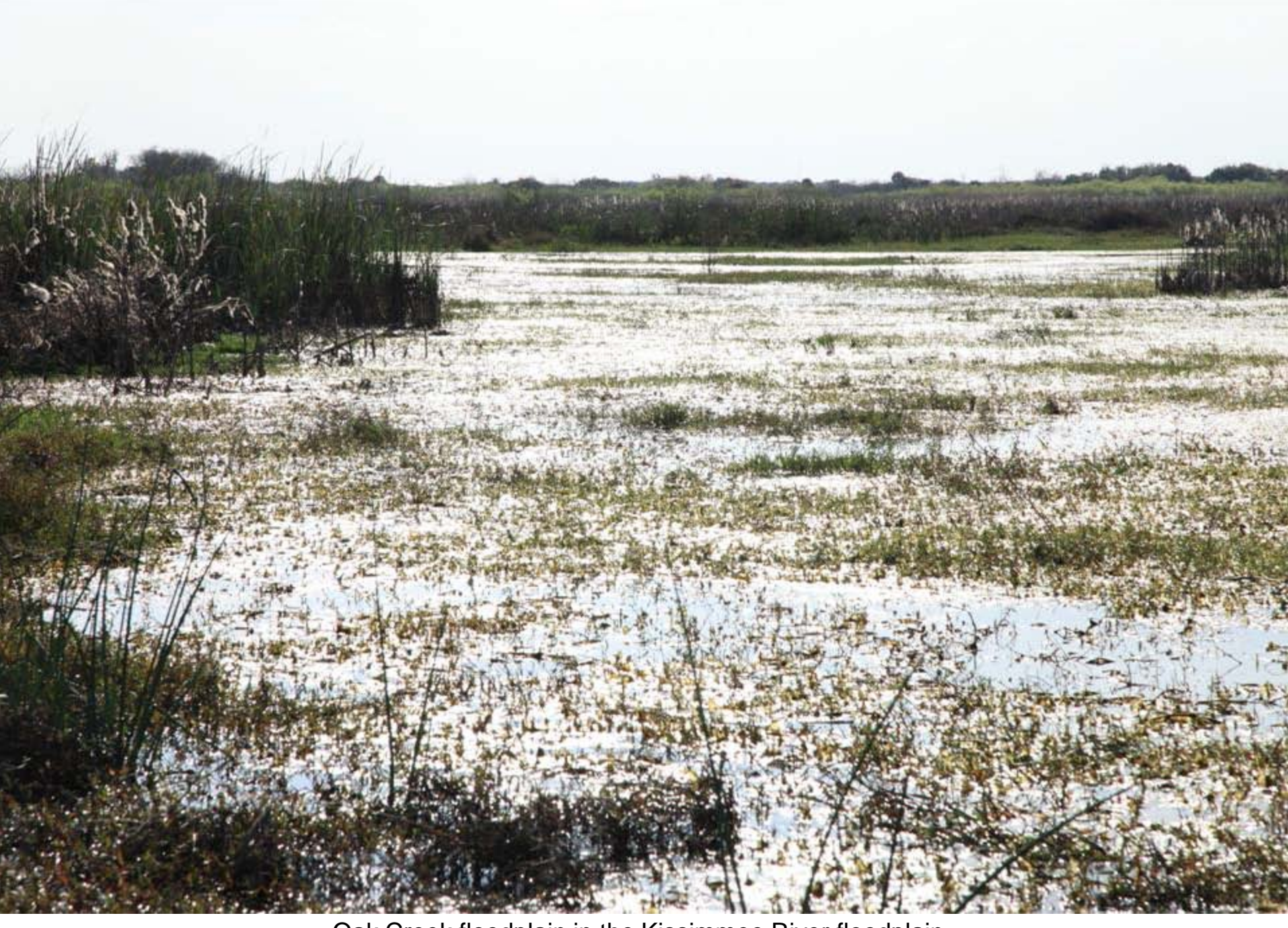
Oak Creek floodplain in the Kissimmee River floodplain