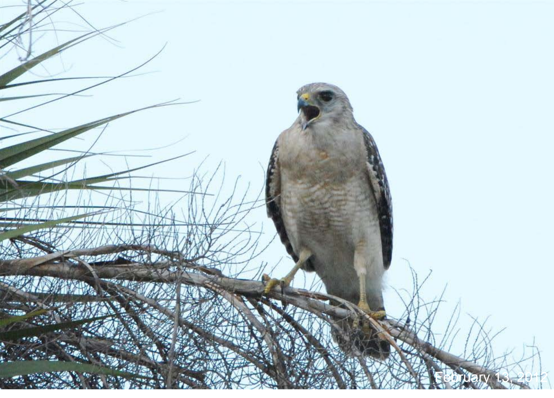
Red shouldered hawk (Buteo lineatus) lets out a warning shriek...