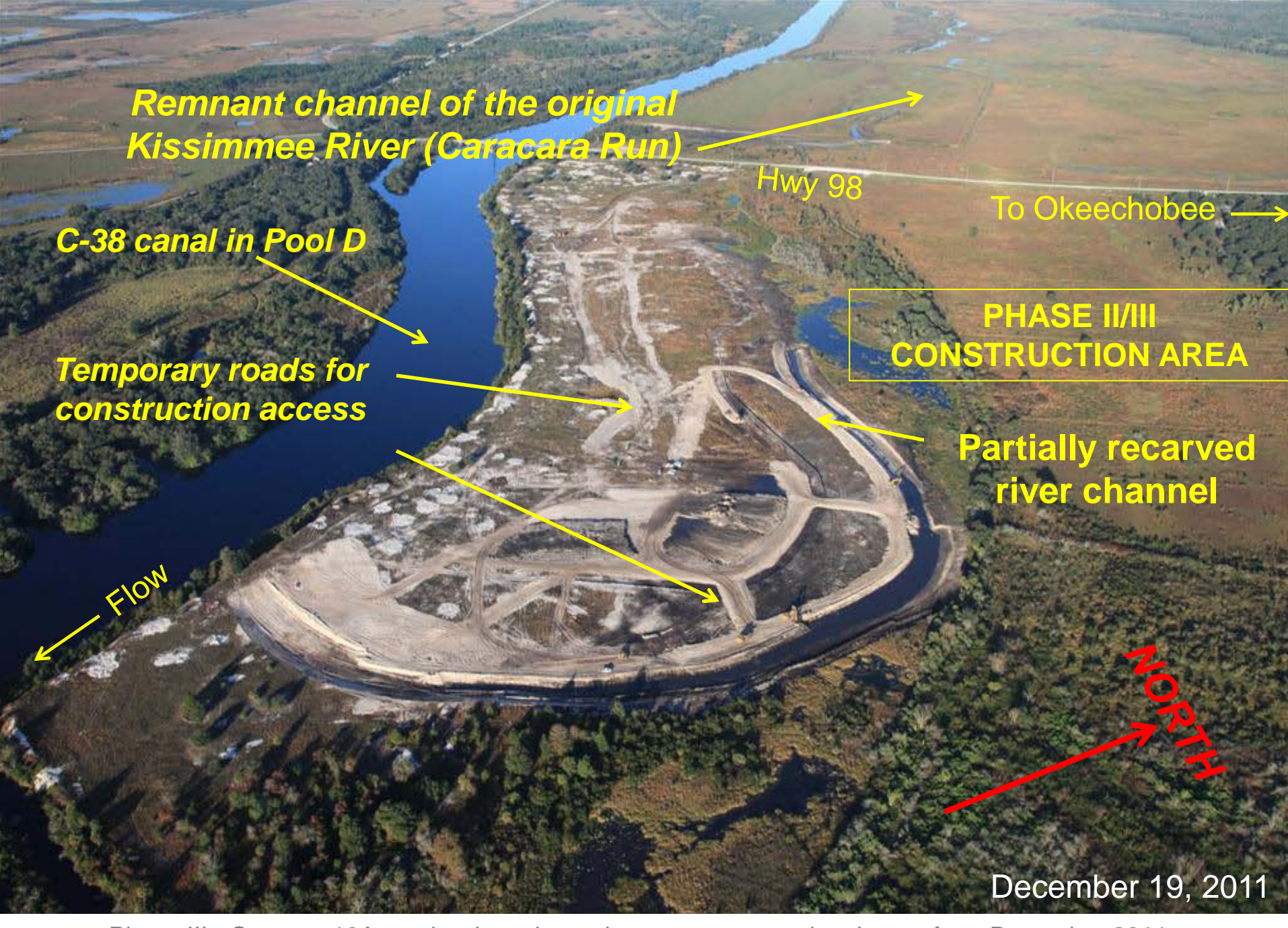
Phase III - Contract 10A south - river channel recarve construction. Image from December 2011