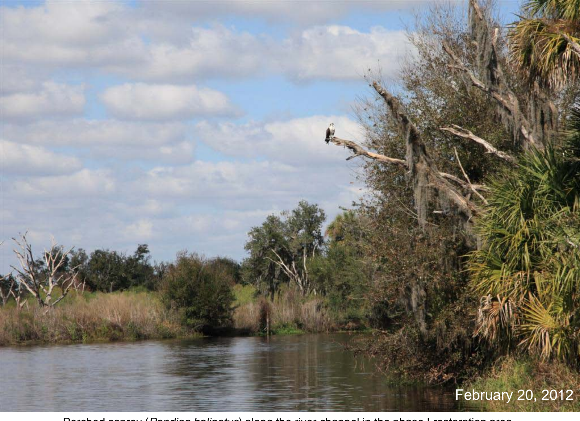
Perched osprey (Pandion haliaetus) along the river channel in the phase I restoration area