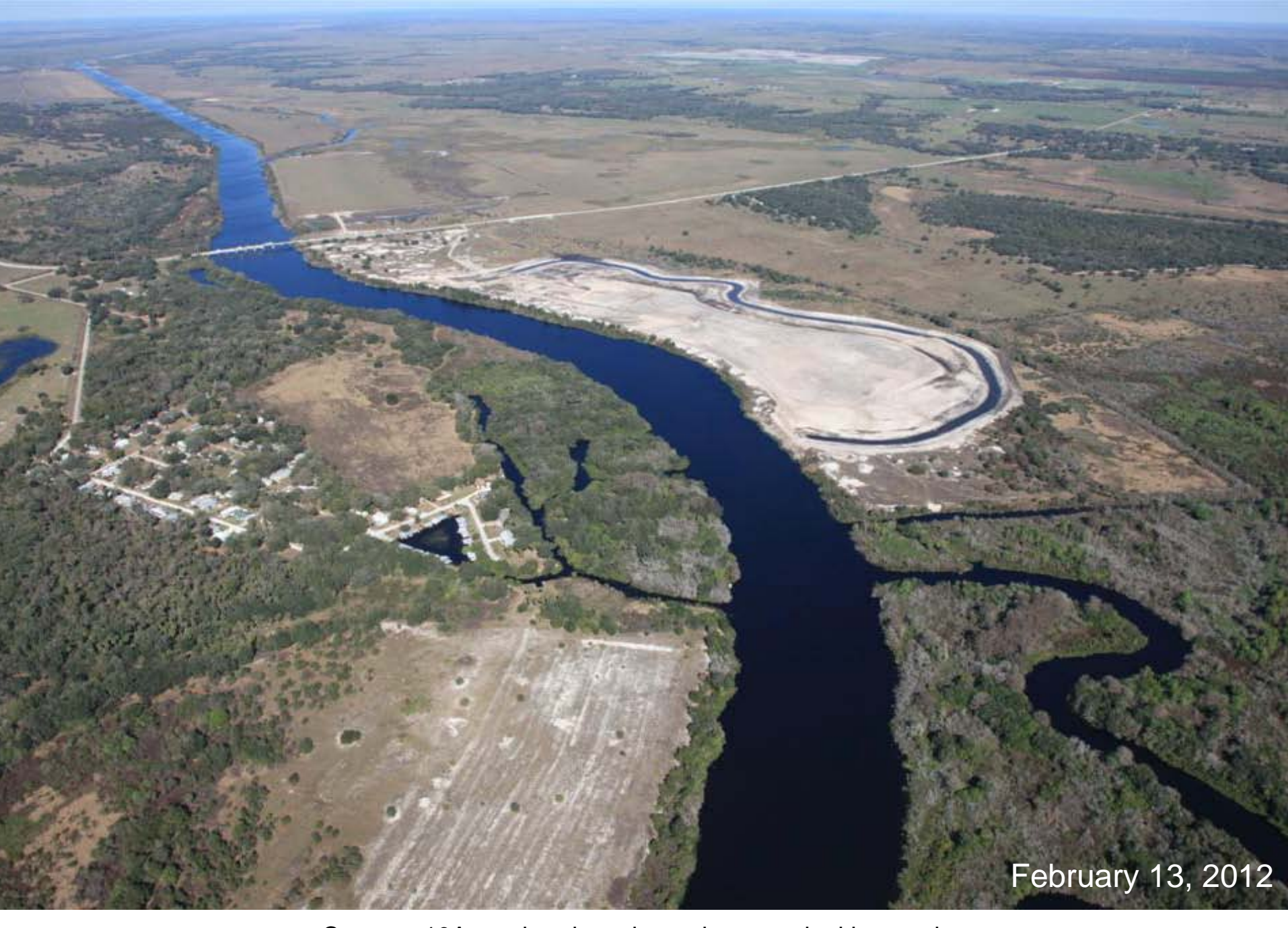
Contract 10A south – river channel recarve looking north.