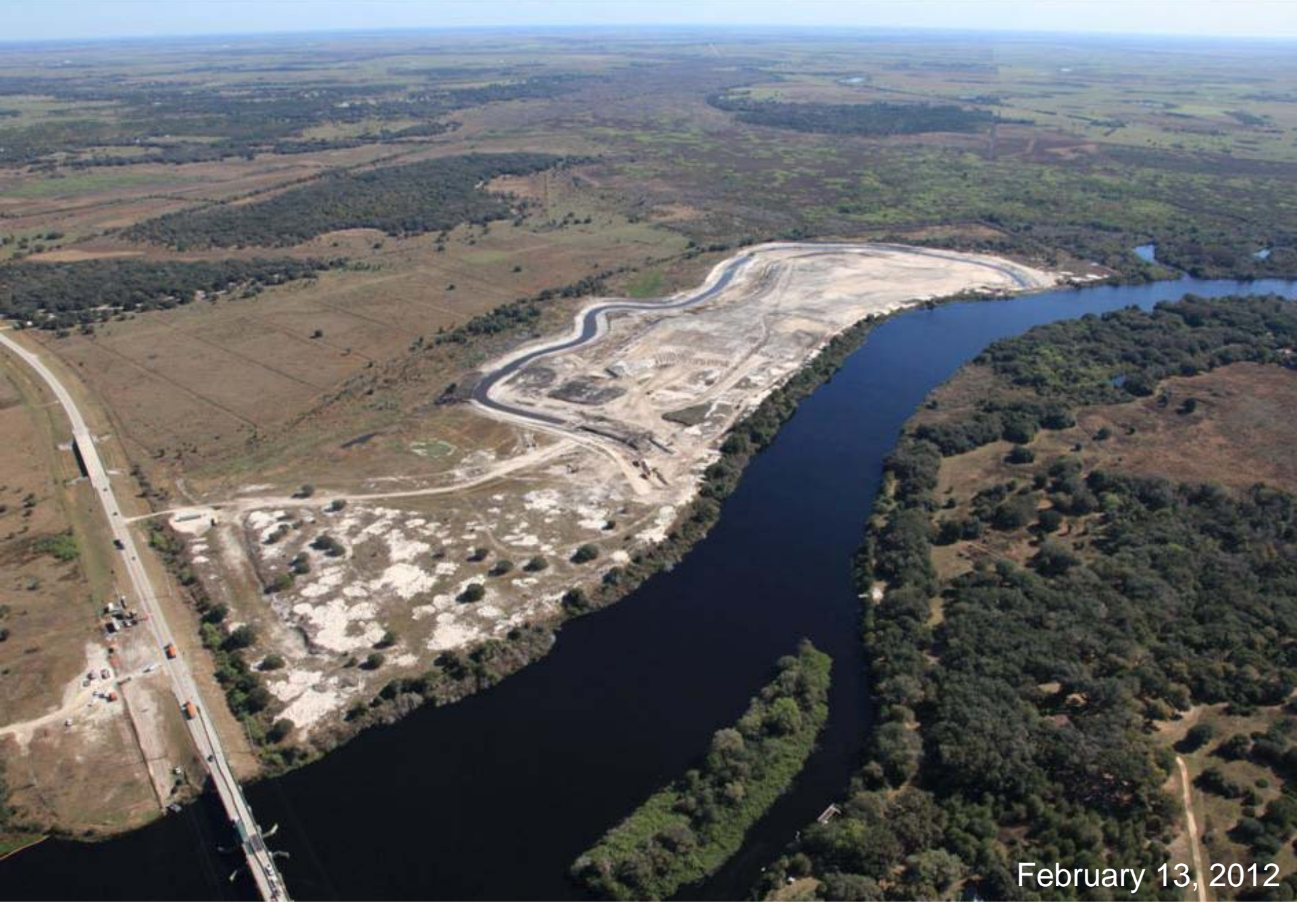
Contract 10A south – river channel recarve looking southeast from HW98