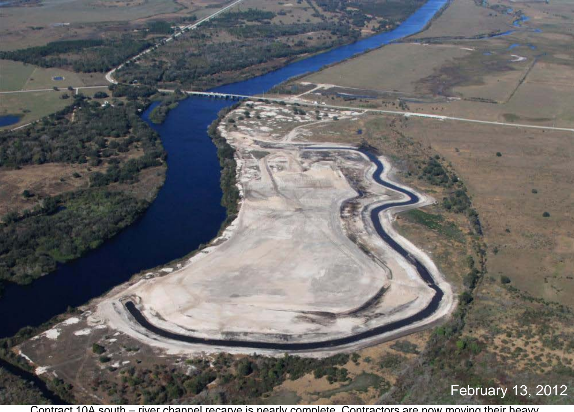
Contract 10A south – river channel recarve is nearly complete. Contractors are now moving their heavy equipment to the next section of recarve on the north side of HW 98.