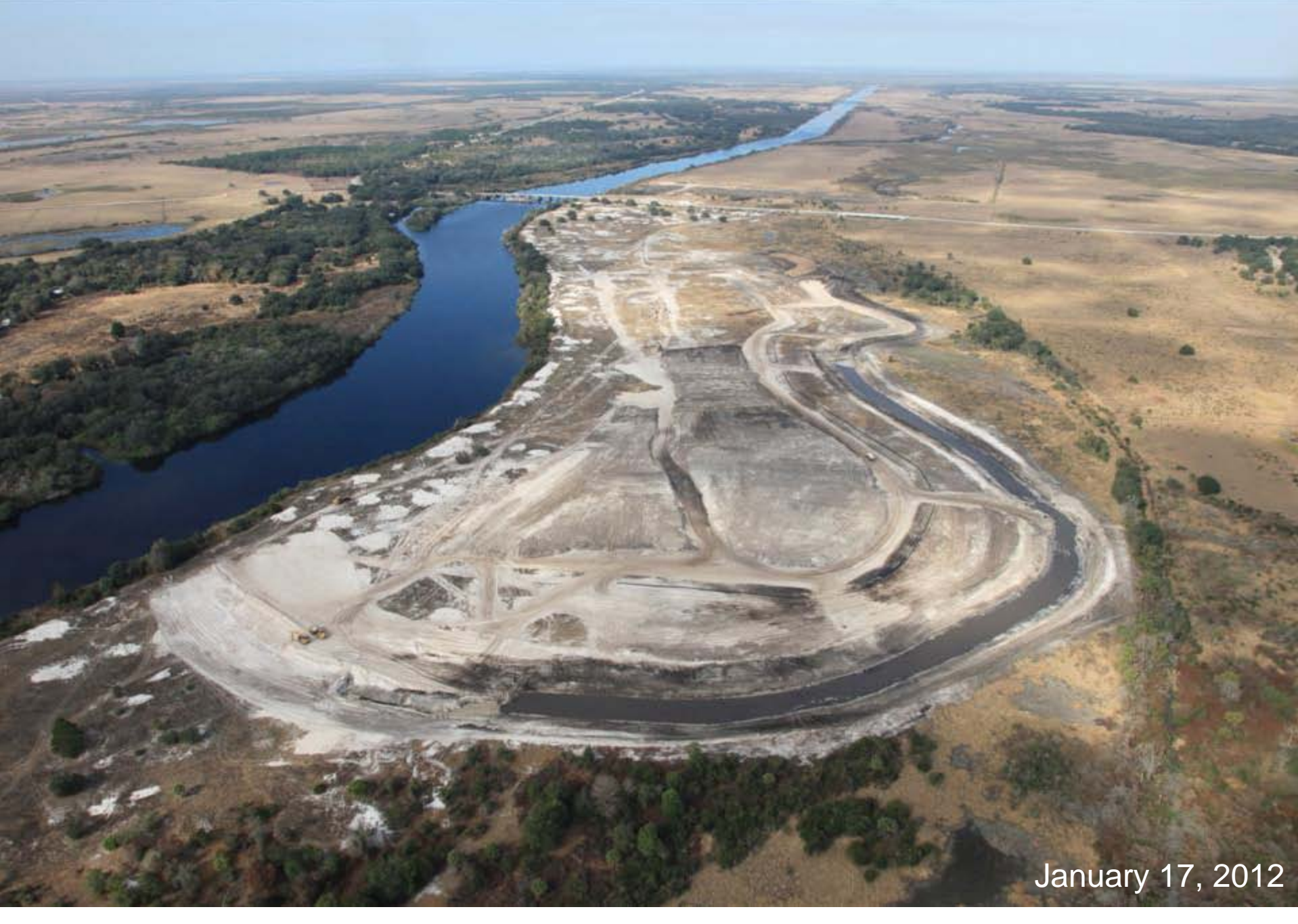
Phase III - Contract 10A south - river channel recarve construction. Image from January 2012