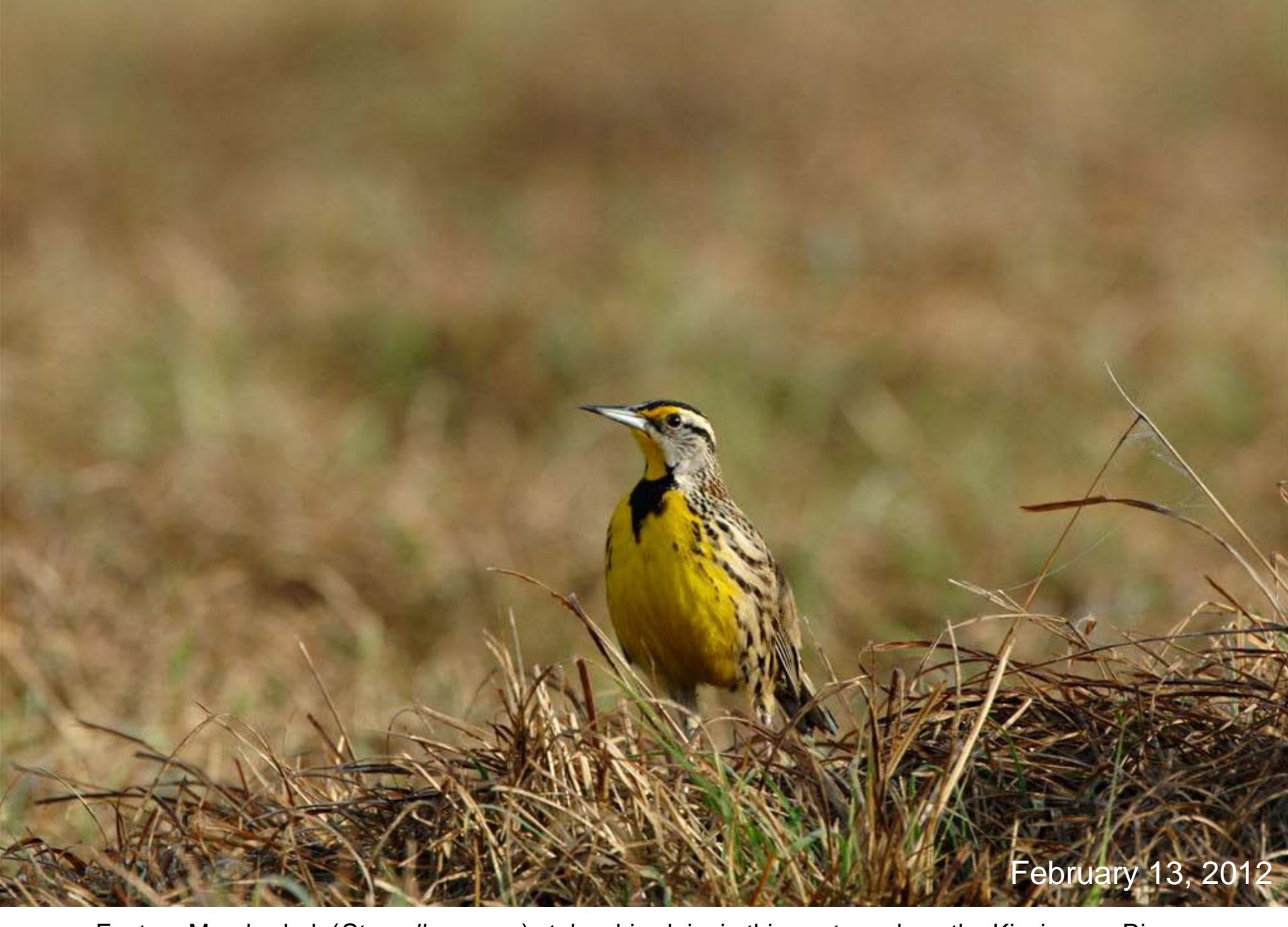
Eastern Meadowlark (Sturnella magna) stakes his claim in this pasture along the Kissimmee River