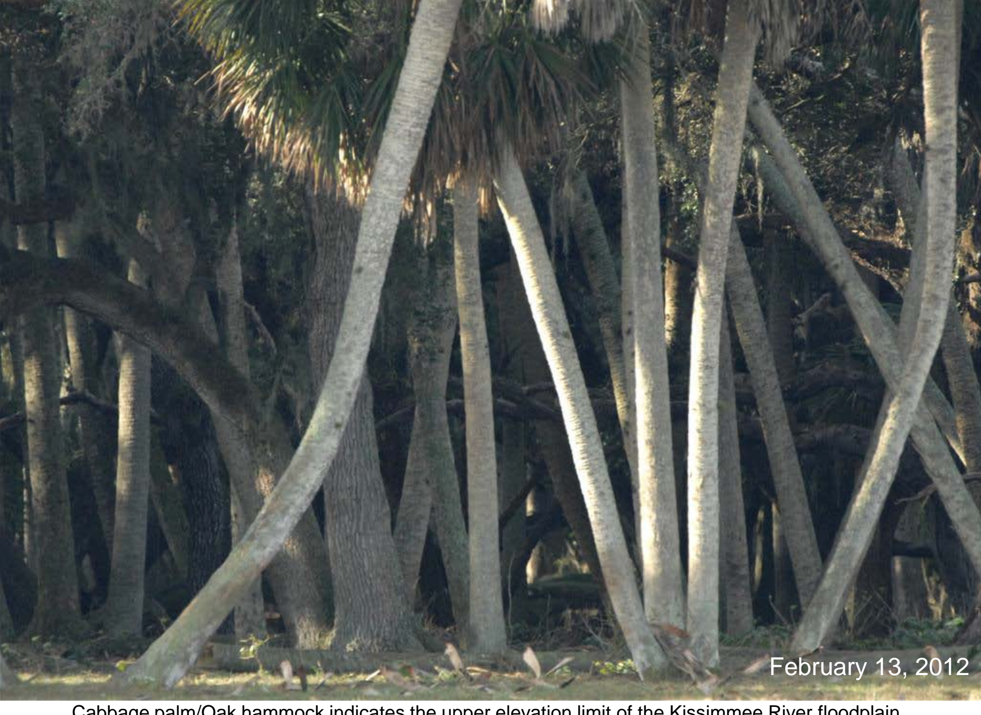
Cabbage palm/Oak hammock indicates the upper elevation limit of the Kissimmee River floodplain