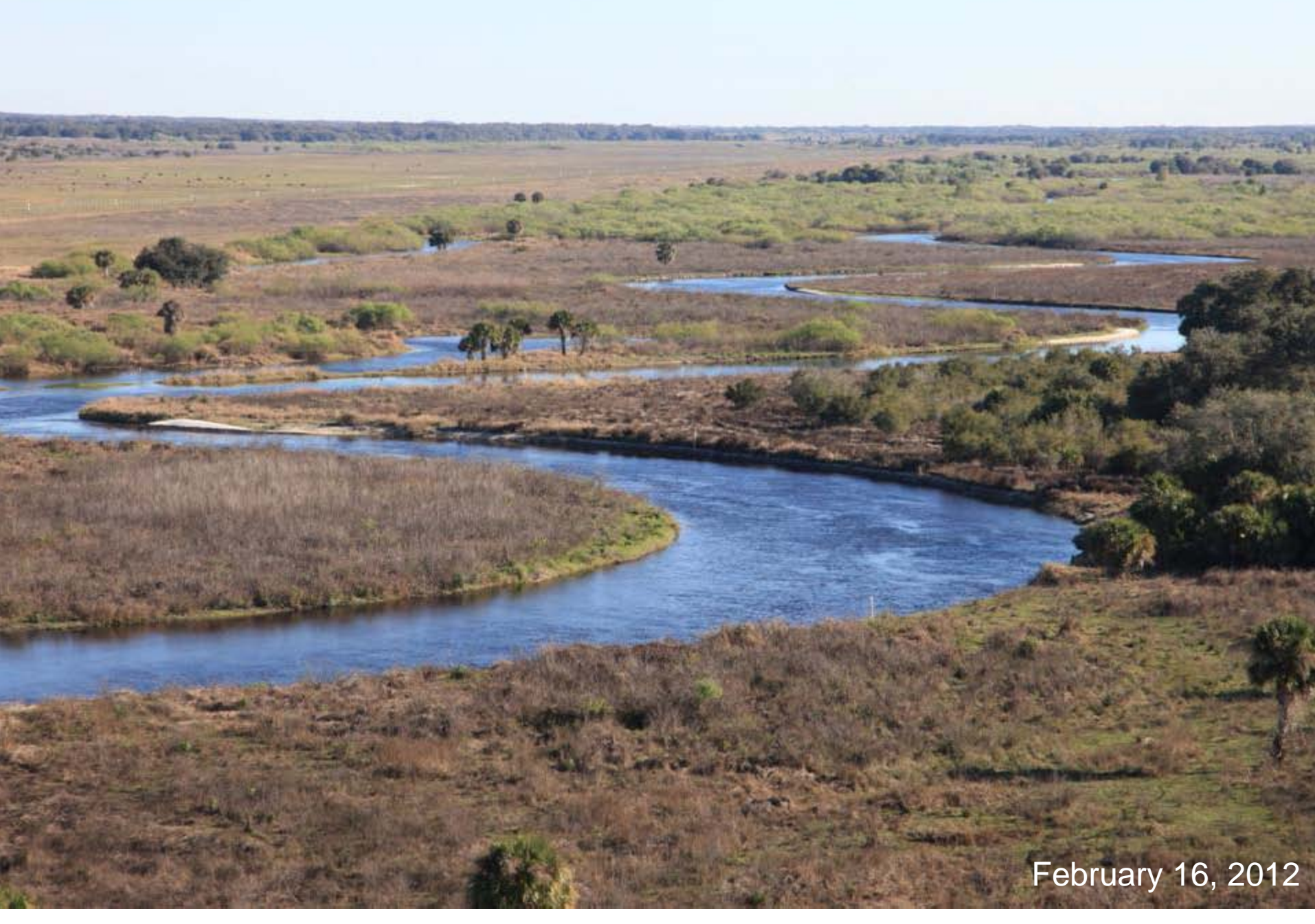
Phase I restoration area river channel