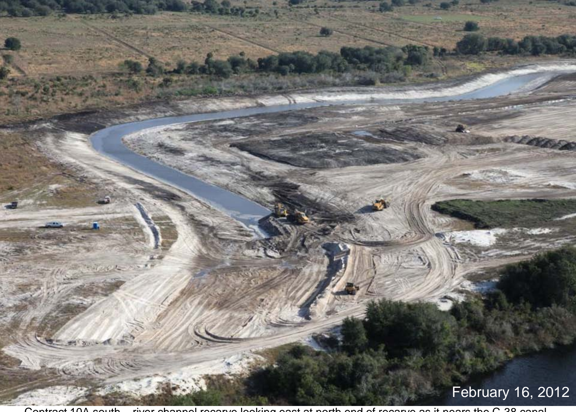
Contract 10A south – river channel recarve looking east at north end of recarve as it nears the C-38 canal just south of HW98.