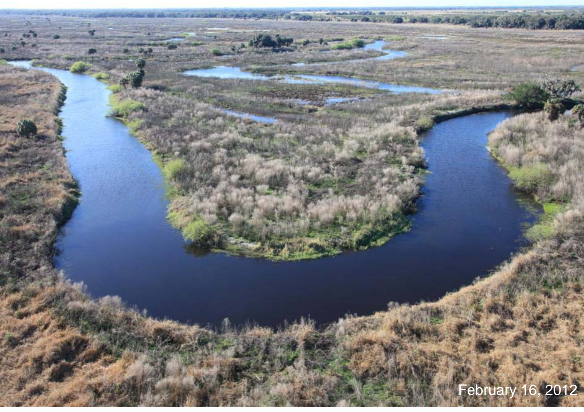
Phase I restoration area oxbow