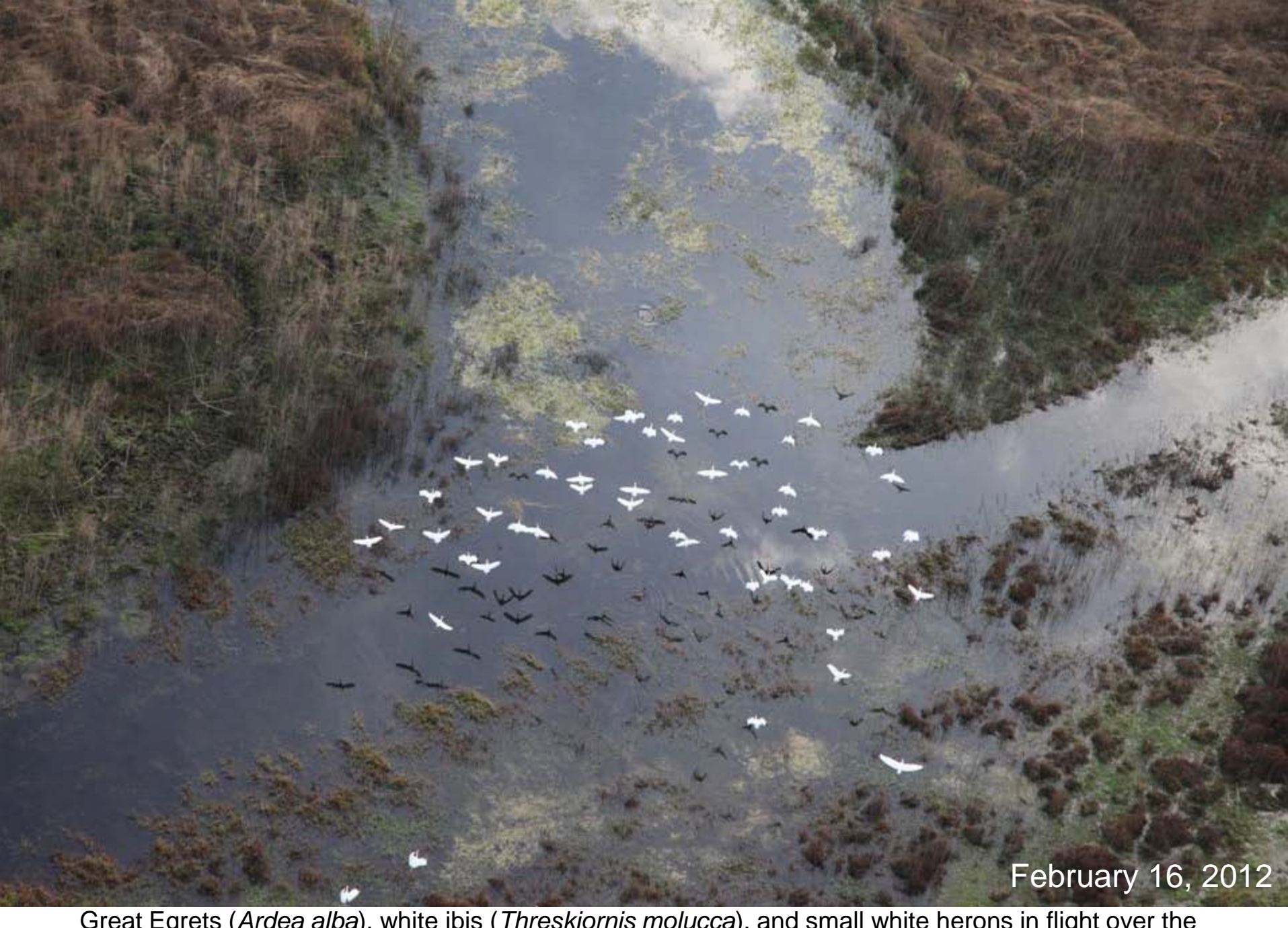
Great Egrets ( Ardea alba ), white ibis ( Threskiornis molucca ), and small white herons in flight over the Kissimmee River Phase I restoration area