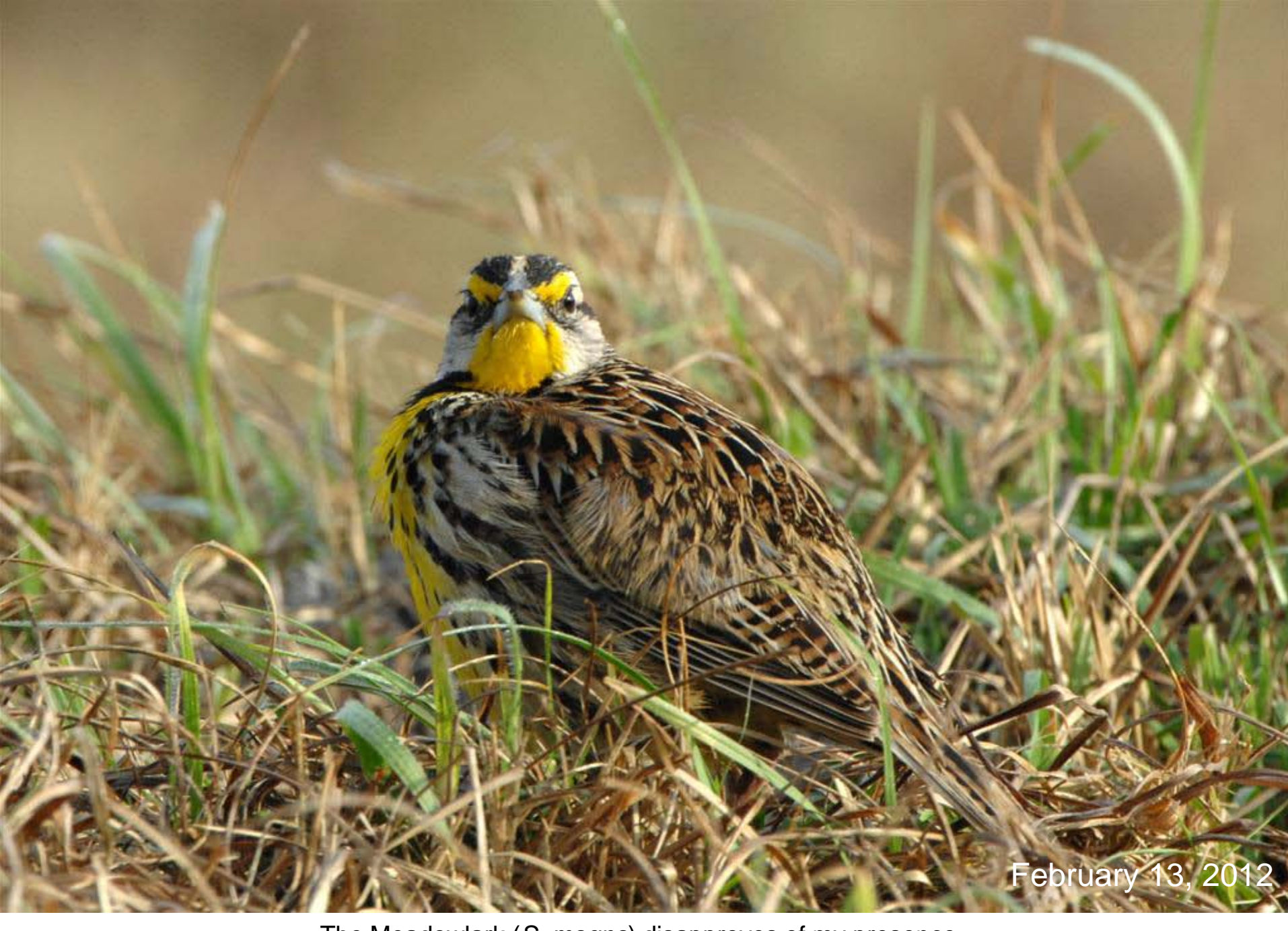
The Meadowlark (S. magna) disapproves of my presence