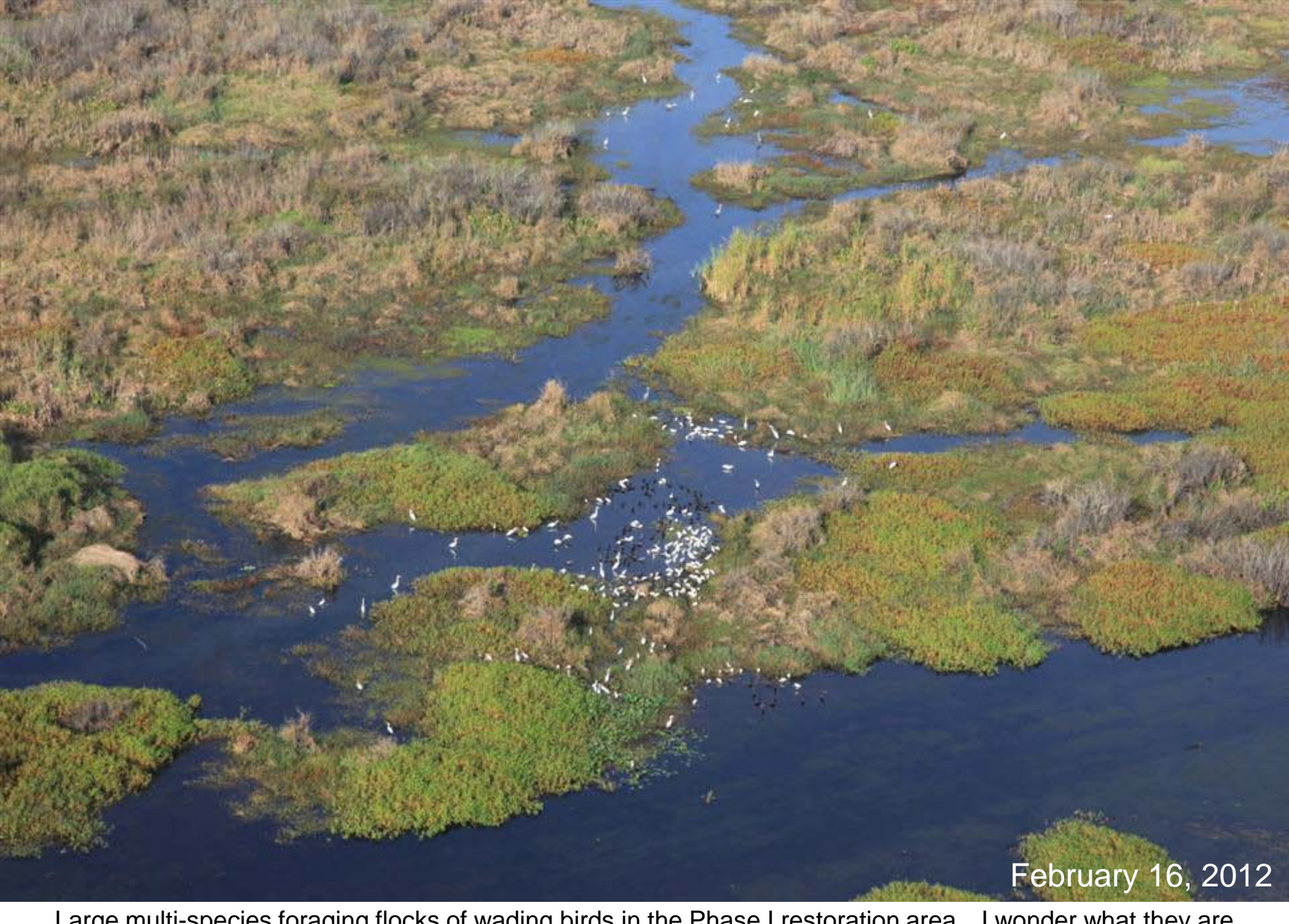
Large multi-species foraging flocks of wading birds in the Phase I restoration area...I wonder what they are eating?...