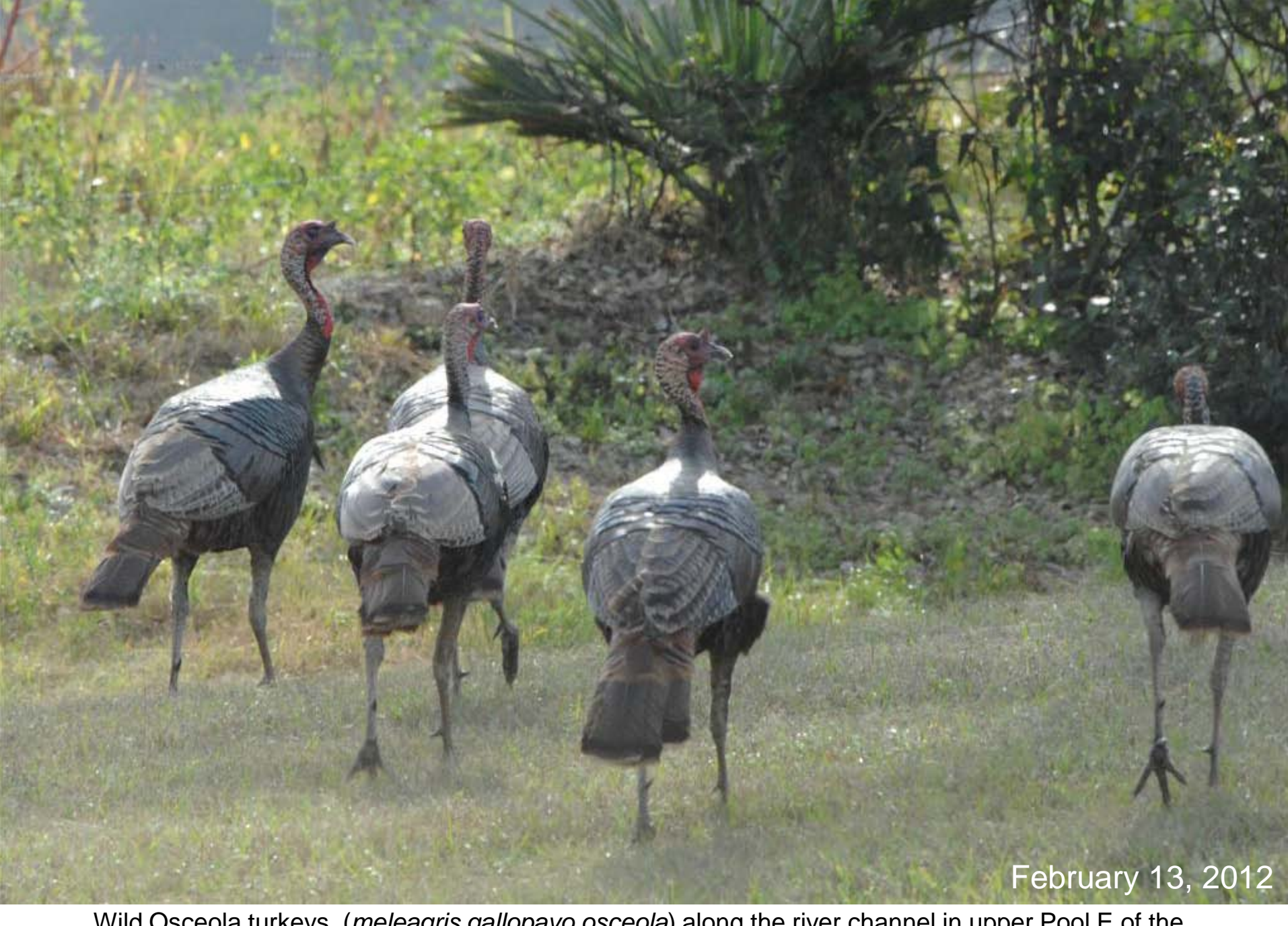
Wild Osceola turkeys ( meleagris gallopavo osceola ) along the river channel in upper Pool E of the Kissimmee River