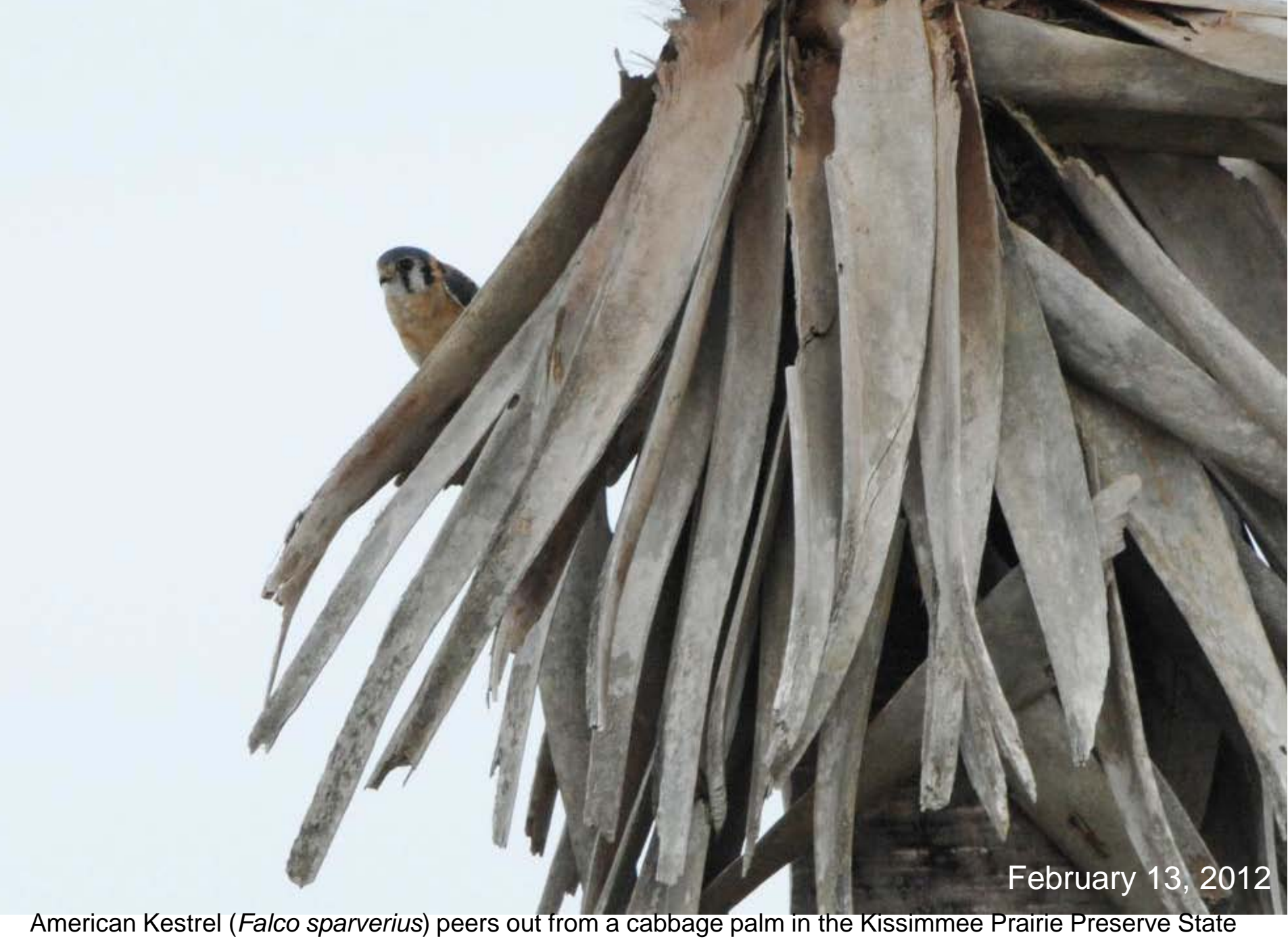
American Kestrel (Falco sparverius) peers out from a cabbage palm in the Kissimmee Prairie Preserve State Park