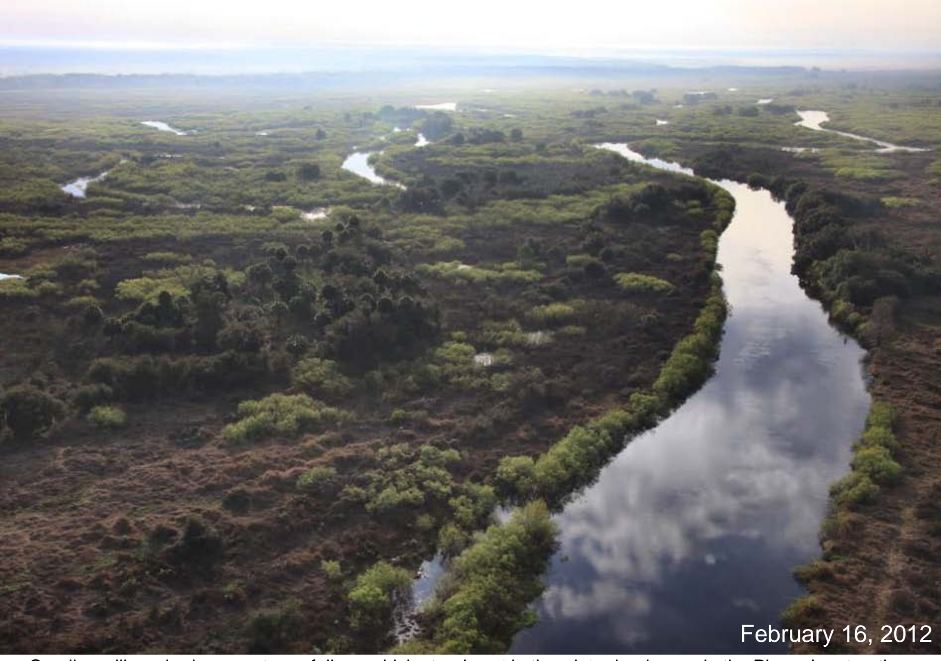
Carolina willow shrubs sprout new foliage which stands out in the winter landscape in the Phase I restoration area