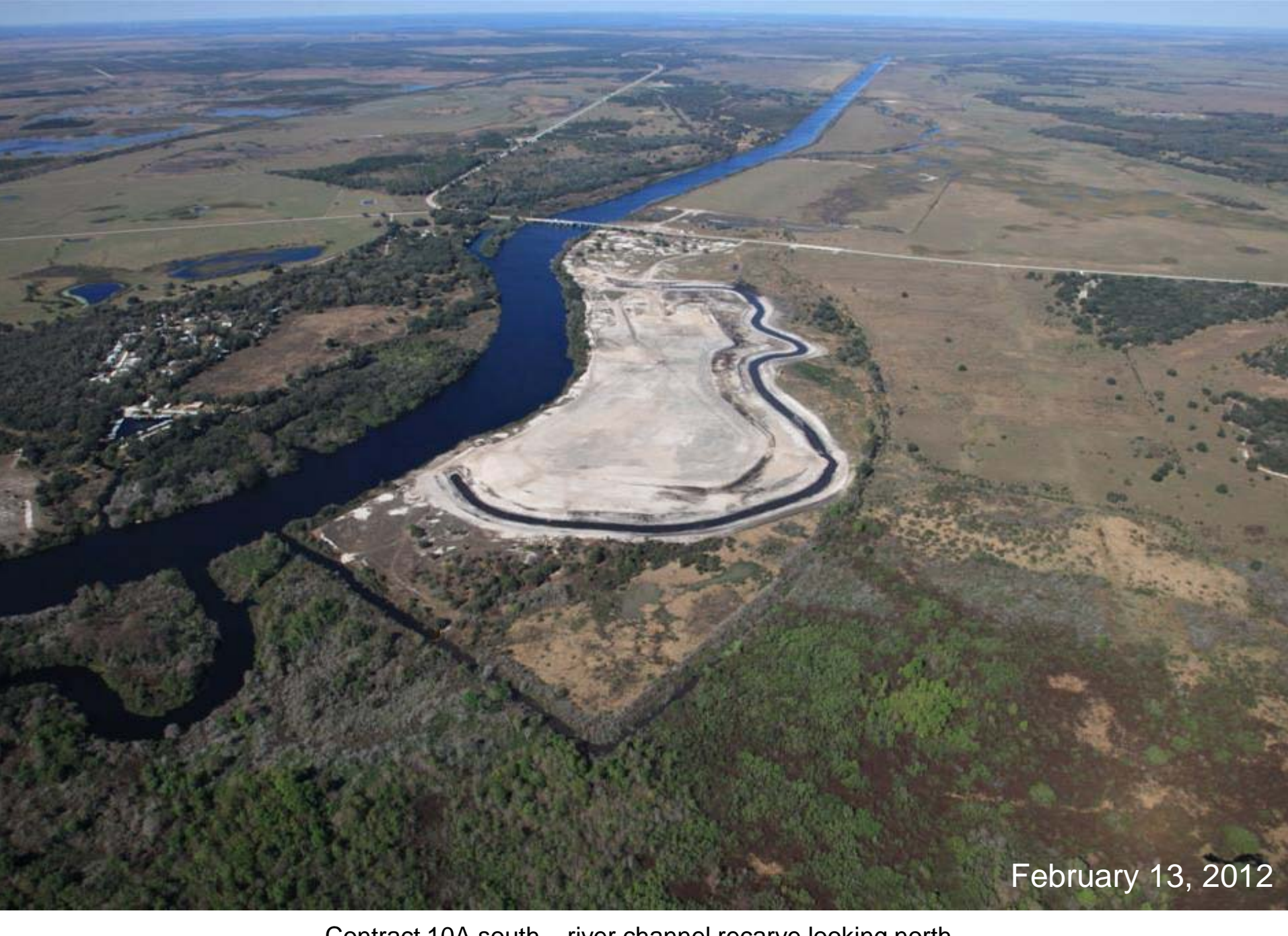
Contract 10A south – river channel recarve looking north