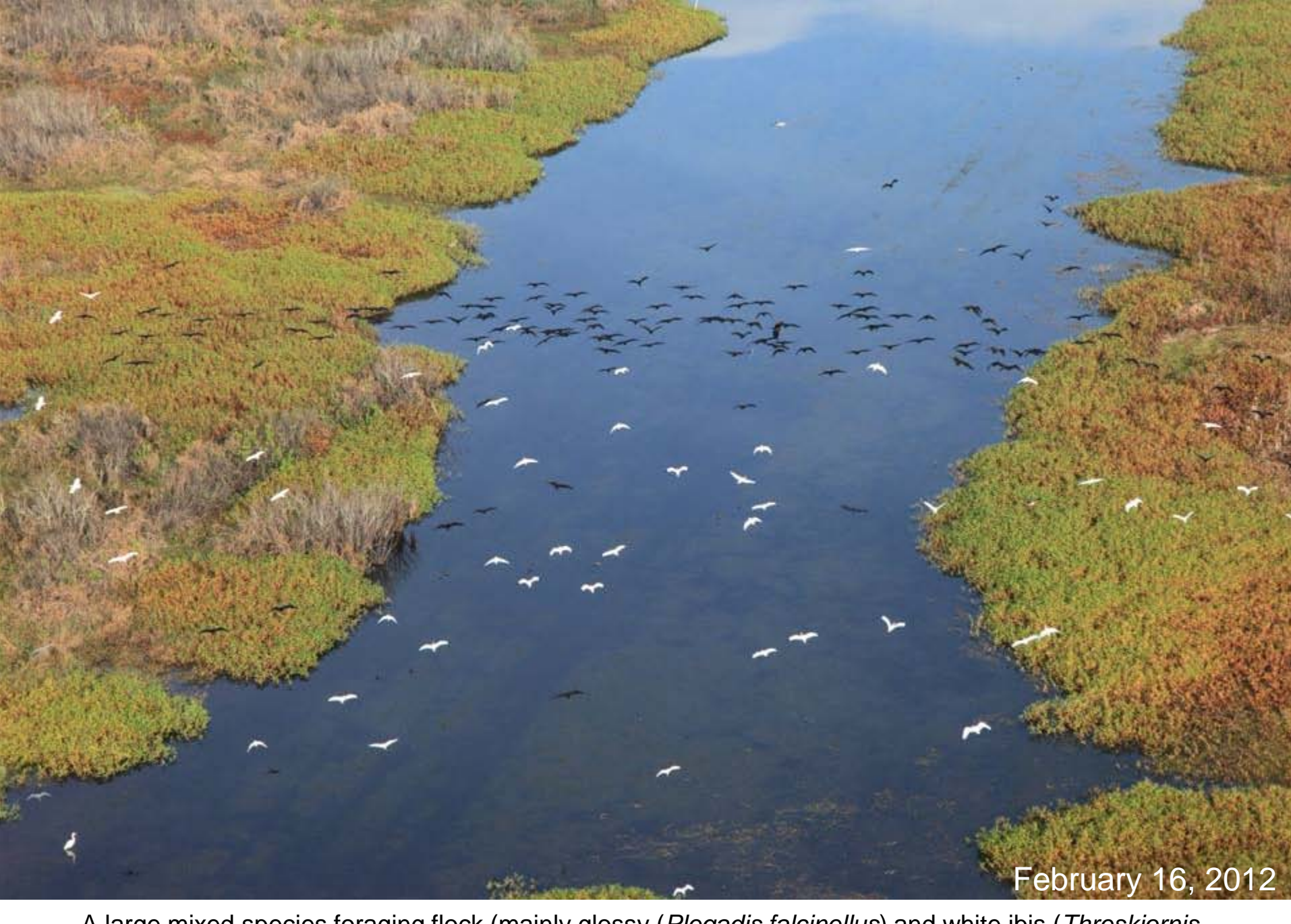
A large mixed species foraging flock (mainly glossy ( Plegadis falcinellus ) and white ibis ( Threskiornis molucca )), flies over the Phase I restoration area