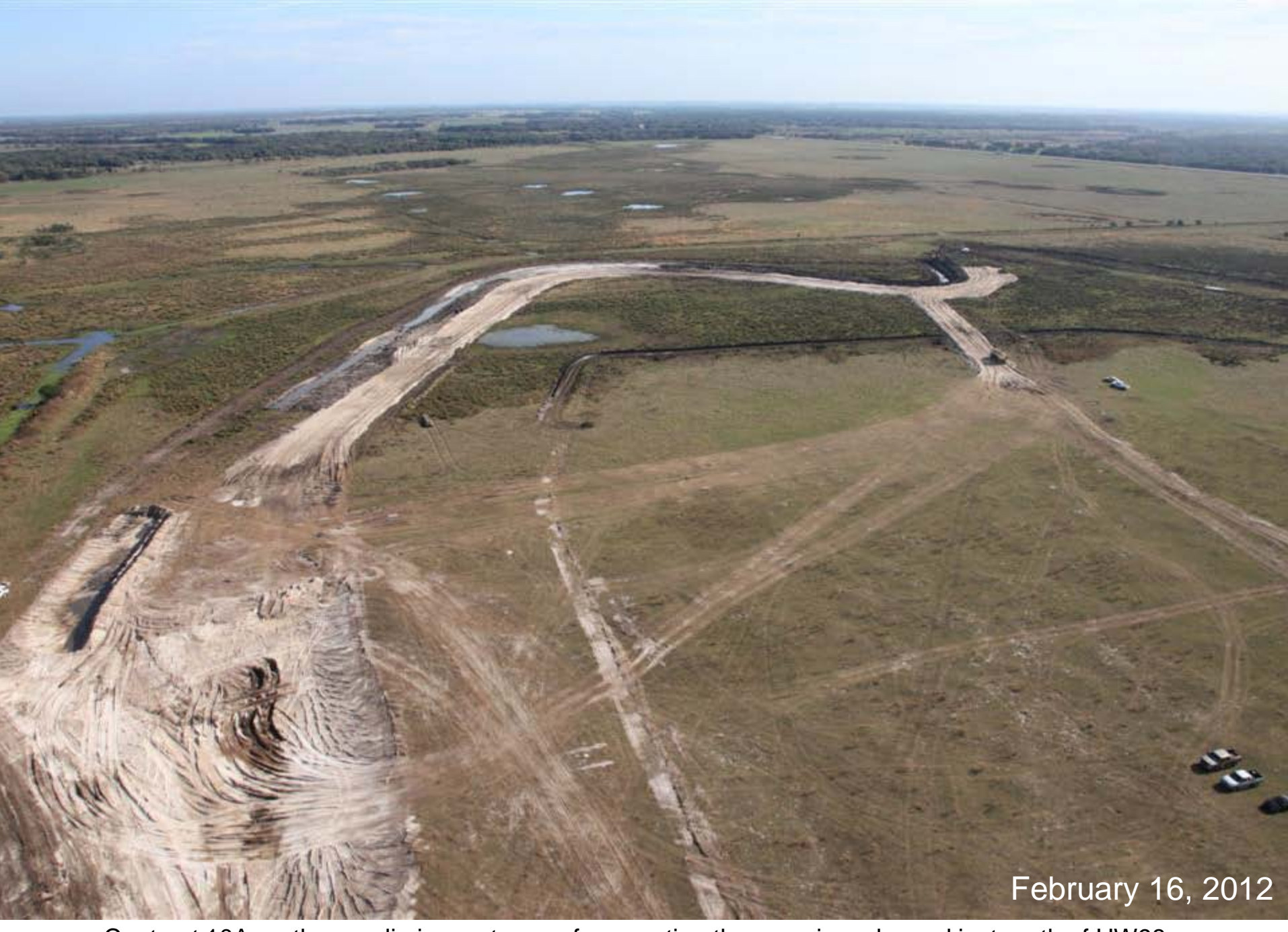
Contract 10A north – preliminary stages of excavating the new river channel just north of HW98.