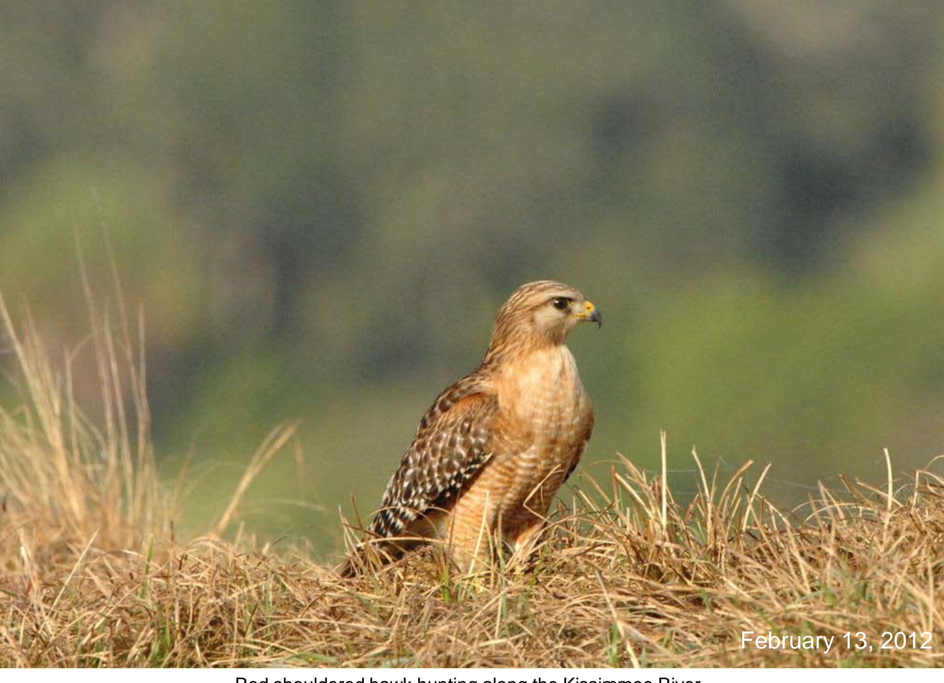
Red shouldered hawk hunting along the Kissimmee River