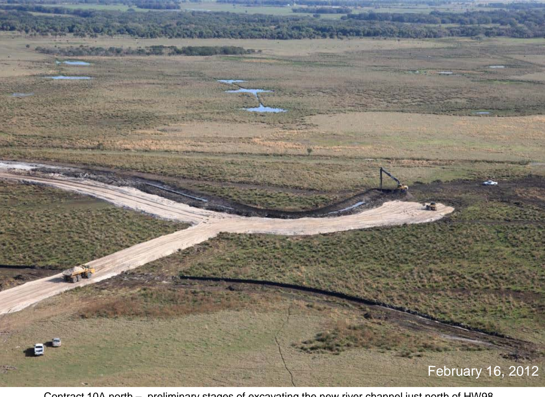
Contract 10A north – preliminary stages of excavating the new river channel just north of HW98.