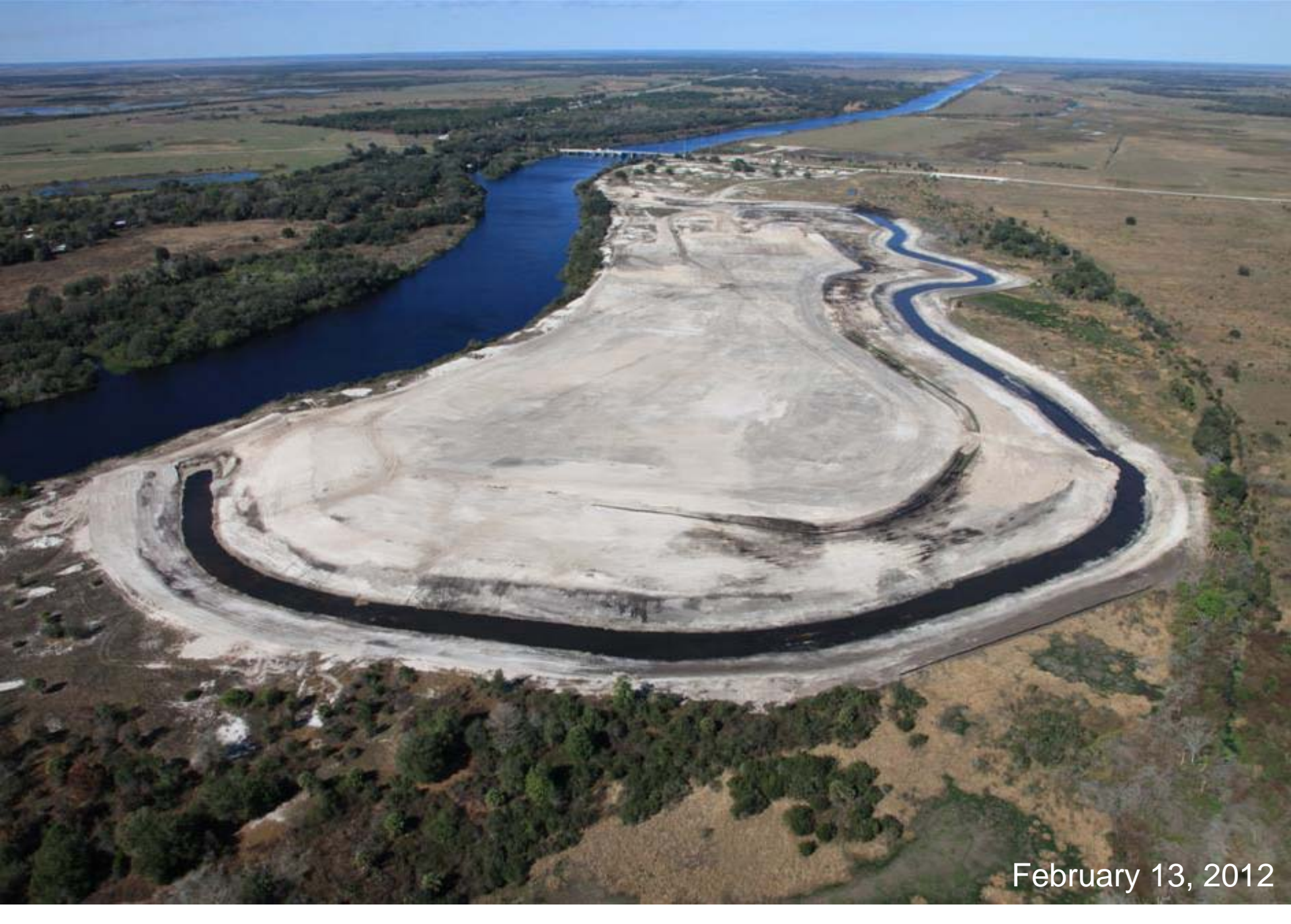
Contract 10A south – river channel recarve looking north