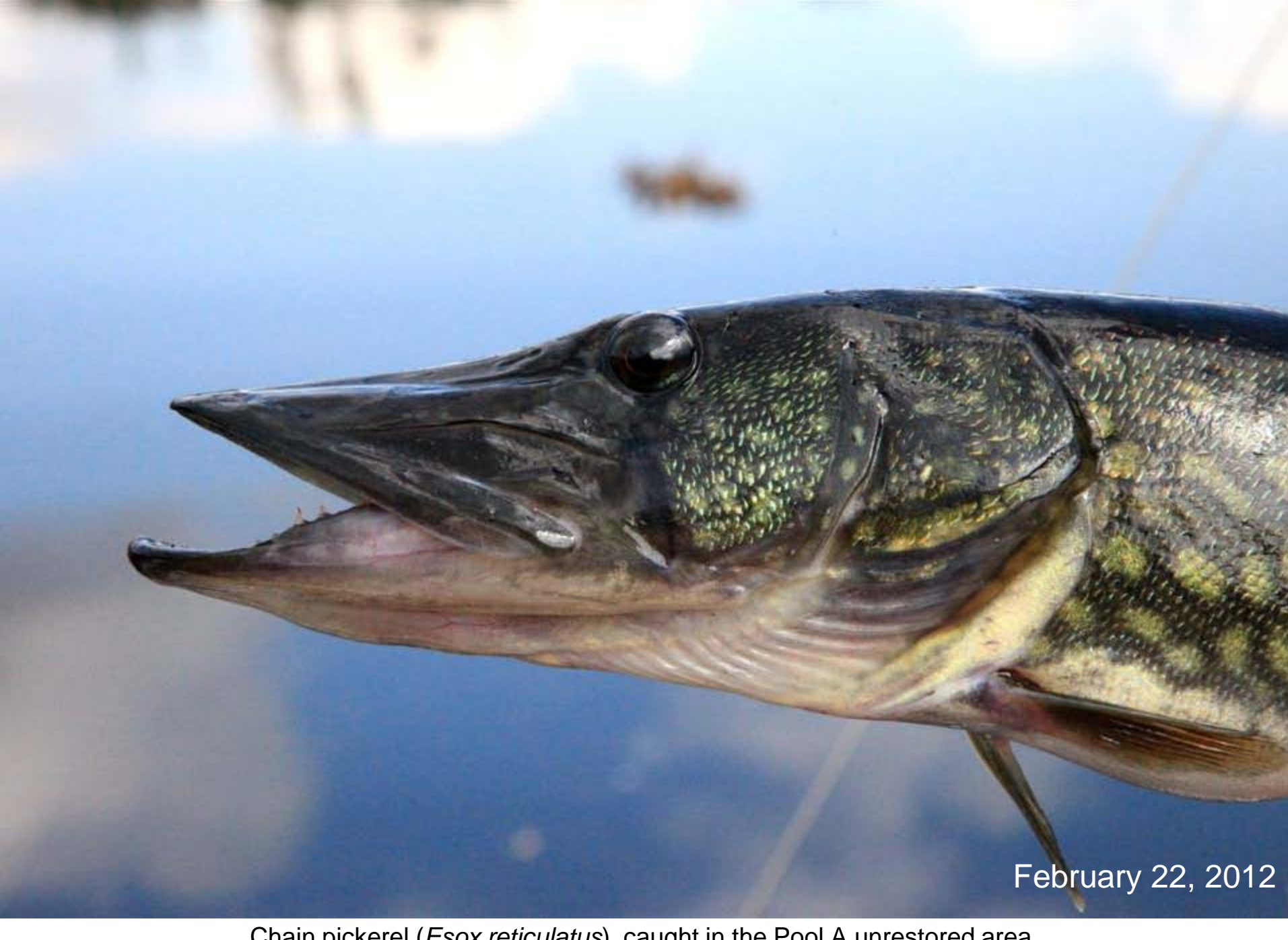
Chain pickerel (Esox reticulatus) caught in the Pool A unrestored area