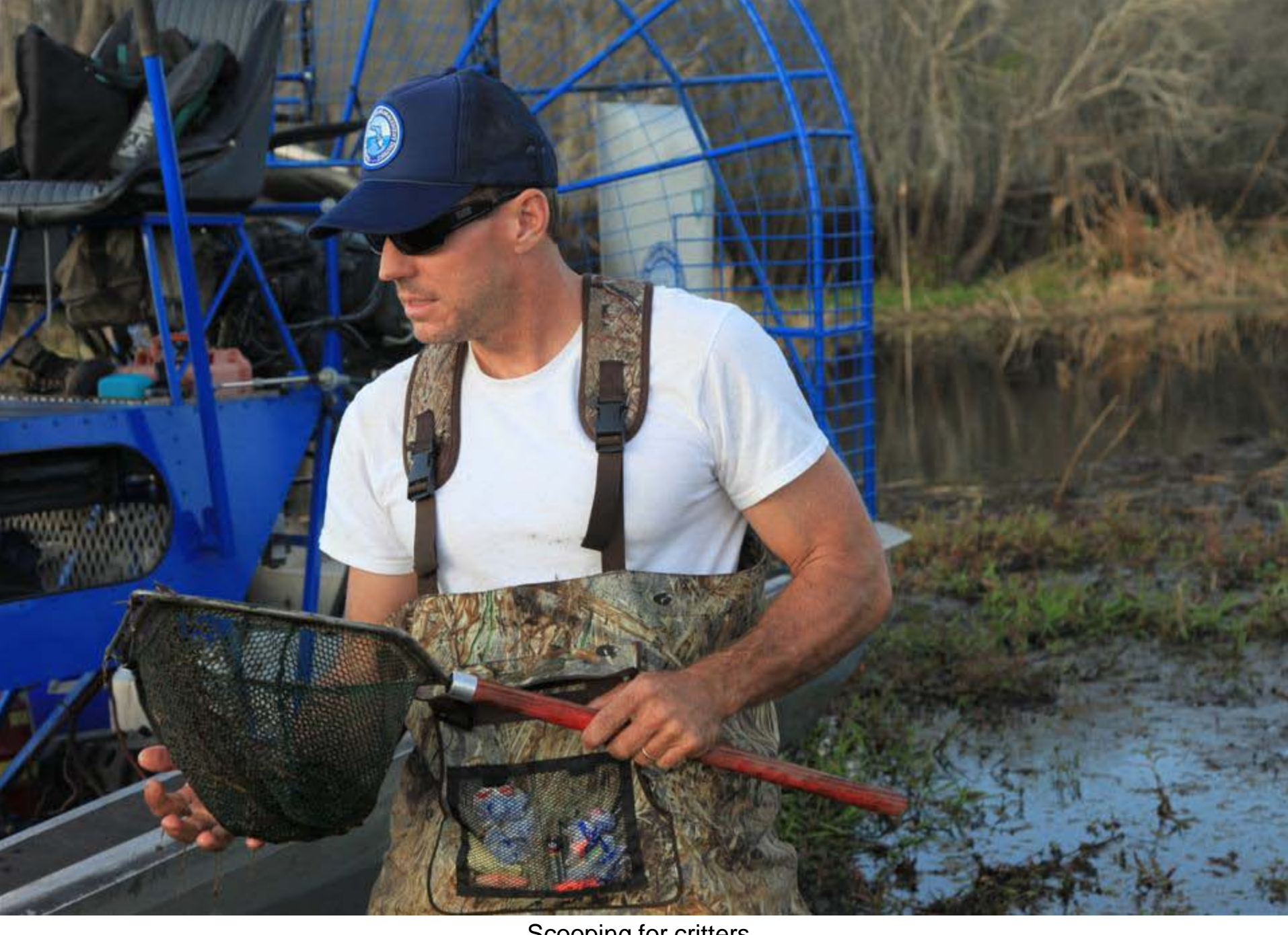
Scooping for critters