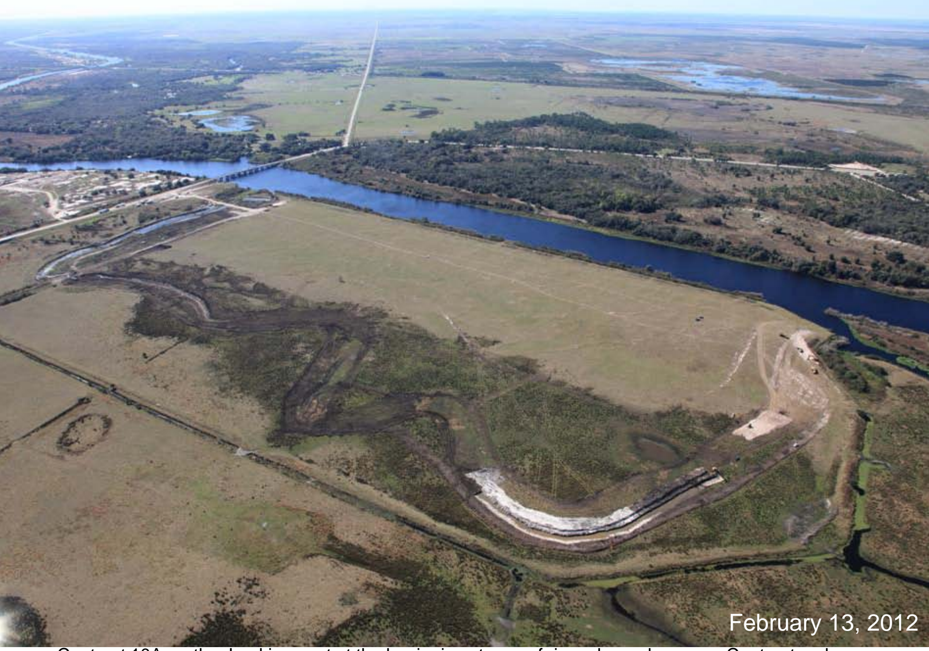
Contract 10A north – Looking east at the beginning stages of river channel recarve. Contractors have scraped the landscape to map out the course of the river channel and have begun digging in some areas.