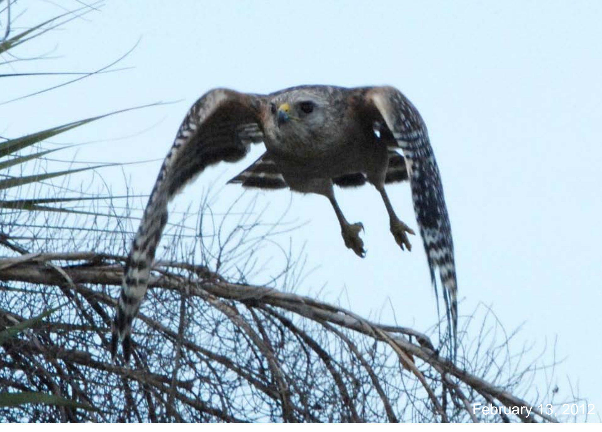
Before the attack