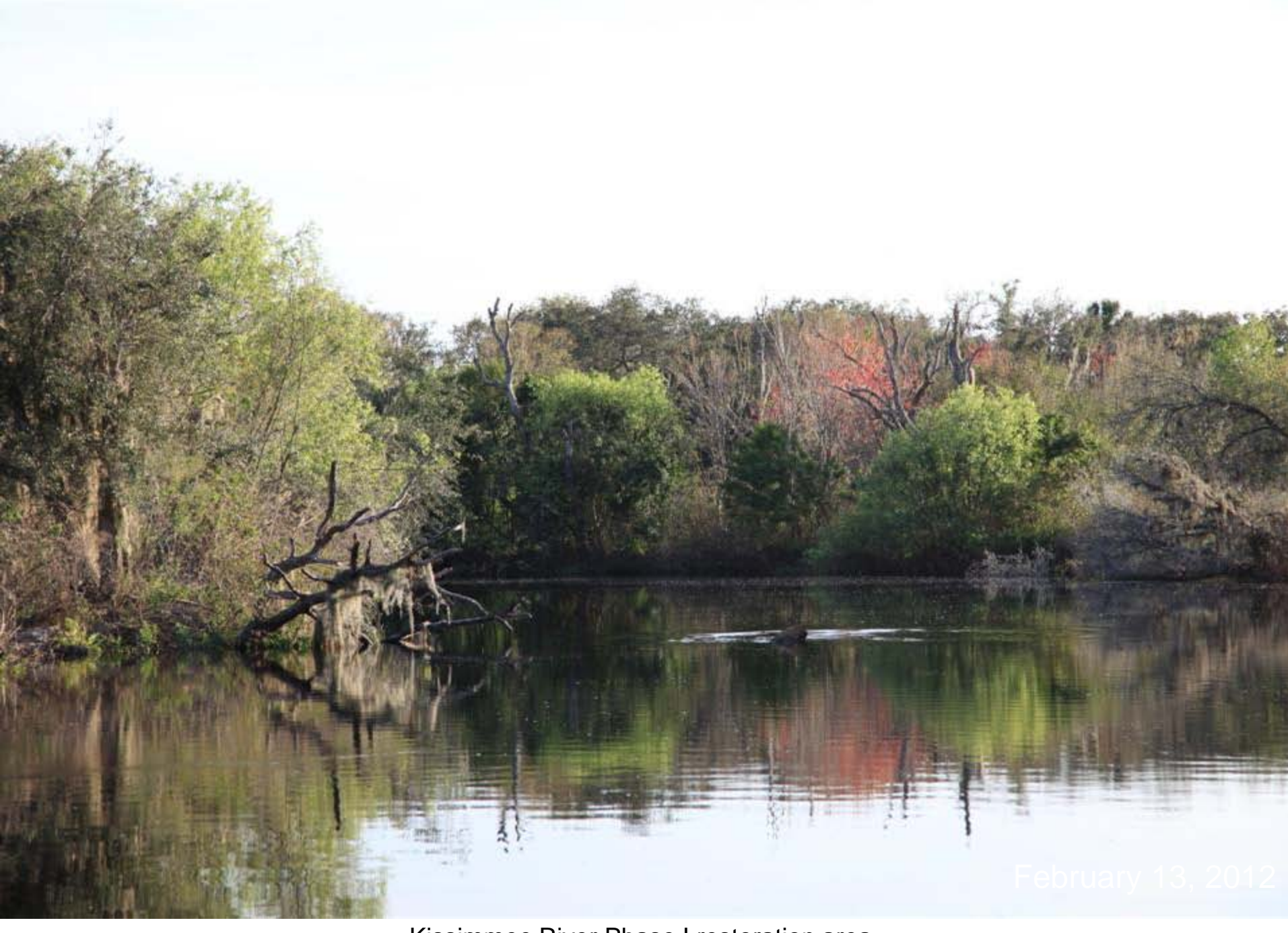
Kissimmee River Phase I restoration area