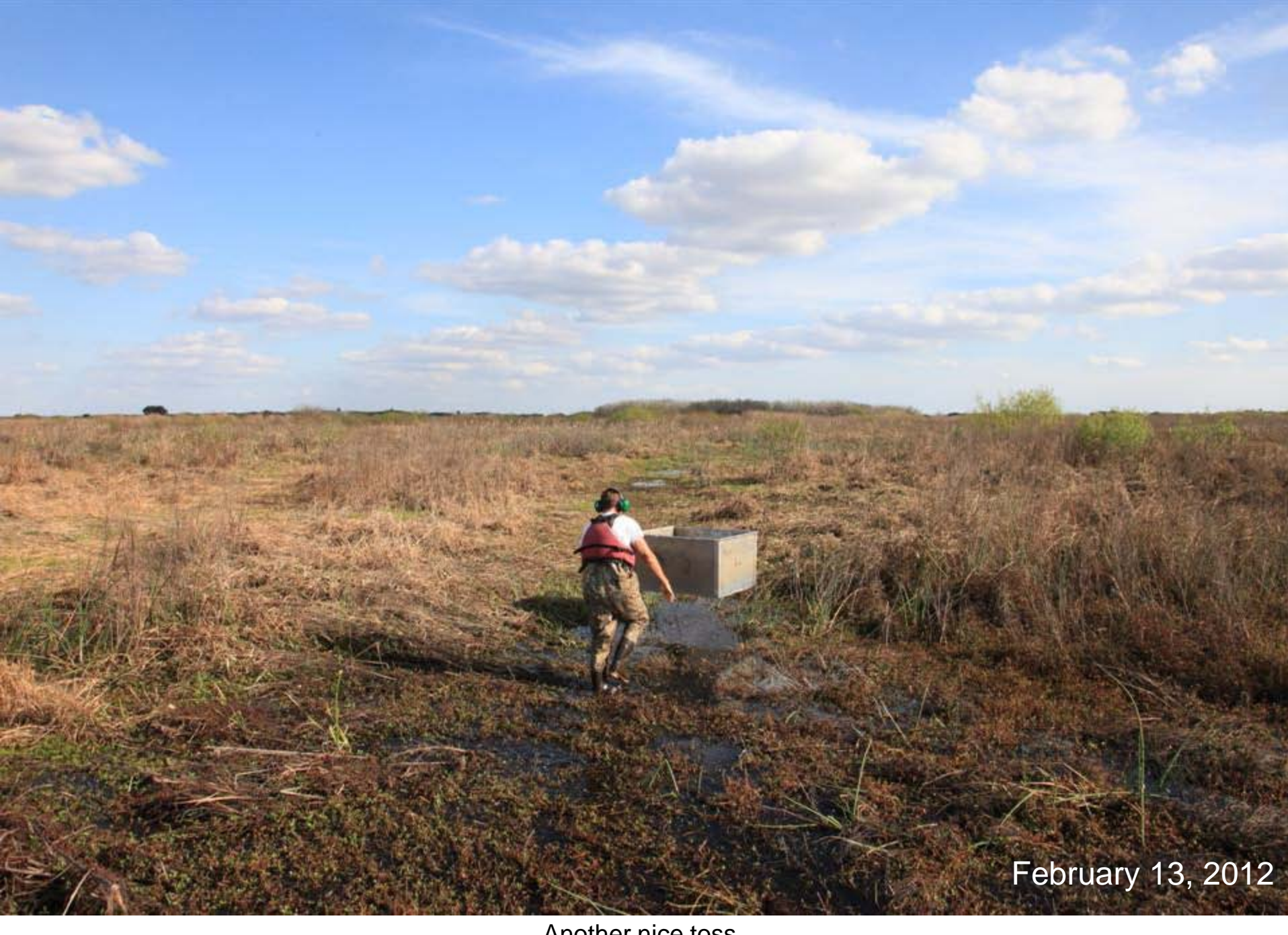
Another nice toss