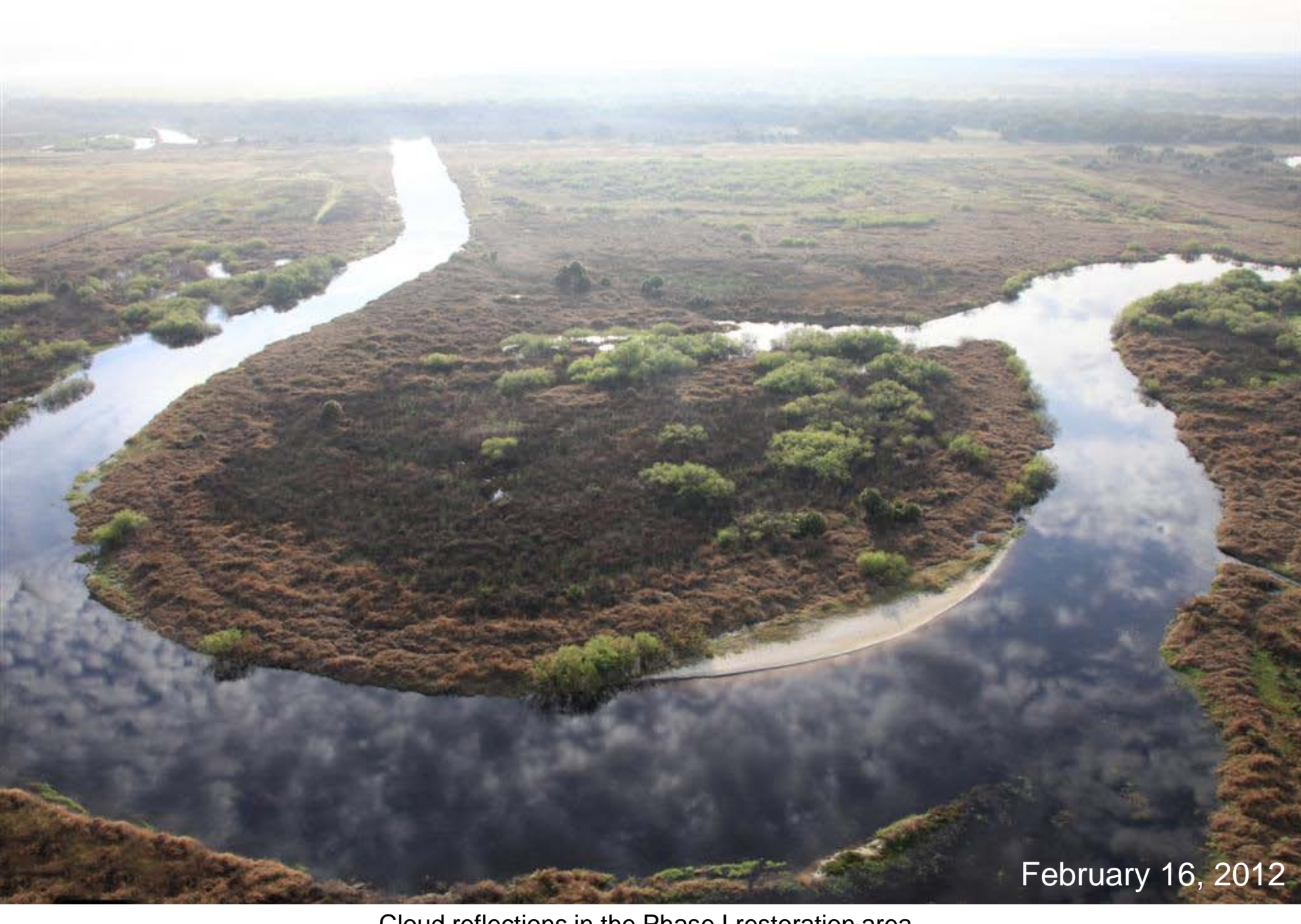
Cloud reflections in the Phase I restoration area