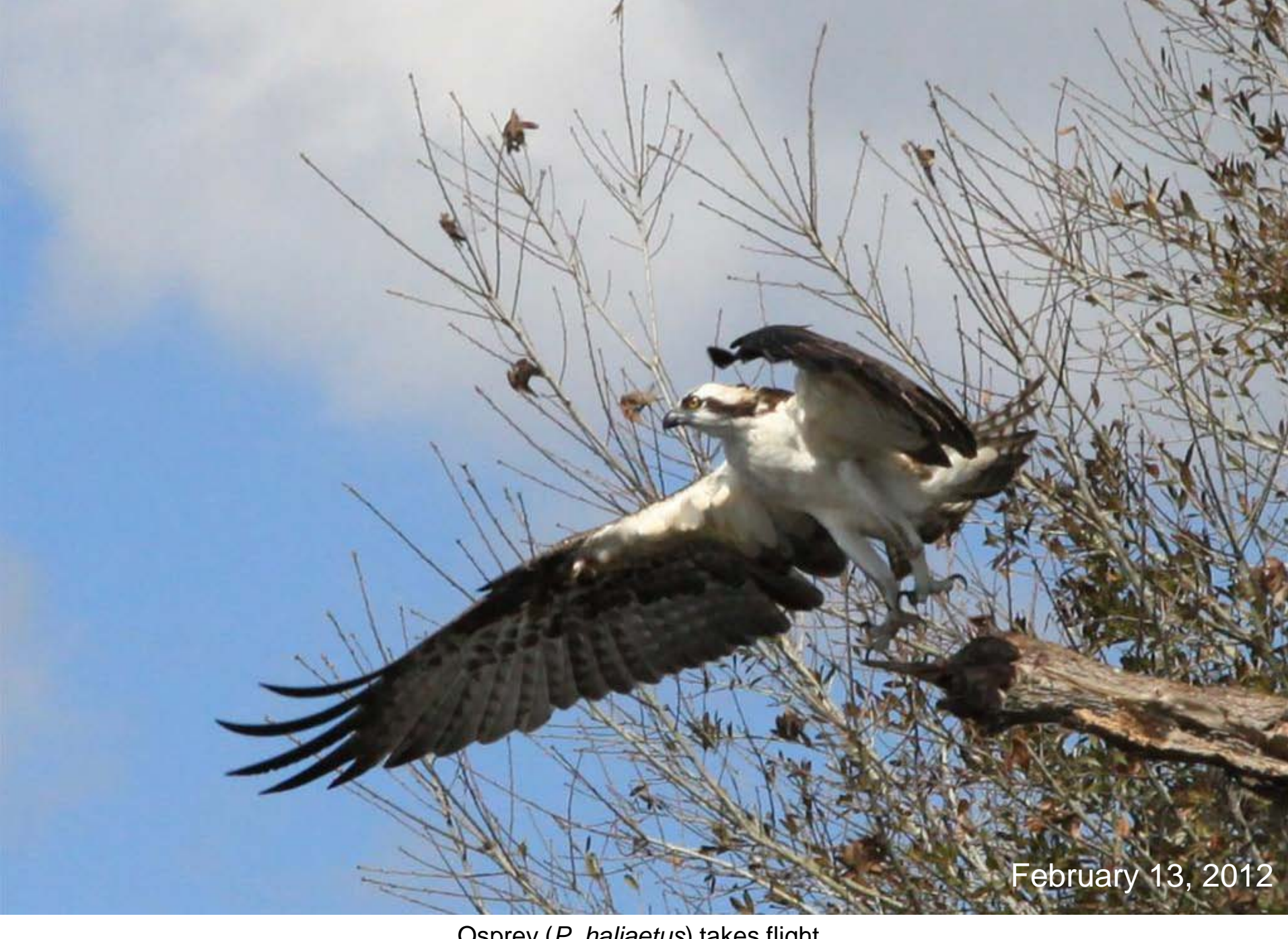
Osprey ( P. haliaetus ) takes flight