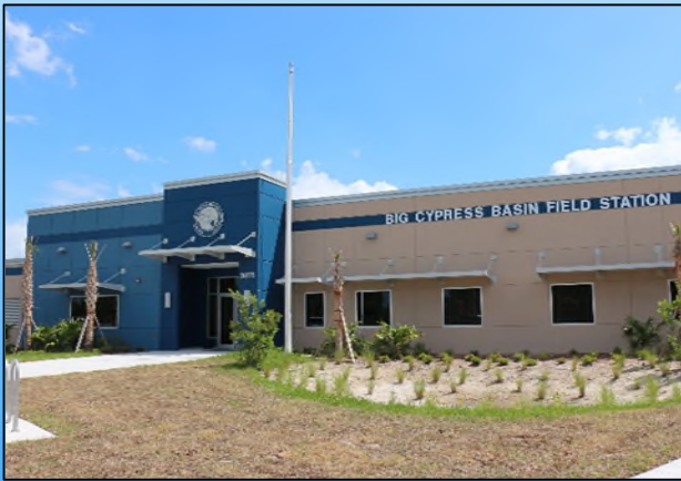
Big Cypress Basin Field Station