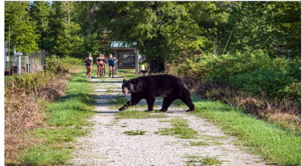
Bear at Bird Rookery Swamp (CREW)