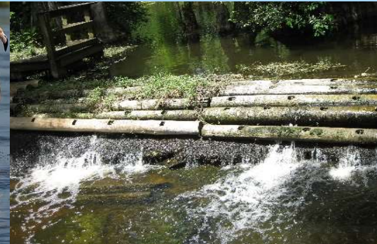
Restoring Natural Systems: Loxahatchee River Restoration