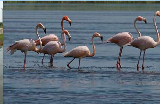
Improving Water Quality: Stormwater Treatment Area in Palm Beach County