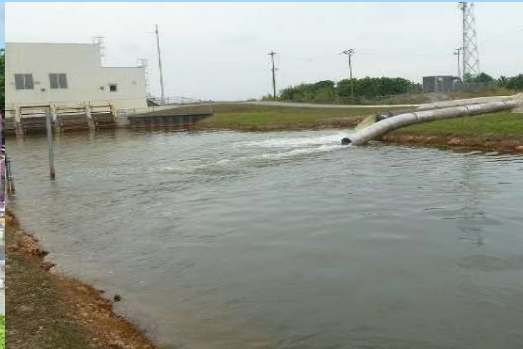
Providing Flood Control: Emergency Operations at S-357 Pump Station