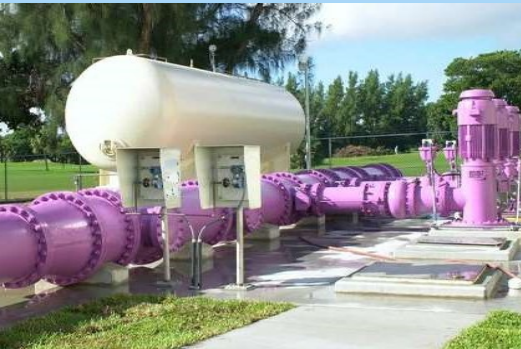
Ensuring Water Supply: Pompano Beach Reclaimed Water Supply Facility