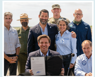
Wetland Portion of EAA Reservoir Project Began 12 Months Ahead of Schedule