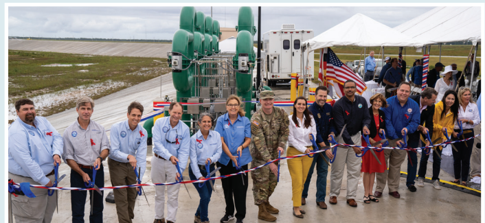
Completed C-44 Reservoir and Treatment Wetland to Further Protect St. Lucie Estuary