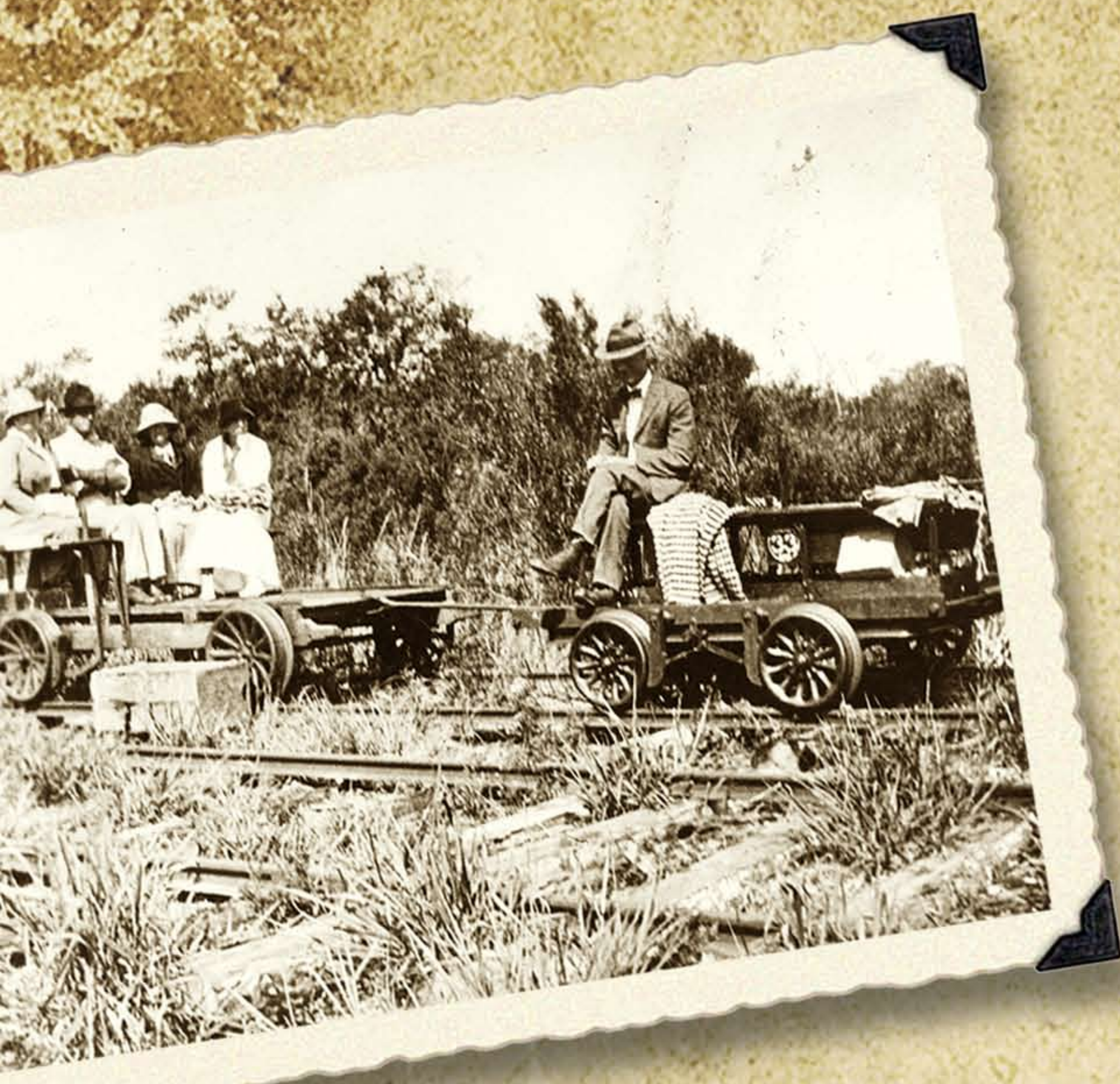
Above: Land speculators on railroad handcars that connected Everglades City and Deep Lake, 1917.

The mysterious and uncharted swamplands of South Florida remained untouched by settlers during the 19th century, with the exception of Native Americans and runaway slaves who found refuge there before and during the Seminole Wars of the early 1800s.