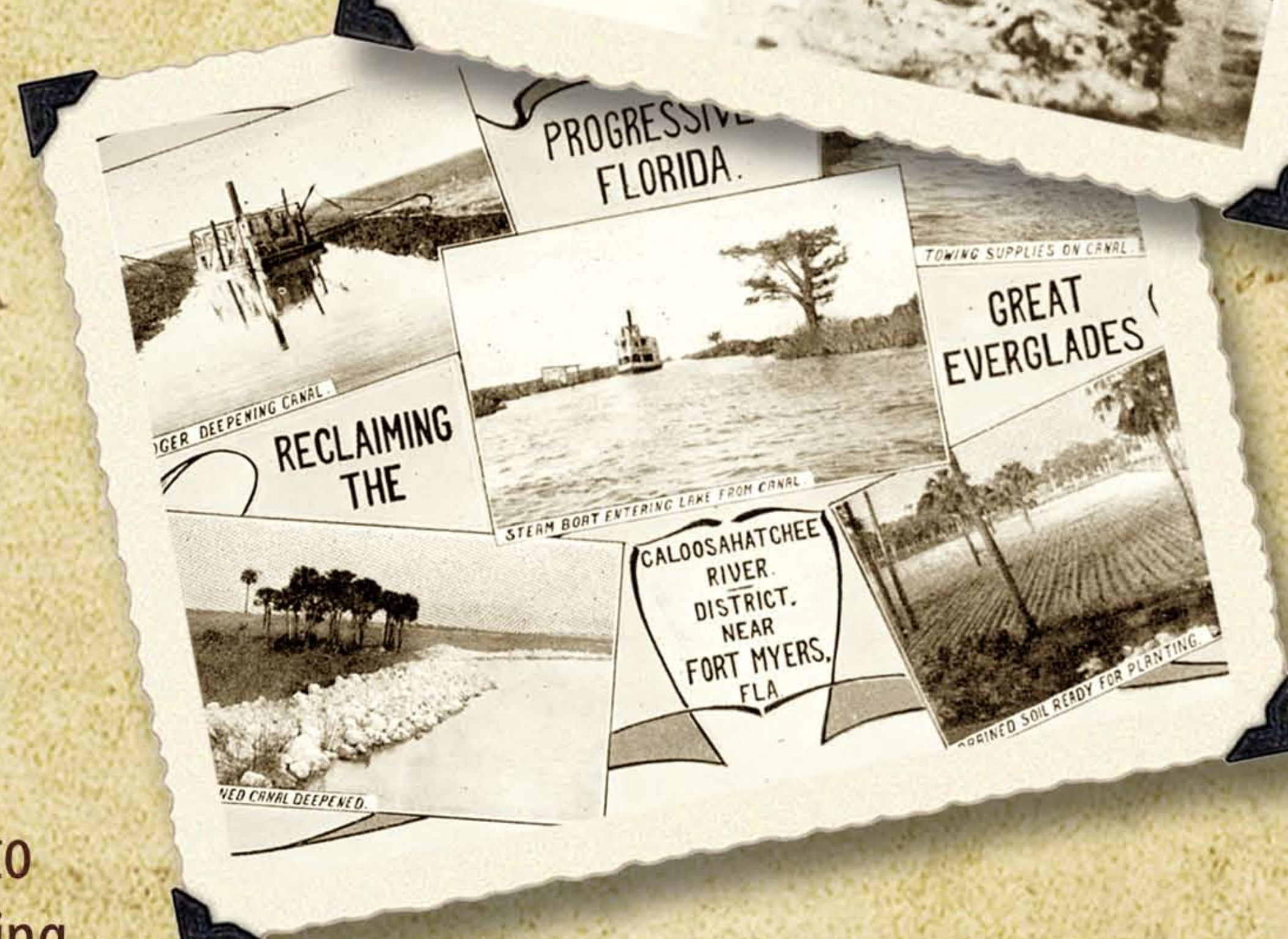
Top: Gentlemen attempting to drive a luxury auto in the Everglades, 1906. Above: A 1912 postcard promoting “reclamation” of the Everglades.