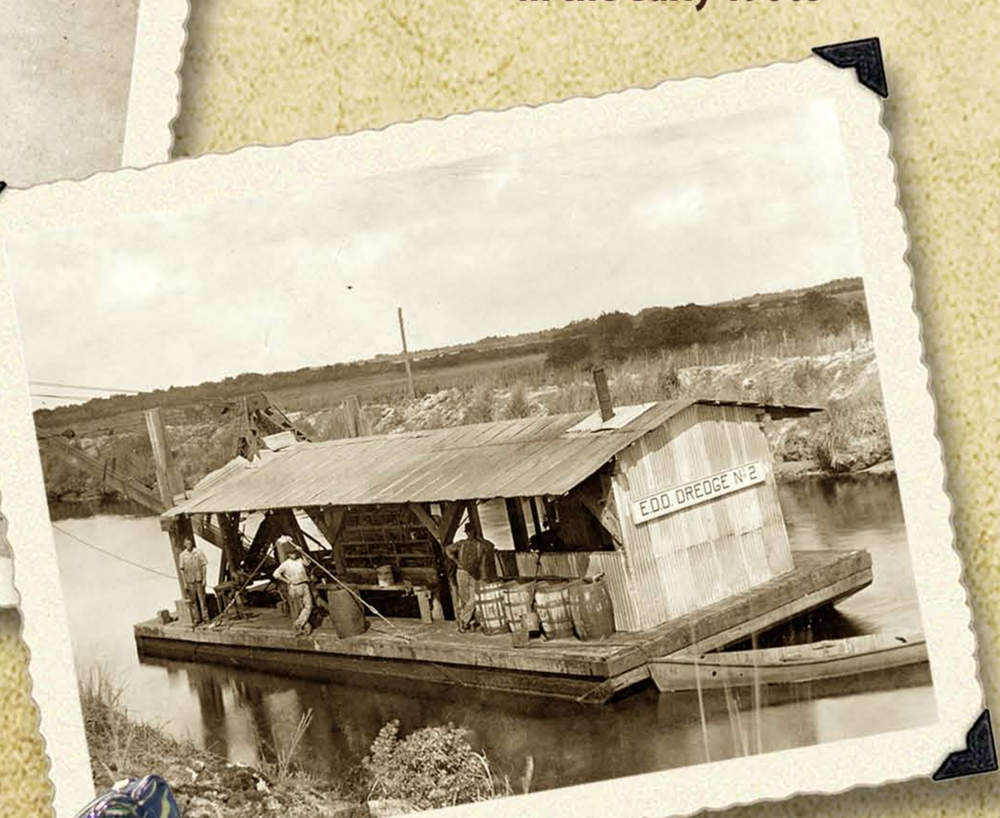
Left: Everglades survey party, 1913. Above: Everglades Drainage District dredge No. 2 at work in the Everglades, circa 1915.