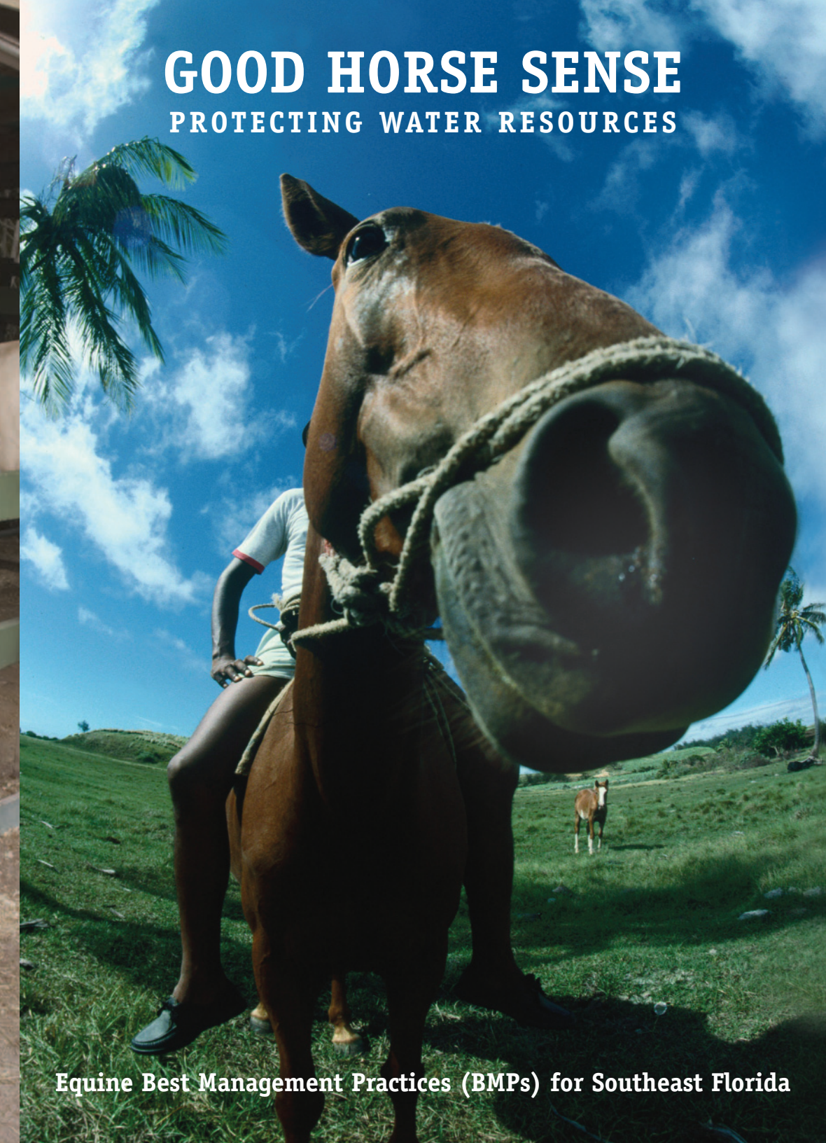
Equine Best Management Practices (BMPs) for Southeast Florida