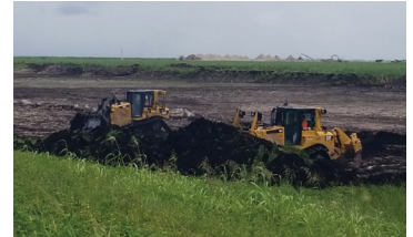
Demucking of the Outflow Canal

The project is a joint Everglades restoration project between the South Florida Water Management District (SFWMD) and the U.S. Army Corps of Engineers (USACE). SFWMD is building the water-cleansing STA, which will remove harmful nutrients and move additional water south before the reservoir component is completed. The conveyance improvements and the STA are expected to be completed by 2023. The U.S. Army Corps of Engineers will construct the storage reservoir component.