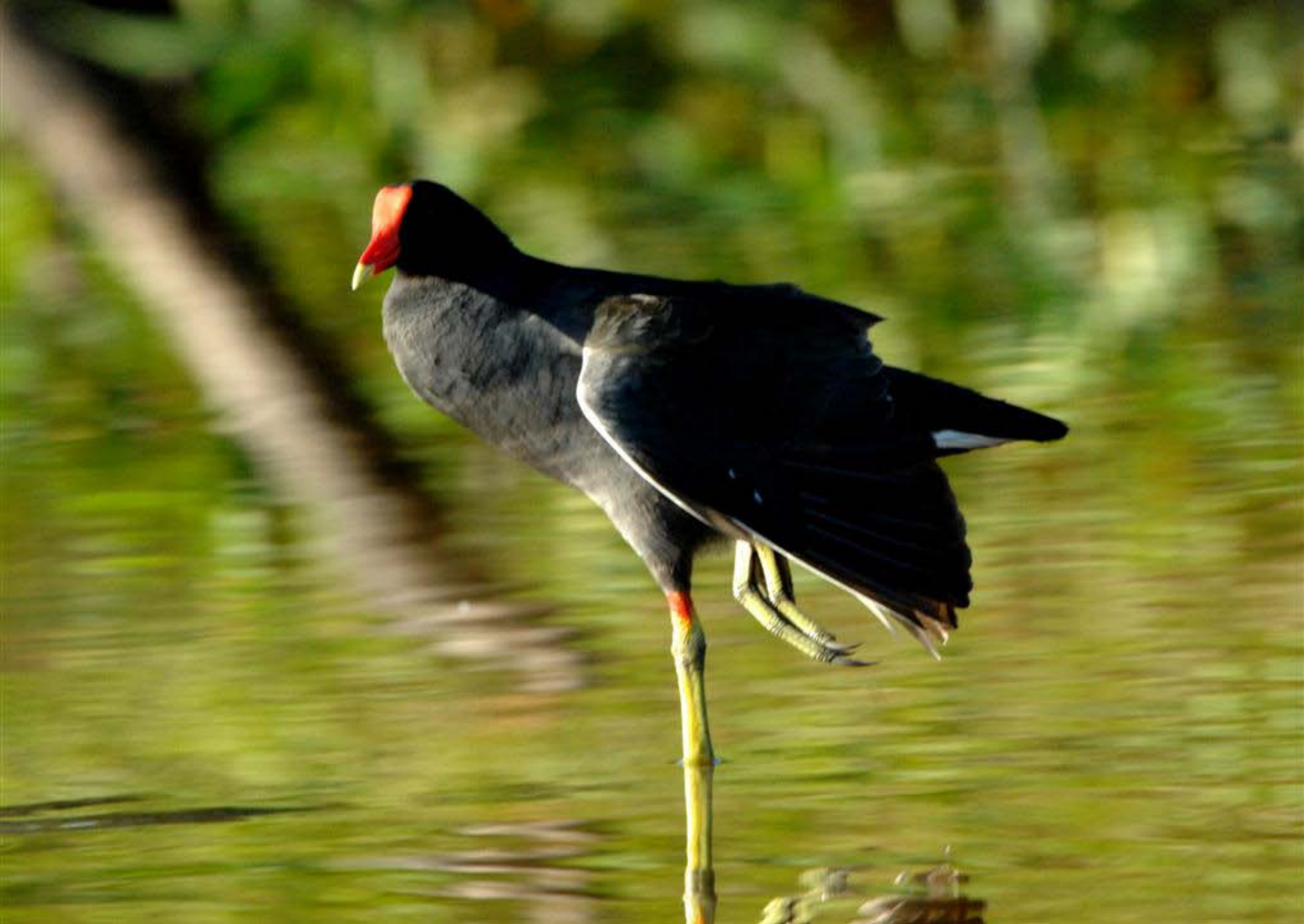
Common Gallinule ( Gallinula galeata ) in the Phase I restoration area