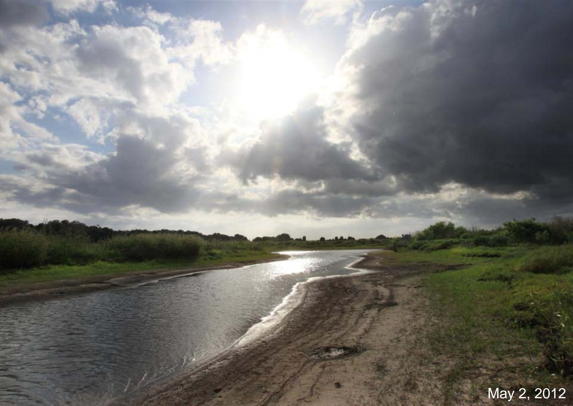
Drying abandoned channel in the Phase I restoration area floodplain