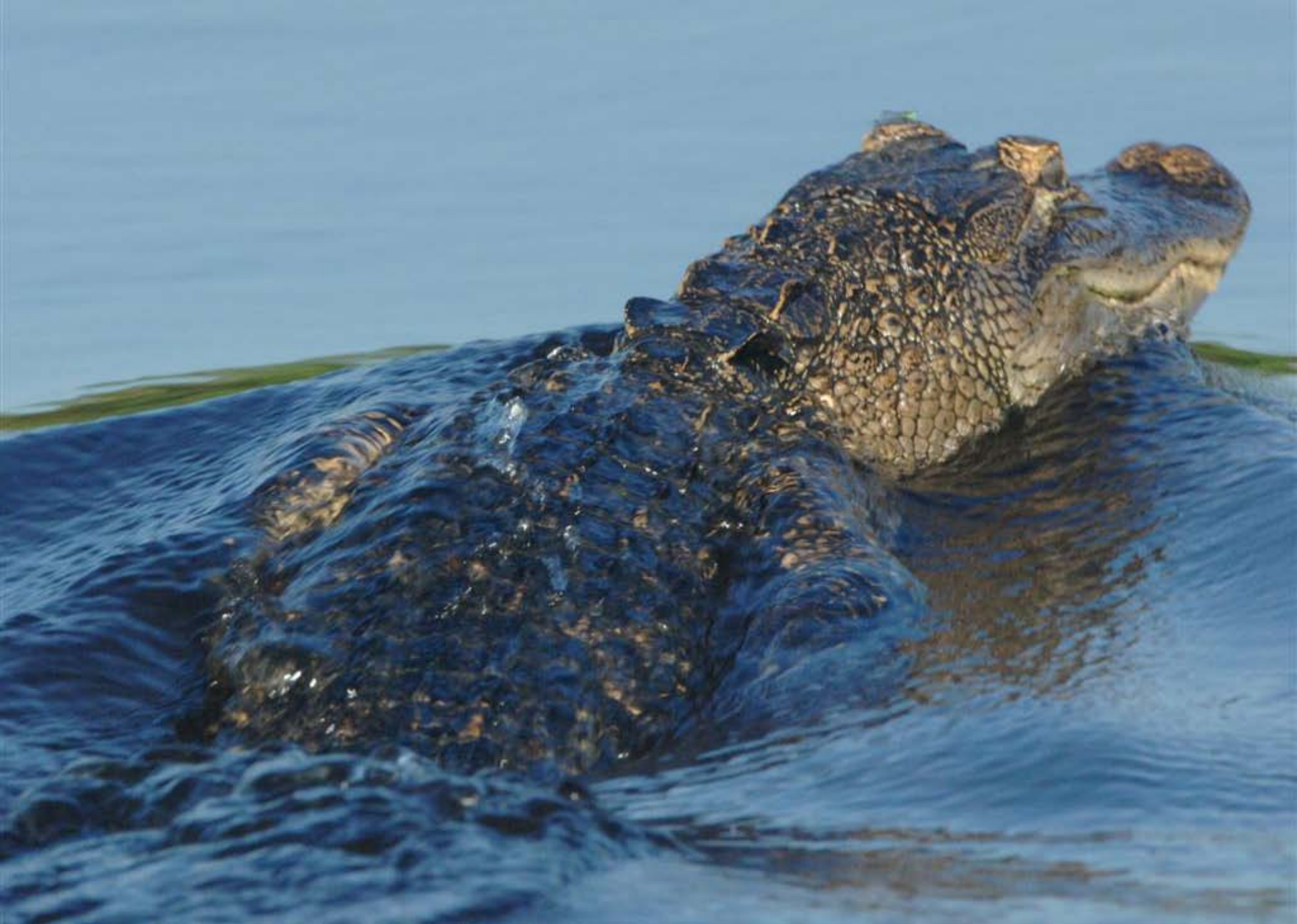
American alligator in the Phase I restoration area.