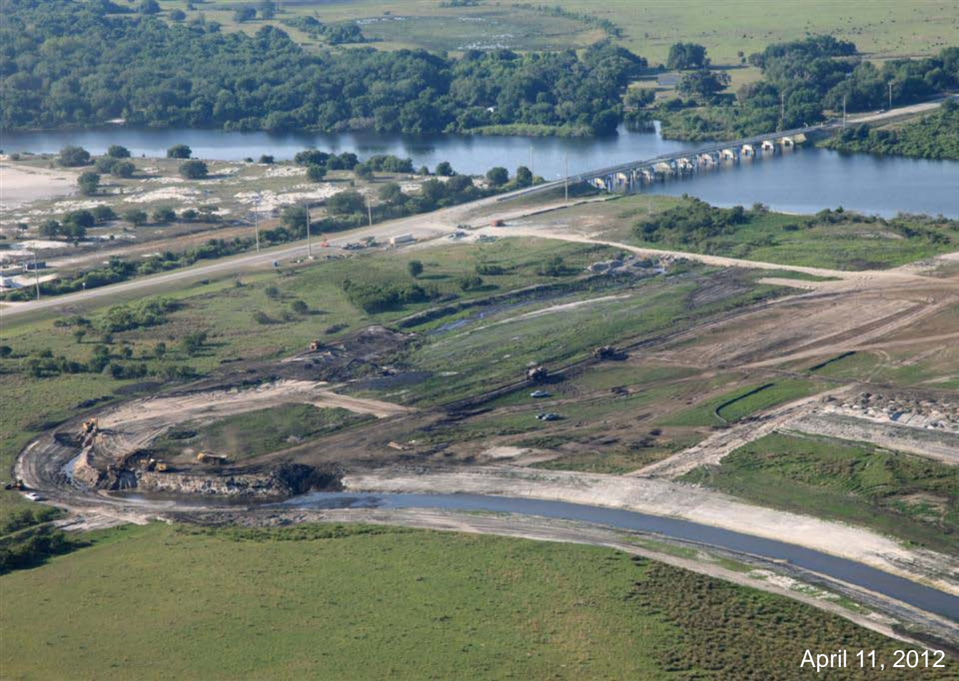
Contract 10A Reach 2 river channel recarve