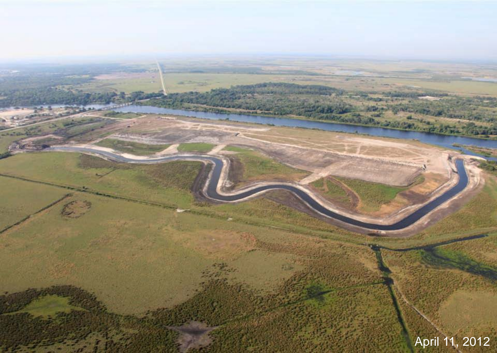
Contract 10A Reach 2 river channel recarve