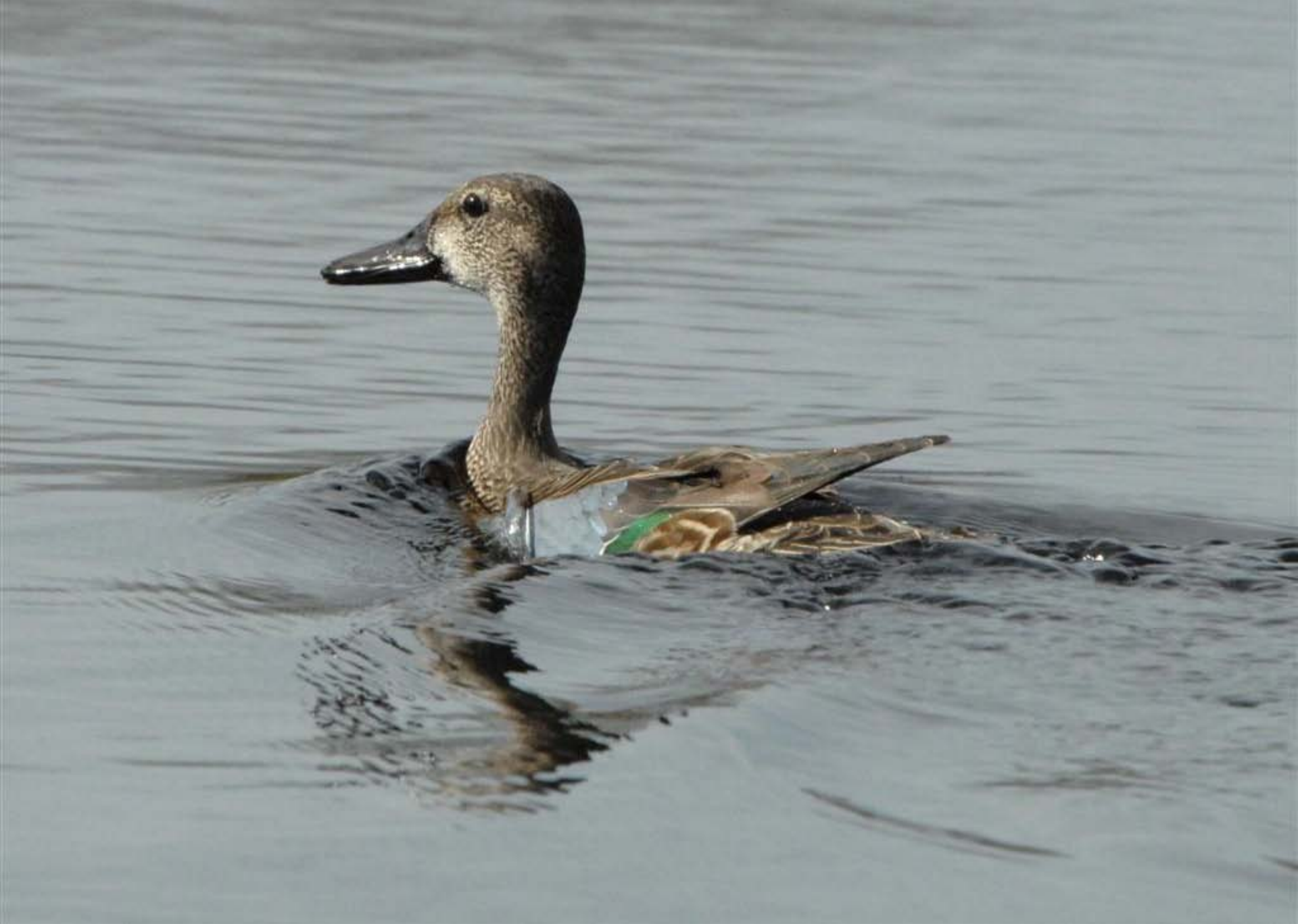
Blue-winged teal ( Anas discors ) in the Phase I restoration area.