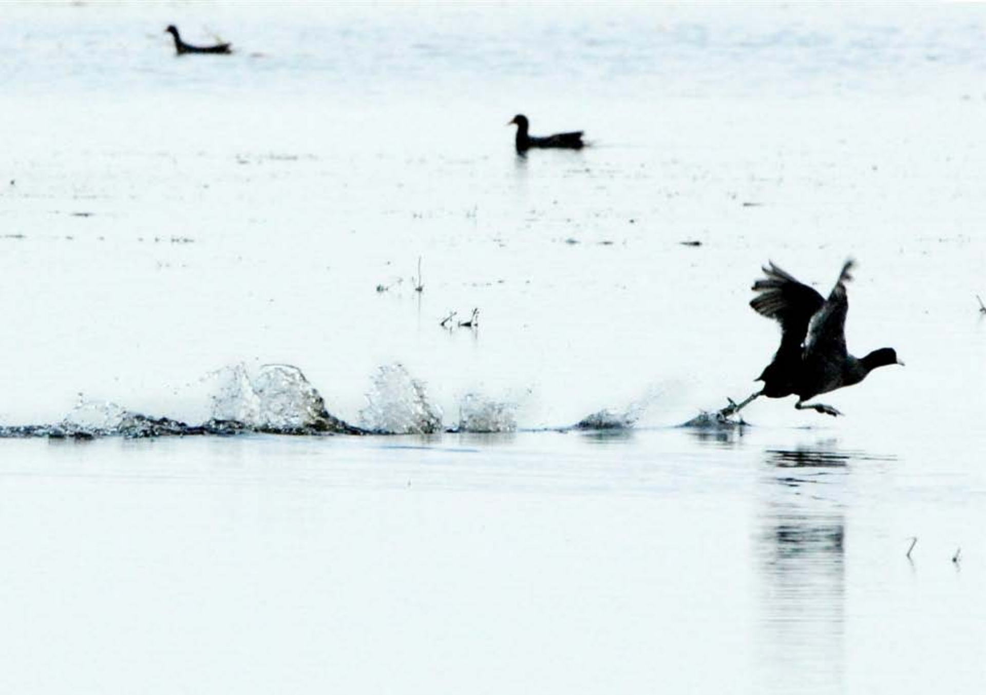
American coot ( Fulica americana ) in the Phase I restoration area.