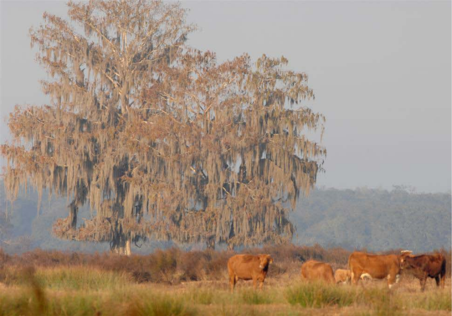
Bald cypress trees ( Taxodium distichum ) hang on yet another year as they wait patiently for Phase II/III backfill when cattle pastures will finally be returned to wetlands after 50 years of channelization.