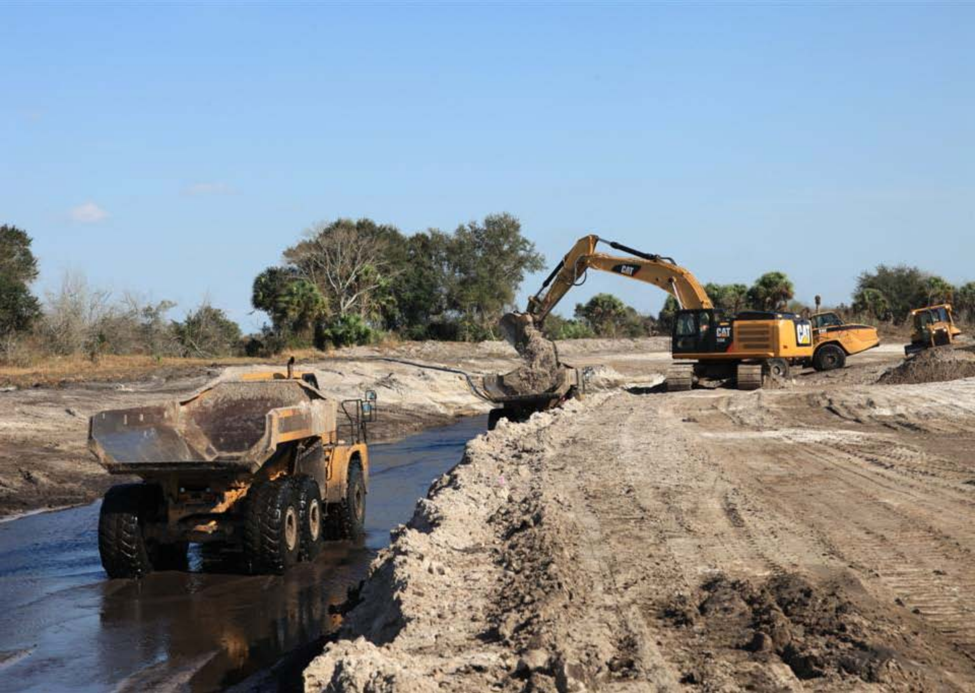
Moving soil in the Phase III contract 10A river channel re carve area