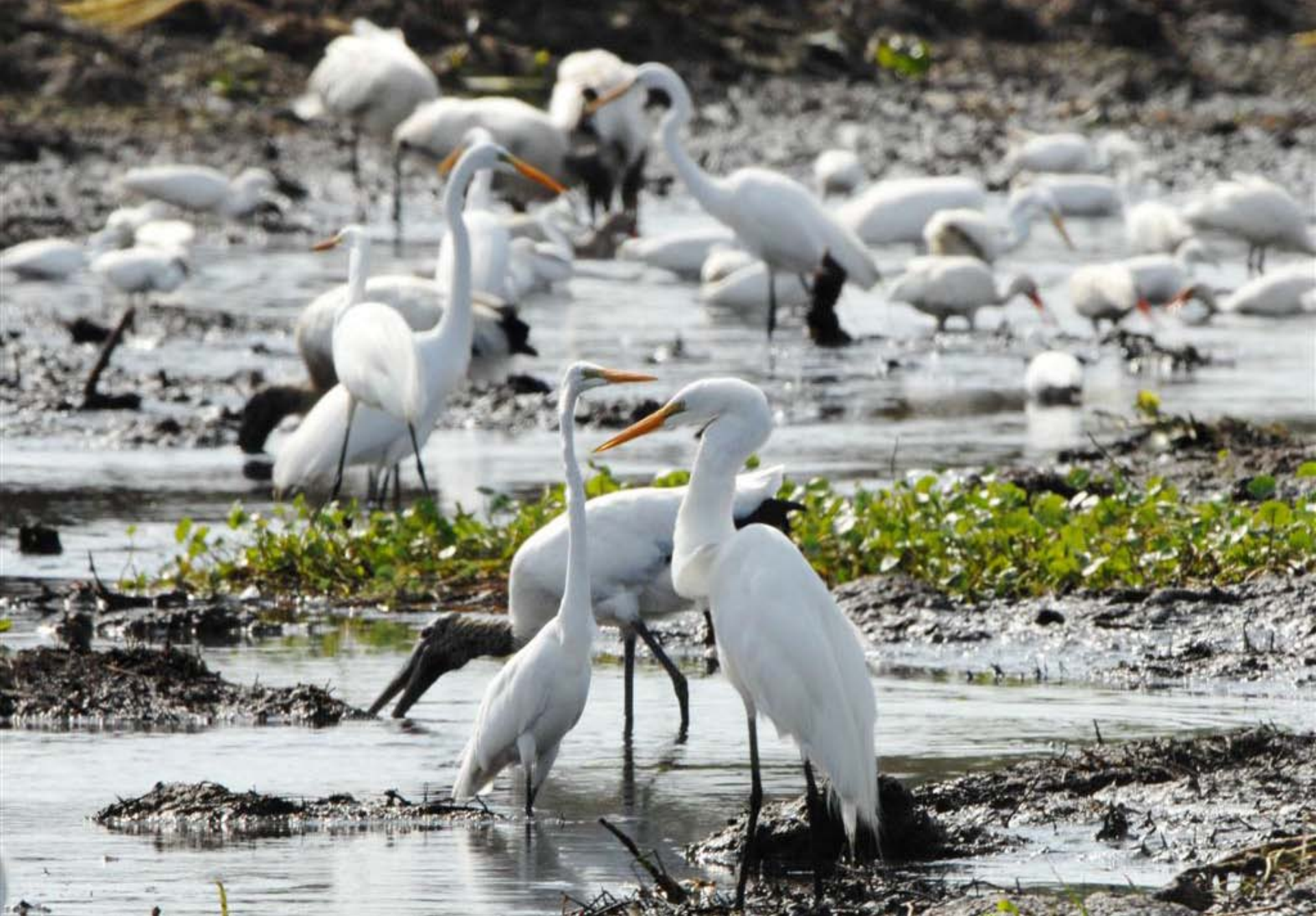
White Ibis ( Eudocimus albus ), great egrets ( Ardea alba ), snowy egrets ( Egretta thula ) and wood storks ( Mycteria americana ) forage in the Phase II contract 10A river channel recarve area.