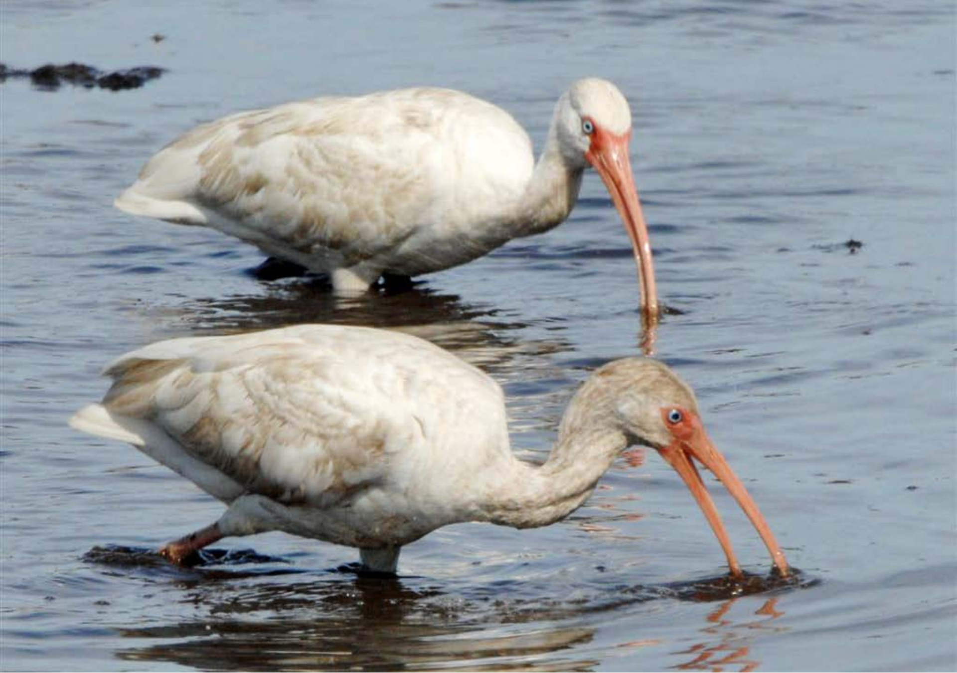
White Ibis ( Eudocimus albus ) forage for stranded prey in the Phase II contract 10A river channel recarve area