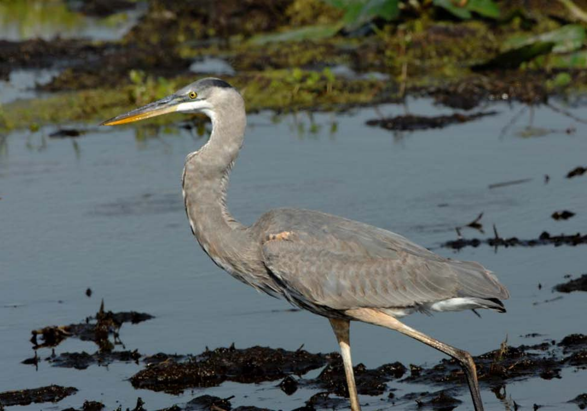
A great blue heron ( Ardea herodias ) forages for stranded prey in the Phase II contract 10A river channel recarve area