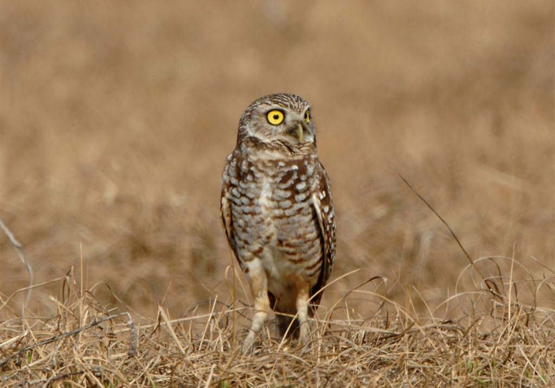
A Burrowing Owl ( Athene cunicularia ) stands her ground in the Phase II contract 10A river channel recarve area. Contract 10B work was on hold briefly while biologists determined if owls were currently nesting