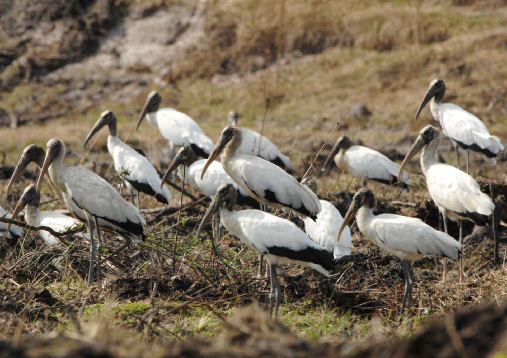
Wood storks take a break from foraging in the Phase II river channel recarve area.