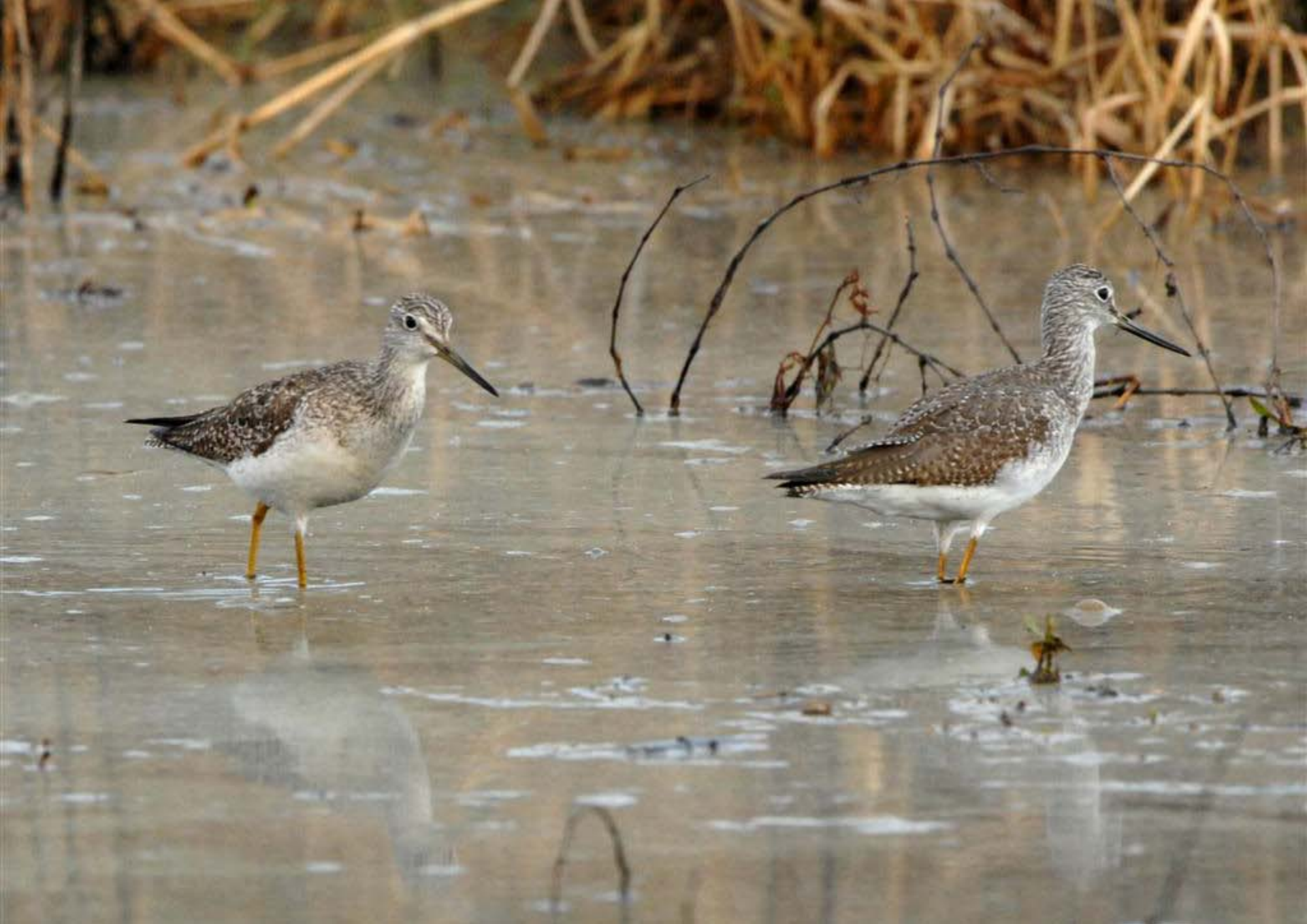
Yellowlegs ( Tringa melanoleuca ) in the Phase I restoration area.