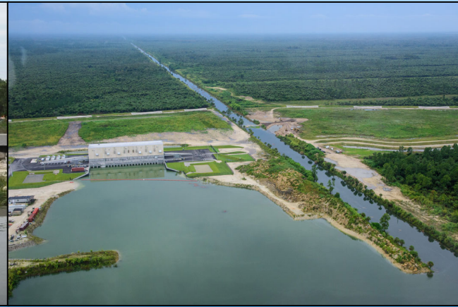
Faka Union Pump Station