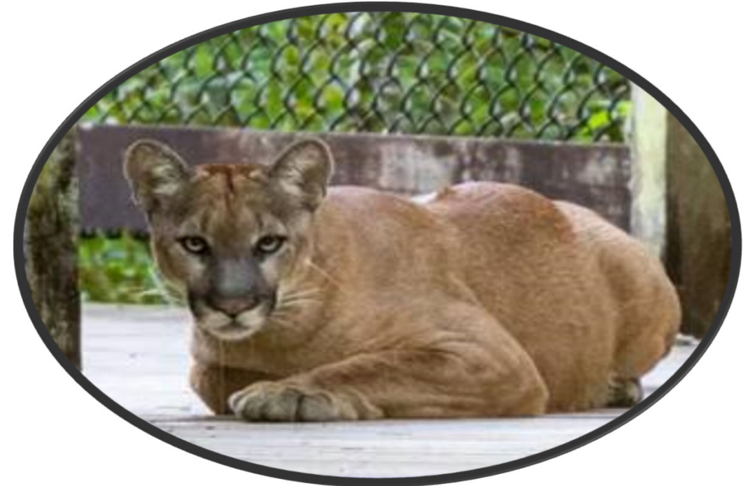
Panther at Bird Rookery