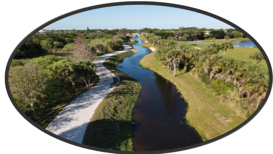
Aerial Photo of Freedom Park Water Quality Improvement Project