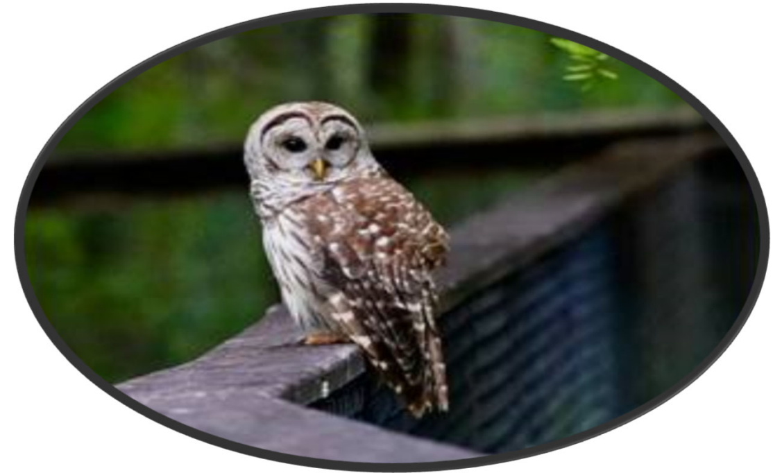
Owl at Bird Rookery