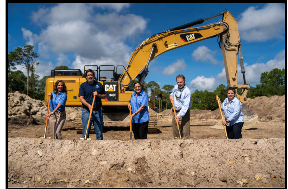
Cypress 1 Groundbreaking