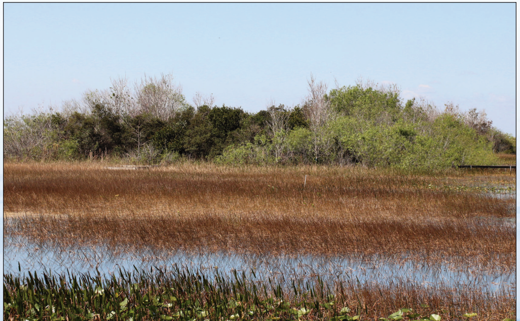
The tree islands in LILA provide a site for intensive research into the function of tree islands within the Everglades landscape.