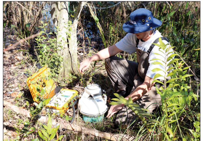
A researcher uses sophisticated instrumentation to measure carbon cycling of the soil on a LILA tree island.

Visitors to the Arthur R. Marshall Loxahatchee National Wildlife Refuge will find LILA located on the marsh trail. Visiting LILA provides an opportunity to spend a morning watching a flock of wading birds. At the same time, scientists are collecting valuable information that will ultimately be used to restore the Everglades.