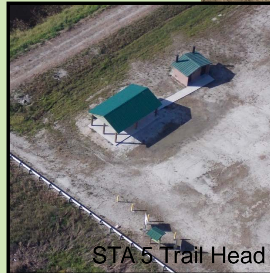
STA 5 Trail Head