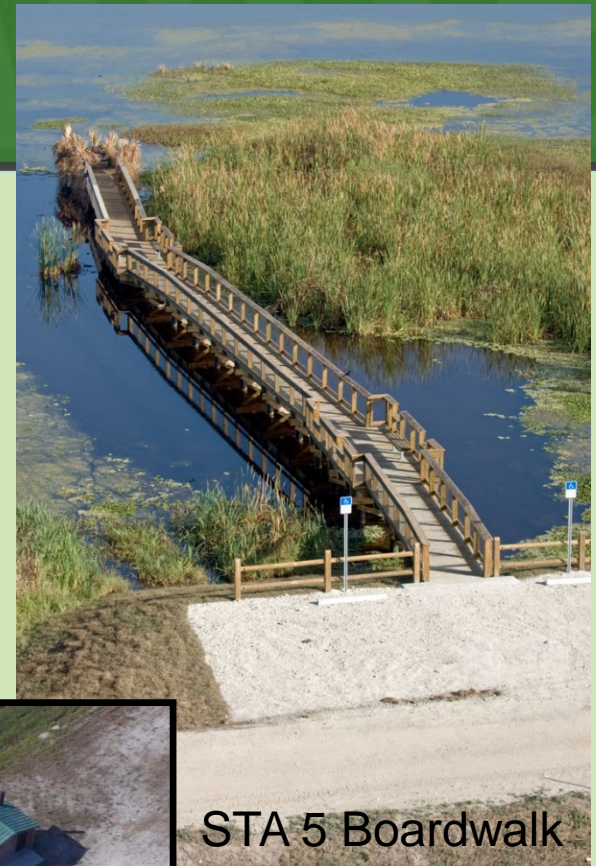
STA 5 Boardwalk