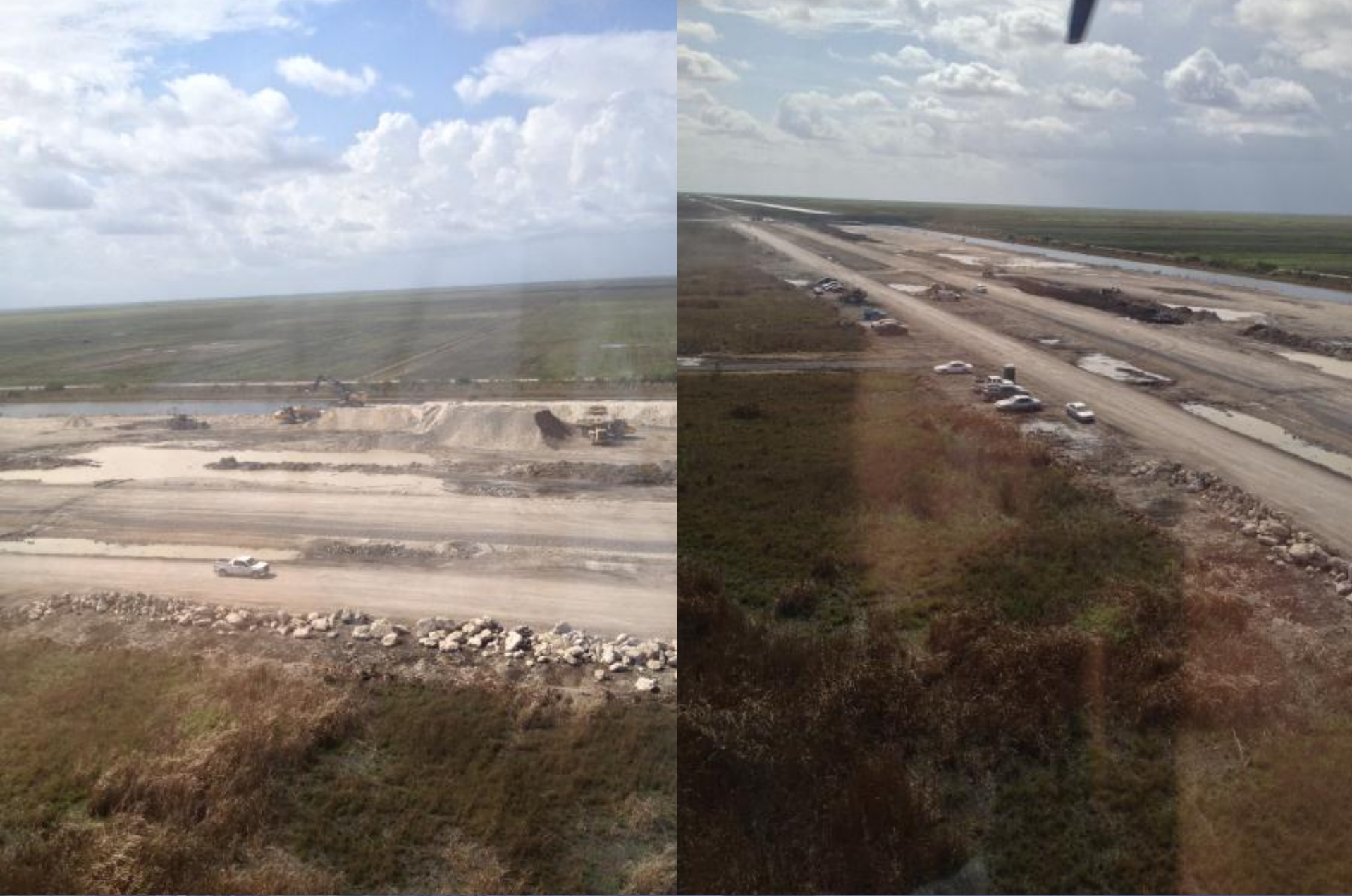
5fwmd.gov Restoration Strategies for clean water for the Everglades