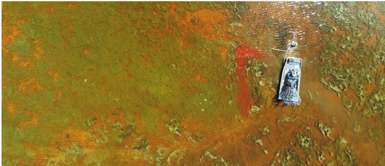
Photo depicts activities of the Ecotope Study. This aerial view shows the effect of short-circuits within a mixed SAV habitat using a tracer.