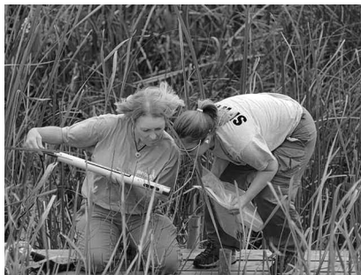
Collecting and analyzing water samples is vital to wetland management.