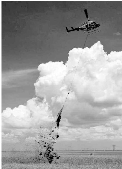
Plants are sometimes airlifted and released into an STA to help establish submerged aquatic vegetation.

Stormwater treatment areas use “green” technology to remove excess phosphorus, a nutrient that can harm the Everglades environment.