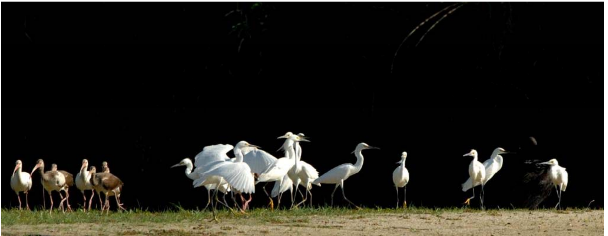
Egrets and immature ibis forage along the shoreline of the Phase I area river channel.