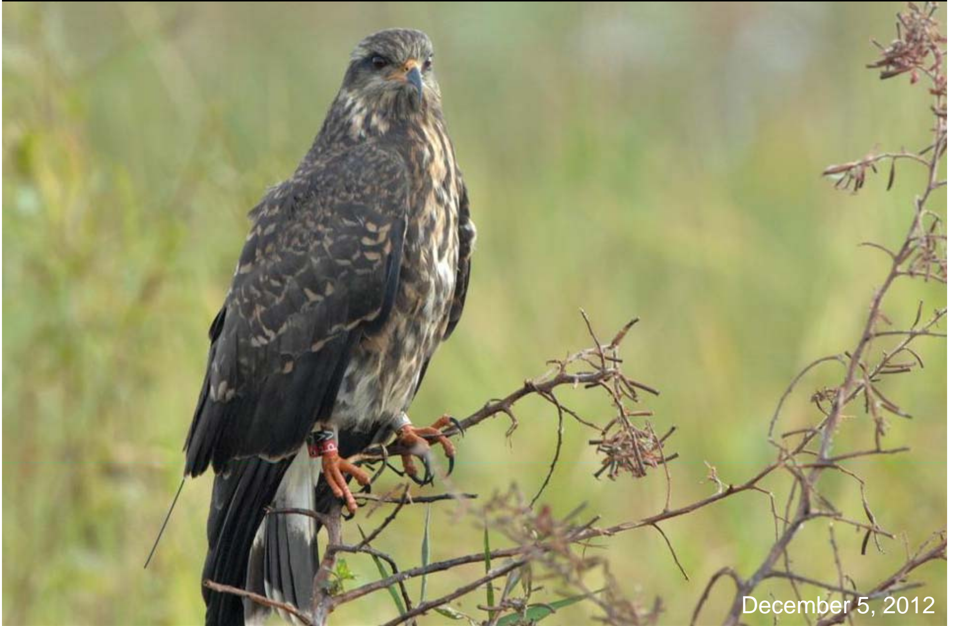
A snail kite perches in Lake Kissimmee.