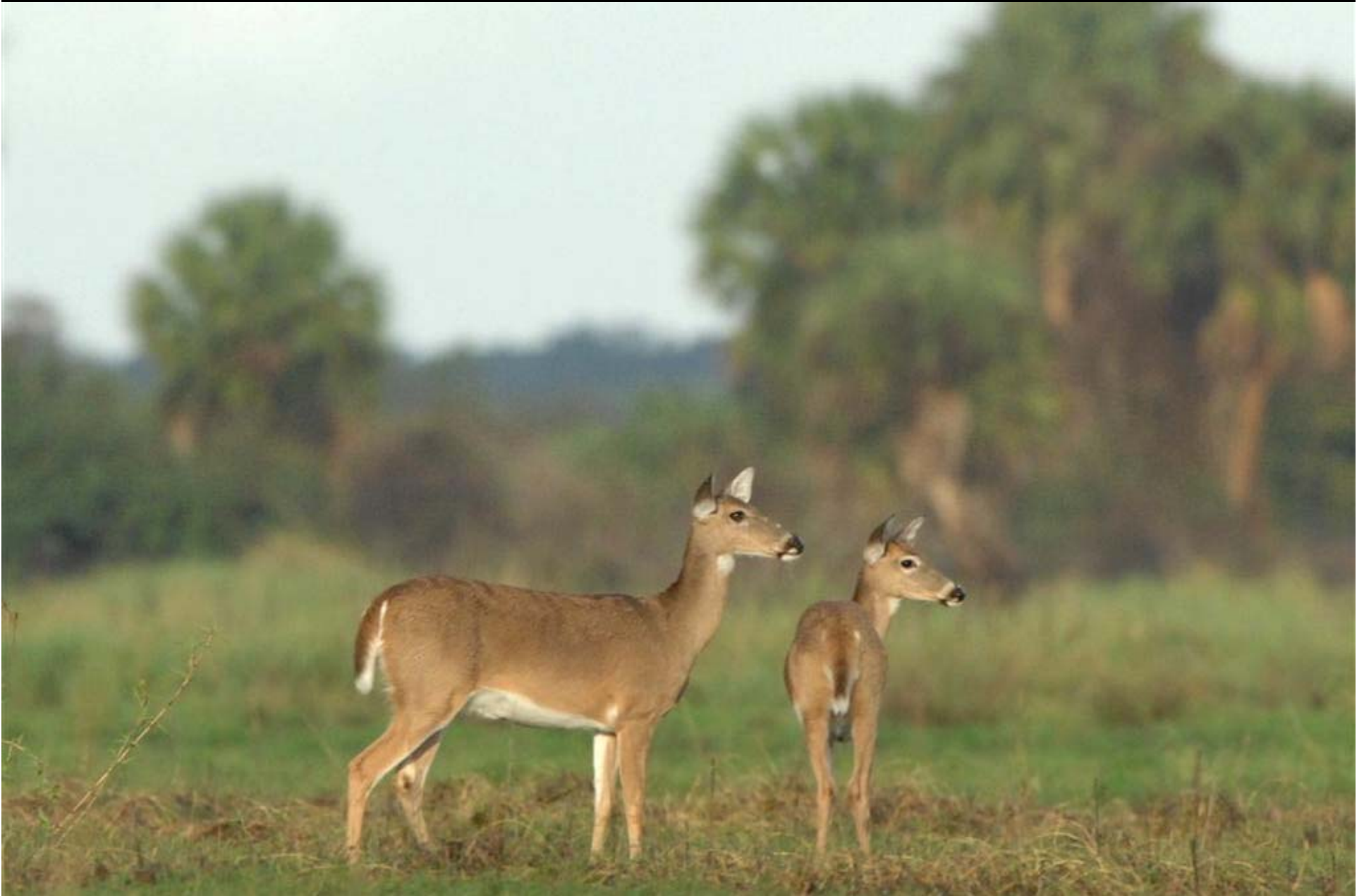
White-tailed deer in the Phase IVA Kissimmee River Restoration area floodplain.