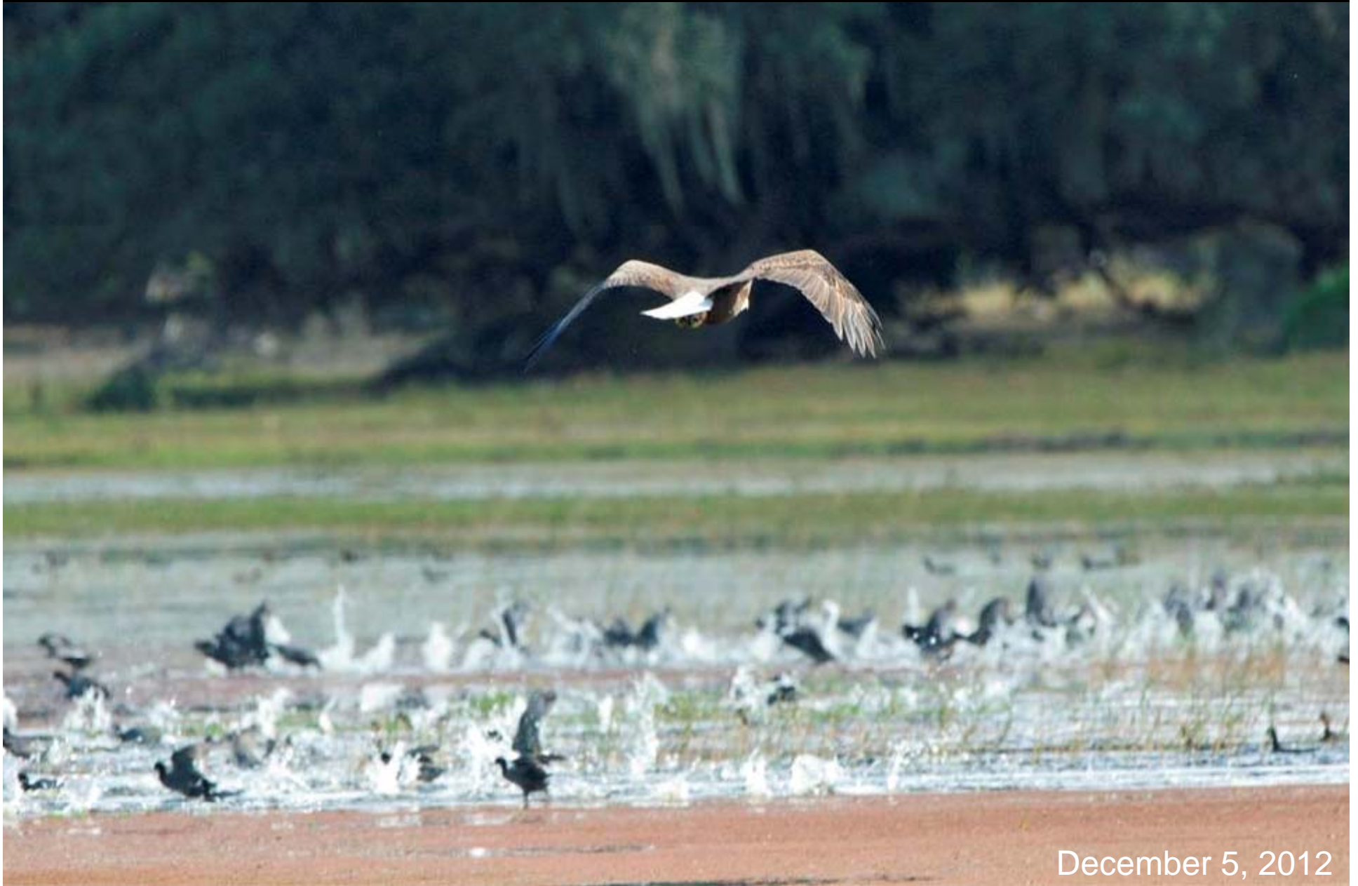
A bald eagle flies low through the littoral zone of Lake Kissimmee causing panic among the American coots and common gallinules.