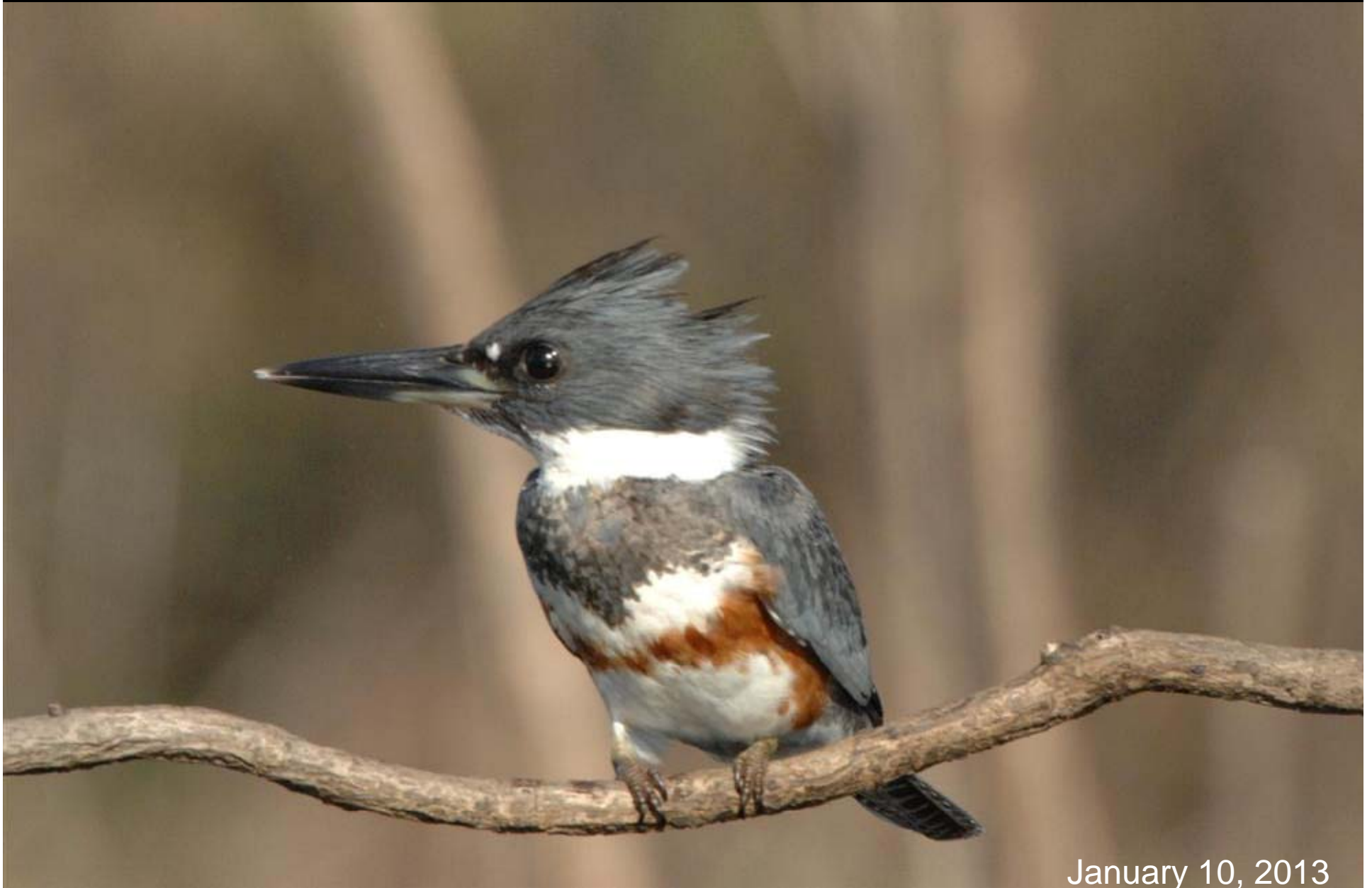
A belted kingfisher is spotted along the restoration area of the Kissimmee River.