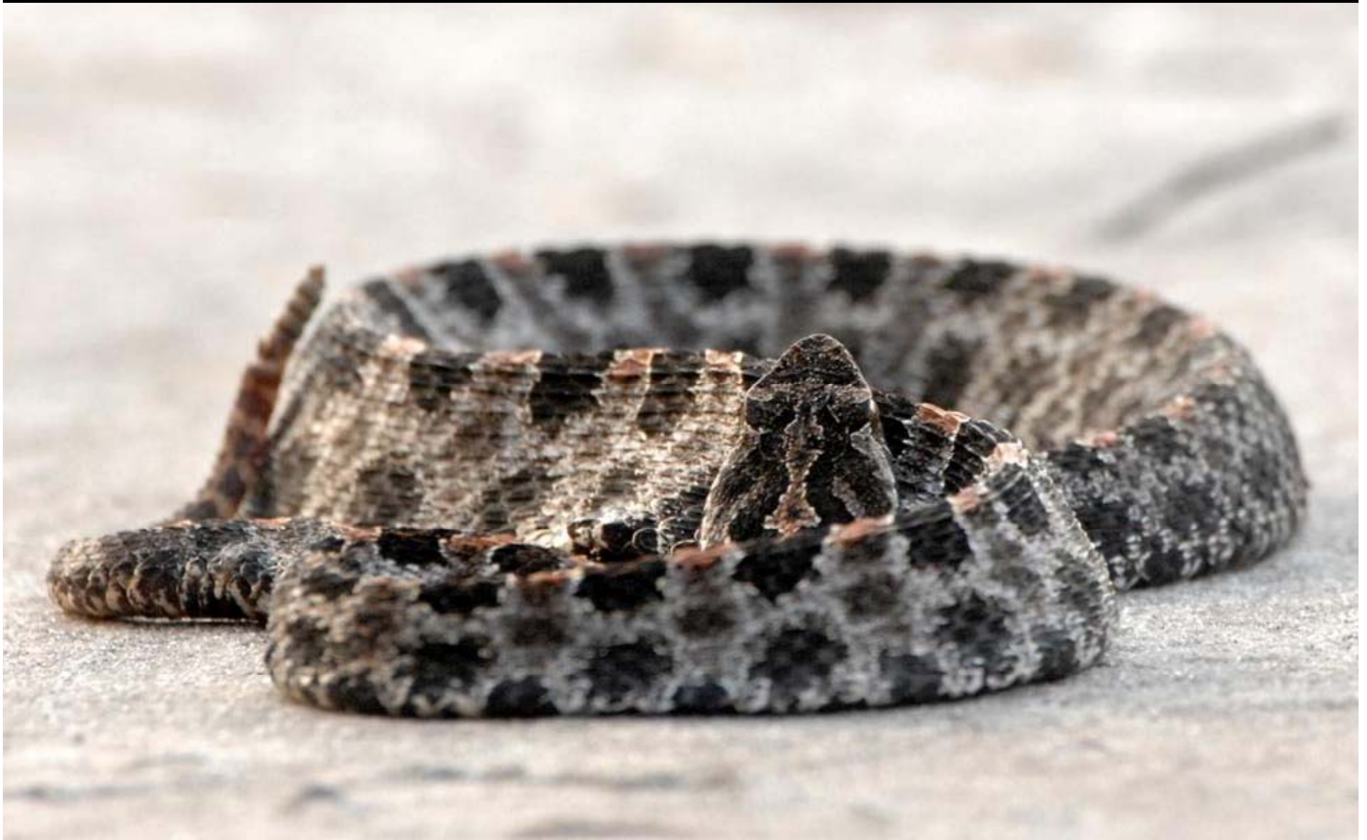
A pigmy rattlesnake is spotted in the Avon Park Air Force Range in the Phase IVA Kissimmee River Restoration area.