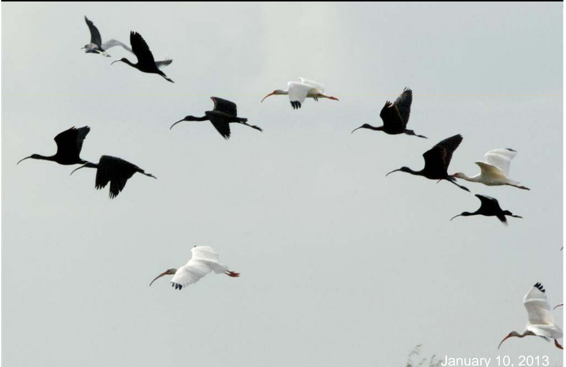
White and glossy ibis contrast in the sky in the Phase I Kissimmee River Restoration area.