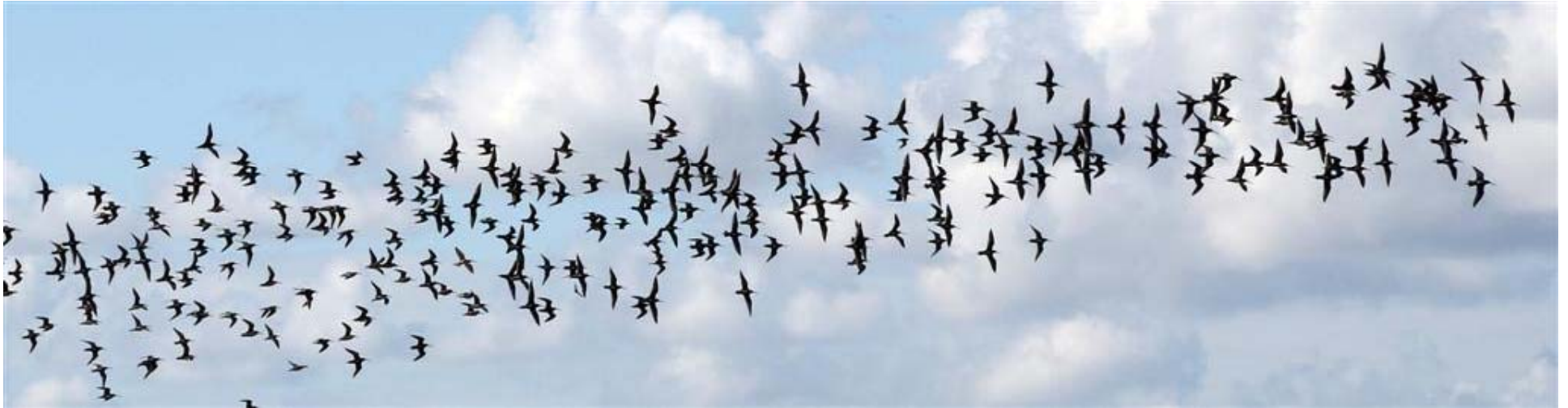
Dowitchers flock in the Phase I Kissimmee River Restoration area floodplain.