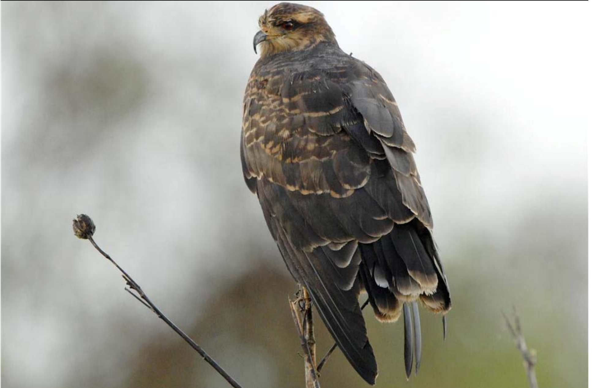
The SFWMD's first sighting of a snail kite on the Kissimmee River in the Phase IVA Restoration area.