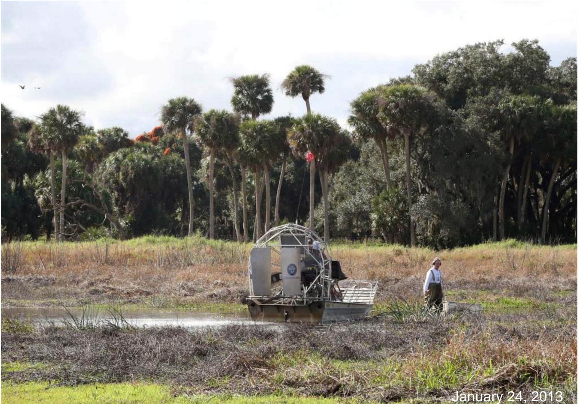
A South Florida Water Management District scientist surveys a throw trap sample in the Phase I Kissimmee River restoration area to evaluate prey availability for the wading birds and waterfowl.