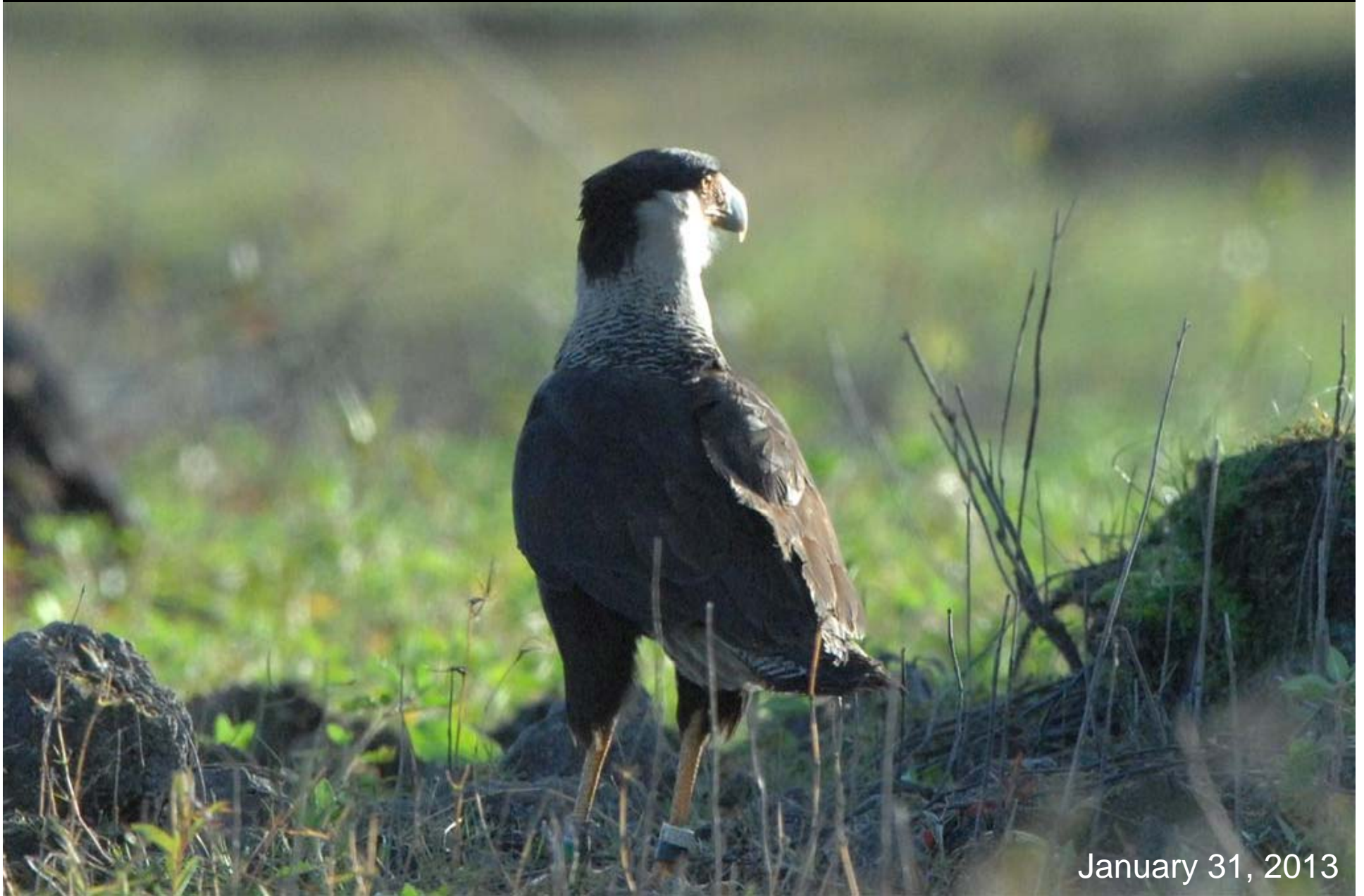
A crested caracara is spotted in the Phase IVB Kissimmee River Restoration area.