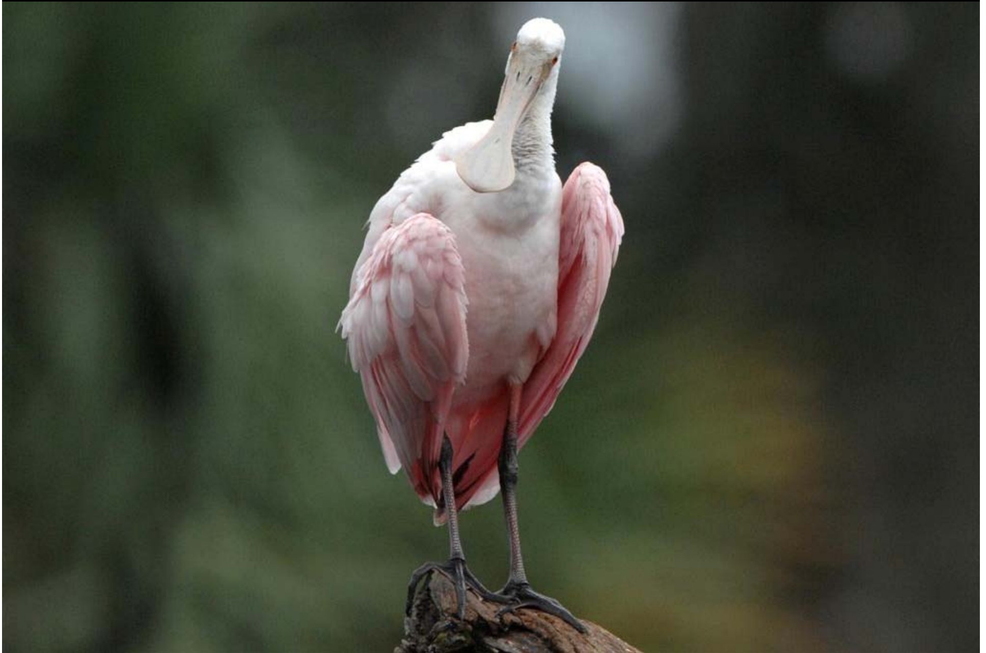
Immature roseate spoonbill