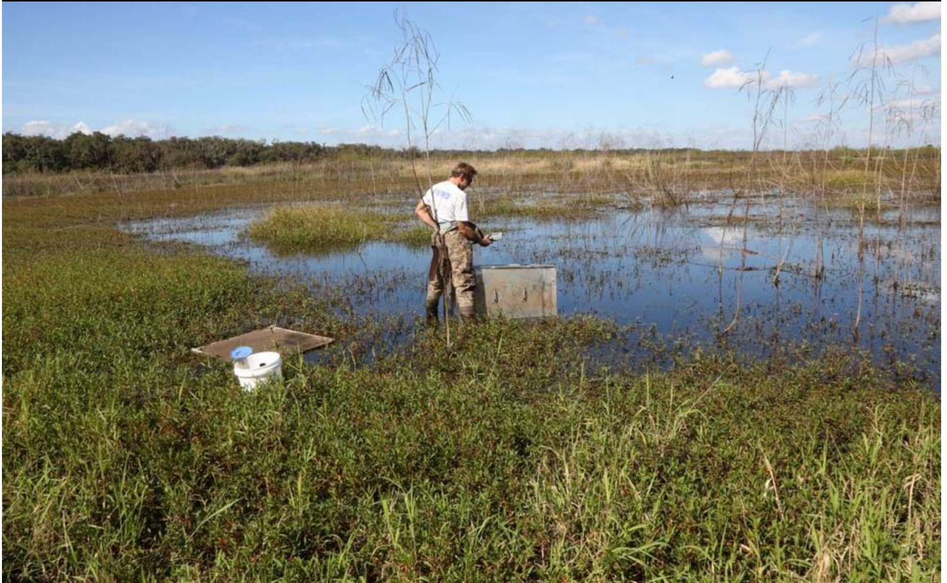
A SFWMD scientist records water quality at a throw trap sample in the Phase I Kissimmee River Restoration area floodplain.