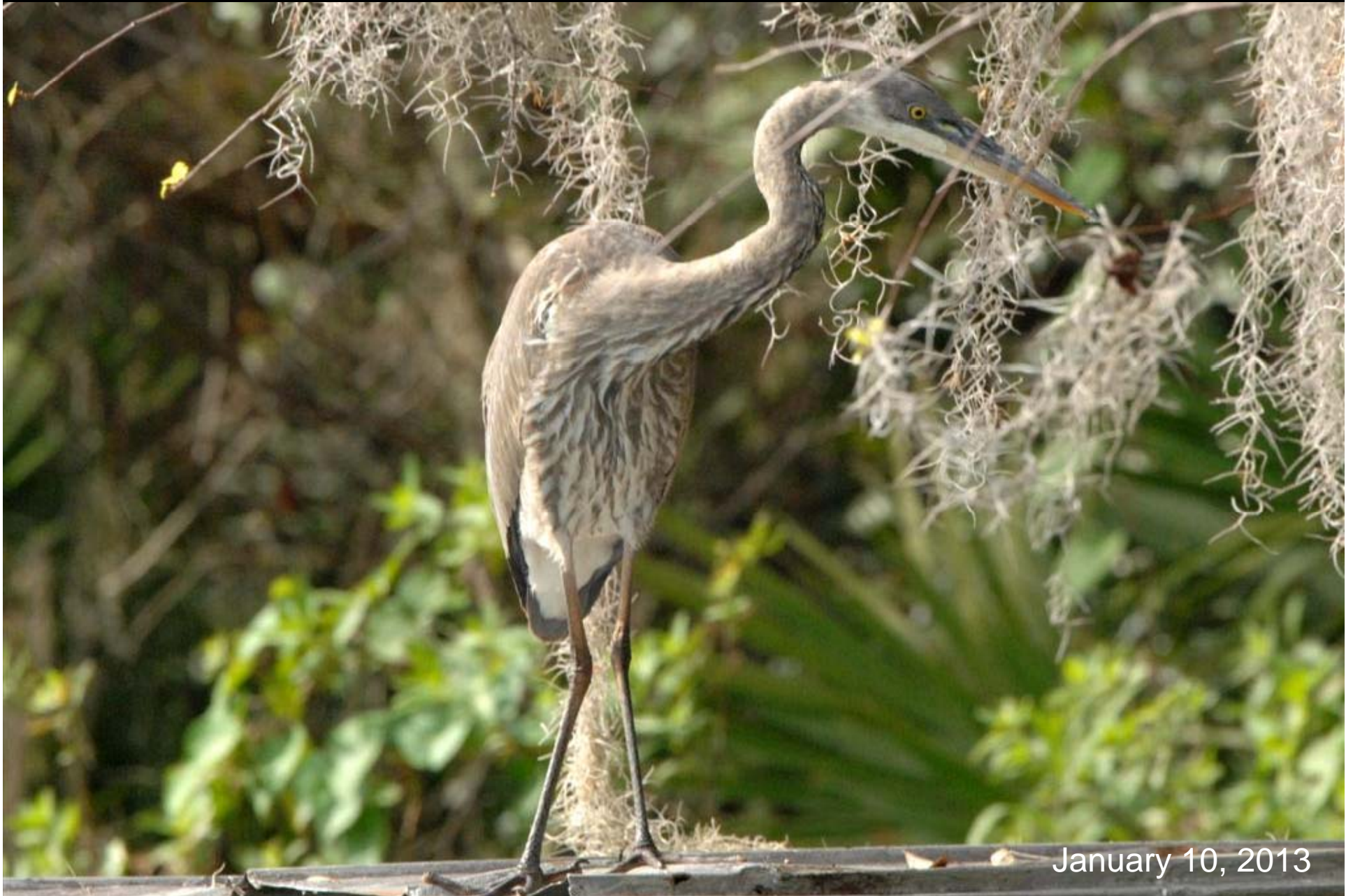
A great blue heron perches in the Istokpoga Canal.