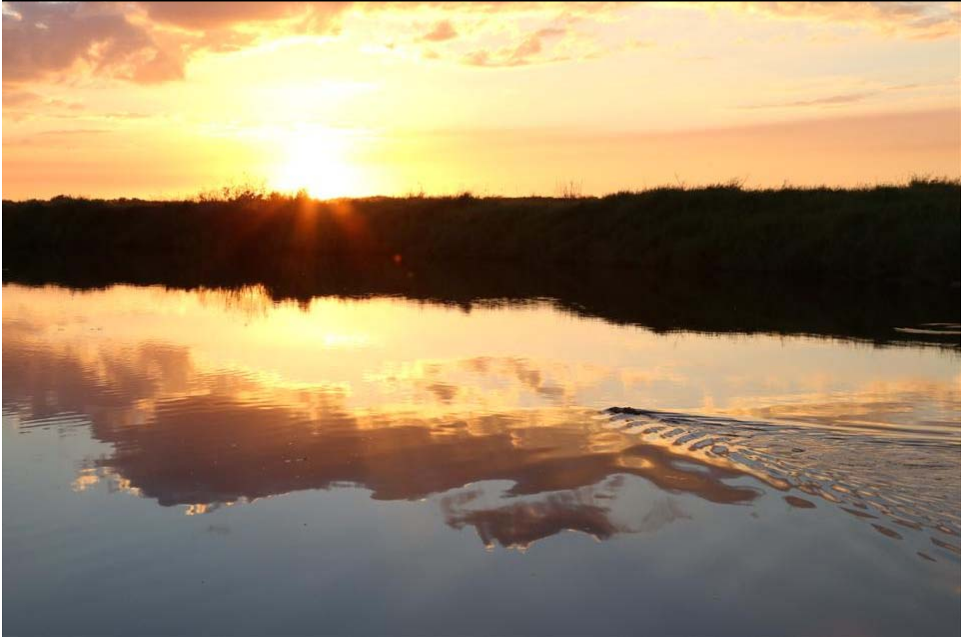
An American alligator hunts at sunset in the Phase I Kissimmee River Restoration area.